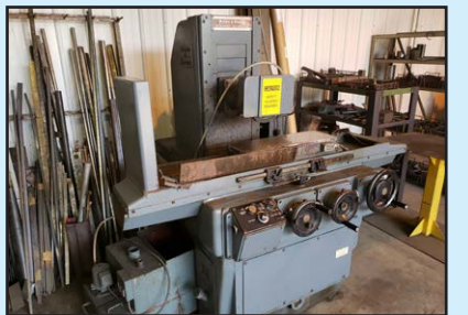
BROWN AND SHARPE 824 MICROMASTER