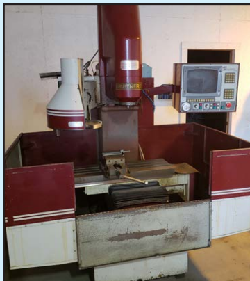
MILLTRONICS PARTNER I VERTICAL CNC MACHINING CENTER