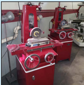
(2) HARIG SUPER 612 SURFACE GRINDERS