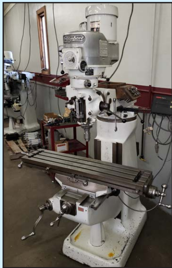
(1 OF 5) BRIDGEPORT MILLING MACHINES