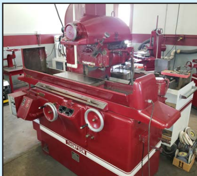
THOMPSON 618 SURFACE GRINDER