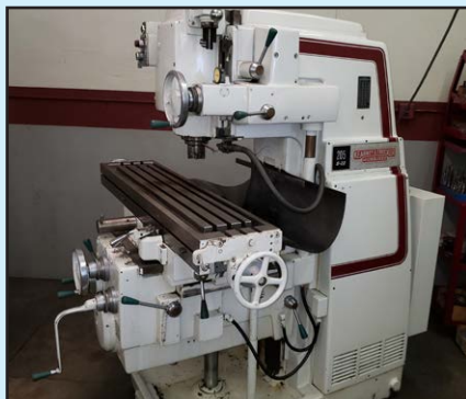
KEARNEY AND TRECKER HORIZONTAL MILL