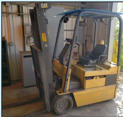
CATERPILLAR ELECTRIC FORK TRUCK