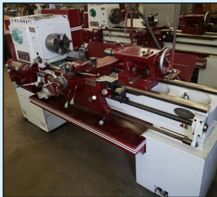
(1 OF 5) LATHES