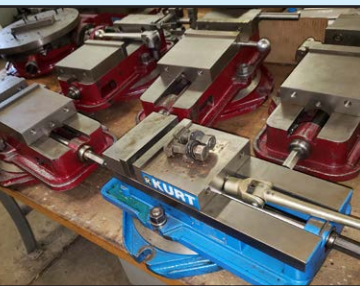
LRG QTY OF KURT VISES