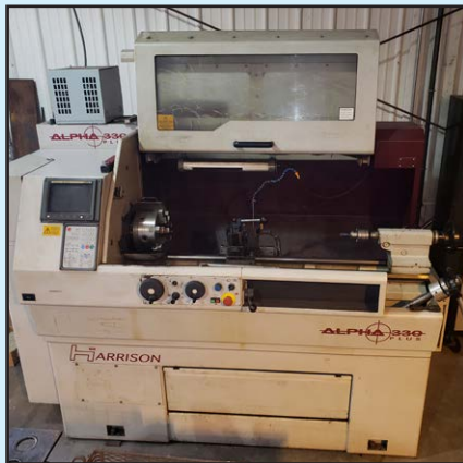
HARRISON ALPHA 330 PLUS CNC LATHE