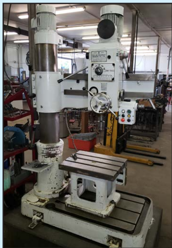
DAH LIH RADIAL DRILL