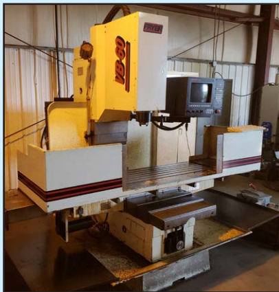
FRYER CNC MILLING MACHINE