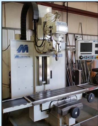
MILLTRONICS PARTNER CNC MILLING MACHINE

433 Council Drive, Fort Wayne, IN 46825 OH Auction License #2011000101