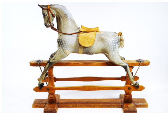
Lot 394 An early 20th Century carved and painted rocking horse Estimate £800 - 1200 (plus BP at 15% excl VAT)