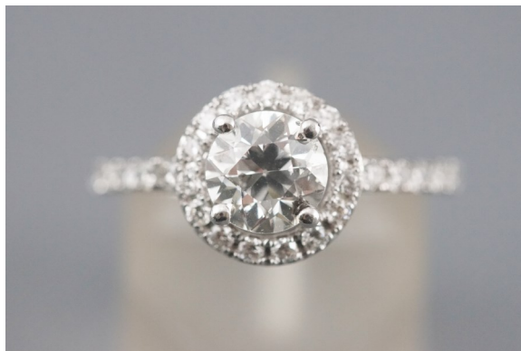
Lot 121 A white metal diamond cluster ring. Estimate £3500 - 4000 (plus BP at 15% excl VAT)