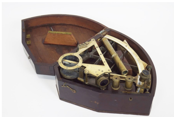
Lot 255 An 18th century boxed sextant Estimate £600 - 800 (plus BP at 15% excl VAT)