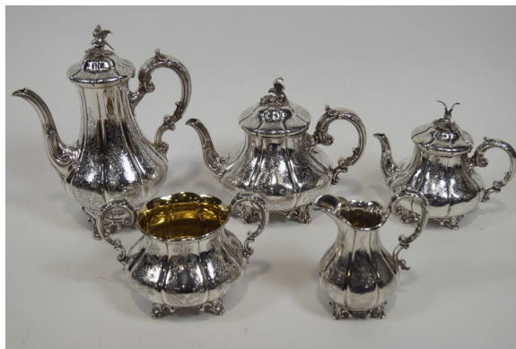
Lot 38 A silver five piece Rococo decorated lobed melon form tea and coffee service Estimate £1500 - 2000 (plus BP at 15% excl VAT)