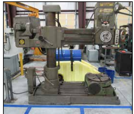
G&L BICKFORD RADIAL ARM DRILL