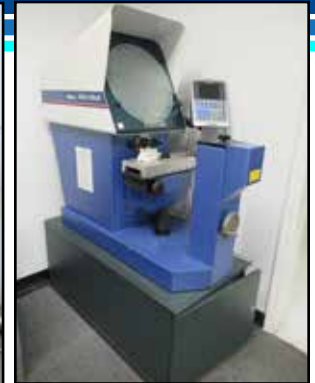
MITUTOYO PROGRAMMABLE OPTICAL COMPARATOR