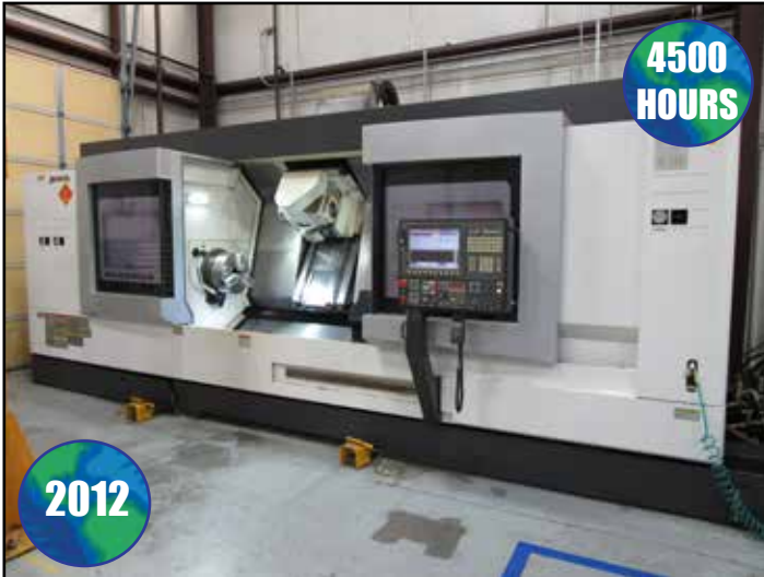
OKUMA MULTUS B400II CNC MULTI-TASKING CENTER