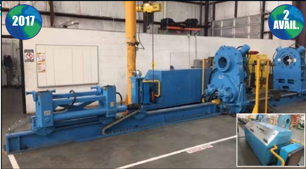
SLD TORQUEMASTER HYDRAULIC MAKEUP & BREAKOUT MACHINE