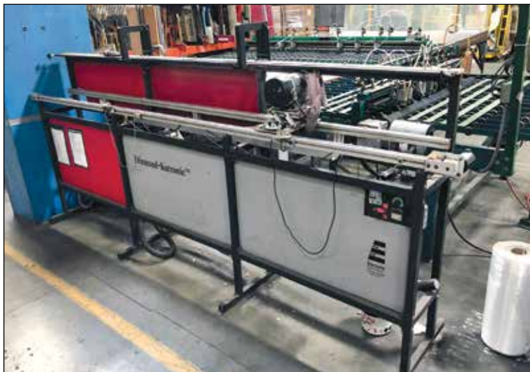
Encore Diamond-Kutronic Squeegee Sharpener