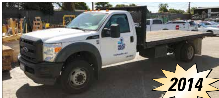
Ford F-450 16' Flat Bed Truck