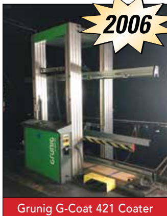
Grunig G-Coat 421 Coater