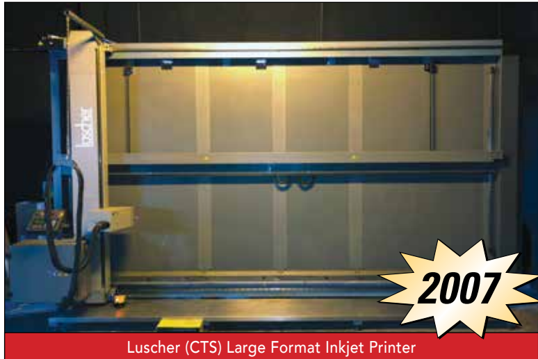
Lusher (CTS) Large Format Inkjet Printer