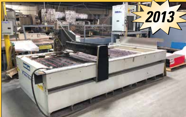
Multicam V-Series 5' x 10' Waterjet