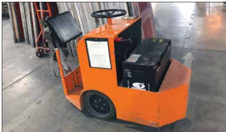
Taylor Dunn E4-51 Tow Tractor