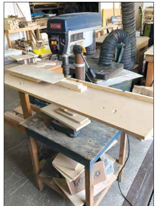
Murphy Rogers Dust Collector