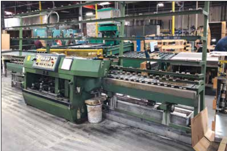
Costruzioni Meccaniche Besana Polisher