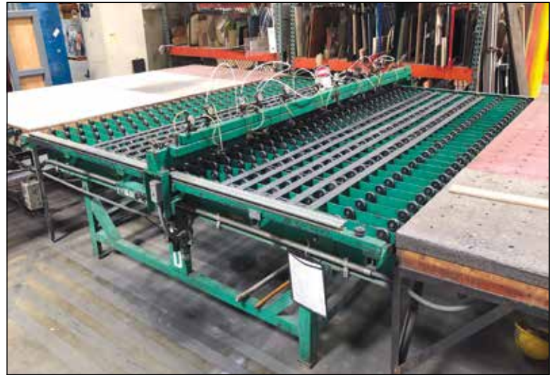
Billco Strip Cutter, 11' Wide