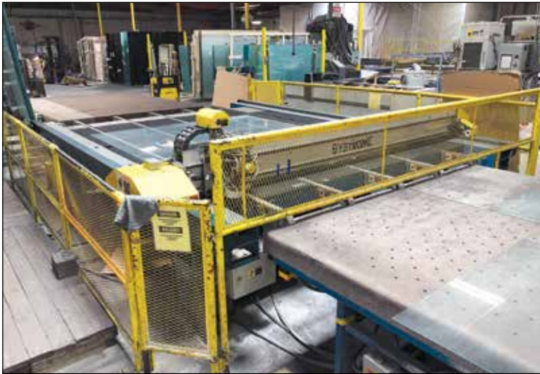
Bystronic CNC Glass Cutter, Mdl. XYZ-F98