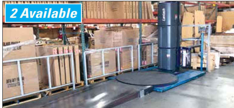
Lantech Stretch Wrapper