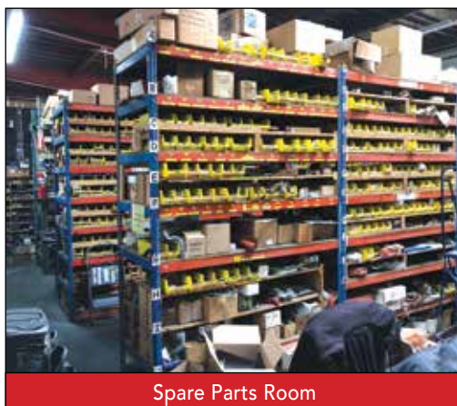
Spare Parts Room