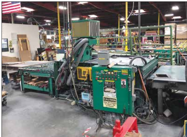
Billco Glass Washer