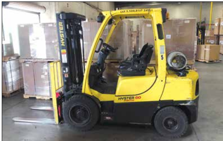
Hyster 5,700 Lb. Cap., Model H60FT