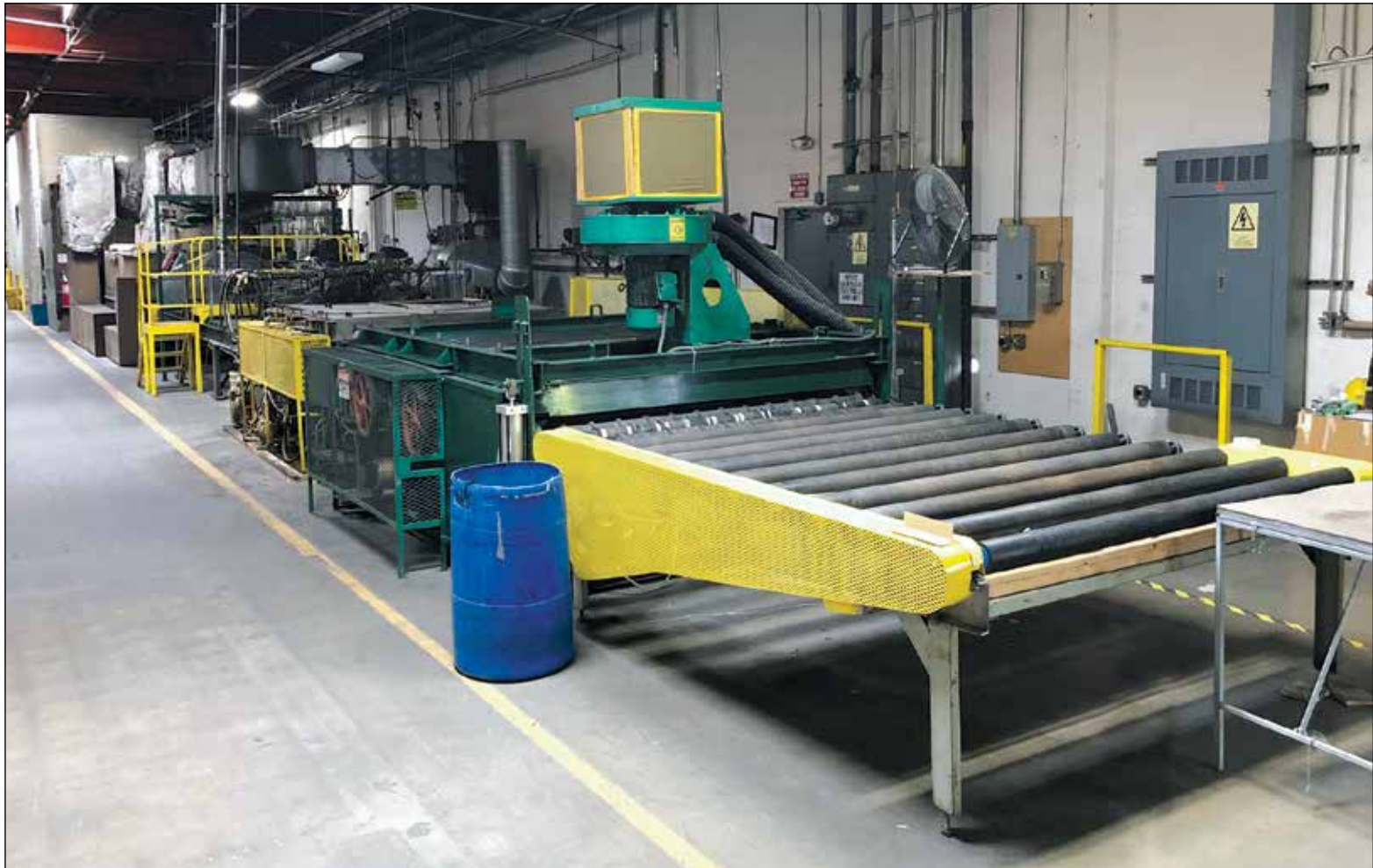
72" Mirror Fabrication Line

A lite of glass is placed on the conveyor, cleaned, then sprayed with sensitizer, followed by a silver solution. A copper layer is then applied to protect the silver. A final protective coating of paint is applied to mirror and cured in the oven.