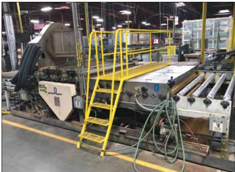
Somaca & Maca Glass Stripper