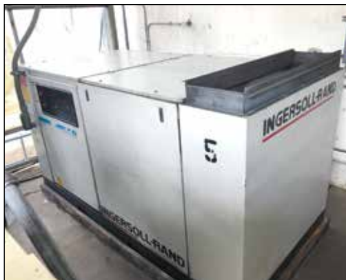
Ingersoll Rand 100 HP Air Compressor