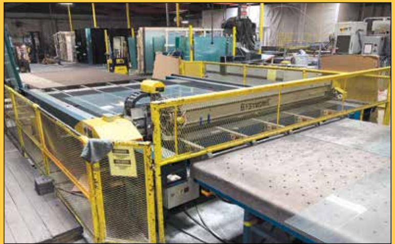
Bystronic CNC Glass Cutter, Mdl. XYZ-F98