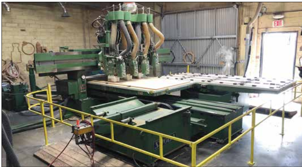
Shoda 4-Head CNC Router