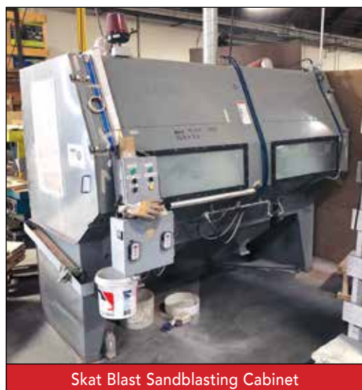
Skat Blast Sandblasting Cabinet