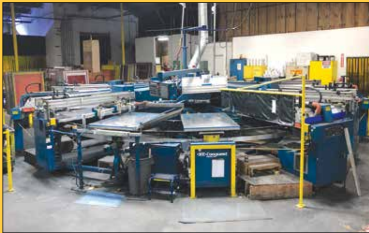
M&R Conquest 3850 Multicolor Graphics Screen Printing Press