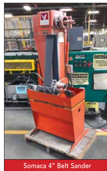
Somaca 4" Belt Sander