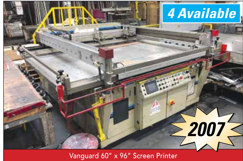
Vanguard 60" x 96" Screen Printer