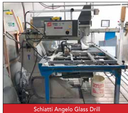
Schiatti Angelo Glass Drill