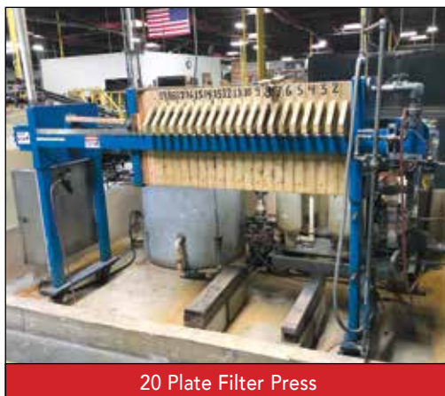
20 Plate Filter Press