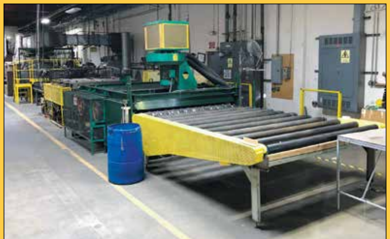
72" Mirror Fabrication Line