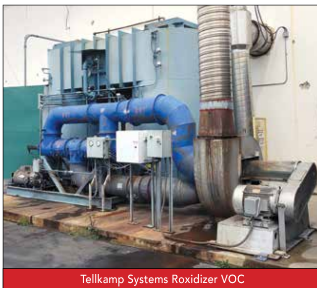
Tellkamp Systems Roxidizer VOC