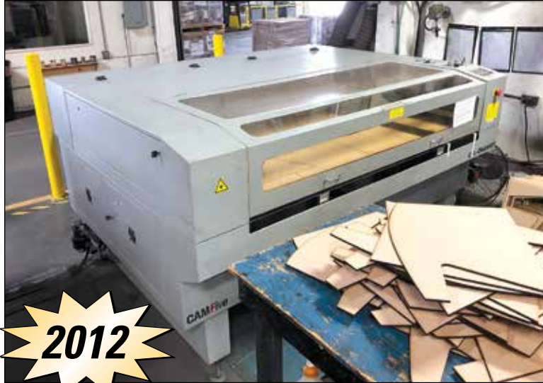
CAMFive CFL-CMA1610T CNC Laser