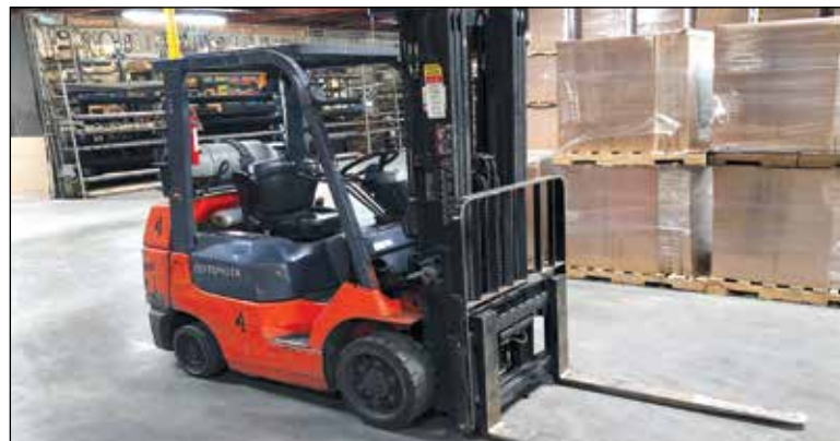
Toyota 5,800 Lb. Cap.