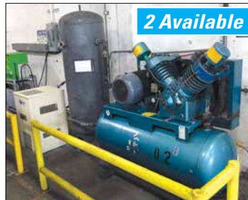
Kellogg 25 HP Air Compressor