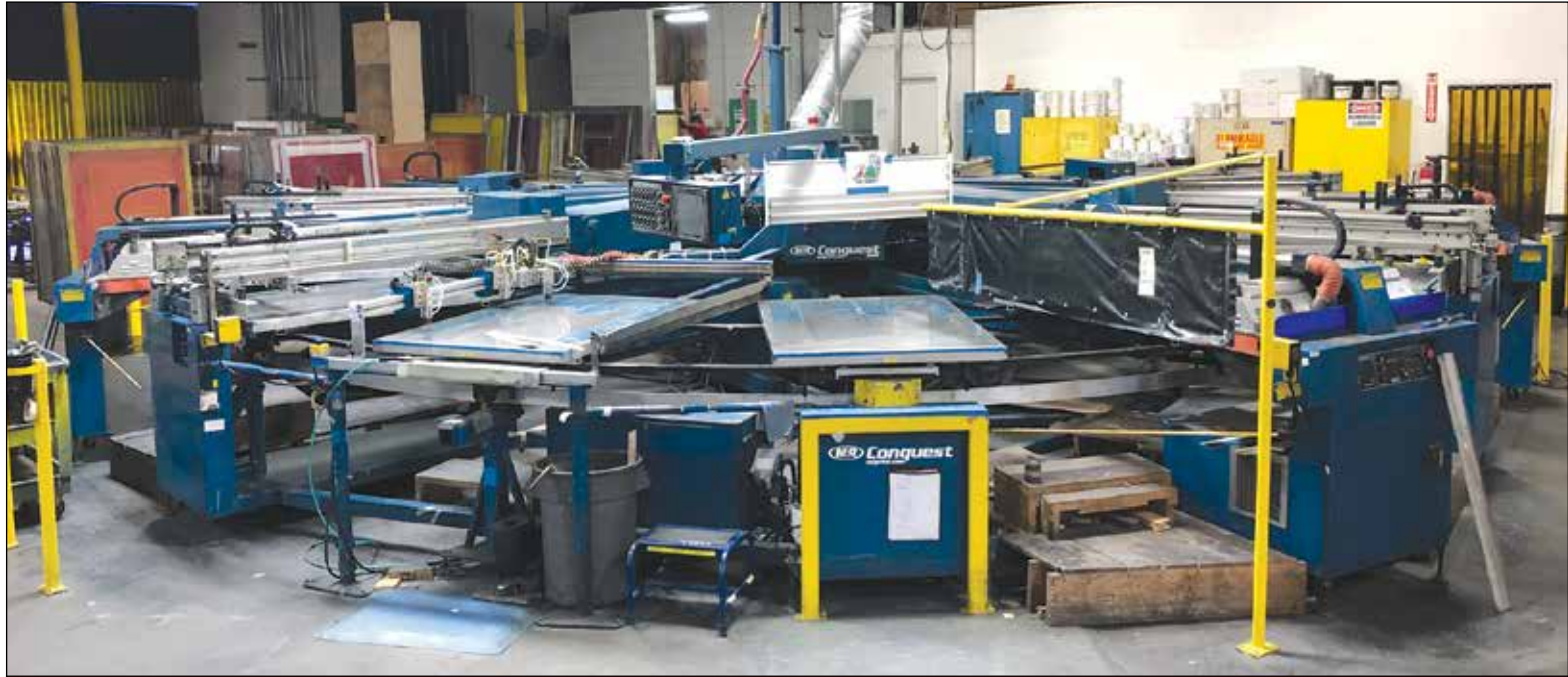
M&R Conquest 3850 Multicolor Graphics Screen Printing Press