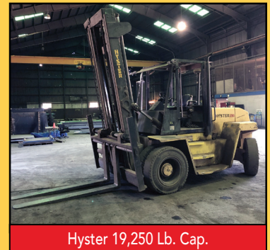
Hyster 19,250 Lb. Cap.