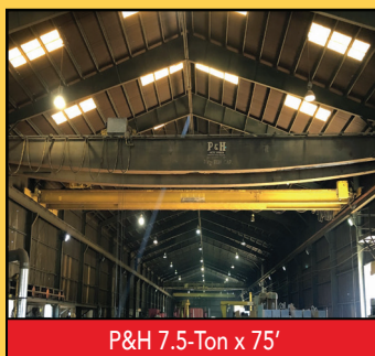
P&H 7.5-Ton x 75'