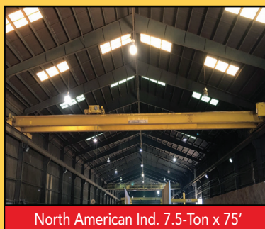
North American Ind. 7.5-Ton x 75'