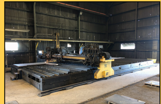
ESAB 20' x 40' Avenger 1