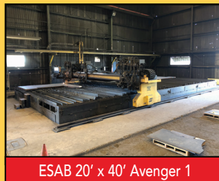
ESAB 20' x 40' Avenger 1