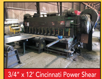
3/4" x 12' Cincinnati Power Shear