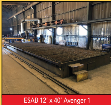
ESAB 12' x 40' Avenger 1