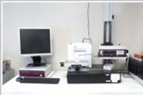
View of Misc. Inspection Equipment