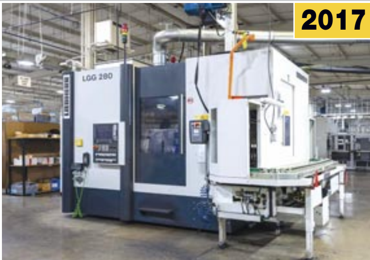
LIEBHERR LGG 280 CNC Gear Grinder