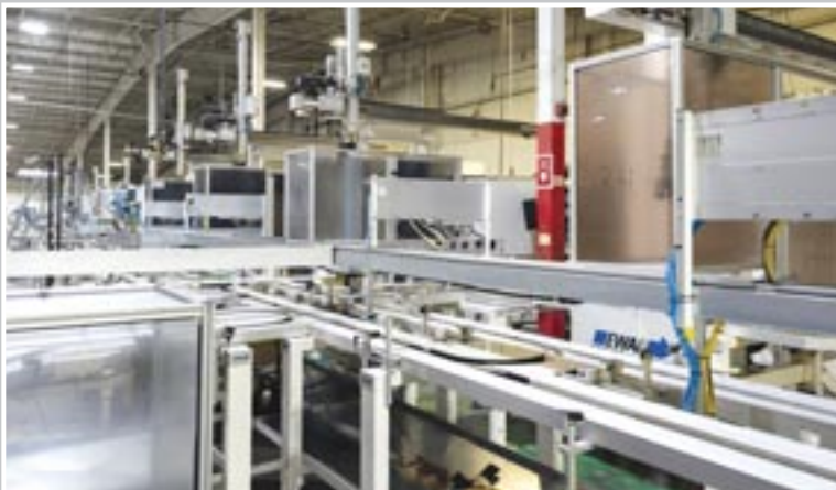
GEIBEL & HOLTZ SCHLEIFTECHNIK Robot Loaders