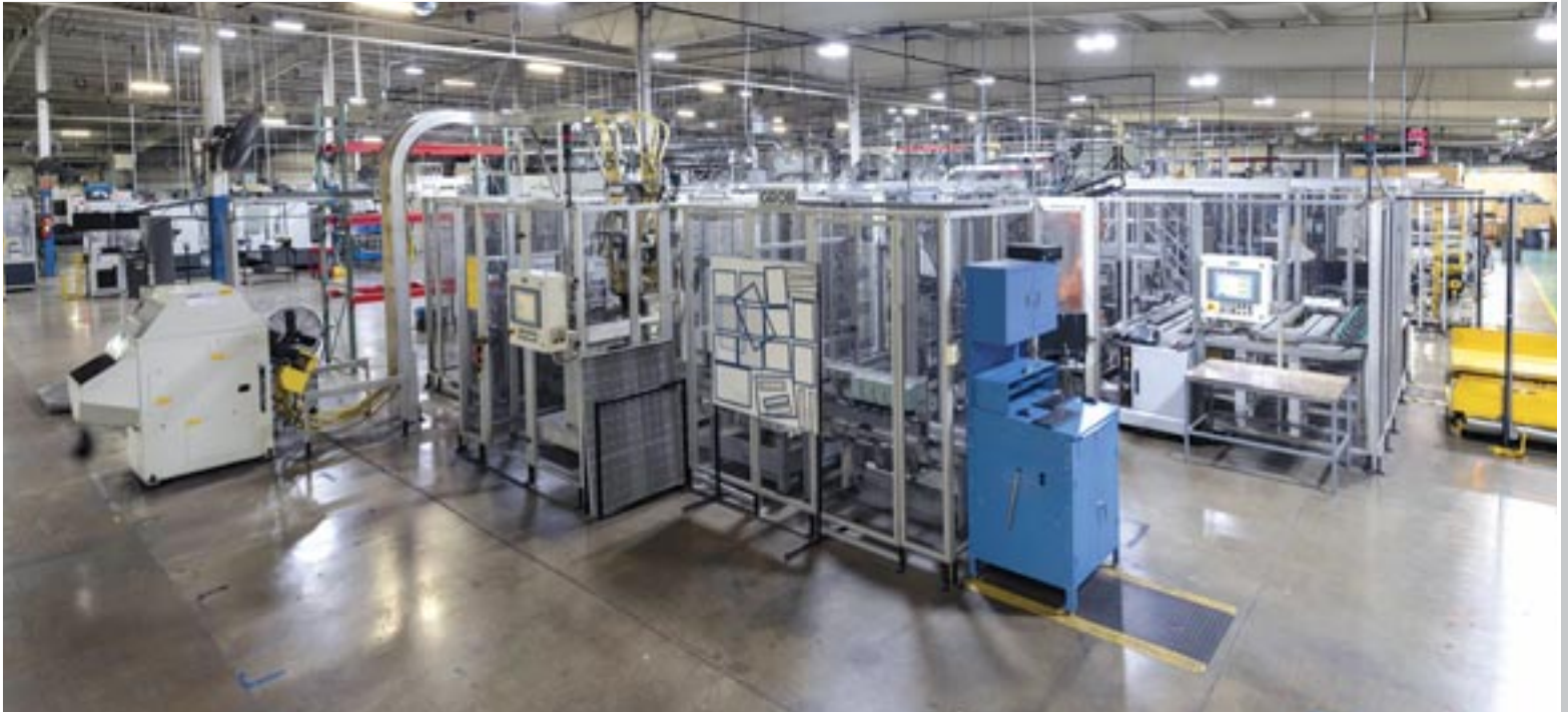
GROB Assembly Cell