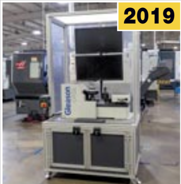
GLEASON GRSL Gear Rolling System