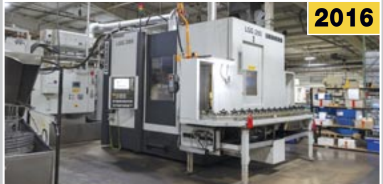
LIEBHERR LGG 280 CNC Gear Grinder

TERMS & CONDITIONS | PAYMENT: Full payment within 24 hours. Payment is Cash, Cashier's check, Certified Check, or Wire Transfer. No other forms of payments will be accepted. Full Payment Must be Made before removal of Purchase. Everything is Sold "As-Is, Where-Is". All Sales Final. Cost and Responsibility for Removal of Purchase Remains with the Purchaser. Every Effort will be Made to Facilitate Removal. While Quantities and Descriptions are Believed to be Accurate, the Auctioneer, Owners or Counsel Make no Warranties or Guarantees Either Expressed or Implied as to Authenticity, Genuineness of, or Defects in Any Lot and will not be Held Responsible for any Advertising Discrepancies or Inaccuracies. No Warranties Whatsoever are Made as to Condition Merchantability or Fitness for Use of Any Item. May we Suggest you Take Full Advantage of the Preview and Inspection Period. Sale Subject to Additions, Deletions and Prior Sales. Please Check Availability of Equipment.