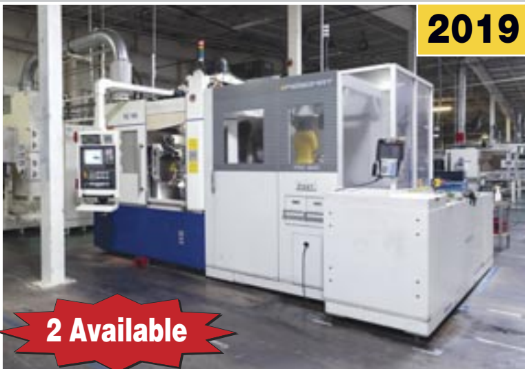
REISHAUER RZ 160 CNC Gear Grinder