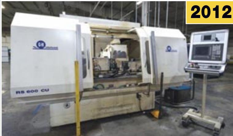
GEIBEL & HOLTZ SCHLEIFTECHNIK RS 600 CU CNC Cylindrical Grinder