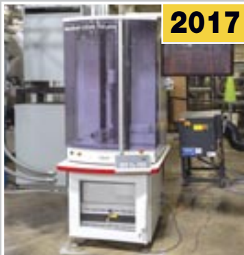
MAHR MARSHAFT Scope OMM