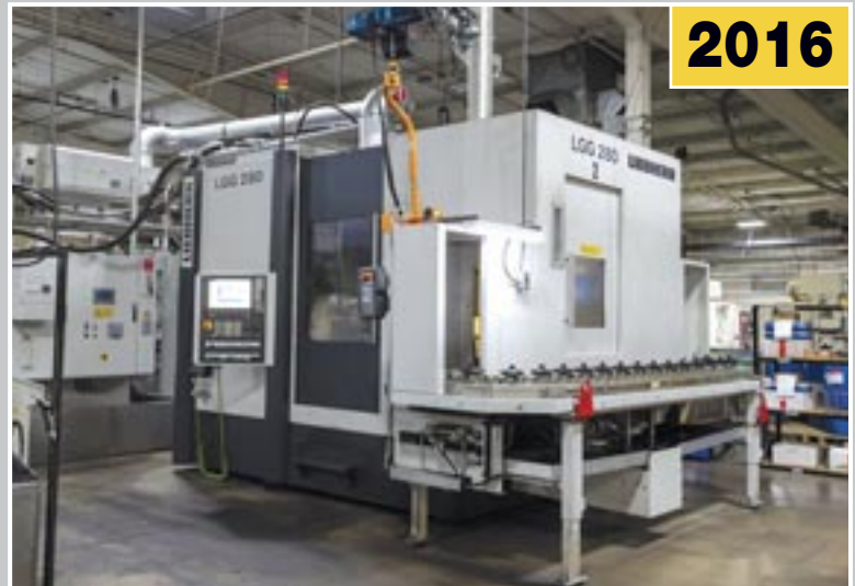
LIEBHERR LGG 280 CNC Gear Grinder