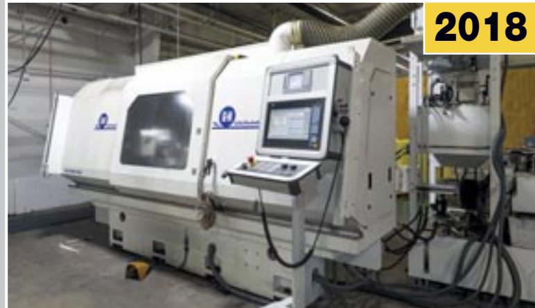
GEIBEL & HOLTZ SCHLEIFTECHNIK RS 600 CU CNC Cylindrical Grinder