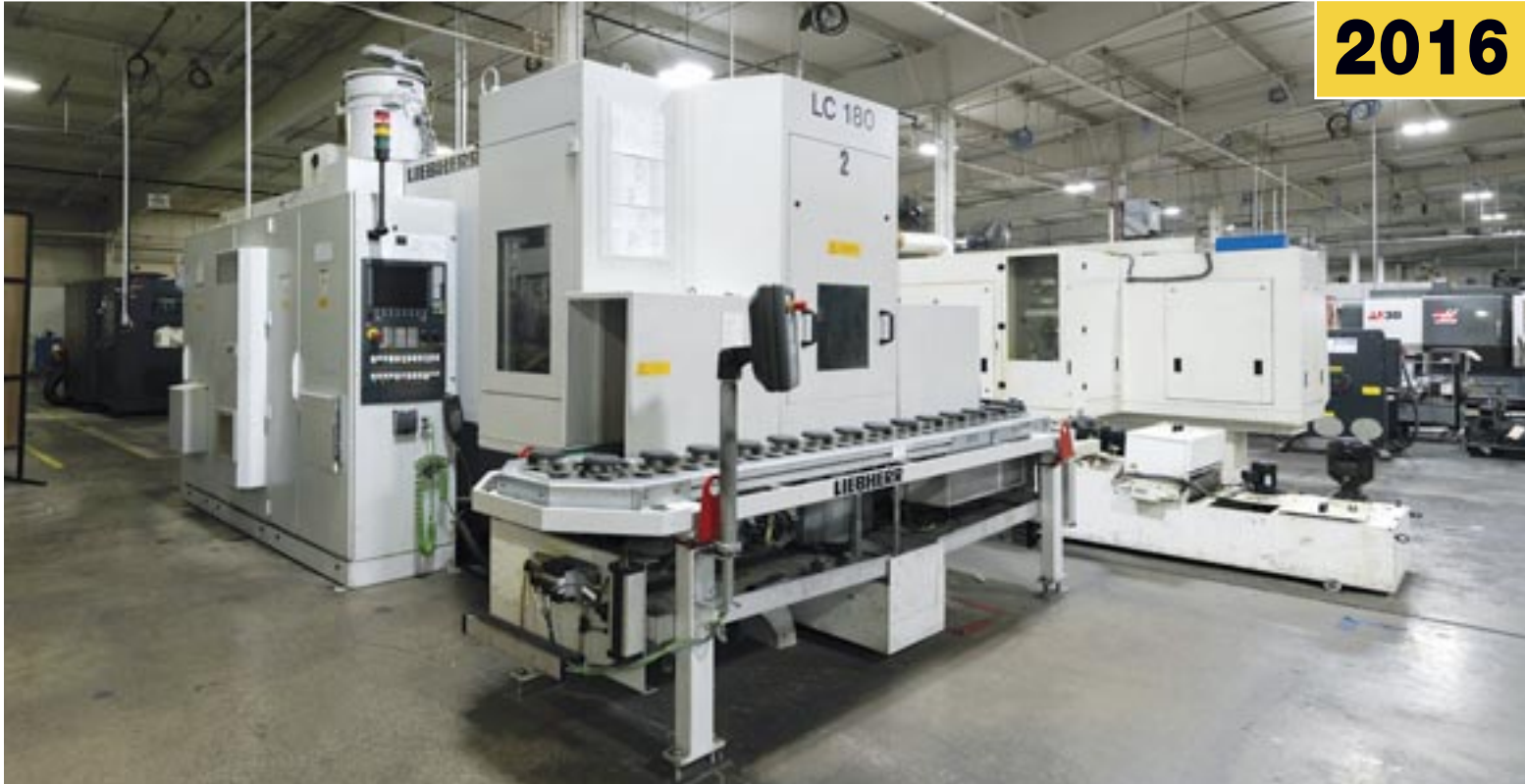
LIEBHERR LC 180 CNC Gear Hobber