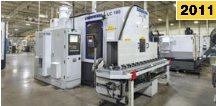
LIEBHERR LC 180 8-Axis CNC Gear Hobber

21700 Northwestern Hwy. Suite 1180 Southfield, MI 48075