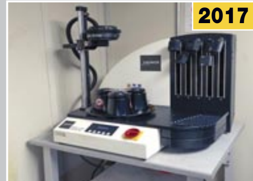
HAIMER Heat Shrink Tool Setter