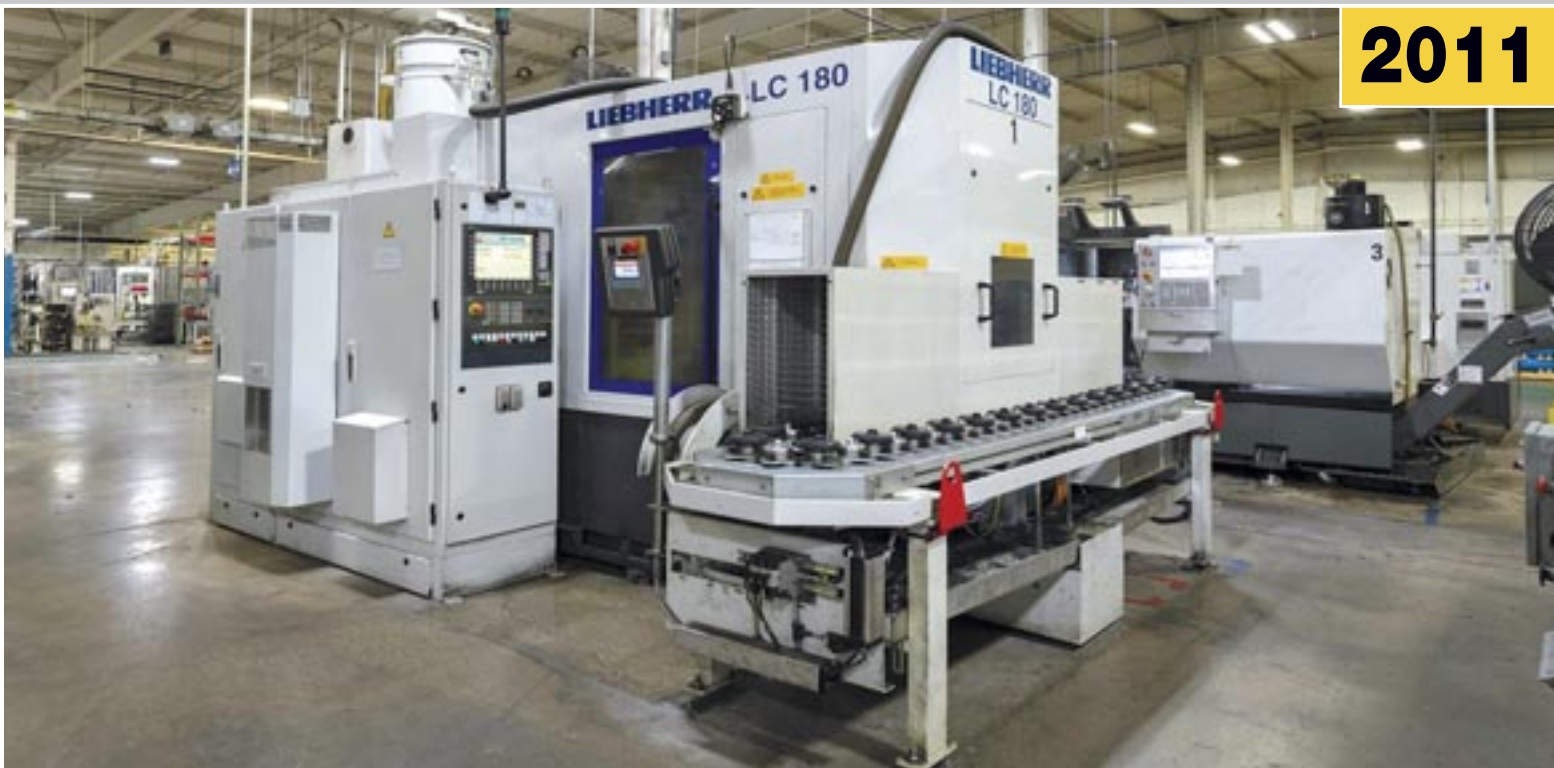
LIEBHERR LC 180 8-Axis CNC Gear Hobber