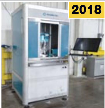
PREMETAC PRECISION SMM