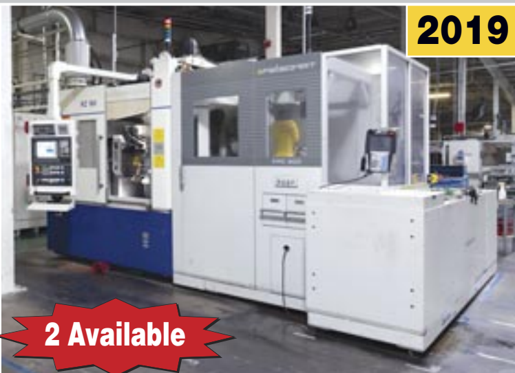
REISHAUER RZ 160 CNC Gear Grinder

FEATURING LATE MODEL MACHINERY TO INCLUDE: (9) Reishauer, Liebherr & Burri CNC Gear Grinders • (3) Liebherr & Gleason CNC Gear Hobbers • (7) Supfina & Geibel & Holtz CNC Polishers/Grinders • Gear Inspection Equipment • DMG & Haas CNC Machining Centers • Muratec, DMG, Haas & Emag CNC Turning Centers • Grob Line