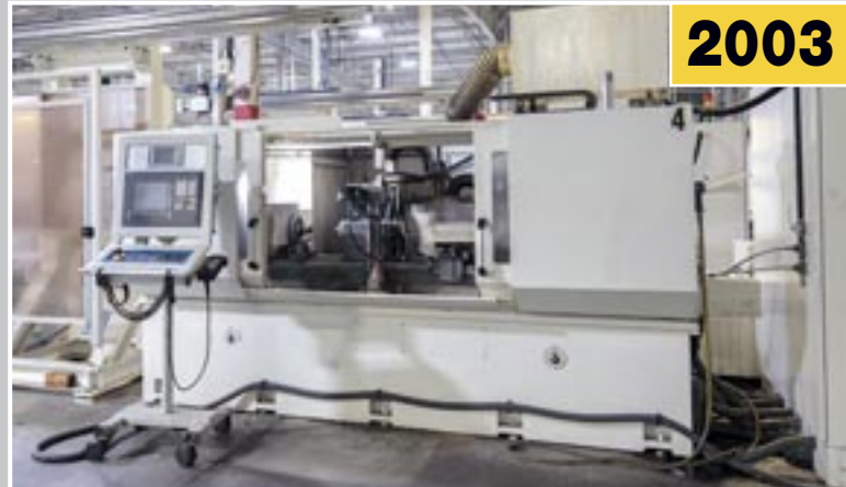
GEIBEL & HOLTZ SCHLEIFTECHNIK RS 600 CU CNC Cylindrical Grinder