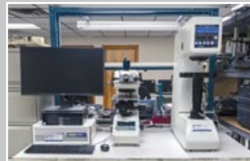
View of Misc. Inspection Equipment

NOTE: This is a partial listing. Please check websites for final list of assets to be sold.