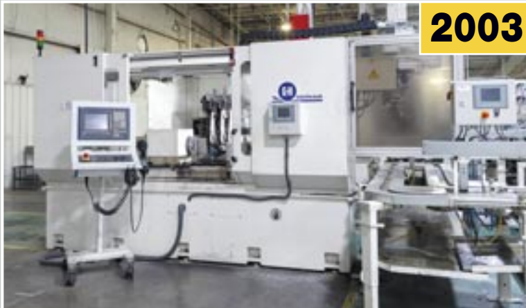
GEIBEL & HOLTZ SCHLEIFTECHNIK RS 600 CU CNC Cylindrical Grinder