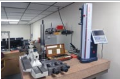
View of Misc. Inspection Equipment