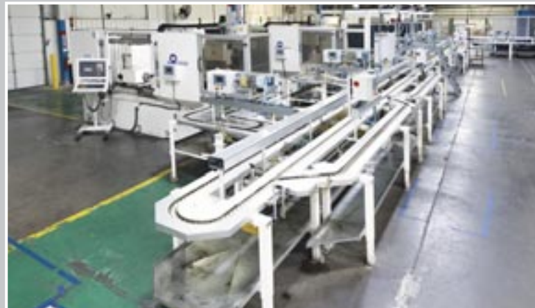
GEIBEL & HOLTZ SCHLEIFTECHNIK Bank Shot of Cylindrical Grinders