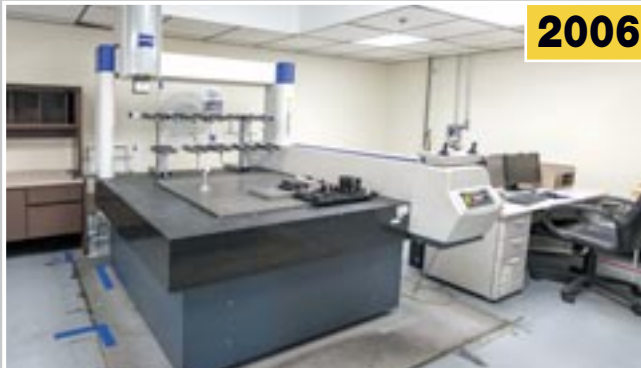
ZEISS CONTOURA G2 10-12-XT CMM