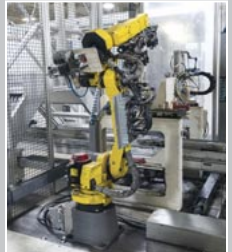
Views of FANUC Robots in Grob Assembly Cell