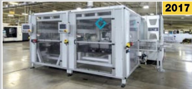
PREMETAC Two Station Final Measurement System