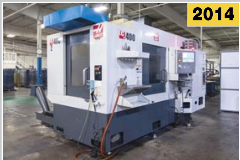
HAAS EC 400 CNC Horizontal Machining Center