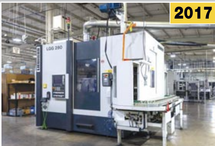
LIEBHERR LGG 280 CNC Gear Grinder

PREVIEW LOCATION: 4000 Fostoria Avenue, Findlay, OH 45840