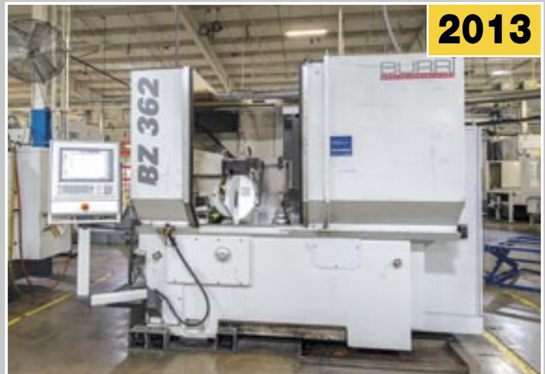
BURRI BZ362 CNC Gear Grinder

NOTE: This is a partial listing. Please check websites for final list of assets to be sold.