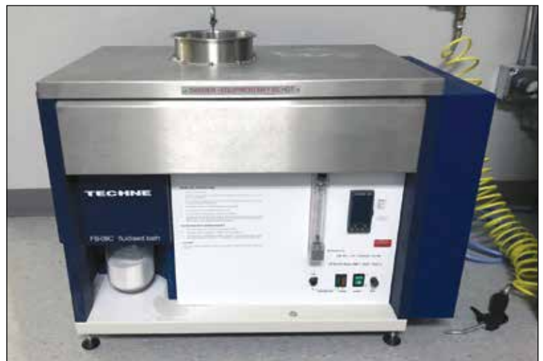
Techne FB-08C Fluidised Bath