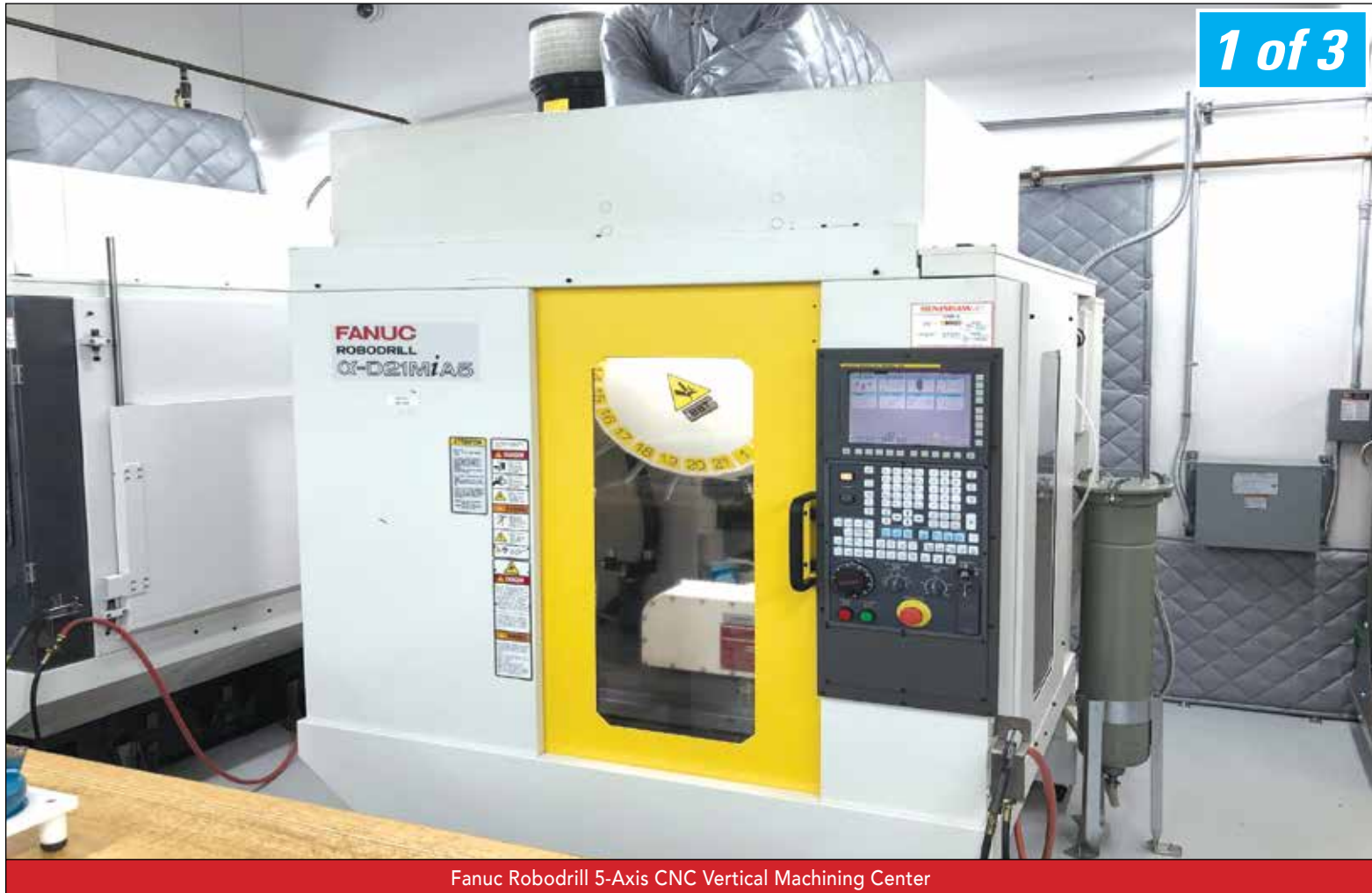
Fanuc Robodrill 5-Axis CNC Vertical Machining Center