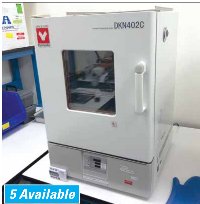
Yamato Constant Temperature Oven