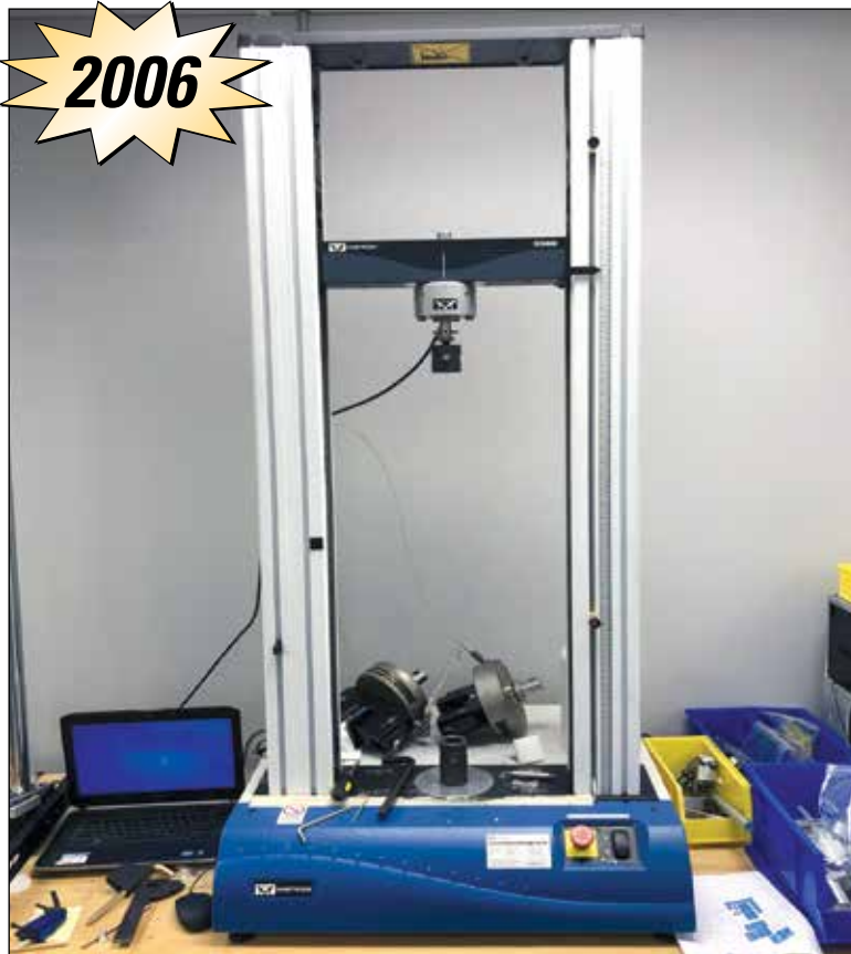
Instron Universal Testing System, Mdl. 3366