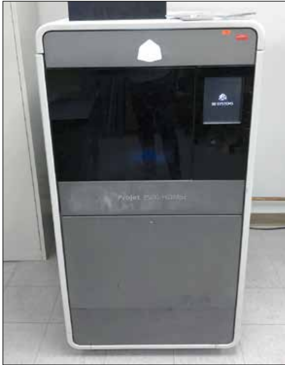
3D Systems ProJet 3500 HDMax 3D Printer