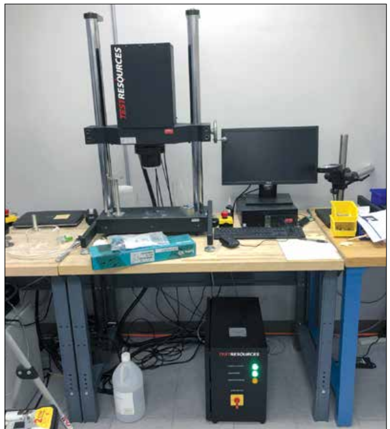
TestResources 1,000 lbf Universal Testing System