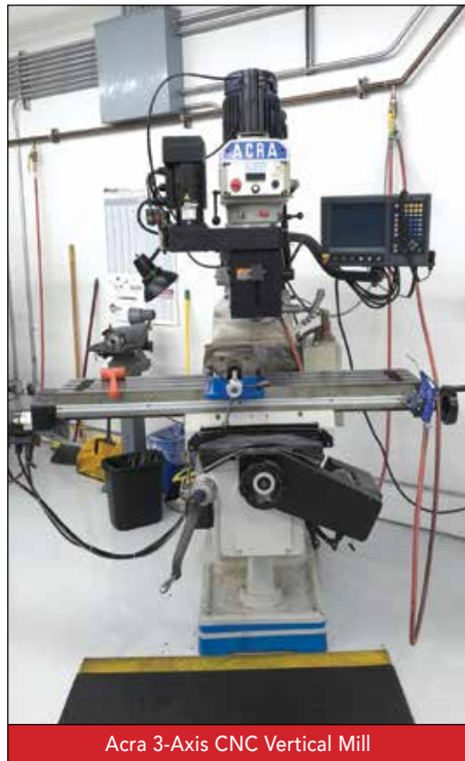
Acra 3-Axis CNC Vertical Mill