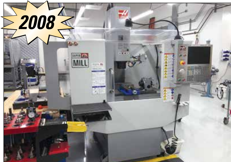
Haas Super Mini Mill

Register at www.BIDITUP.com and receive auction updates via email