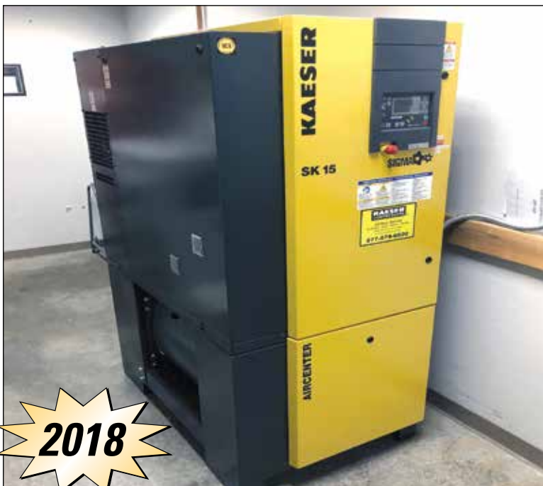
Kaeser SK 15 Air Compressor