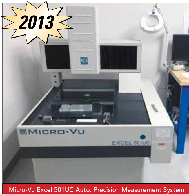
Micro-Vu Excel 501UC Auto. Precision Measurement System