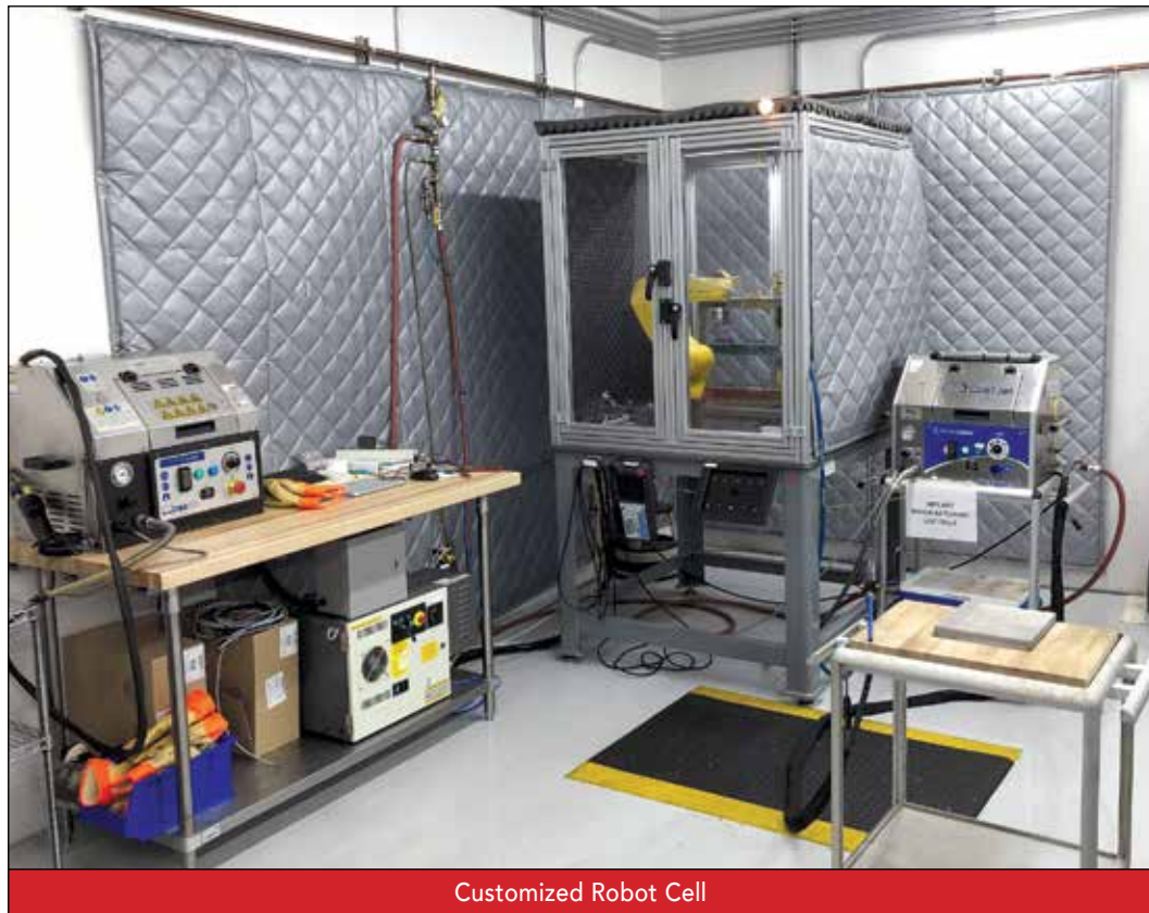
Customized Robot Cell