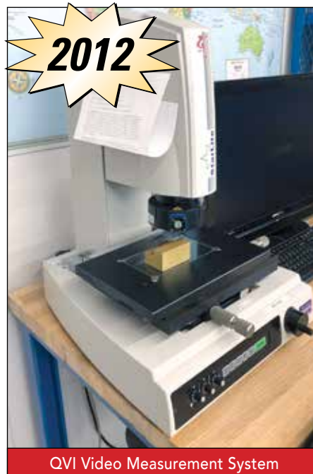
QVI Video Measurement System