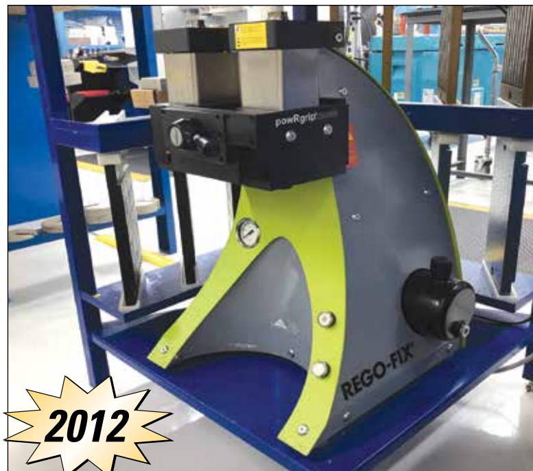
Rego-Fix powRgrip PGU9000 Tool Clamping Press