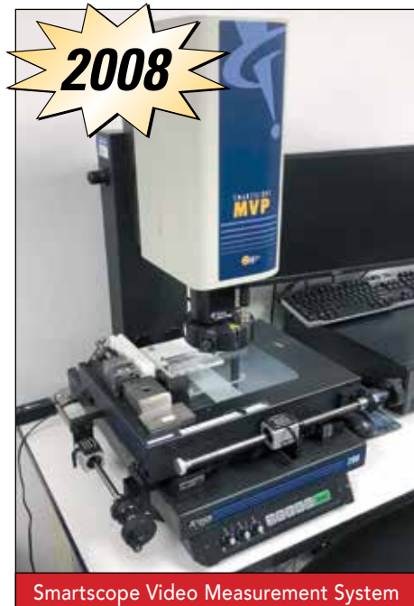
Smartscope Video Measurement System

TO SCHEDULE AN AUCTION OR APPRAISAL CALL 818.508.7034