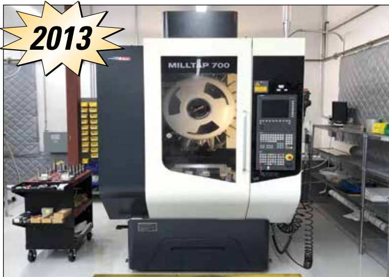
Dmg Mori Seiki Milltap 700 CNC Vertical Machining Center