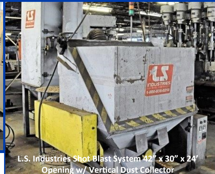
L.S. Industries Shot Blast System 42" x 30" x 24' Opening w/ Vertical Dust Collector