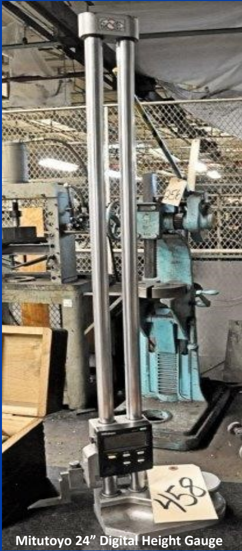
Mitutoyo 24" Digital Height Gauge