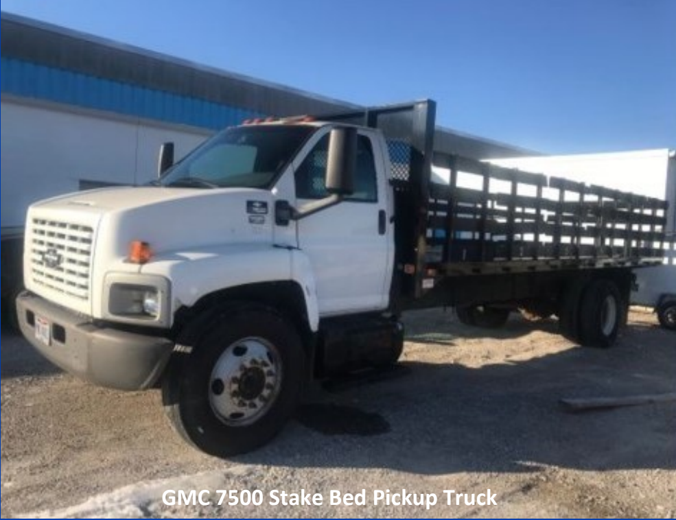
GMC 7500 Stake Bed Pickup Truck