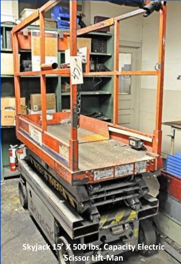
Skyjack 15' X 500 lbs. Capacity Electric Scissor Lift-Man