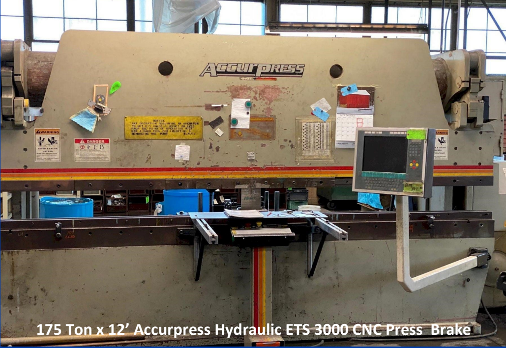
175 Ton x 12' Accurpress Hydraulic ETS 3000 CNC Press Brake

TURN YOUR ASSETS INTO CASH CONSIGN YOUR MACHINERY TODAY IN OUR UPCOMING SPRING CONSIGNMENT SALE! CALL 419-536-4445