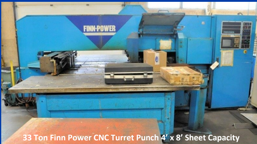
33 Ton Finn Power CNC Turret Punch 4' x 8' Sheet Capacity