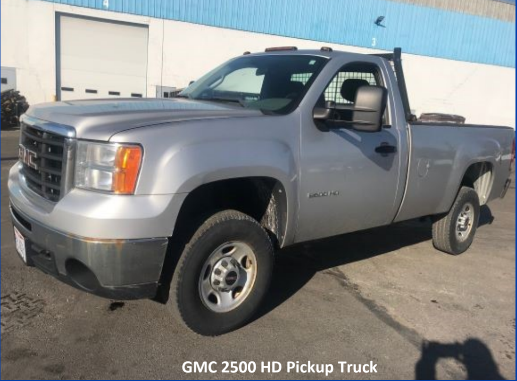
GMC 2500 HD Pickup Truck