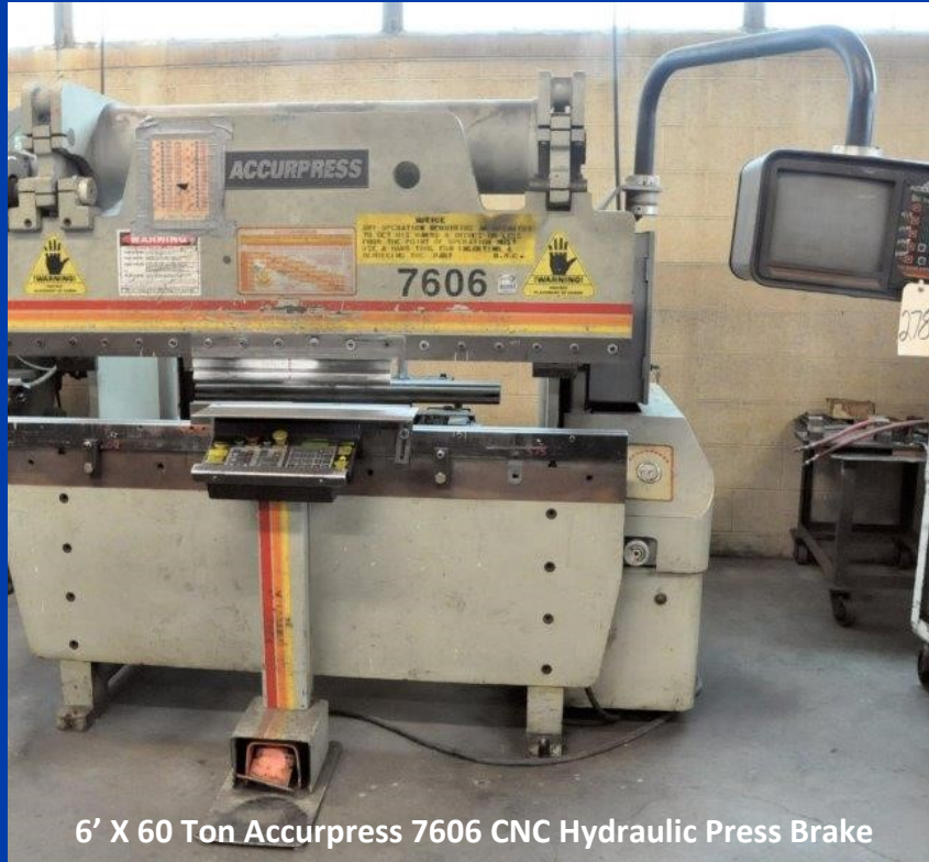
6' X 60 Ton Accurpress 7606 CNC Hydraulic Press Brake