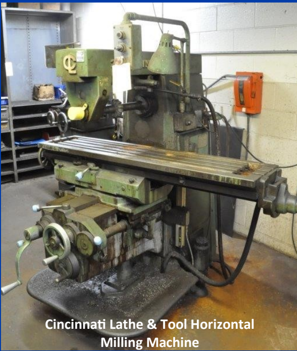
Cincinnati Lathe & Tool Horizontal Milling Machine