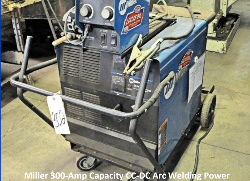
Miller 300-Amp Capacity CC-DC Arc Welding Power