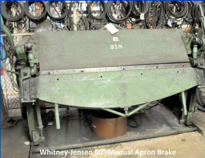
Whitney-Jensen 60" Manual Apron Brake