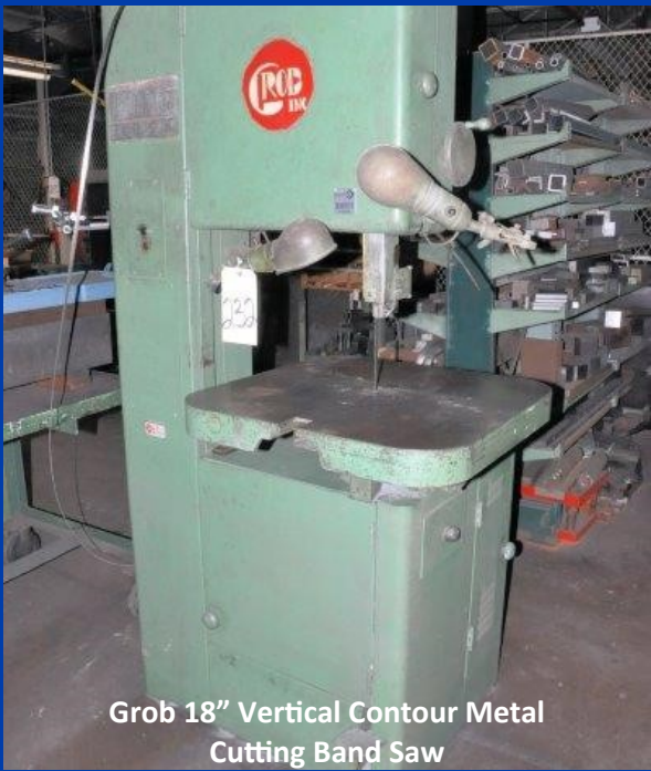
Grob 18" Vertical Contour Metal Cutting Band Saw