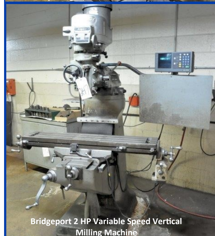
Bridgeport 2 HP Variable Speed Vertical Milling Machine