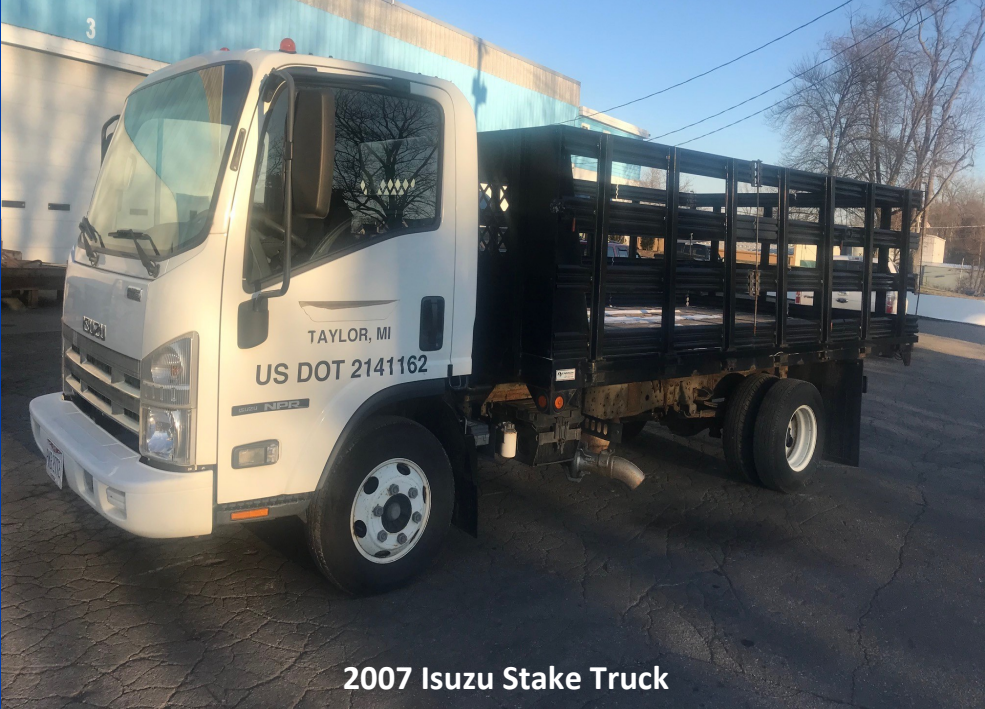
2007 Isuzu Stake Truck