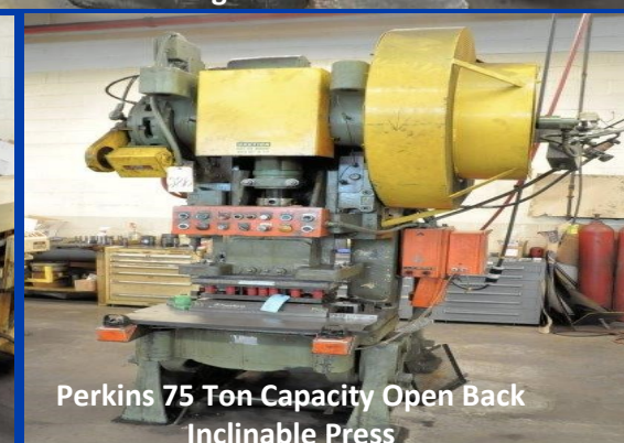
Perkins 75 Ton Capacity Open Back Inclined Press