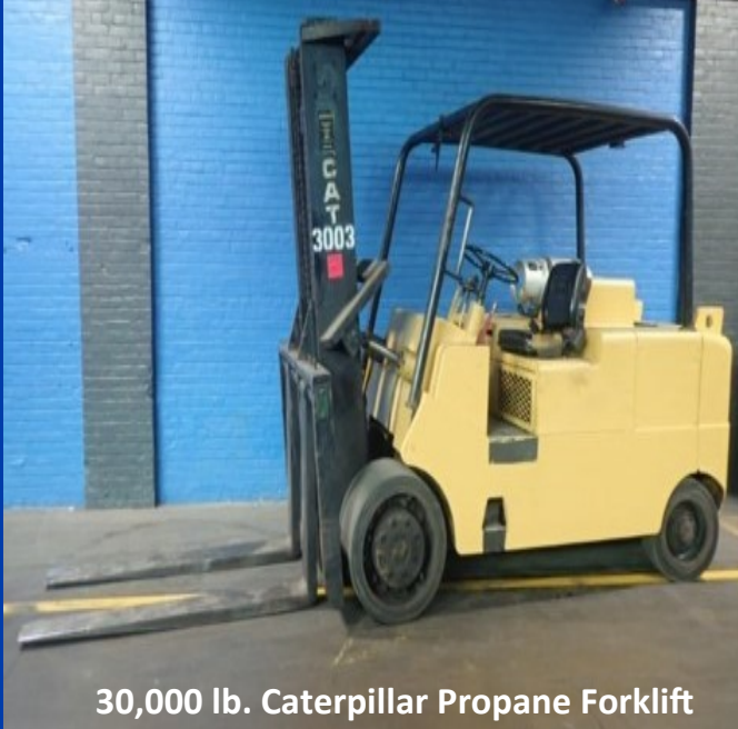
30,000 lb. Caterpillar Propane Forklift