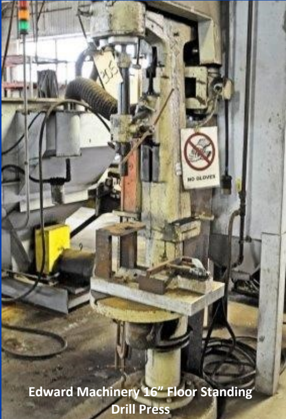
Edward Machinery 16" Floor Standing Drill Press