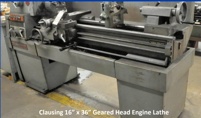
Clausing 16" x 36" Geared Head Engine Lathe