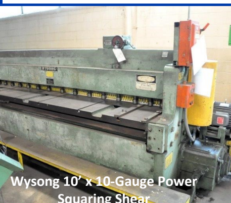
Wysong 10' x 10-Gauge Power Squaring Shear