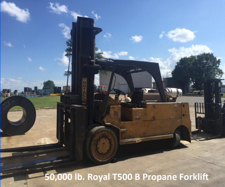
50,000 lb. Royal T500 B Propane Forklift