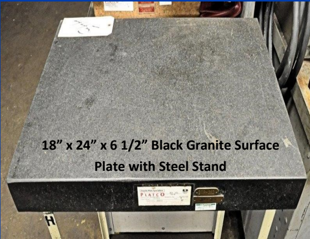
18" x 24" x 6 1/2" Black Granite Surface Plate with Steel Stand