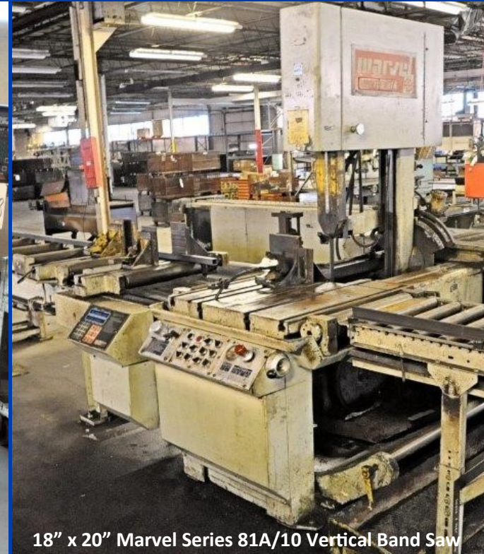
18" x 20" Marvel Series 81A/10 Vertical Band Saw