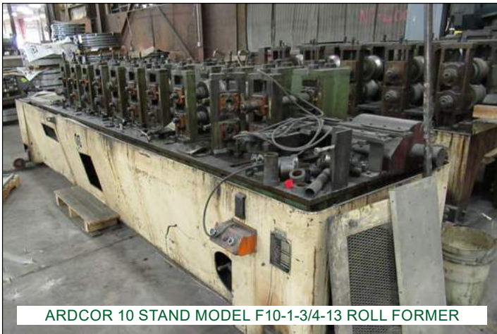
ARDCOR 10 STAND MODEL F10-1-3/4-13 ROLL FORMER