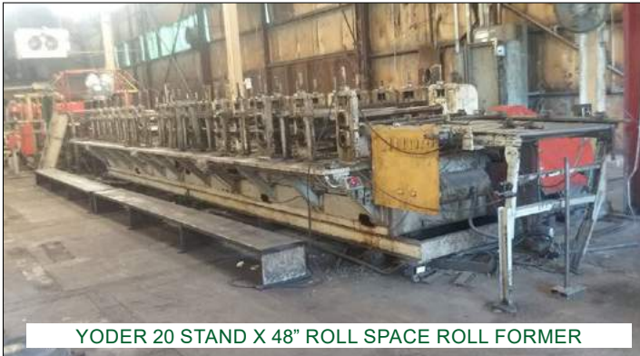
YODER 20 STAND X 48" ROLL SPACE ROLL FORMER

Asset Location: 1000 W. Barker Avenue, Michigan City, Indiana