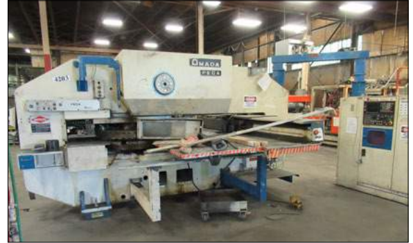
AMADA 30 TON MODEL PEGA 305072 CNC TURRET PUNCH, S/N AA570067, with Fanuc System 6M Control