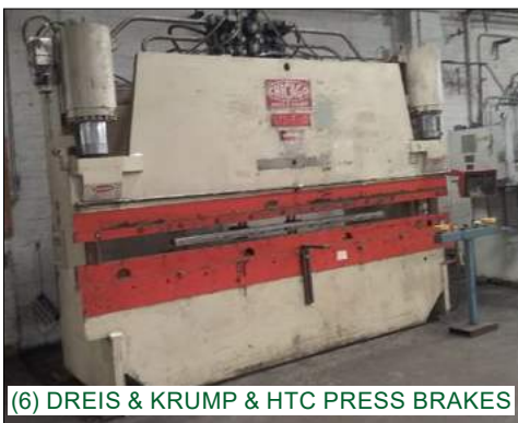
(6) DREIS & KRUMP & HTC PRESS BRAKES