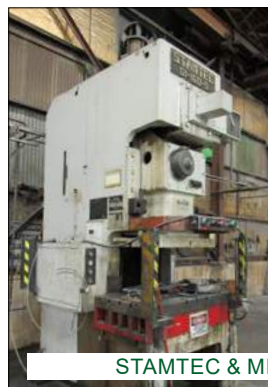
STAMTEC & MINSTER PRESSES