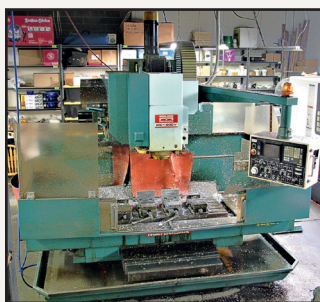
1986 Matsuura MC-1000V5 Vertical Machining Center