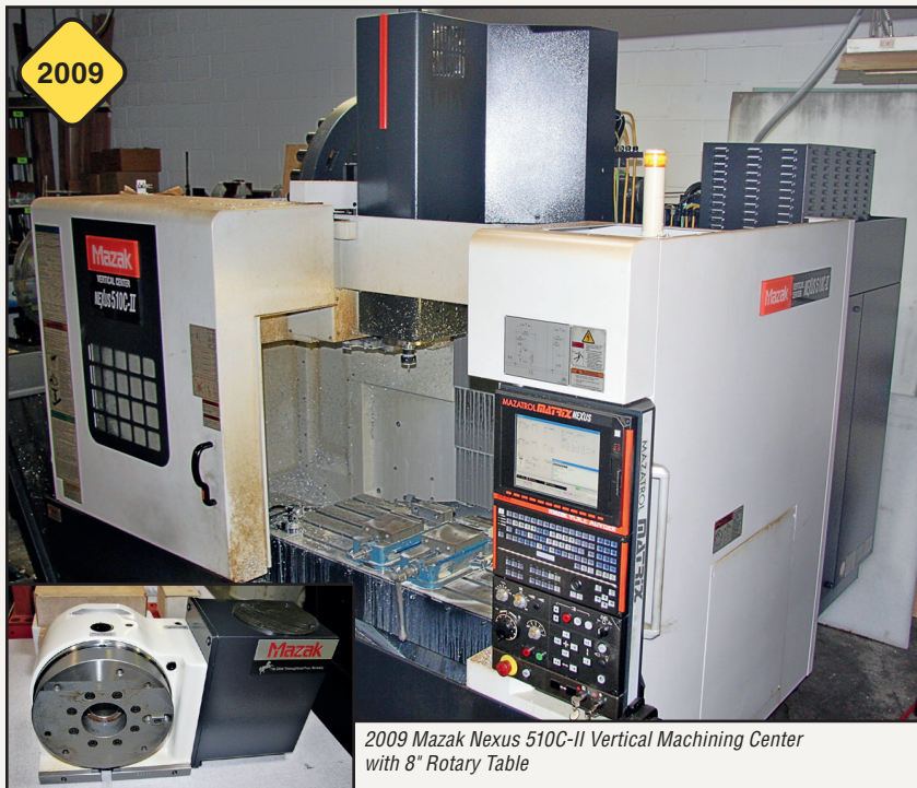
2009 Mazak Nexus 510C-II Vertical Machining Center with 8" Rotary Table