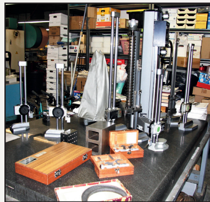
Partial View of Trimos Gage and Assorted Inspection

PLEASE VISIT OUR WWW.KOSTERINDUSTRIES.COM FOR TERMS OF SALE AND PHOTOS