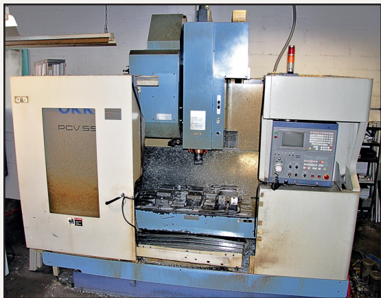
1996 OKK PCV-55 Vertical Machining Center

FEATURING: 2009 Mazak Nexus 510C-II • 1996 OKK PCV-55 • Mazak V-515/40 • Matsuura MC-1000V5 • Hitachi VA-50 • Bridgeports • Bandsaws • Forklift • Trimos Gage & Assorted Inspection