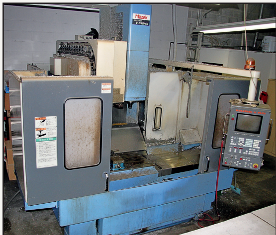
1996 Mazak V-515/40 Vertical Machining Center