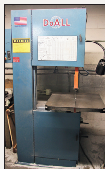
20" DoAll Vertical Bandsaw

VERTICAL MACHINING CENTERS: 2009 Mazak Nexus 510C-II, travels: X-41.34"/Y-20.08"/Z-20.08", 21.65" x 51.18" table, #CT40 spindle taper, 12,000 RPM, 30-position automatic tool changer, chip conveyor, spindle thru coolant, 2,640-lb. table capacity