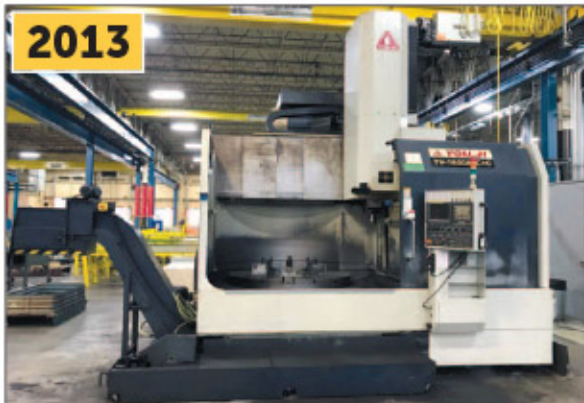
Youji YV-1600ATC+C CNC Vertical Turning Center