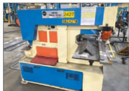
75-Ton Mubea HIW 750/510 Ironworker