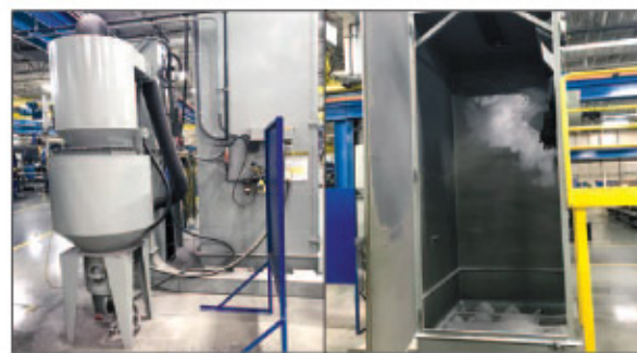
Pangborn Shot Blast Booth