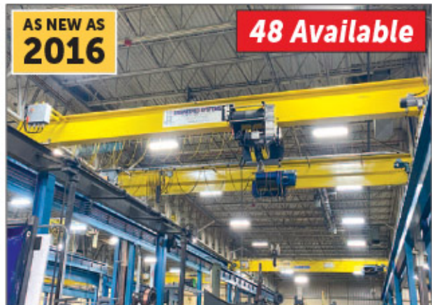
(48) Cranes with Rail & Upright