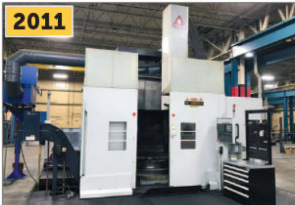
Youji VTL-1200ATC II CNC Vertical Turning Center