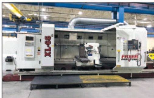
65" x 160" Fryer Easy Turn XL-65 CNC Lathe