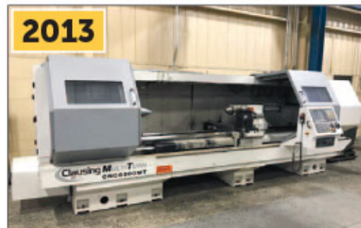
30" x 120" Clausing MultiTurn 6000MT CNC Lathe