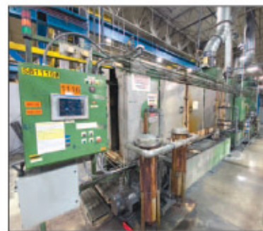
Baldor 3-Stage Cleaning System