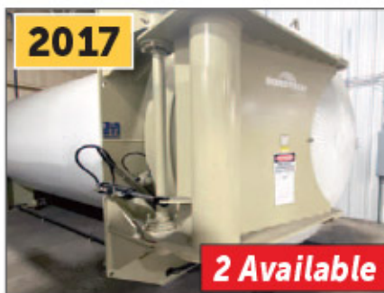
(2) 9' x 20' Bondtech Autoclaves