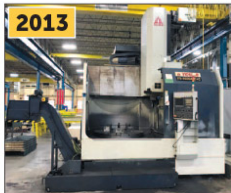
2013 Youji YV-1600ATC+C CNC Vertical Turning Center

TERMS AND CONDITIONS: Payment must be in U.S. Dollars. Payment, including 18% Buyer's Premium, is due within 3 business days of receipt of invoice. Valid Bill of Lading must be shown and on file with MNA to avoid local sales tax. No exceptions. Any item/lot not removed by Friday, January 8, shall be deemed to be abandoned. By placing a bid, bidder acknowledges and expressly assents to each of the terms and conditions of auction found on the MNA website and auction catalog.