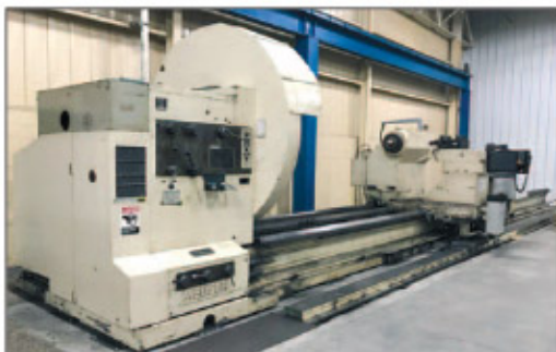
110" x 456" Meuser CNC Engine Lathe