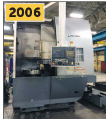
Okuma V80R CNC Vertical Turning Center