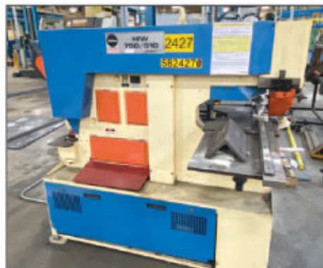
Mubea HIW 750/510 Ironworker