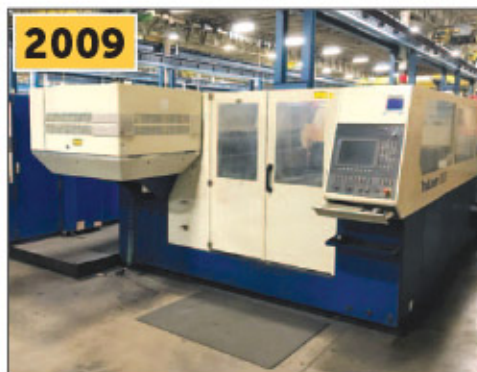
Trumpf TruLaser 3030 CNC Laser Cutter