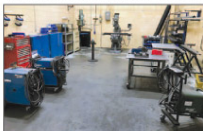
View of Welders