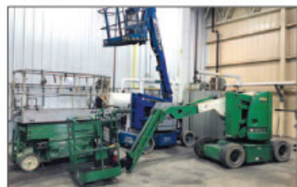
View of Boom & Scissor Lifts