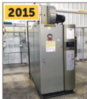
Miura LX-50SG Steam Boiler