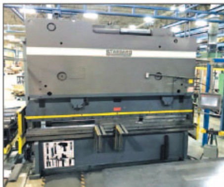
325-Ton x 12' Standard AB325-12 Press Brake