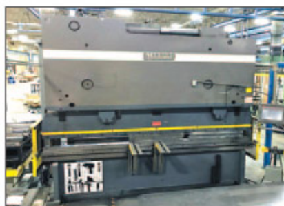
325-Ton x 12' Standard AB325-12 Press Brake