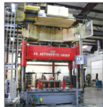
200-Ton Capital Hyd. Spotting Press