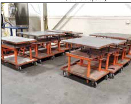
(9) ECONOMY 2,000-lb. Mechanical Die Lift Tables