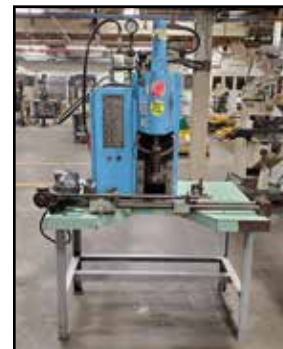
HANSON AB-6 Spot Welder