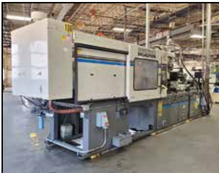
CINCINNATI MILACRON VH-300-21 300-Ton Plastic Injection Molder