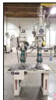
(2) RMT & CLAUSING Drill Presses