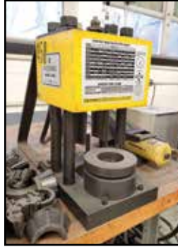
COLLOCRIMP T-100 Hydraulic Hose Crimper