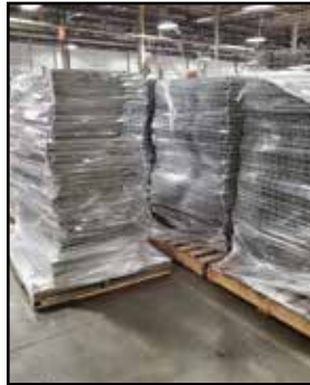
Large Quantity of Wire Mesh Decking