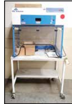
AIR SCIENCE Pur-Air Ductless Fume Hood