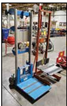
(2) GENIE & WESCO 500-lb. Lifts