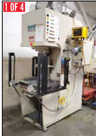
(4) DENISON Multipresses to 50-Ton Capacity