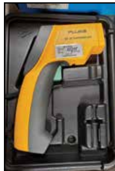
FLUKE 63 IR Thermometer