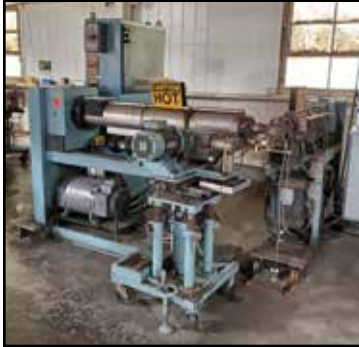
REIFENHAUSER Plastic Extruder System