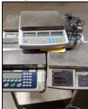
(5) METTLER TOLEDO & AE ADAM Digital Scales