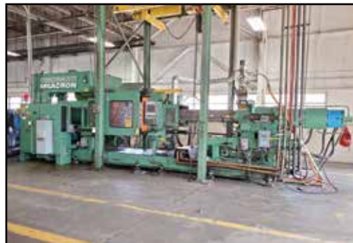
CINCINNATI MILACRON 500-70 500-Ton Plastic Injection Molder