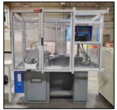
HARDINGE Super Precision CNC Lathe