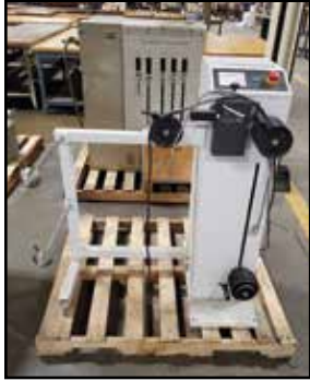
SCHLEUNIGER 2200 Pre-Feeder