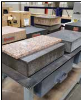
Assorted Granite Surface Plates