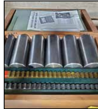
(3) Keyway & Hole Broach Sets