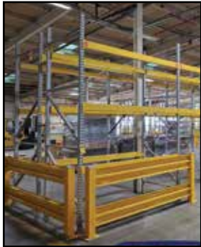
(50) Sections Pallet Racking