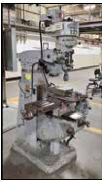
BRIDGEPORT Vertical Mill