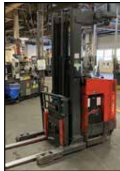
RAYMOND R30TT 3,000-lb. Stand-Up Forklift