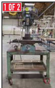
(2) MSC Milling & Drilling Machines