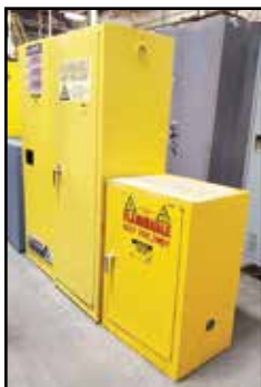
Assorted Flammable Cabinets