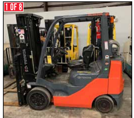
(8) HYSTER, YALE, TOYOTA & Other Forklifts to 12,000-lb. Capacity