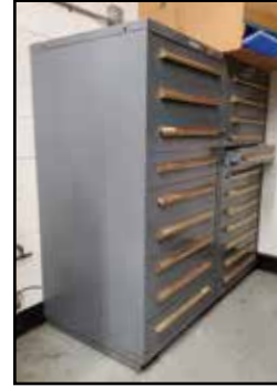
(2) EQUIPTO Cabinets w/Assorted Hardware