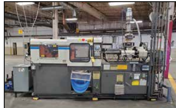
CINCINNATI MILACRON VSX-55-2-97 55-Ton Plastic Injection Molder