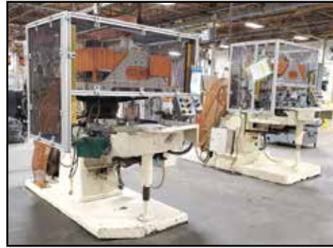
(2) BODINE 42-30 Drilling & Tapping Machines