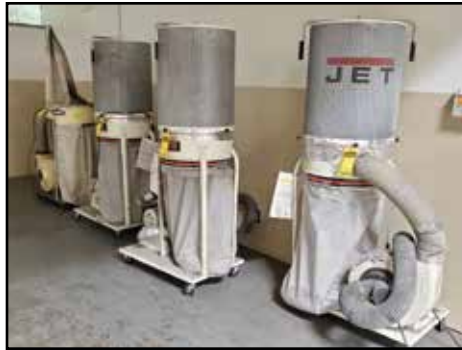
(4) JET VORTEX Cone Particle Separation Systems & FOX Dust Collector