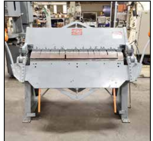
CHICAGO DREIS & KRUMP 4' Bending Brake