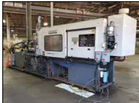
CINCINNATI MILACRON VH-250-13 250-Ton Plastic Injection Molder