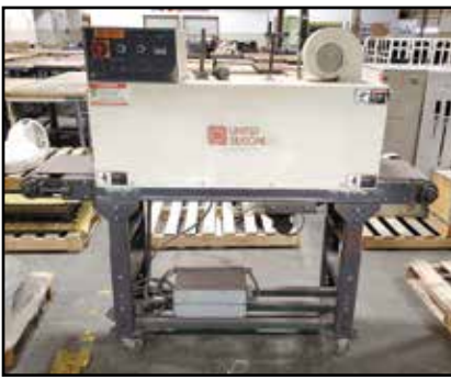
UNITED SILICONE Drying Pass-Through Conveyor Oven & Kiln Oven