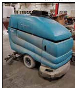
TENNANT ECH20 5700 Powered Floor Scrubber