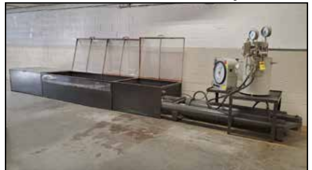
TINIUS OLSEN Horizontal Pulling Tensile Tester