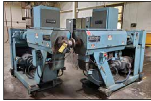
BERLYN Plastic Extruder