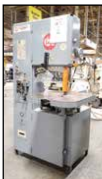
ROB RW-B Vertical Band Saw