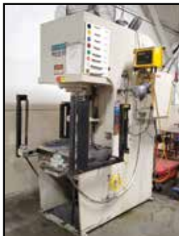
DENNISON ABEX 35-Ton Multipress