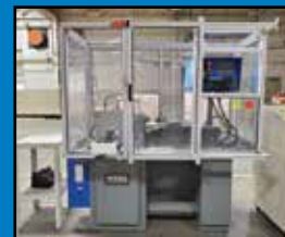
HARDINGE Super Precision CNC Lathe