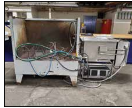
RAMCO Equipment Ultra Sonic Cleaner