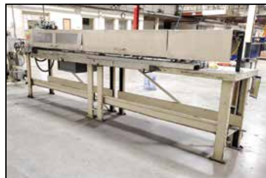
EWALD Flash Cutter