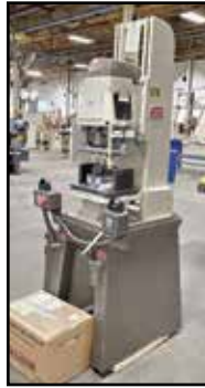
JARVIS 27-H Drilling & Tapping Machine