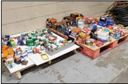
Assorted Bearings & Bearing Pullers