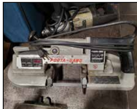
PORTA CABLE 736 Band Saw