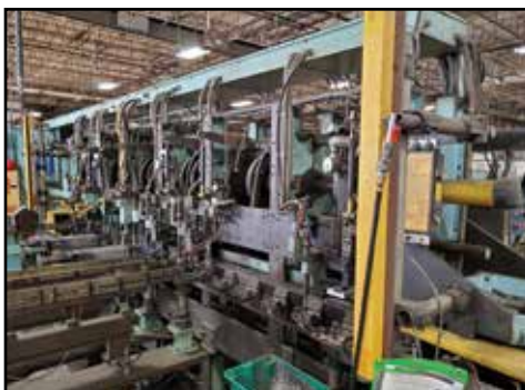
BODINE 64 Assembly Machine