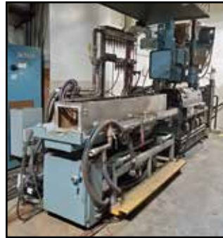
(2) METAPLAST Stainless Steel Bath Tanks