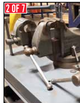
(7) Assorted Bench Vises