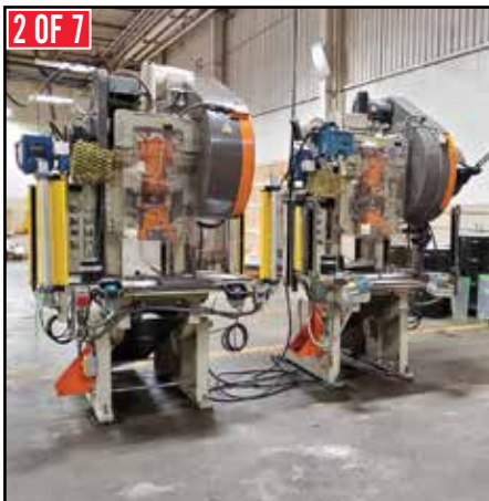
(7) BLISS Obi Presses to 35-Ton Capacity