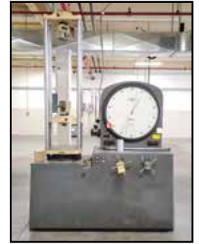
TINIUS OLSEN Vertical Tensile Testing Press