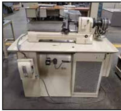
HARDINGE DV59 Super Precision Lathe