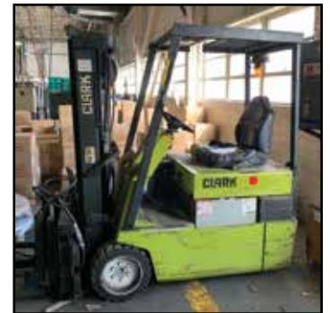
CLARK 3,500-lb. 3-Wheel Forklift