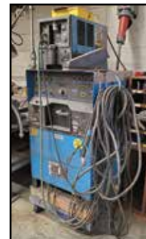
MILLER Syncrowave 350LX TIG Welder