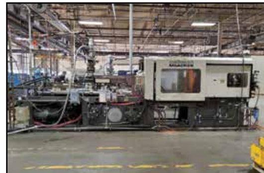
CINCINNATI MILACRON VH-400-29 400-Ton Plastic Injection Molder