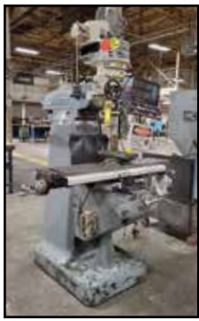
BRIDGEPORT ALLIANT Vertical Mill