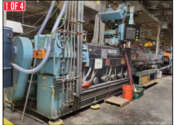
(4) DAVIS STANDARD Thermatic Plastic Extruders

INSPECTION: DAY PRIOR TO AUCTION FROM 9AM - 4PM