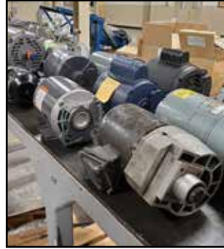
Miscellaneous 5-HP to 20-HP Motors, Gear Drives & Reducers