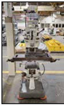
BRIDGEPORT Textron Vertical Mill