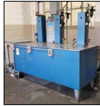
RAMCO Parts Washer