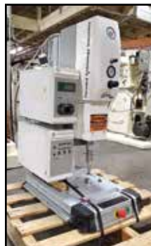
FTI Ultra Sonic Welder