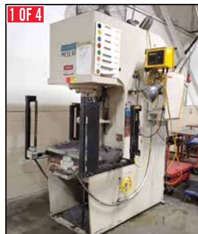
(4) DENISON Multipresses to 50-Ton Capacity

Machinery removal is the responsibility of the buyer. All equipment must be removed in accordance with the specific auction timeline and terms of sale. See the specific auction web page for details. Anyone (rigger or buyer), using a powered vehicle to remove items must have a certificate of insurance on file with Myron Bowling Auctioneers in the amount of $1,000,000.00. Item removal generally begins at the conclusion of the auction and after payment in full is received by cash, wire transfer, or company check (if approved by the auction company or bank letter of guarantee). All checks should be made payable to Myron Bowling Auctioneers. Taxes will be charged unless you have provided a proper written exemption from your state.