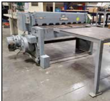
ONE SERIES 4' x 14-Ga. Power Shear