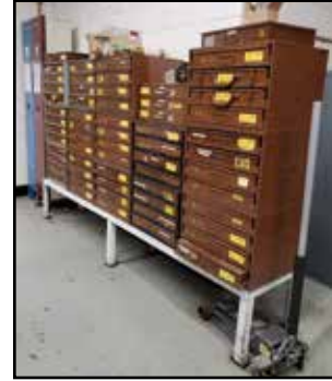
LAWSON Sliding Drawer Cabinets w/Assorted Hardware