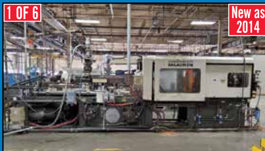
(6) HAITIAN & CINCINNATI Plastic Injection Molders