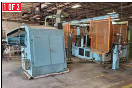
(3) BIHLER BZ2 &amp; GRM50 Forming Machines