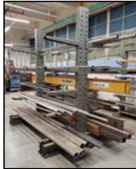
Cantilever Racks w/ I-Beams, Round & Assorted Stock