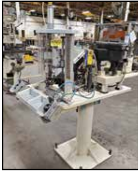
Drilling & Tapping Machine