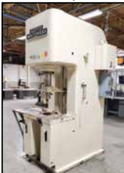
DENISON 50-Ton Hyd. Multipress