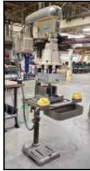
ETTCO 2106 Drilling & Tapping Machine