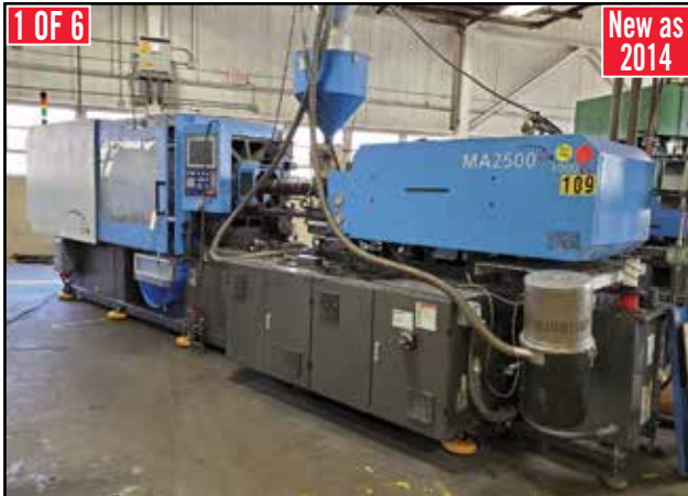
(6) HAITIAN & CINCINNATI Plastic Injection Molders