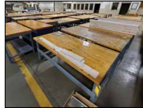
(40+) Butcher Block Work Tables