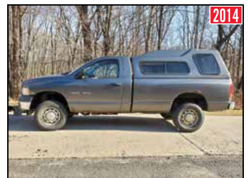
DODGE 2500 4X4 Pickup Truck