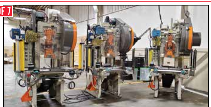
(7) BLISS Obi Presses to 35-Ton Capacity