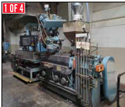
(4) DAVIS STANDARD Thermatic Plastic Extruders

INSPECTION: Day Prior to Auction from 9:00 AM - 4:00 PM