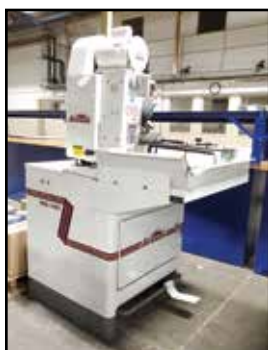
SUNNEN MBB-1660-K Precision Hone