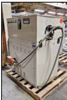
ARMATURE 3-VAS Coil Equipment Twister