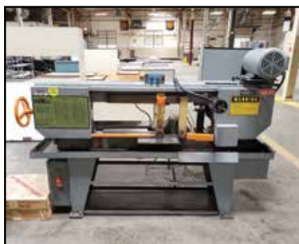
DO-ALL C-916 Horizontal Band Saw