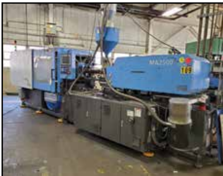
HAITIAN MA2500II 250-Ton Plastic Injection Molder