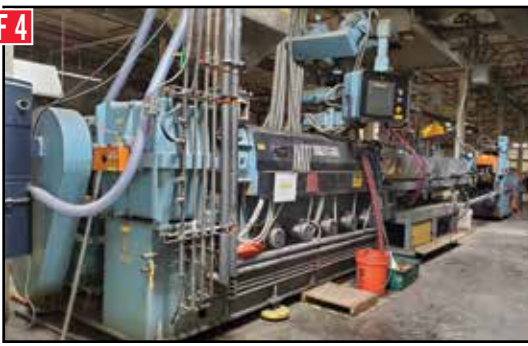
(4) DAVIS STANDARD Thermatic Plastic Extruders