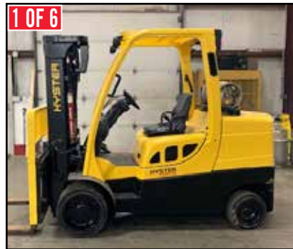
(6) HYSTER, YALE & TOYOTA Forklifts to 12,000-lb. Capacity