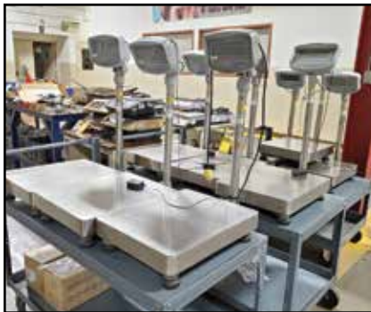
(9) AE ADAM Digital Scales