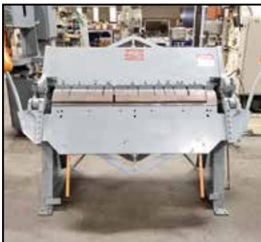
CHICAGO DREIS &amp; KRUMP 4' Bending Brake