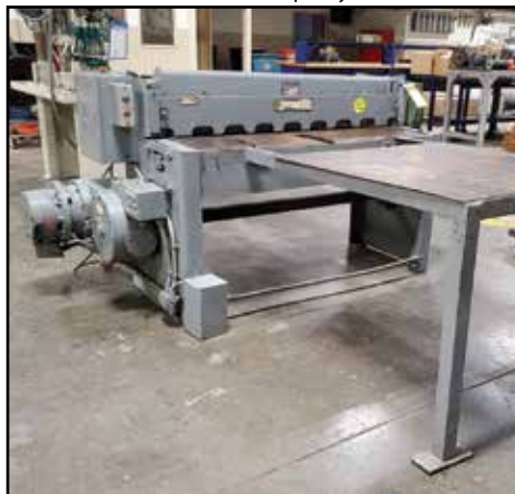
ONE SERIES 4' x 14-Ga. Power Shear