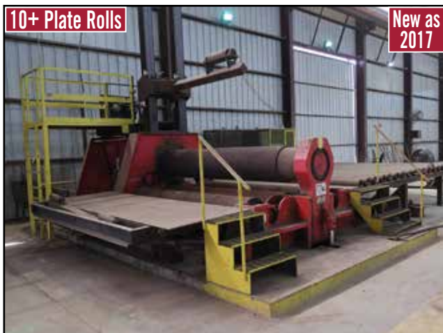
10+ Plate Rolls