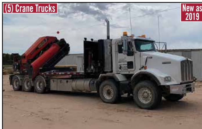
(5) Crane Trucks

Inspection: Day Prior to Each Auction From 9AM-4PM