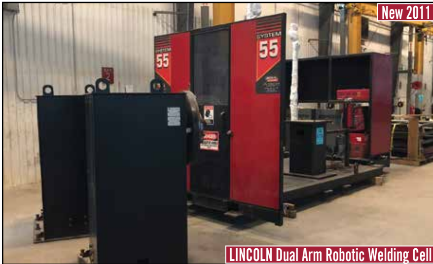
LINCOLN Dual Arm Robotic Welding Cell