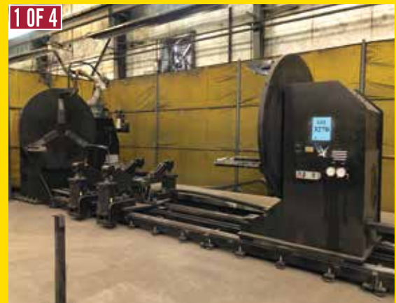
1 OF 4