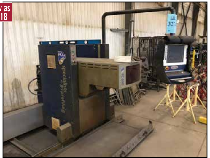
HGG PC600 Thermal Profiler