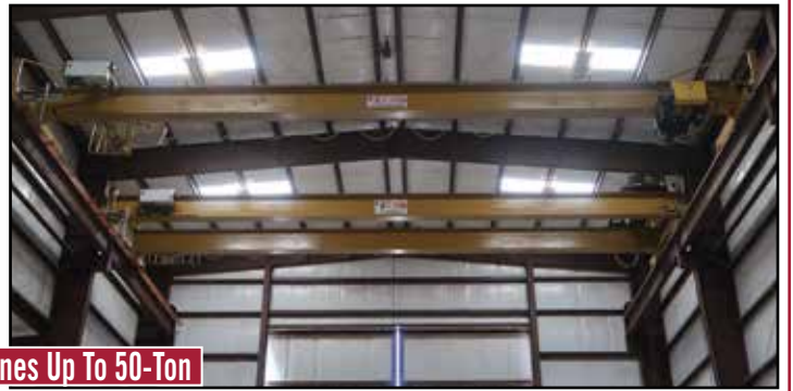
30+ Bridge Cranes Up To 50-Ton