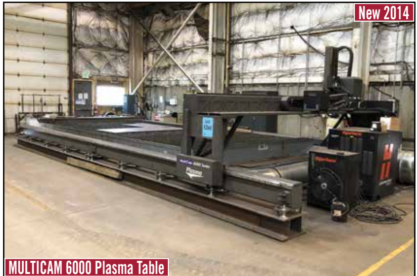
MULTICAM 6000 Plasma Table