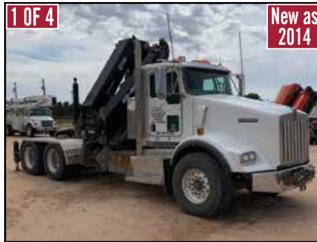
New as 2014