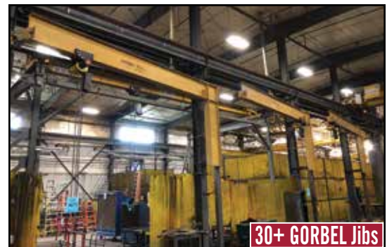
30+ GORBEL Jibs