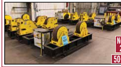
New as 2019 50+ Sets