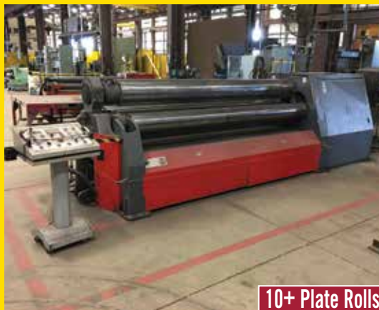
10+ Plate Rolls

Inspection: Day Prior to Each Auction From 9AM-4PM