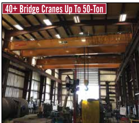
40+ Bridge Cranes Up To 50-Ton