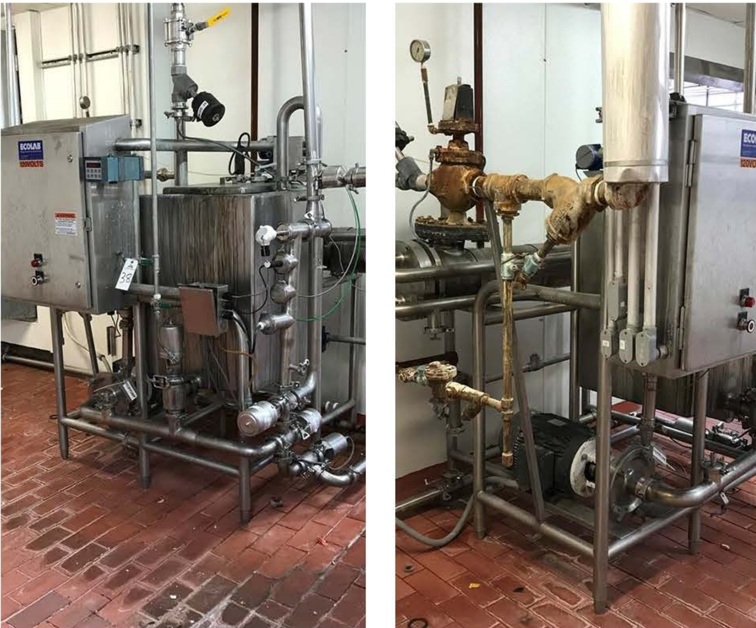
ECOLAB SINGLE TANK CIP SYSTEMS