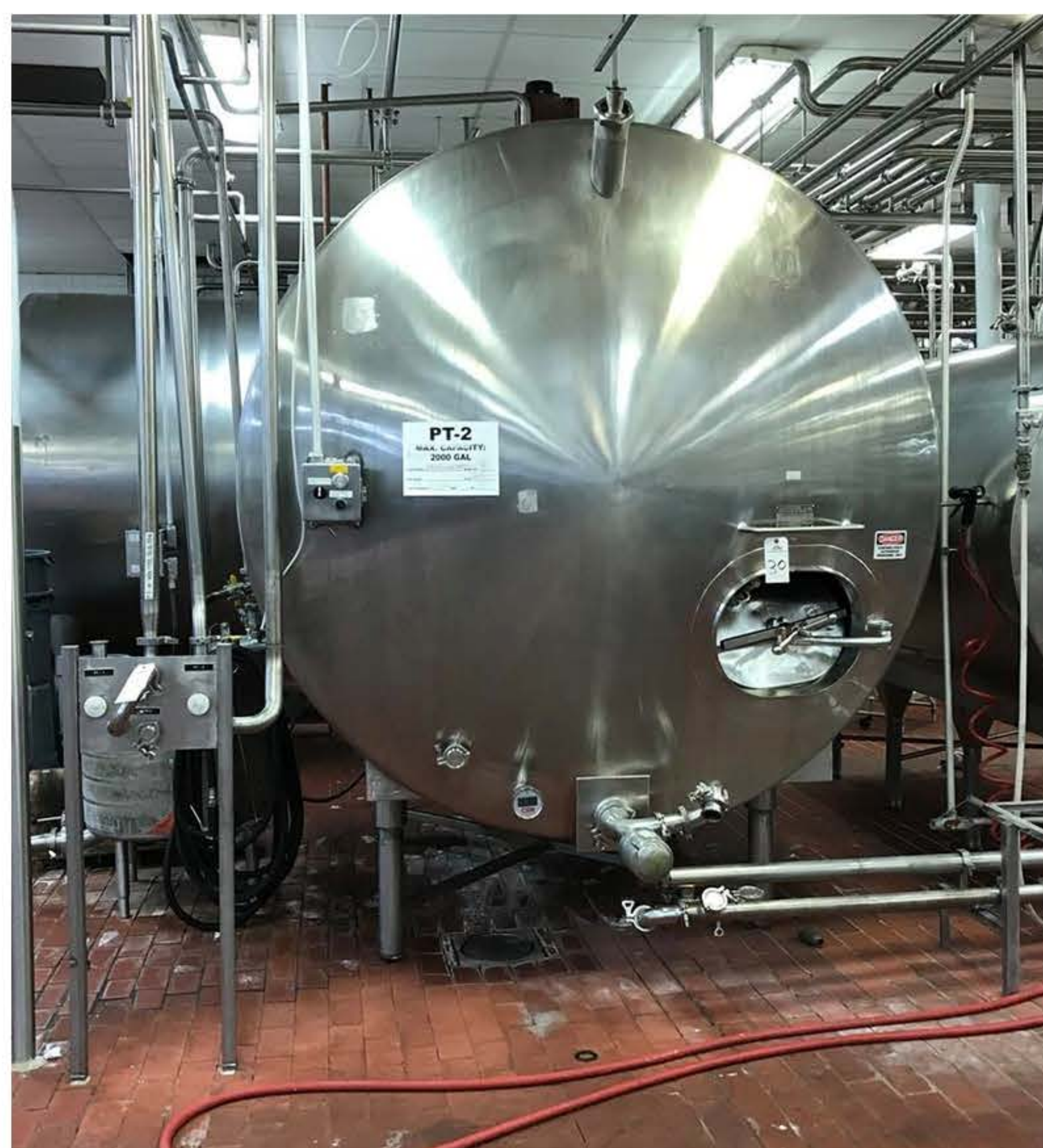
HORIZONTAL STORAGE TANKS