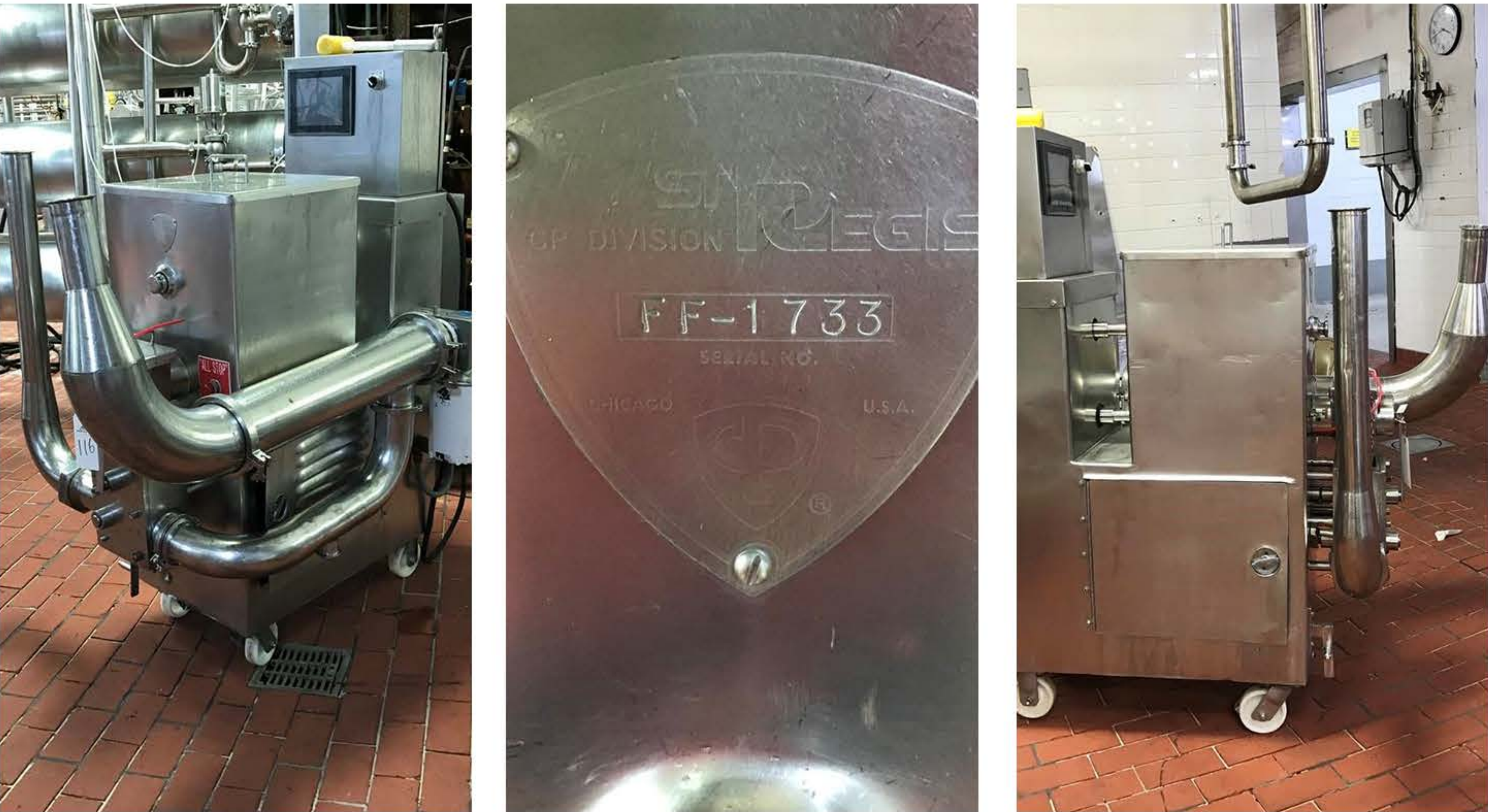
ST REGIS INGREDIENT FEEDERS WITH DIGITAL SCREEN