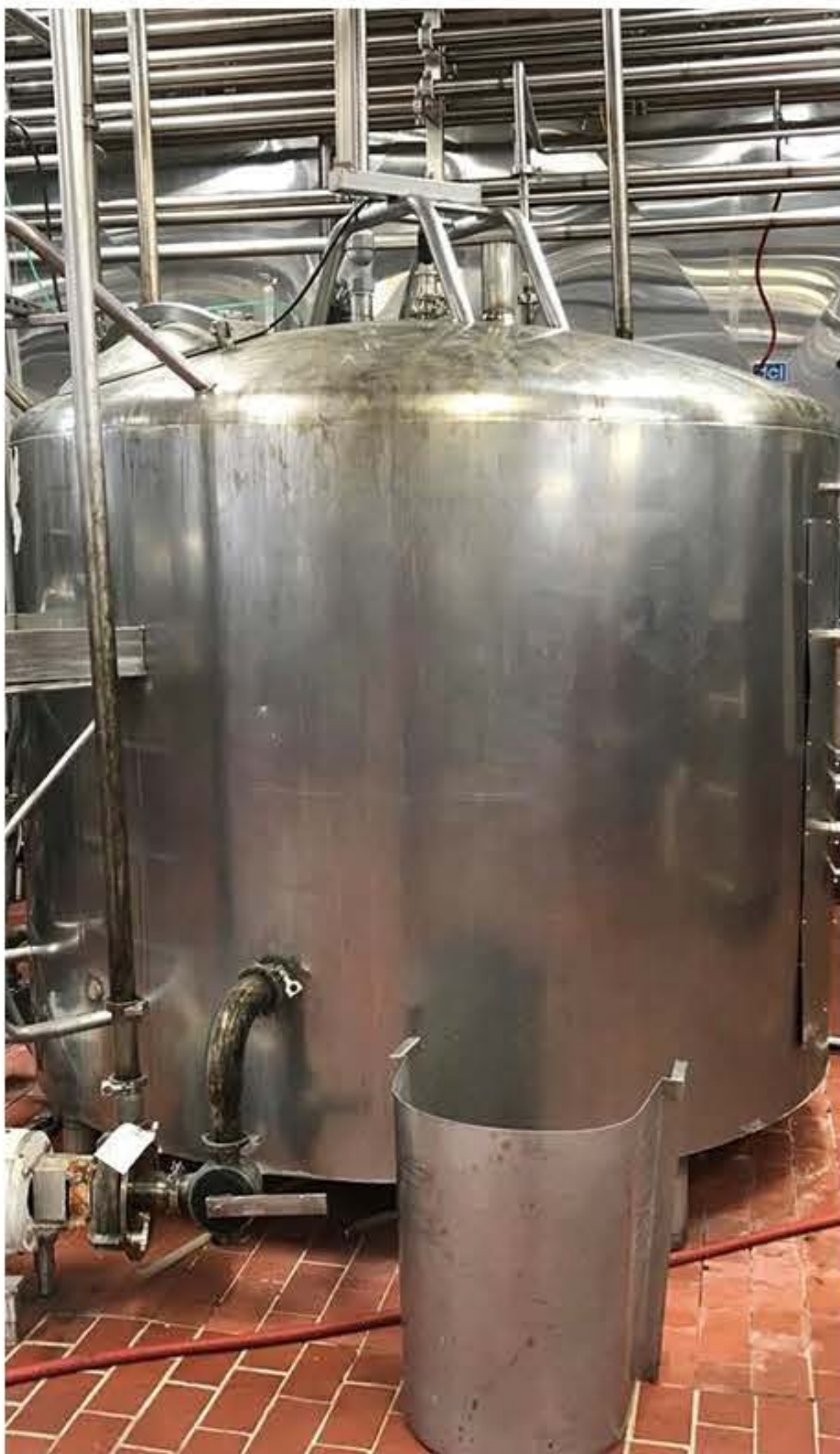
1,000 GALLON PROCESSORS