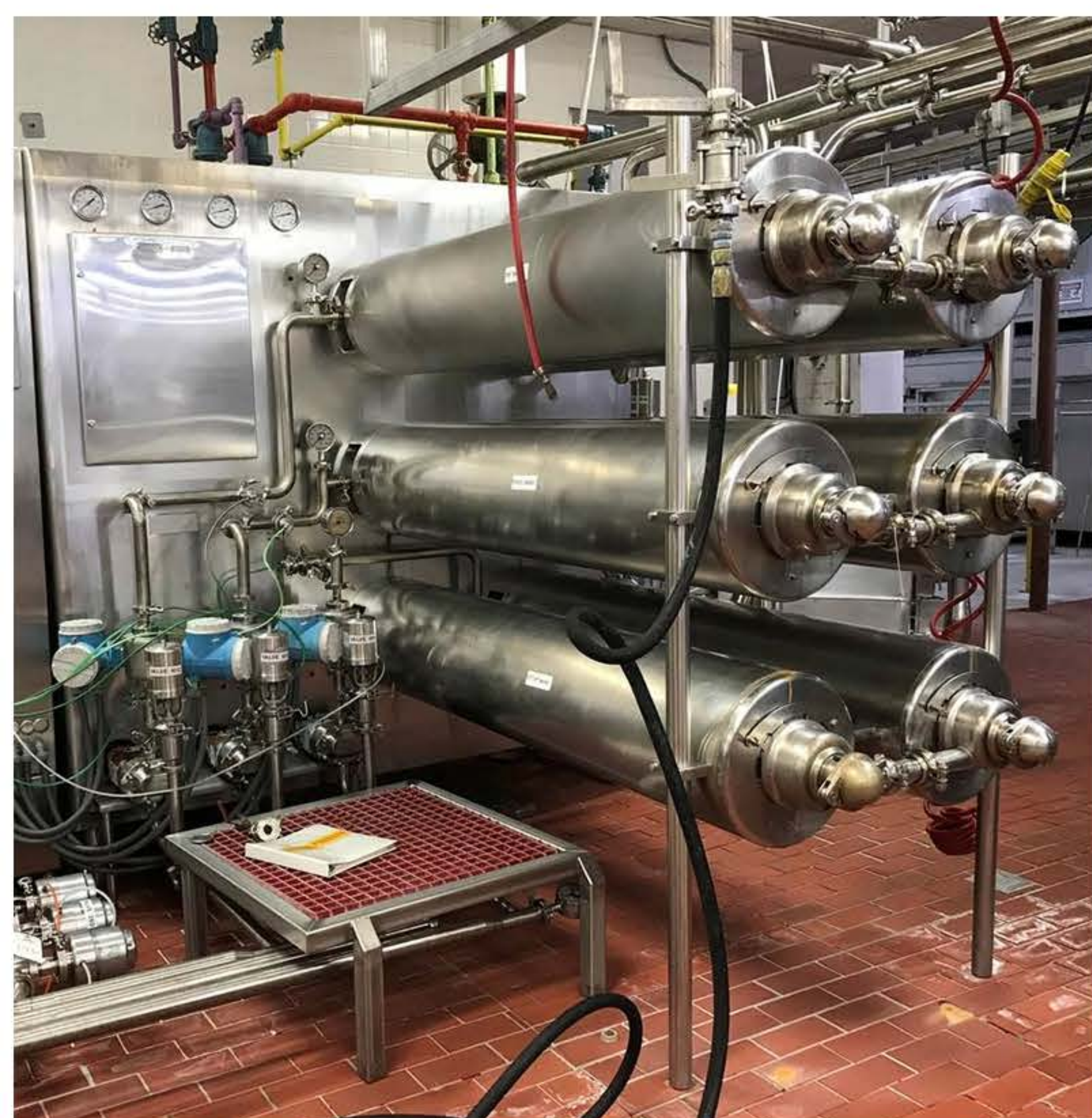
WCB MODEL 33D242 6-BARREL ICE CREAM FREEZER