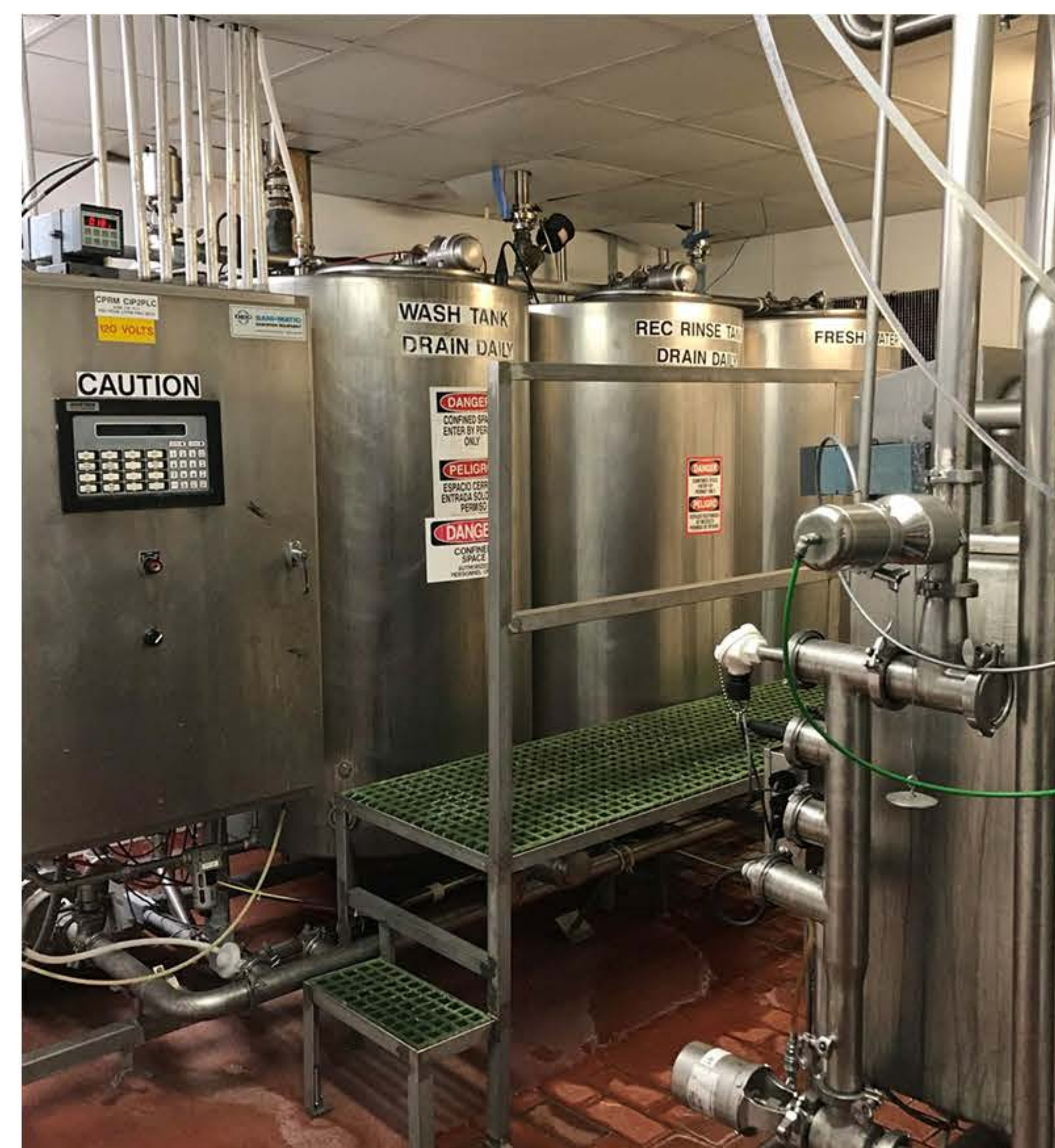
SANI-MATIC 3-TANK CIP SYSTEM