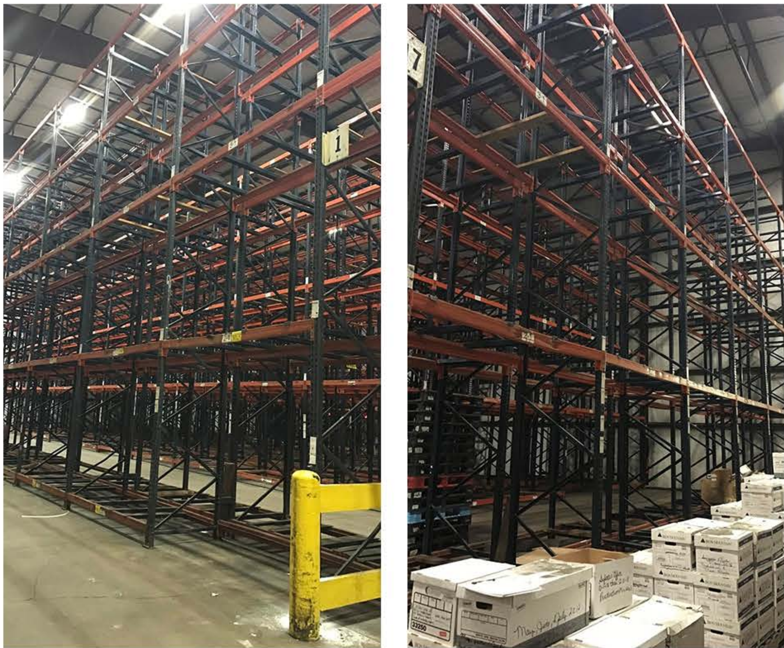
LARGE QUANTITY OF PALLET RACKING