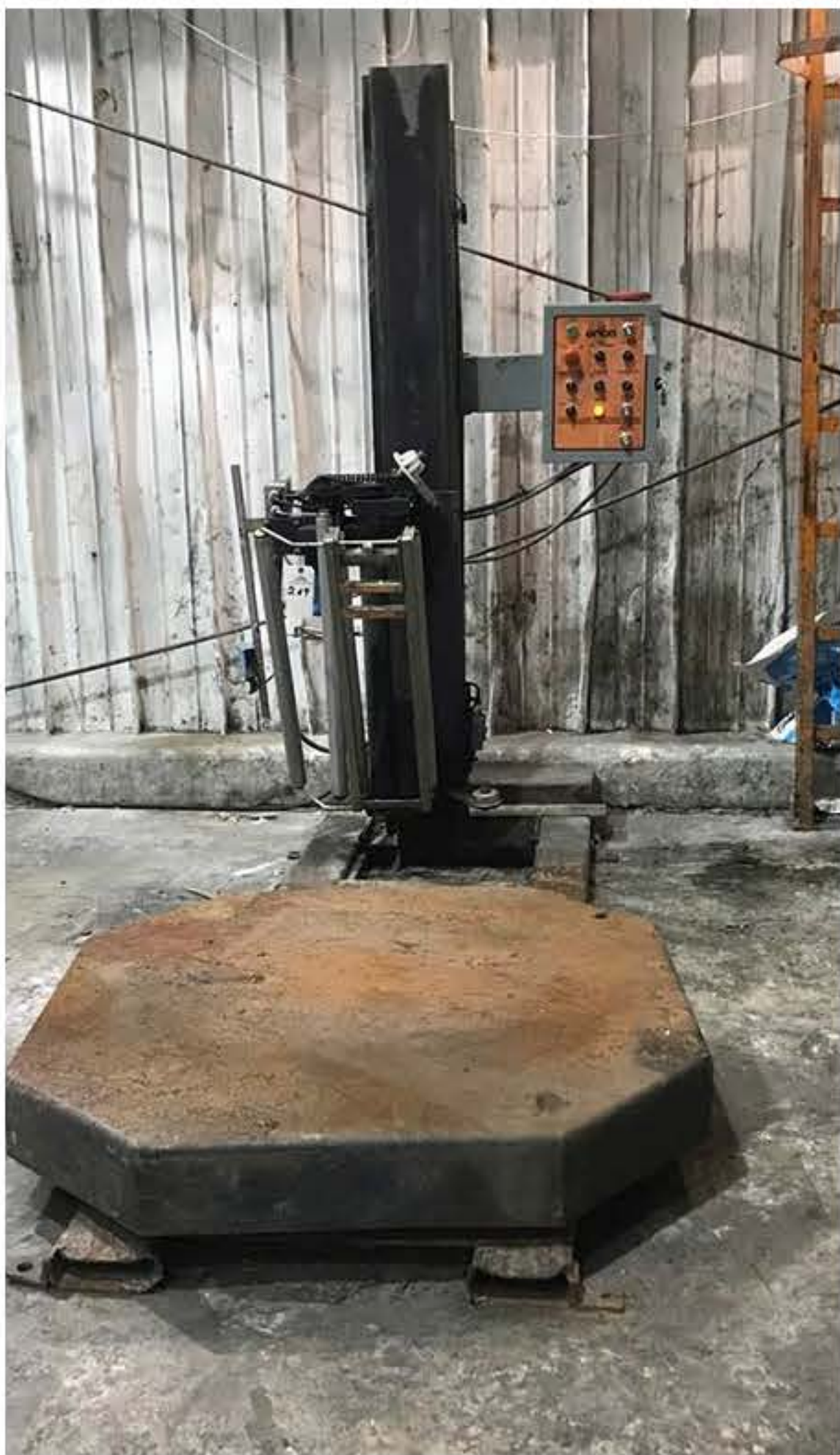
ORION MODEL H66/17 STRETCH WRAPPER