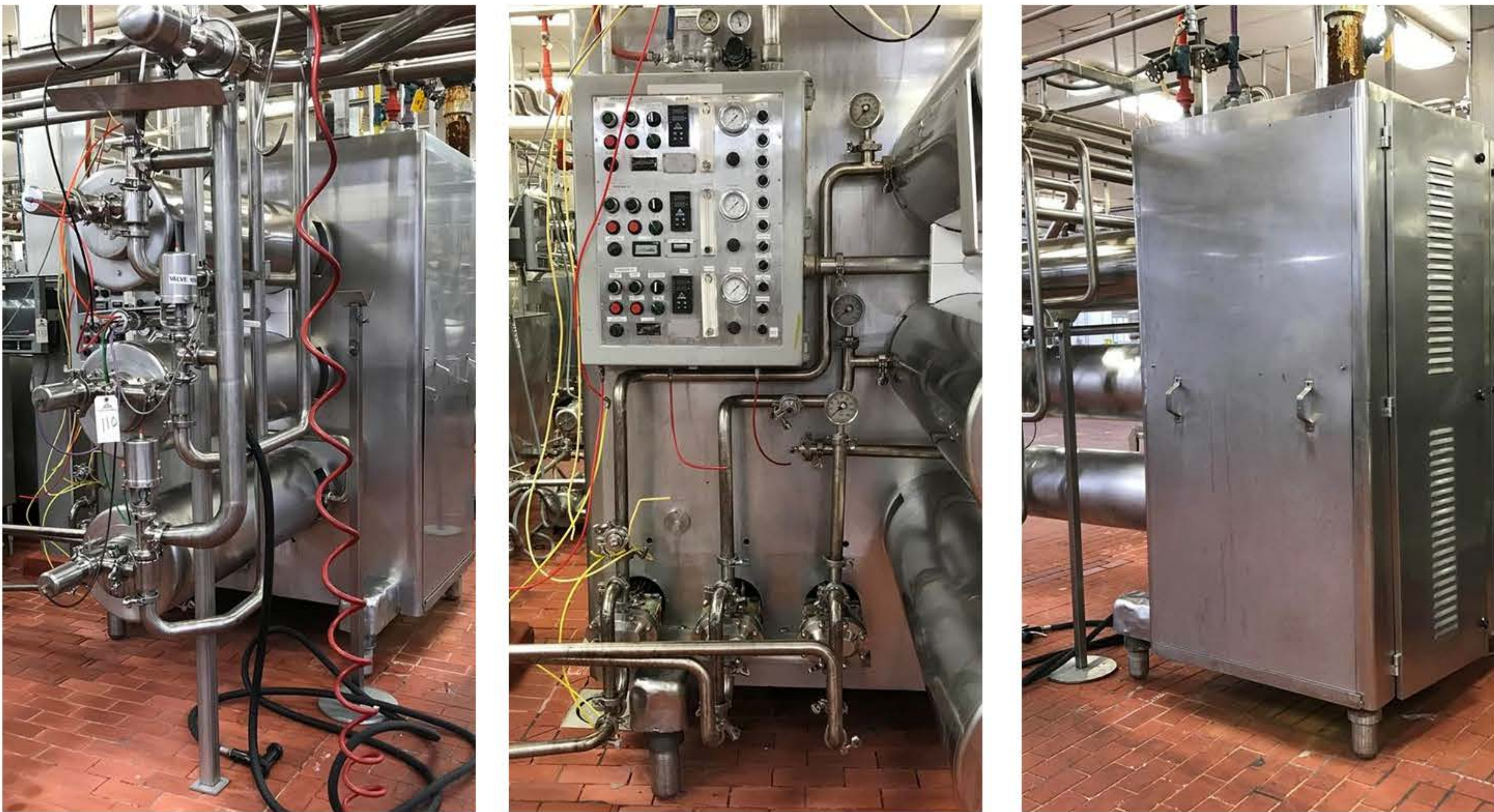
CHERRY BURRELL MODEL 3D90 3-BARREL ICE CREAM FREEZER