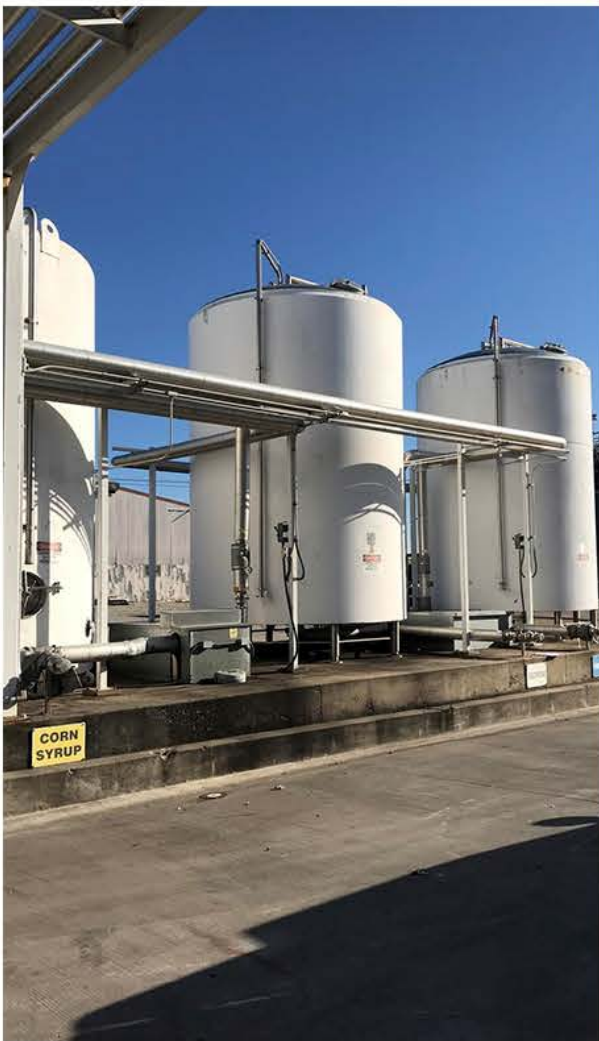
8,000 GALLON SILO/SUGAR TANKS