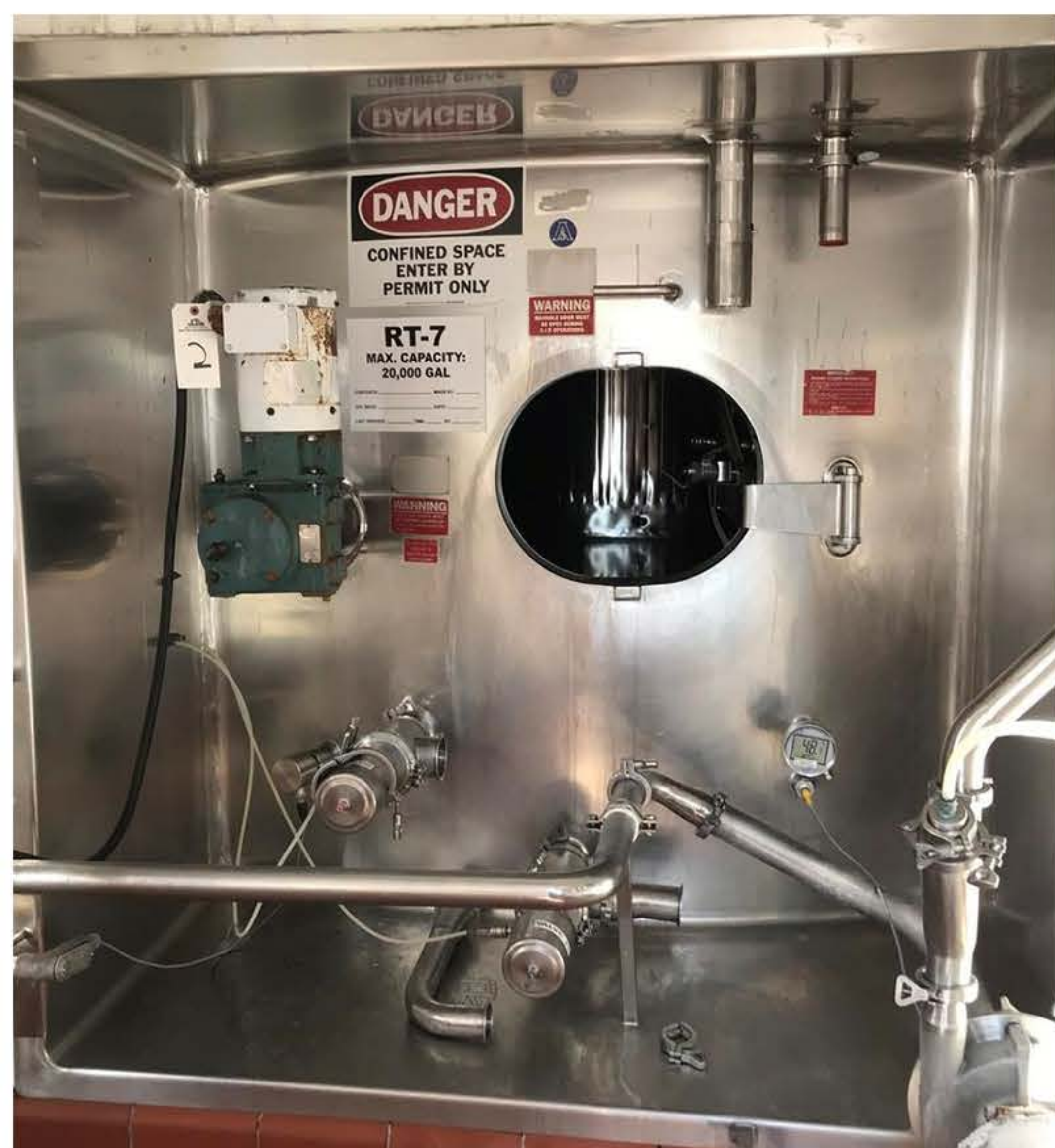
WALKER 20,000 GALLON SILO, AMMONIA JACKET