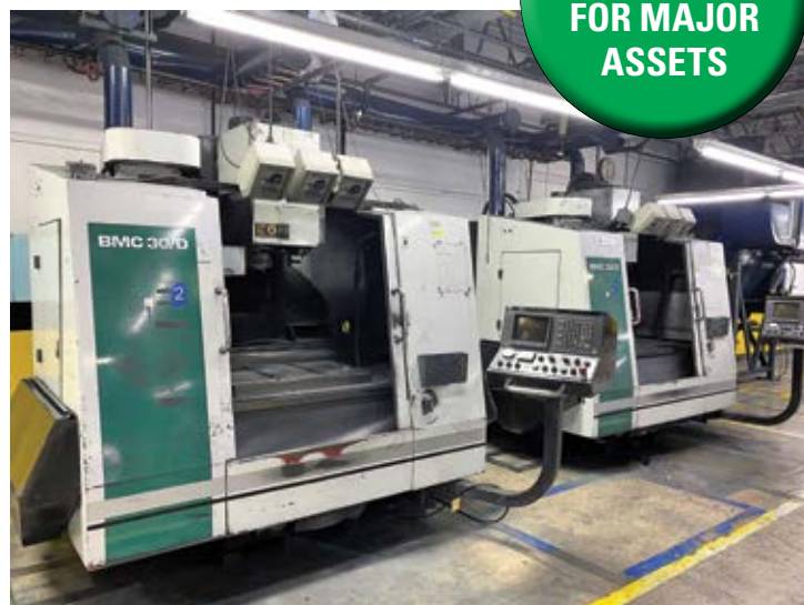
2 OF 3 HURCO BMC VMC