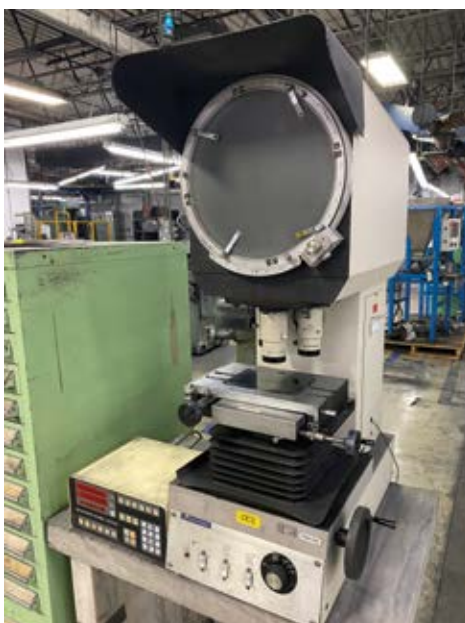
TAYLOR HOBSON TH-300 PROFILE PROJECTOR