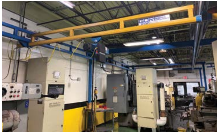
GORBEL CRANE SYSTEM