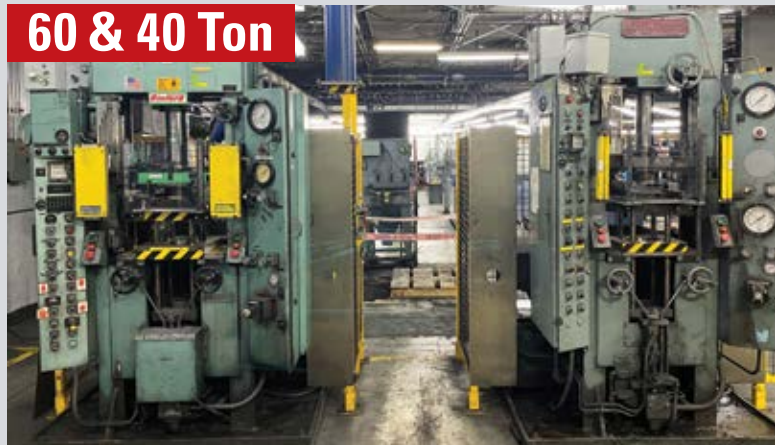
(2) ALPHA COMPACTING PRESSES