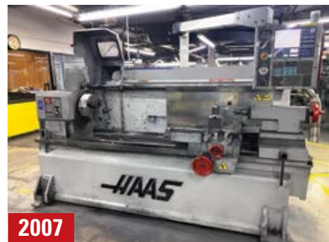
HAAS SL-20 CNC TURNING CENTER