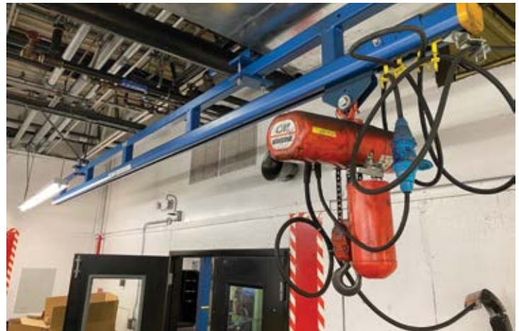
GORBEL MONORAIL HOIST SYSTEM

CM LODESTAR ½ Ton Hoist , w/ Approx. 15' Monorail