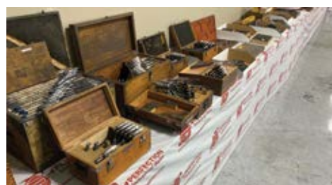
VIEW OF OUTSIDE MICROMETERS