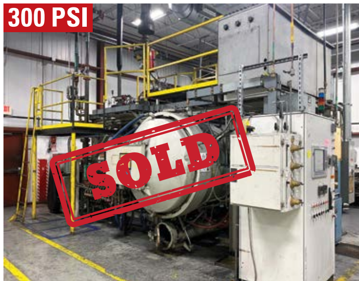
ULTRA TEMP SINTER HIP FURNACE