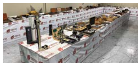
HUGE INSPECTION AREA