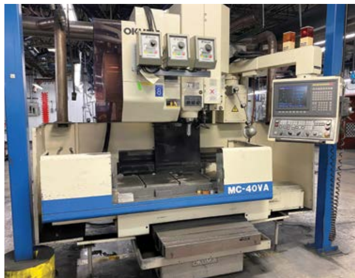
OKUMA MC-40VA CNC VMC