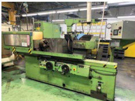
KARSTENS K 20-22 OD GRINDER