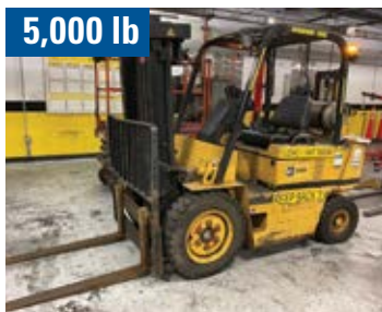
CATERPILLAR V50F LPG FORKLIFT