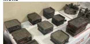
COMPOUND SINES AND MORE

To discuss your requirements for an auction, please call Perfection Industrial at +1-847-545-6374