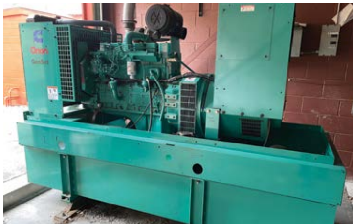
CUMMINS 80DGDA GENERATOR