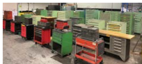
VIDMARS AND TOOL CHESTS