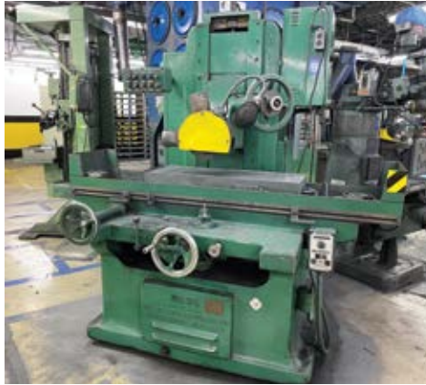
GALLMEYER & LIVINGSTON NO. 55 SURFACE GRINDER