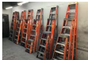
LARGE SELECTION OF FIBERGLASS LADDERS