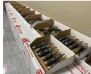
LARGE SELECTION OF CT40 TOOLING