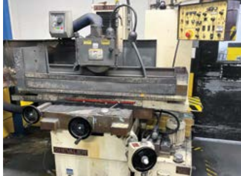
CHEVALIER FSG-3A1020 SURFACE GRINDER