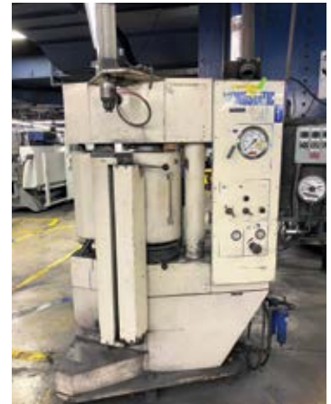
SIMAC MONOSTATIC 200E POWDER PRESS