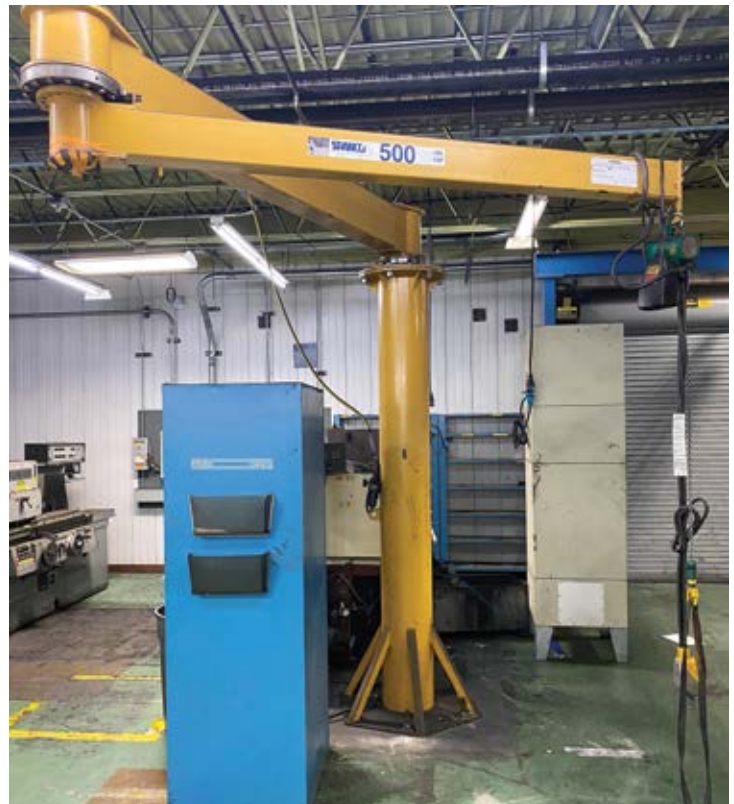
SPANCO SWIVEL ARM FREE STANDING JIB CRANE