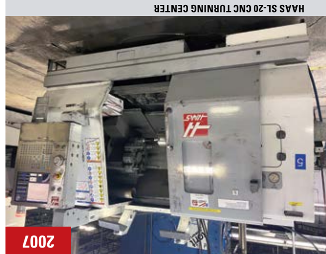
HAAS SL-20 CNC TURNING CENTER

PRESORTED FIRST-CLASS U.S. POSTAGE PAID PALATINE, IL P & DC PERMIT NO. 7133