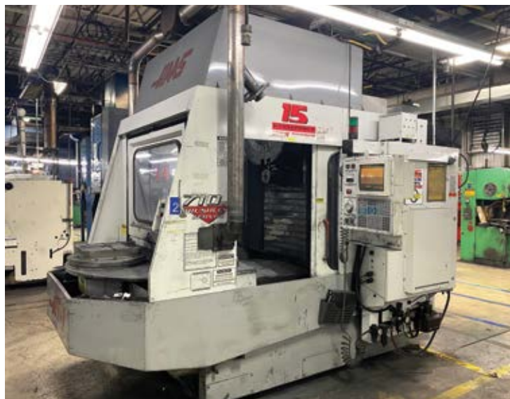
HAAS HS-1 CNC HMC