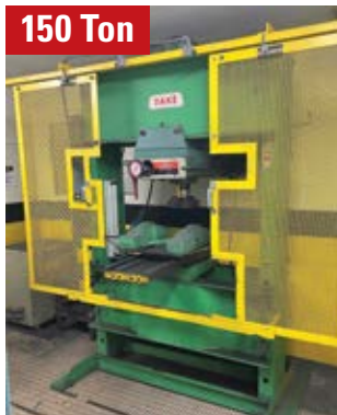
DAKE 5-150 HYDRAULIC PRESS