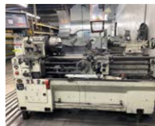
YAM 1440 LATHE