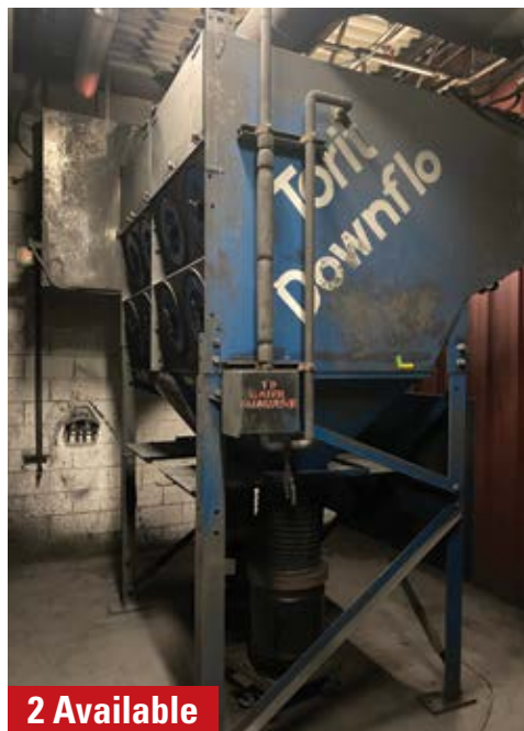
DONALDSON TORIT 2DF4 DUST COLLECTION SYSTEMS