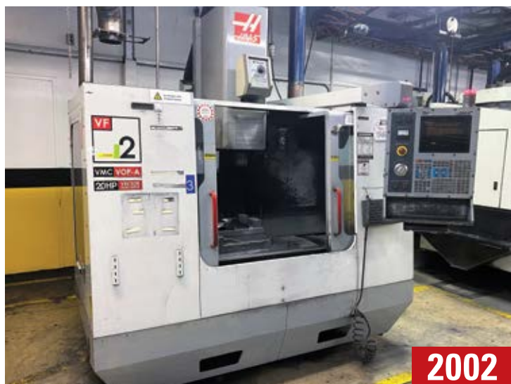
HAAS VF-2D VMC

PRE-AUCTION OFFERS INVITED FOR MAJOR ASSETS