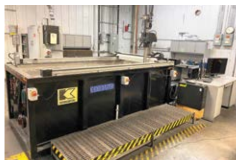
ULTRASONIC WASH TANK SYSTEM