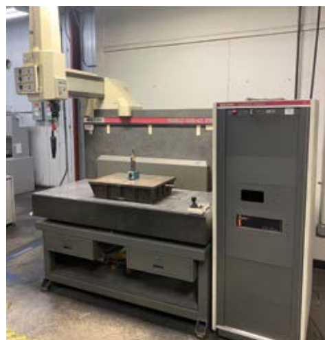
SHEFFIELD CORDAX 1808-MZ DCC MEA CMM