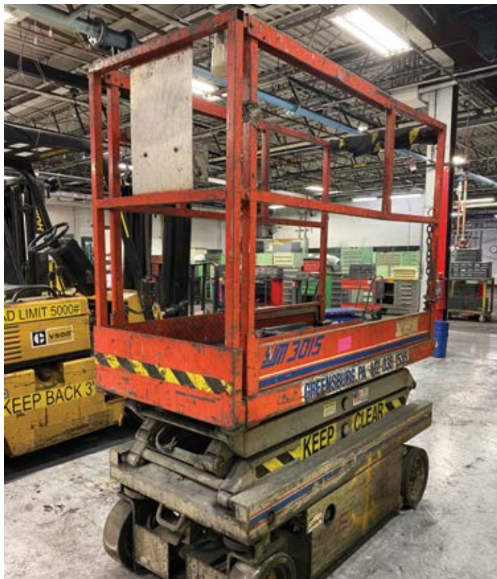
SKYJACK SJM 3015 SCISSOR MAN LIFT