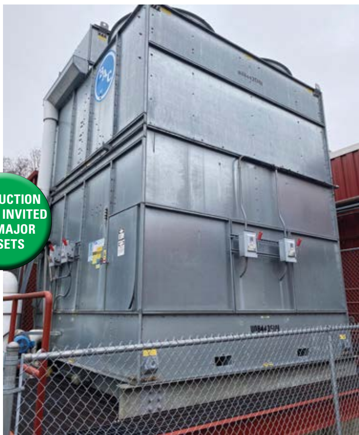
BAC FXV-643-20M COOLING TOWER

PRE-AUCTION OFFERS INVITED FOR MAJOR ASSETS