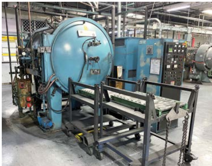
CENTORR 18X24X36 3700 SERIES VACUUM FURNACE