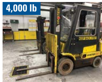
HYSTER H40XMS LPG FORKLIFT