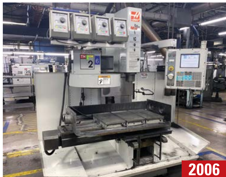
HAAS TM-2 CNC TOOLROOM MILL