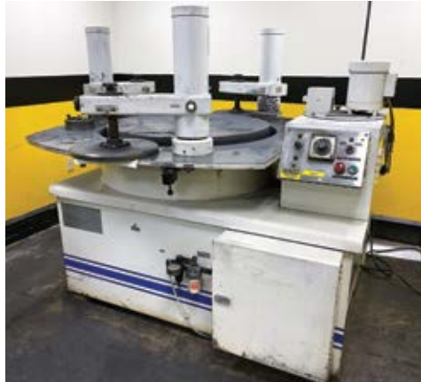
KAYEC GYR03-36PNLC SPITFIRE LAPPING MACHINE