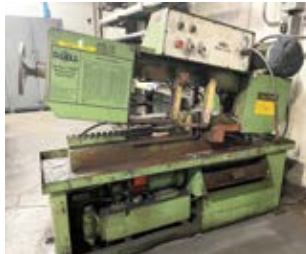
DOALL C-912M HORIZONTAL BANDSAW