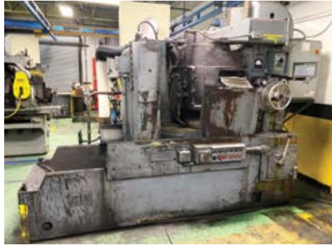
BLANCHARD NO. 20 ROTARY SURFACE GRINDER