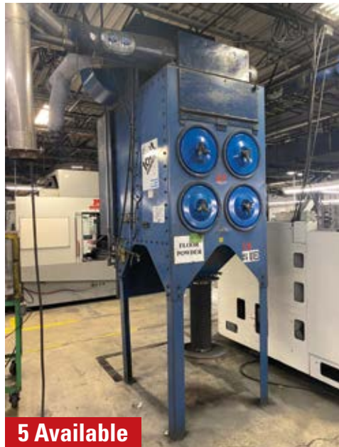
DONALDSON TORIT 2DF8 DUST COLLECTION SYSTEMS