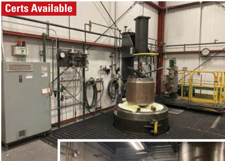
AVURE 23" COLD ISOSTATIC PRESS