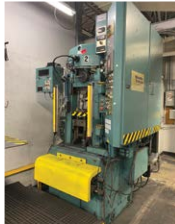
MANNESMANN MPM 15 16 TON POWDER COMPACTING PRESS