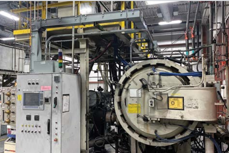
HOLCROFT SINTER HIP FURNACE

(1,000) Total Lots, Featuring: (2) Sinter HIP Furnaces, Vacuum Furnace, (3) Cold Isostatic Presses (CIP), Hydraulic Powder Compaction Presses, Loomis 120 Ton Extrusion Press, CNC & Conventional Machine Tools, Grinders, Material Handling, Forklifts, Rolling Stock & Factory Support