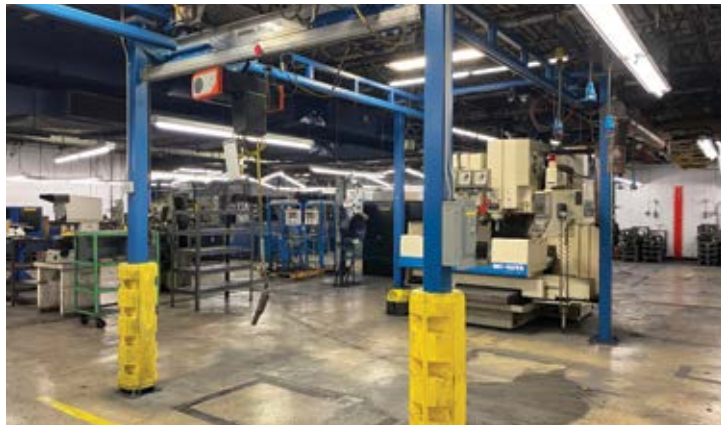
GORBEL 1-TON FREE STANDING CRANE SYSTEM