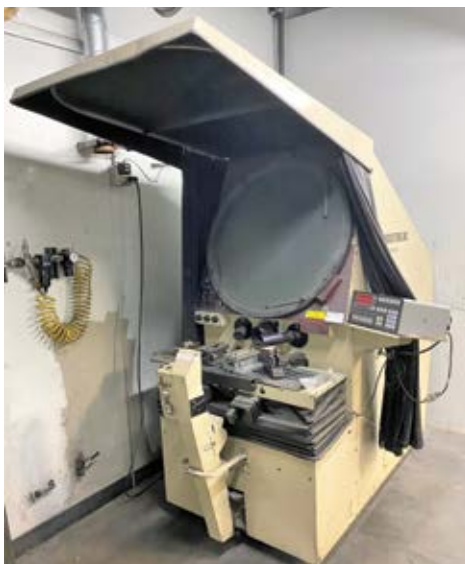
ST INDUSTRIES 22-2601 OPTICAL COMPARATOR

Huge Selection of Inspection Equipment Including Height Gages, Calipers, Outside Micrometers, Inside Micrometers, Snap Gages, Bore Gages, Light Sources, Microscopes, Sine Plates and More