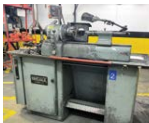
HARDINGE DV59 SUPER-PRECISION LATHE