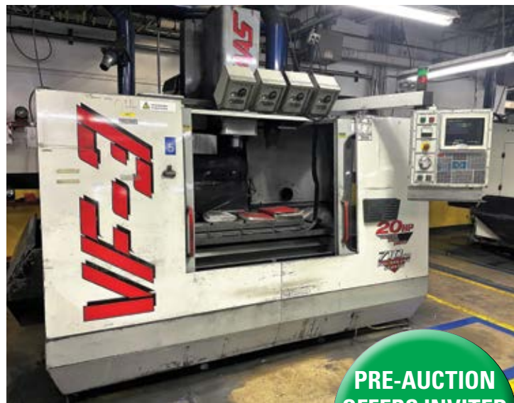
HAAS VF3 CNC VMC

PRE-AUCTION OFFERS INVITED FOR MAJOR ASSETS