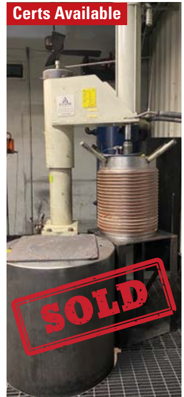
AVURE 20" COLD ISOSTATIC PRESS