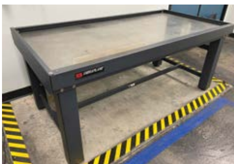
KINETIC SYSTEM 1202-24-12 VIBRAPLANE TABLE