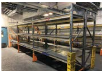
LARGE SELECTION OF PALLET RACKING

QUINCY 350 10 HP Air Compressor, s/n 403376