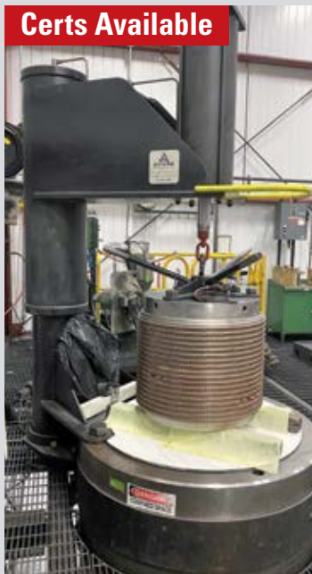
AVURE 23" COLD ISOSTATIC PRESS