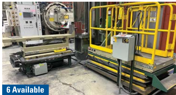
SOUTHWORTH LIFT TABLE