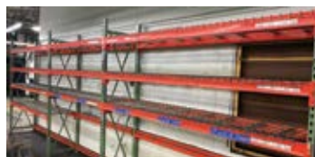
LARGE SELECTION OF PALLET RACKING