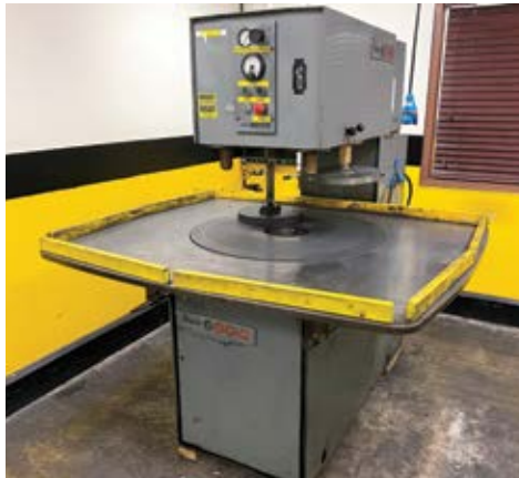
SPEEDFAM 32BTAW LAPPING MACHINE