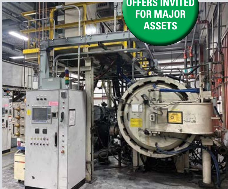
HOLCROFT SINTER HIP FURNACE