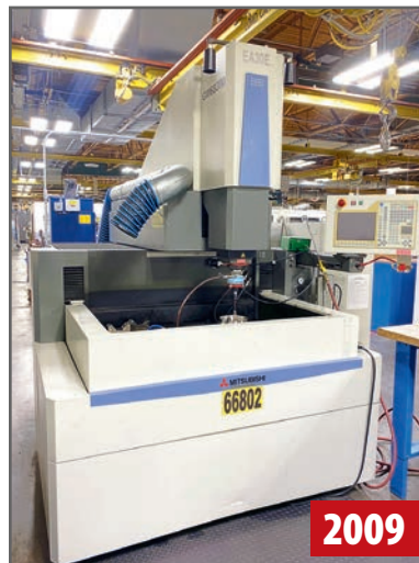
MITSUBISHI EA30E RAM TYPE EDM

1980 MARVEL SERIES 8 VERTICAL BANDSAW , s/n 821237