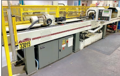
2001 SUNNEN STH-2000 LAEM HORIZONTAL HONING MACHINE