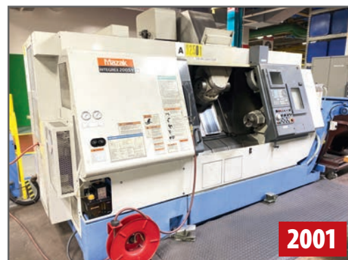
MAZAK INTEGREX 200SY CNC TURNING/MILLING CENTER

2001 MAZAK INTEGREX 300SY CNC TURNING/MILLING CENTER , s/n 157499, w/MAZATROL PC Fusion 640 MT Control, (2) 12" 3-Jaw Chucks, 48" CC, Tool Eye, KM63 Taper, 40 ATC