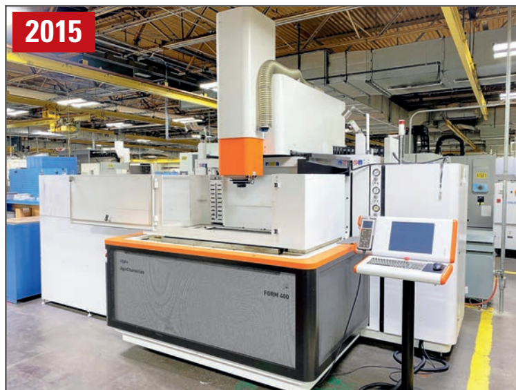
AGIE CHARMILLES FORM 400 RAM TYPE EDM