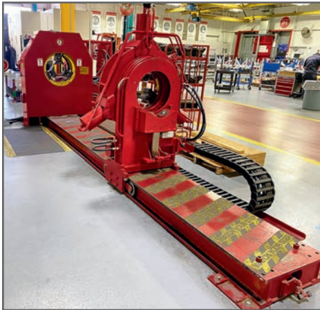
WEATHERFORD CAM F 13.375 BUCKING/ BREAKOUT MACHINE