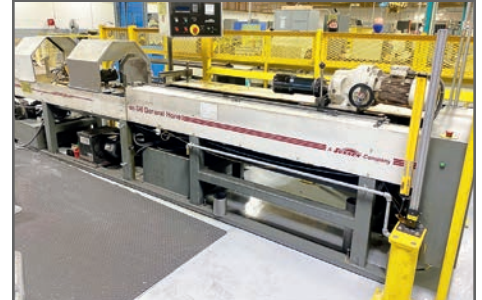
SUNNEN HL-1502-E HORIZONTAL HONING MACHINE