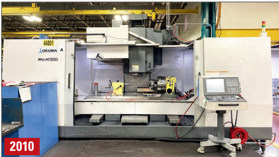
OKUMA MILLAC 852V 4-AXIS VERTICAL MACHINING CENTER