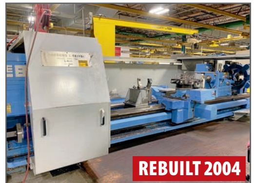
MAZAK POWER MASTER N CNC LATHE