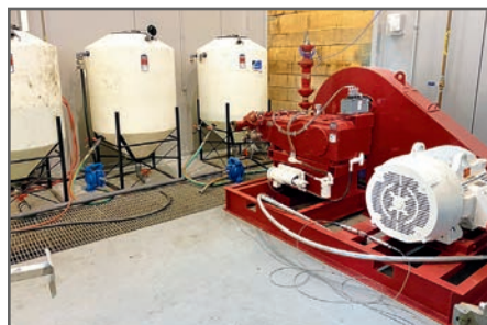
KERR FLOW TEST SYSTEM