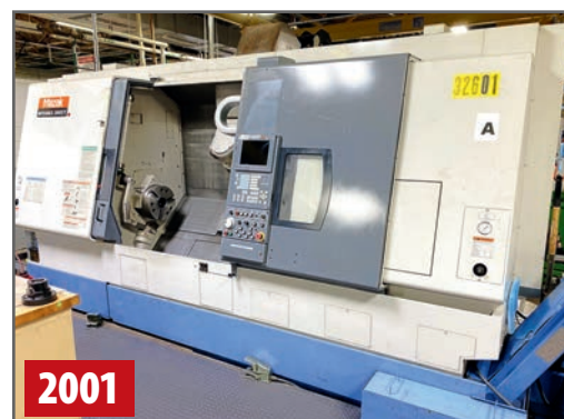
MAZAK INTEGREX 300SY CNC TURNING/MILLING CENTER