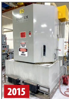
2015 VORTEX WASHER