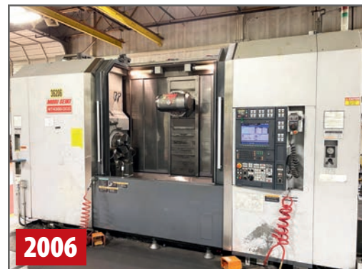
MORI SEIKI NT4300 DCG CNC TURNING/MILLING CENTER

2006 MORI SEIKI NT4300 DCG CNC TURNING/MILLING CENTER , s/n NT430FH0014, MSX-711 III Control, 12" 3-Jaw Chuck, 62" Max. Length, Steady, 100 ATC, Capto C6 Taper, COOLJET Coolant System