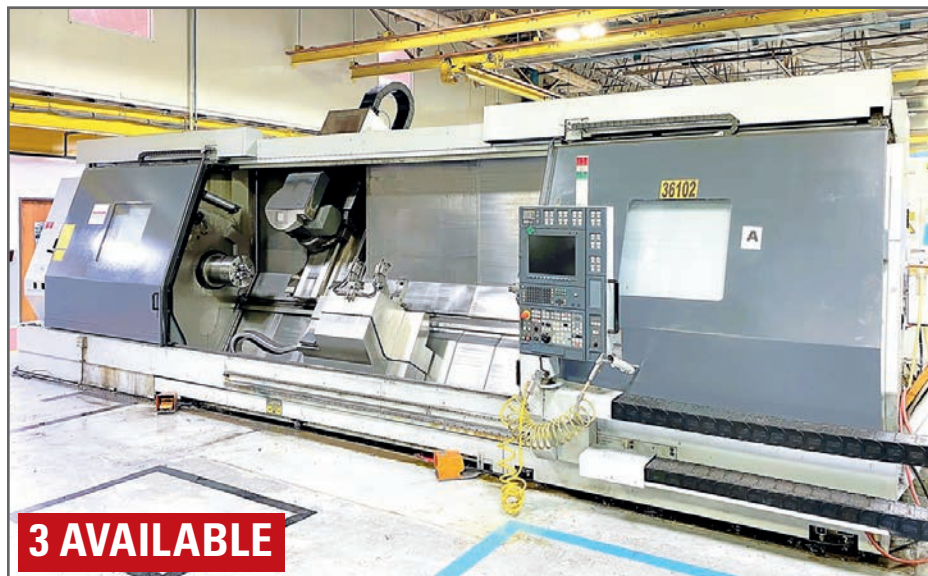
2005 MORI SEIKI MT3500S/3500 CNC TURNING/MILLING CENTER