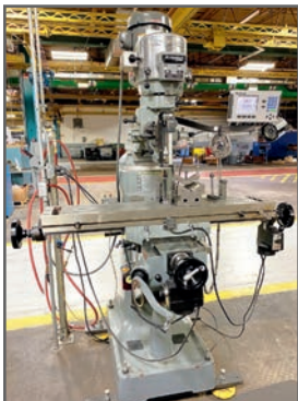
BRIDGEPORT SERIES I VERTICAL MILL