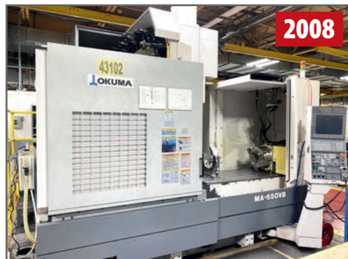
OKUMA MA650VB 4-AXIS VERTICAL MACHINING CENTER

SALE DATE: Tuesday, December 8 at 10:00 AM CT