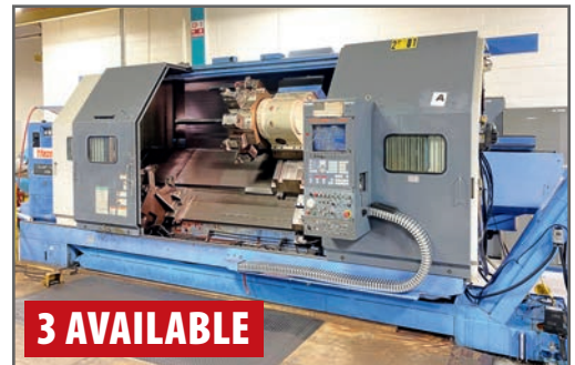
MAZAK ST50N TURNING CENTER