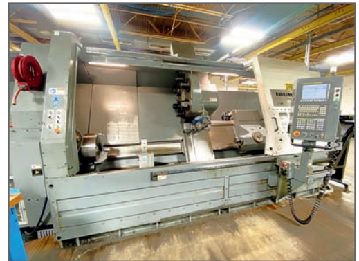
2013 BARDONS & OLIVER/CINCINNATI 18U TURNING CENTER