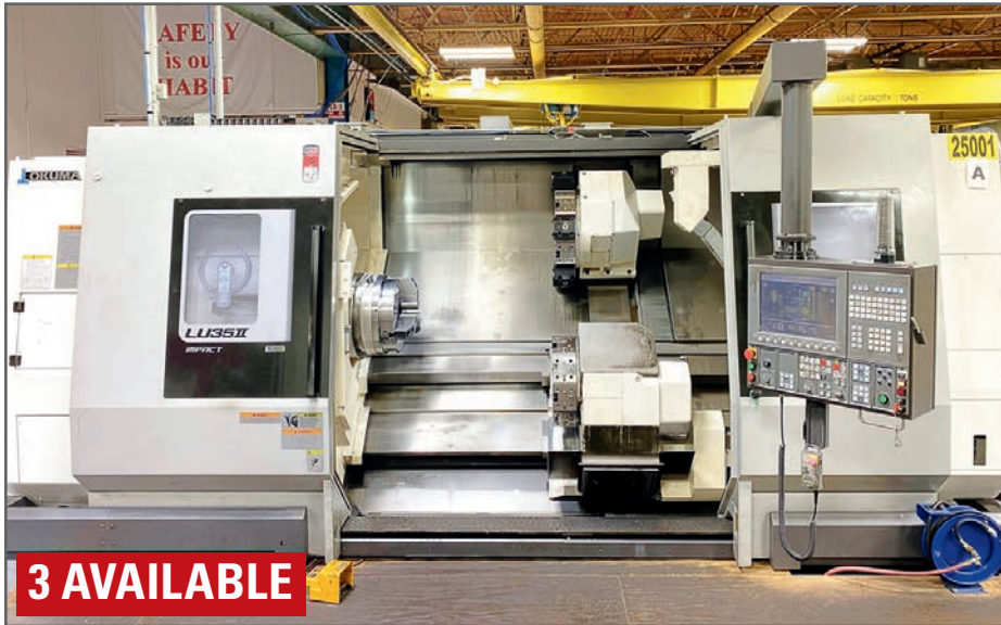
2015 OKUMA LU35II ST1500 TURNING CENTERS