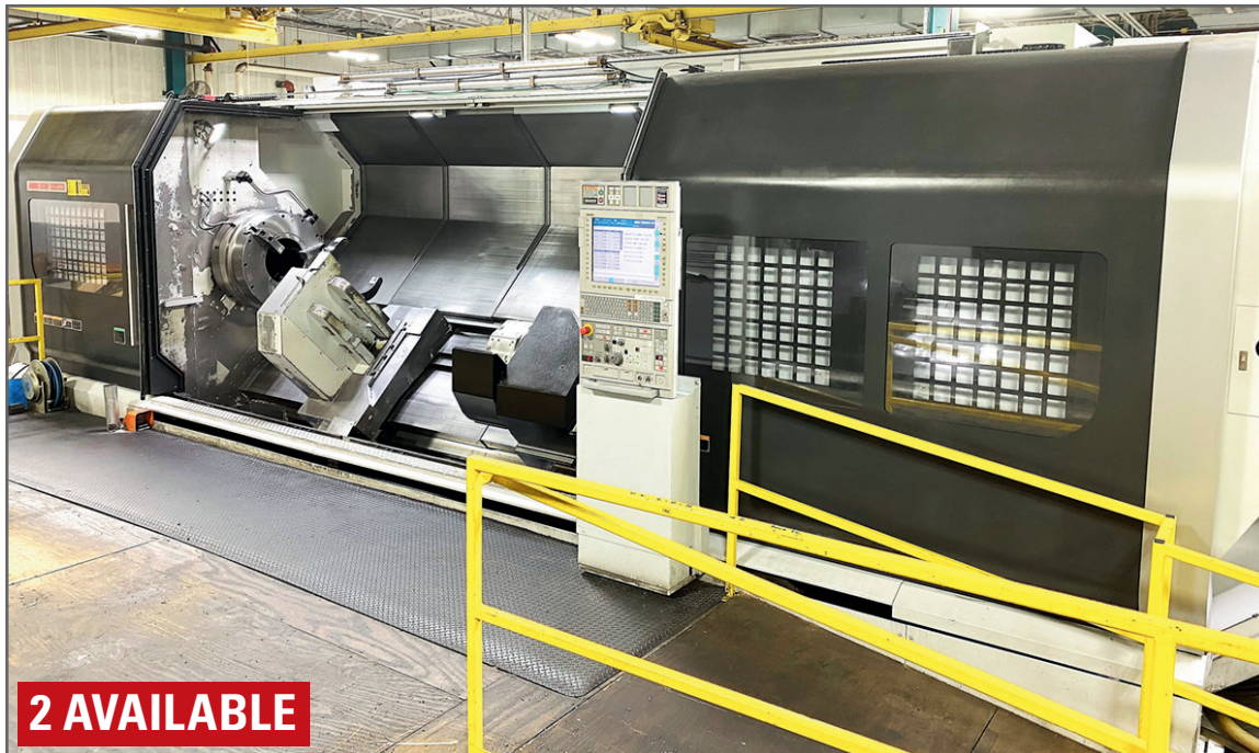
2010 MORI SEIKI NZL6000BY/4000 CNC TURNING CENTER