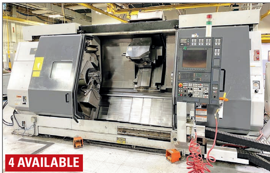
2006 MORI SEIKI MT2500S/1500 CNC TURNING/MILLING CENTER