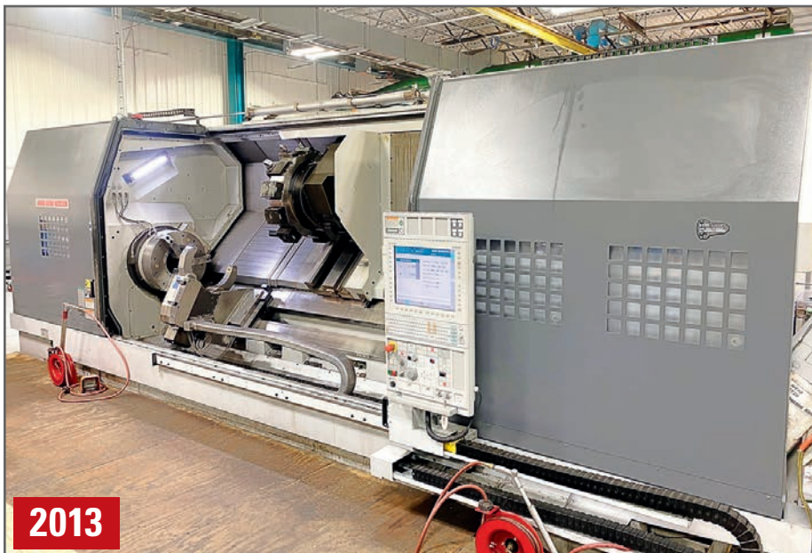
MORI SEIKI SL603C/3000 TURNING CENTER

(3) MAZAK ST50N TURNING CENTERS, s/n 137422, 132344, NA, w/MAZATROL T PLUS Control