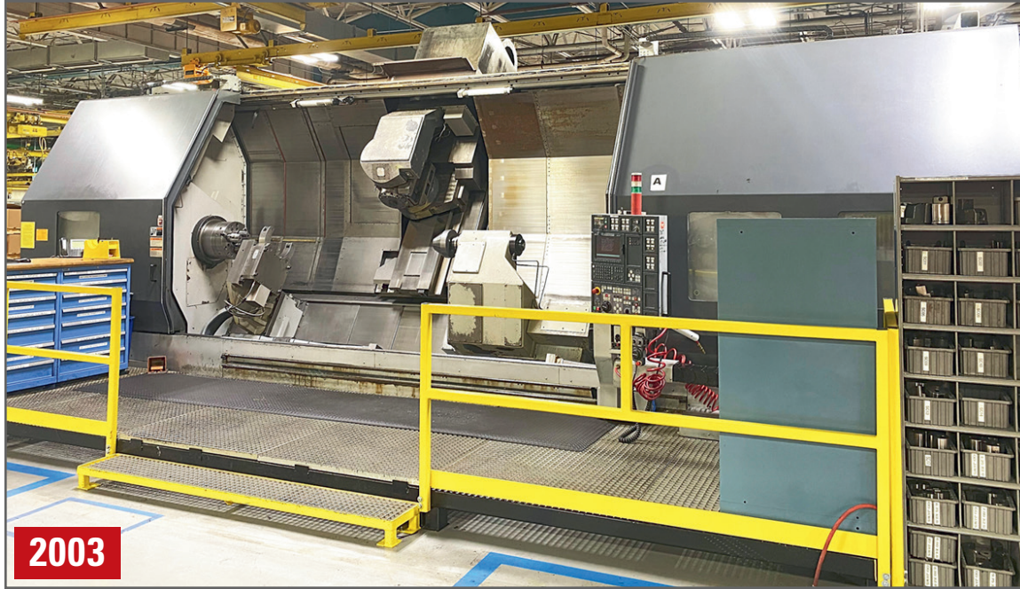
2003 MORI SEIKI MT4000B/4000 CNC TURNING/MILLING CENTER