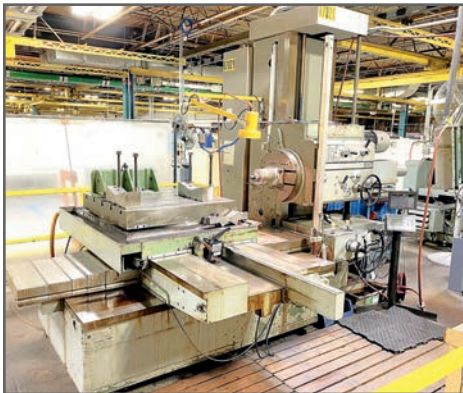
KEARNS RICHARDS SH75 TABLE TYPE HORIZONTAL BORING MILL