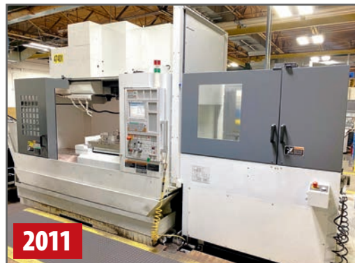
MORI SEIKI NV5000 TWIN PALLET VERTICAL MACHINING CENTER