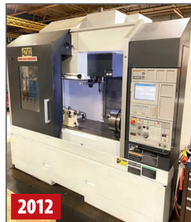
MORI SEIKI DURA VERTICAL 5100 4-AXIS VERTICAL MACHINING CENTER

(2) MAKINO FNC-106 4-AXIS VERTICAL MACHINING CENTERS , s/n LM-353, LM-352, w/FANUC OM Control, 24" x 55" Table, X-41", Y-23", Z-22", 30 ATC, Cat 40 Spindle, RENISHAW Probe, TSUDAKOMA 4th Axis w/Tailstock