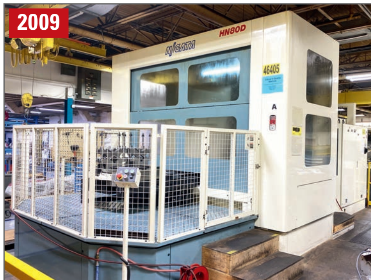
NIIGATA HN80D HORIZONTAL MACHINING CENTER