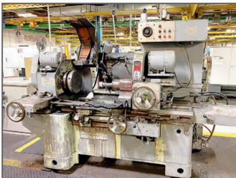
CINCINNATI MILACRON/HEALD 273A INTERNAL GRINDER

2015 VORTEX WASHER , s/n 1109, w/SIEMENS PLC Control, 72" Dia. Table, 64" Max. Height, 20 HP Pump, Gas Heat, Skimmer