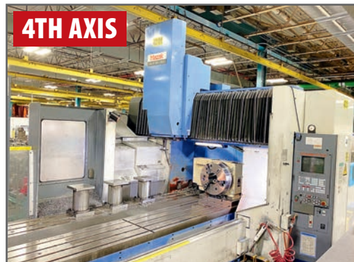
MAZAK AJV60/160 4-AXIS VERTICAL MACHINING CENTER