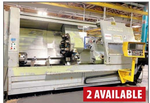
CINCINNATI MILACRON 15U TURNING CENTER

Pre-Auction Offers Invited on Major Assets