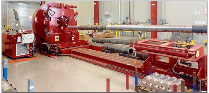
AMC ENGINEERING TR30:150 TO BUCKING/ BREAKOUT MACHINE