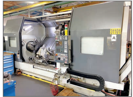
2003 MORI SEIKI SL603B/2000 TURNING CENTER