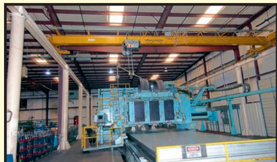
PROSERV ANCHOR 5 T. X 39'-6" FREE STANDING BRIDGE CRANE SYSTEM

PNEU. NAIL GUNS; BATTERY OPERATED DRILLS AND SAWS; RIGHT ANGLE GRINDERS; MILWAUKEE SAWZ-ALL; BOSCH HAMMER DRILL; MILWAUKEE MAGNETIC BASE DRILL; 1" DRIVE HEAVY DUTY SOCKET SET; TAP AND DIE SETS; RIDGID PIPE WRENCHES up to 36"; RIDGID PIPE THREADERS; HAND PIPE THREADERS up to 2"; RIDGID TRI-STAND; PRTO TORQUE WRENCH; HUSKY TORQUE WRENCHES; UTICA TORQUE WRENCH; MORE.