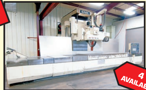
SNK MDL. FSP-120V 5-AXIS VERT. PROFILER