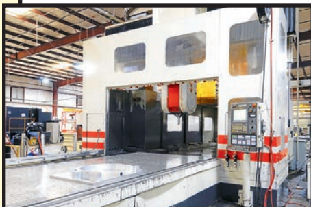
CLOSE UP VIEW OF SNK RB-200F

CINCINNATI MILACRON MDL. 30V , Siemens Acramatic 2100 CNC control, 60"W. x 130"L. t.b.l., 120" X, 60" Y, 29" Z-axis travels, \pm 25 deg. A and B-axis, CAT-50, 5,000 RPM, 30 HP, multi-function remote pendant.