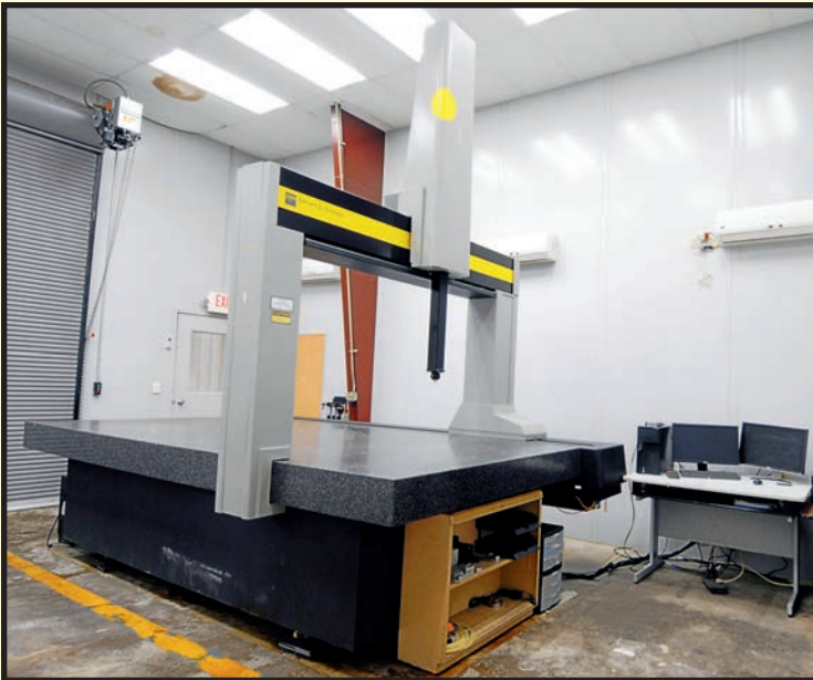
BROWN & SHARPE XCEL COORDINATE MEASURING MACHINE