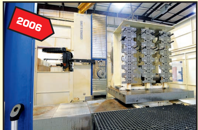
GIDDING & LEWIS MDL. RT1250 6-AXIS CNC HORIZ. BORING MILL