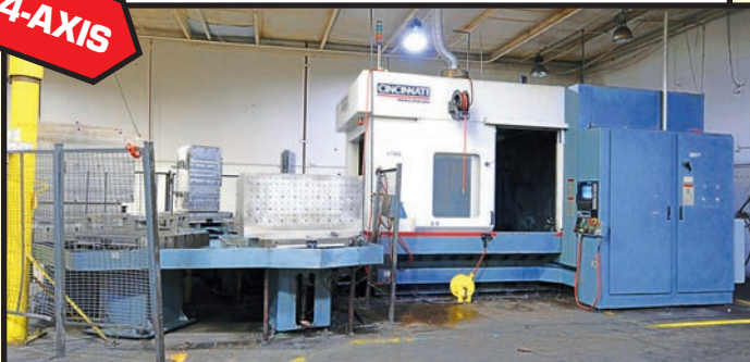
CINCINNATI MAGNUM MDL. 100 4- AXIS