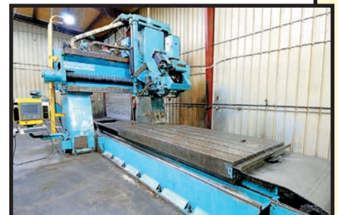
CINCINNATI MILACRON MDL. 30V