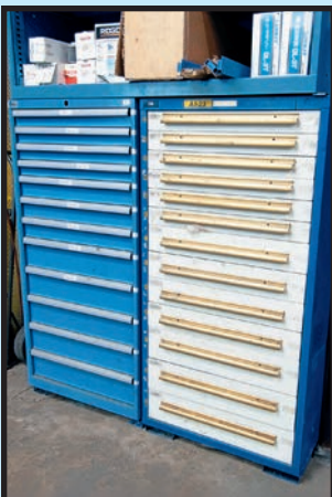
SAMPLE VIEW OF ROLLER DRAWER TOOL CABINETS