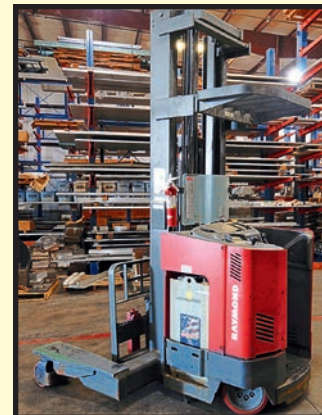
RAYMOND MDL. EASI-4D-R45DT ELECTRIC REACH TRUCK