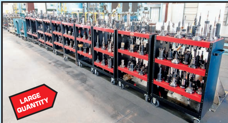
PARTIAL VIEW OF TAPER TOOLHOLDERS

ONLINE TIMED AUCTION • THURSDAY, JUNE 11 ONLINE BIDS START TO CLOSE AT 10:00 A.M.