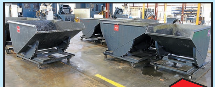
SAMPLE VIEW OF SELF DUMPING HOPPERS

On-Site Bidding in Euless, Texas or Bid Via Webcast at BidSpotter.com