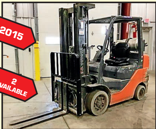
TOYOTA 6,000-LB. CAP. LPG FORKLIFT