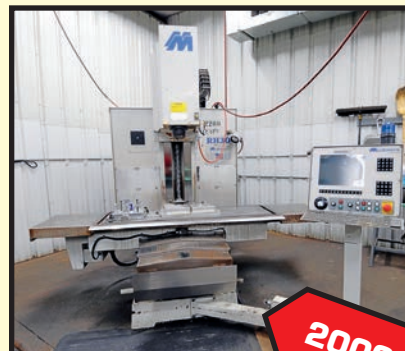
MILLTRONICS MDL. RH30