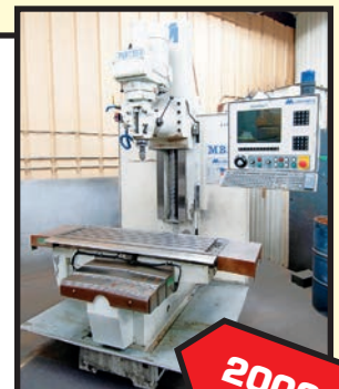
MILLTRONICS MDL. MB20