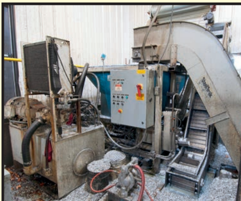
APPLIED RECOVERY SYSTEMS ALUMINUM PUCKMASTER