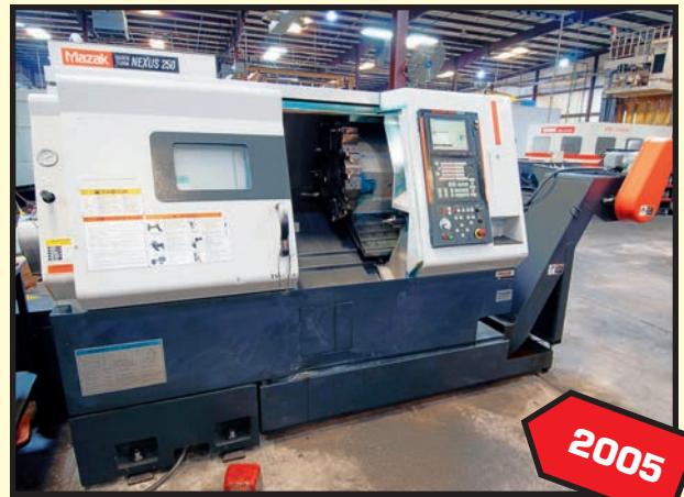
MAZAK MDL. QUICK TURN NEXUS 250 CNC LATHE