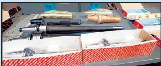
JEWELL GROUP EXTENDED BORING TOOLS