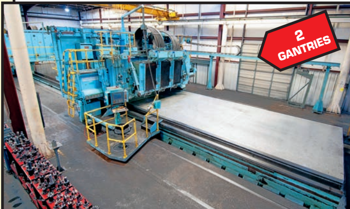
CINCINNATI 6-SPINDLE TWIN GANTRY

CINCINNATI MILACRON MDL. 30V RAIL , Siemens Acramatic 950 CNC control, 70"W. x 624"L. tbl., 624" X, 79" Y, 29" Z-axis travels, ±25 deg. A and B-axis, CAT-50, 5,000 RPM, 50 HP, 70"W. x 185"L. drilled and tapped aluminum sub-plate, S/N 3239E0194-0003.