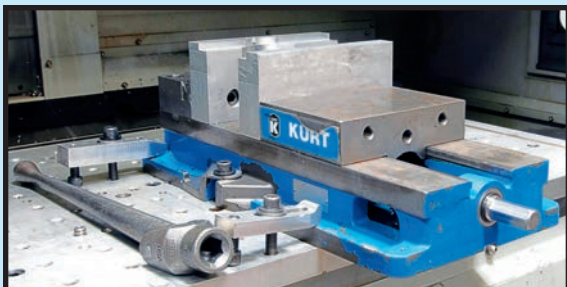
SAMPLE VIEW OF KURT MILLING VISES