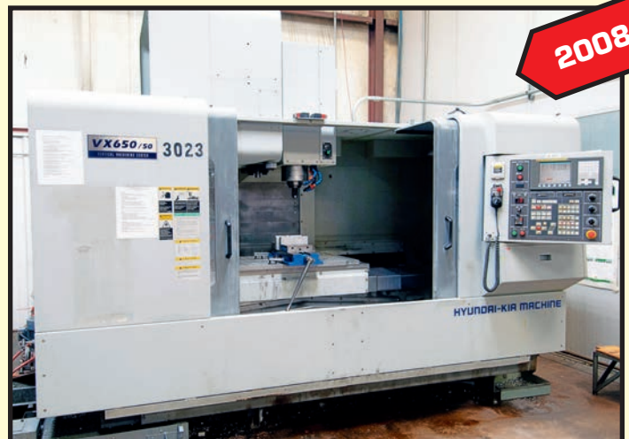
HYUNDAI-KIA MDL. VX650/50 CNC VERT. MACHINING CENTER