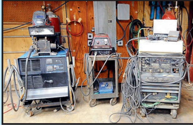
SAMPLE VIEW OF LINCOLN AND MILLER WELDING AND CUTTING MACHINES