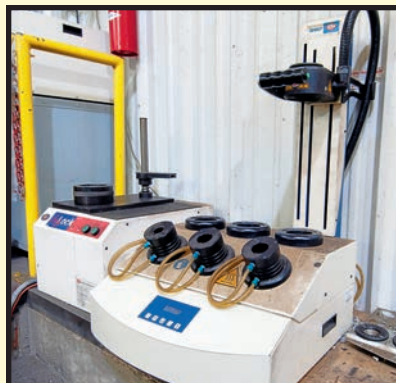
ISCAR HEAT SHRINK TOOL SYSTEM AND ETM EZ-LOCK TOOLHOLDER CLAMPING SYSTEM