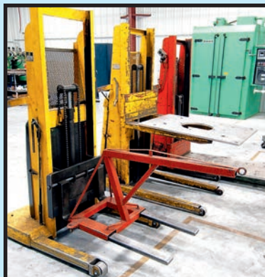
BIG JOE ELECTRIC DIE LIFTS