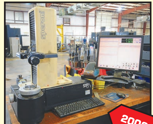
SPERONI MDL. STP34 TOOL PRESETTER