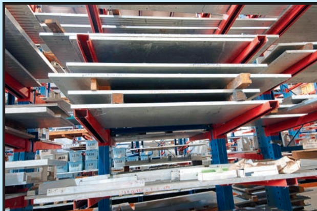
SAMPLE VIEW OF RAW MATERIAL