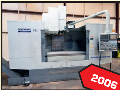
HYUNDAI-KIA MDL. VX750MH CNC VERT. MACHINING CENTER