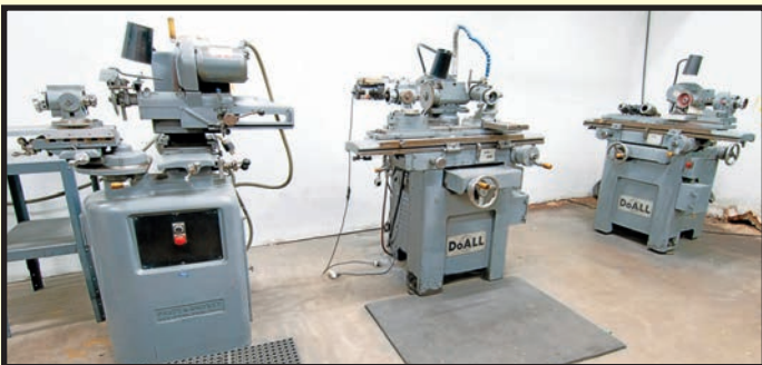
PARTIAL VIEW OF TOOL CUTTER AND GRINDER