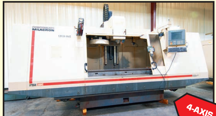
CINCINNATI MILACRON MDL. SABER 2000 4-AXIS CNC VERT. MACHINING CENTER

HYUNDAI-KIA MDL. VX750MH , new 2006, Fanuc Series 18i-MB CNC control, 70.9" x 27.6" tbl., 4,409-lb. tbl. load, 61" X, 29.5" Y, 28.3" Z-axis travels, CAT-50, 12,000 RPM, 25 HP spindle drive motor, Mdl. PF30-20SF hi-pressure thru spindle coolant system, 30-pos. ATC, drilled and tapped aluminum subplate, S/N VX750MH0005.