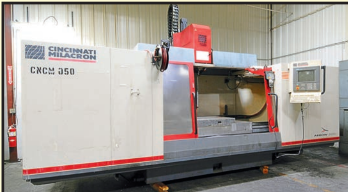
CINCINNATI MILACRON MDL. ARROW 2000 CNC VERT. MACHINING CENTER

CINCINNATI MILACRON MDL. SABER 2000 4-AXIS , Siemens Acramatic 2100 CNC control retrofit, 30" x 90" tbl., 6,615-lb. tbl. load, 80" X, 30" Y, 30" Z-axis travels, CAT-40, 8,000 RPM, 15 HP, 20 ATC, drilled and tapped subplate, S/N 7044A0B970082.