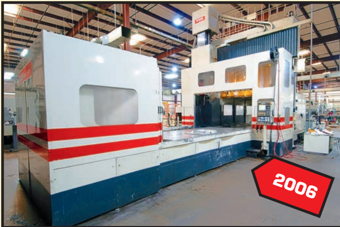
SNK MDL. RB-200F 5-AXIS DOUBLE COLUMN VERT. PROFILER

Monday & Tuesday June 8 & 9, 9:00 A.M. to 4:00 P.M.