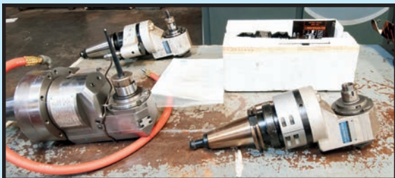
SAMPLE VIEW OF CAT-50 RIGHT ANGLE HEADS