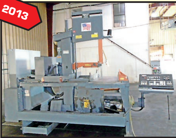
HEM MDL. V140HM-60 TILT FRAME VERT. BANDSAW