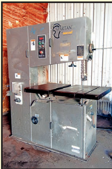
MARVEL SPARTAN MDL. S36V VERT. BANDSAW

COSEN AUTOMATIC HORIZONTAL BANDSAW , 12" dia. cap., auto. feed.