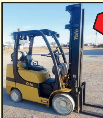
YALE 7,000-LB. CAP. LPG FORKLIFT