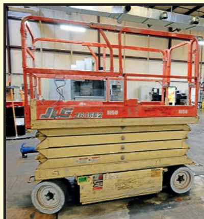
JLG MDL. 2646E2 SCISSOR LIFT