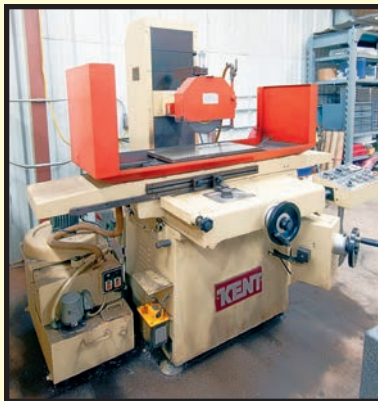
KENT 12" X 24" MDL. KGS-306AHD SURFACE GRINDER