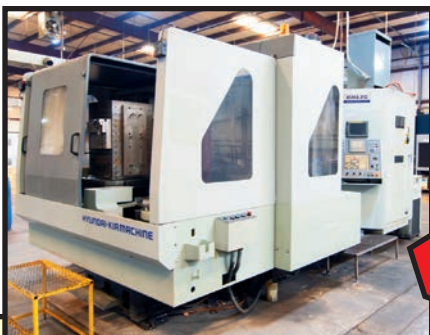
HYUNDAI-KIA MDL. KH63G

HYUNDAI-KIA MDL. KH63G , new 2006, Fanuc Series 18i-MB CNC control, 25" x 25" pallet size, 360 deg. tbl. indexing, 2,200-lb. tbl. load, 37.4" X-axis travel, 32.5" Y-axis travel, 30" Z-axis travel, CAT-50 spdl. taper, spds.: 20–4,500 RPM, 30 HP spdl. drive motor, 60-pos. ATC, CoolJet hi-pressure thru spdl. coolant system, S/N KH630416.