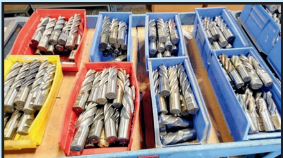
SAMPLE VIEW OF ENDMILLS

At the Premises of H.M. DUNN COMPANY 3301 HOUSE ANDERSON RD., EULESS, TEXAS 76040 Wearing Masks & Social Distancing Are Required