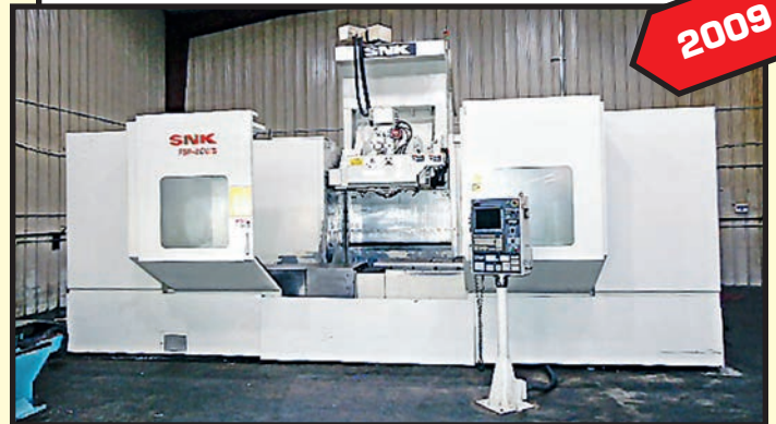
SNK MDL. FSP80V

SNK MDL. FSP80V , new 2009, Fanuc 31i-A5 CNC control, 31.5" x 78.7" tbl., 8,800-lb. tbl. load., 90.55" X, 49.21" Y, 27.55" Z-axis travels, ±30 deg. A and B-axis, CAT-50, spdl. spds.: 20–4,000 RPM, 22 kW spdl. motor S/N 453229.