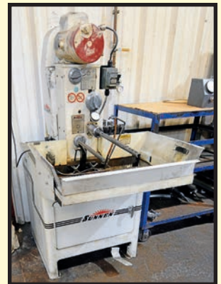
K.O. LEE MDL. B8900 TOOL CUTTER AND GRINDER