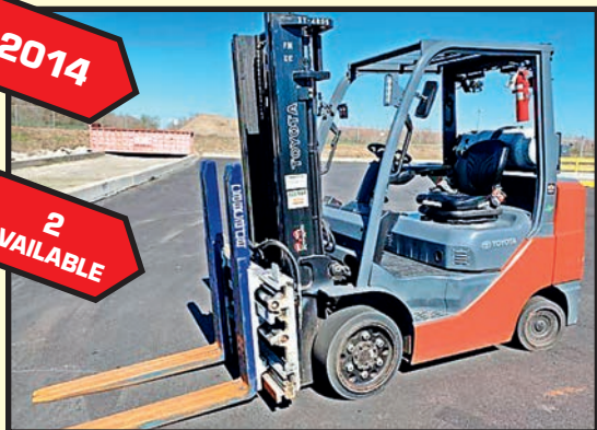
TOYOTA 7,000-LB. CAP. LPG FORKLIFT