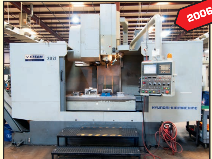
HYUNDAI-KIA MDL. VX750M CNC VERT. MACHINING CENTER