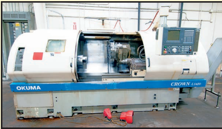
OKUMA CROWN MDL. L1420 CNC LATHE