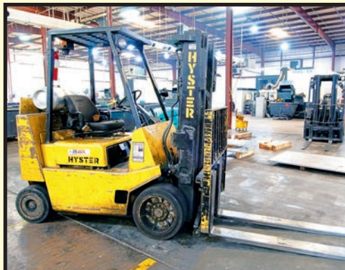
HYSTER 8,000-LB. CAP. LPG FORKLIFT