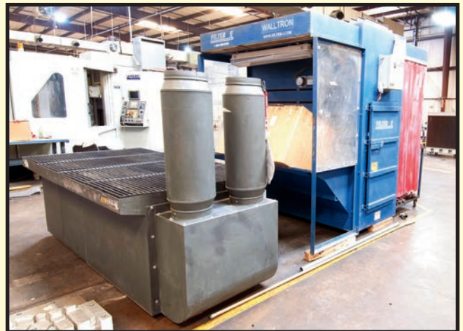
DIVERSITECH DOWNDRAFT TABLE AND FILTER 1 WALTRON FILTER WALL