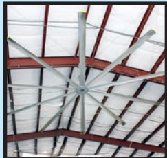
BIG ASS FAN