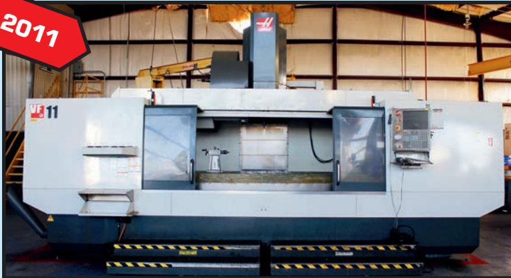
HAAS MDL. VF-11/50 4-AXIS VERT. MACHINING CENTER