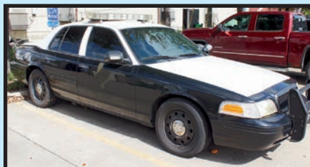
SAMPLE VIEW OF POLICE CRUISER