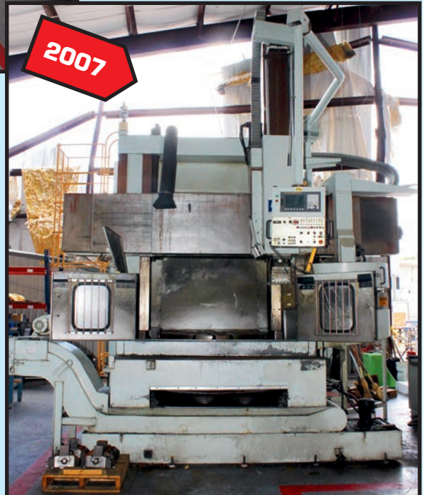
FEMCO MDL. WVL-12 CNC VERT. BORING MILL