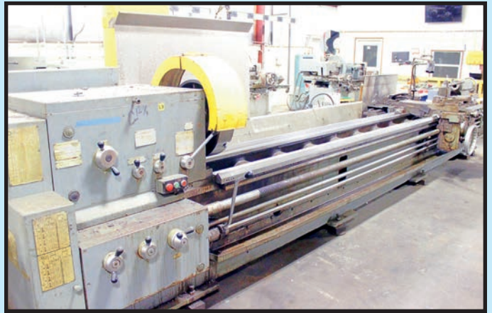
RYAZAN 27" x 196" MDL. 1M63H-5 ENGINE LATHE