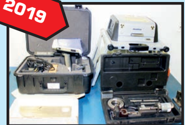
OLYMPUS VANTA MDL. VMR HAND HELD PORTABLE SPECTROMETER