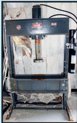
DAKE H-FRAME PRESS