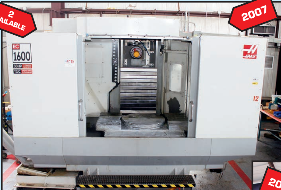
(1 OF 2) HAAS MDL. EC1600-4X HORIZ. MACHINING CENTERS