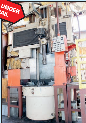
SPRINGFIELD MDL. 48AR UNIVERSAL VERT. GRINDING MACHINE