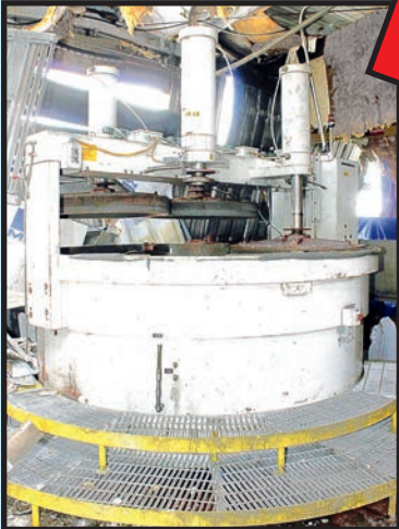
SPEEDFAM 96" HORIZ. LAPPING MACHINE