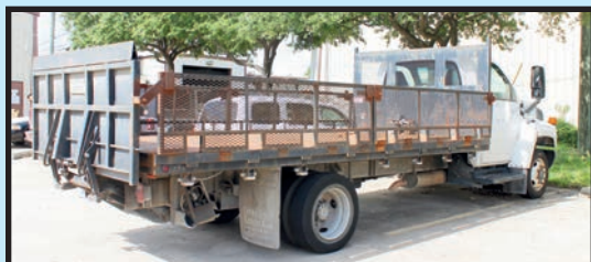
GMC MDL. C5500 1.5 T. CAP. FLATBED TRUCK