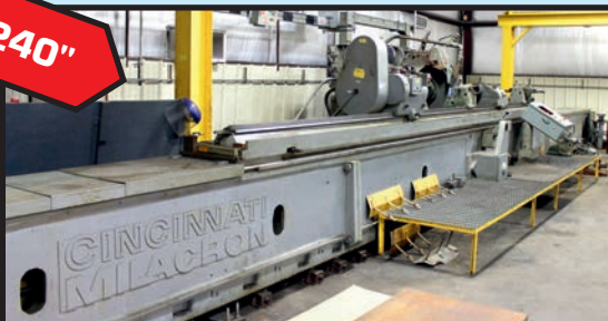
CINCINNATI 24" X 240" MDL. MH PLAIN MODIFIED ROLL GRINDER