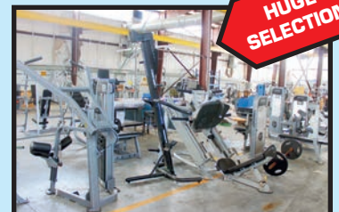
SAMPLE VIEW OF WORKOUT EQUIPMENT