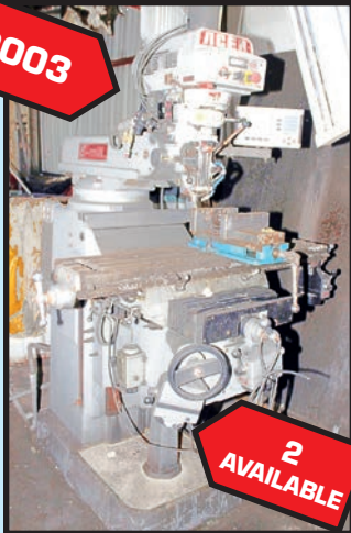
(1 OF 2) ACER E MILL MDL. EVS-3VKH VERT. TURRET MILLS