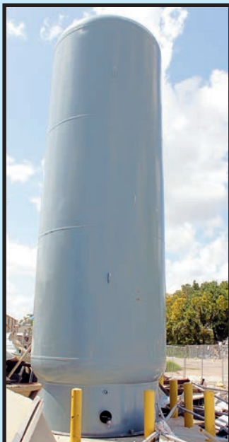
HUGE AIR RECEIVER