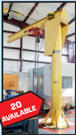
SAMPLE VIEW OF PEDESTAL JIB CRANES

WEDNESDAY, SEPTEMBER 2 10:00 A.M. LIVE ONLINE WEBCAST (NO ONSITE BIDDING)