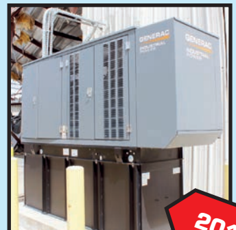
GENERAC IVECO MDL. SD100 BACKUP GENERATOR