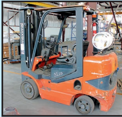
MAXIMAL 5,500-LB. CAP. MDL. 25M SERIES FORKLIFT