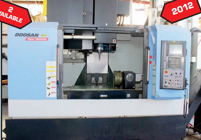
(1 OF 2) DOOSAN MYNX MDL. 5400/50 4-AXIS VERT. MACHINING CENTERS