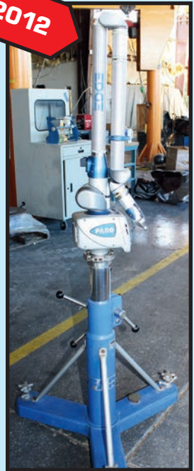
FARO EDGE MEASURING ARM