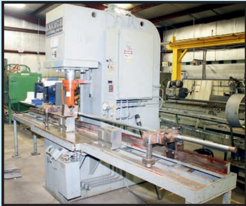
SAVAGE 60 T. CAP. MDL. 60CFS STRAIGHTENING PRESS