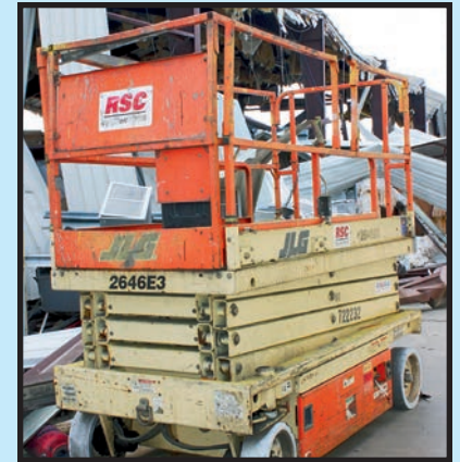
JLG MDL. 2646E3 SELF-PROPELLED SCISSOR LIFT

WEDNESDAY, SEPTEMBER 2 10:00 A.M. LIVE ONLINE WEBCAST (NO ONSITE BIDDING)