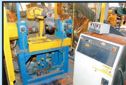
ROBOTIC BALL VALVE POLISHING MACHINE