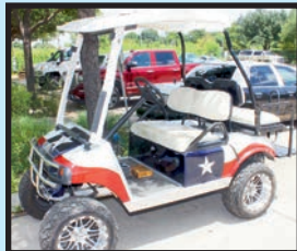
SEVERAL GOLF CARTS TO BE SOLD