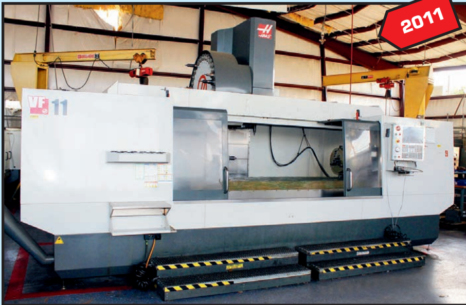
HAAS MDL. VF-11/50 4-AXIS VERT. MACHINING CENTER