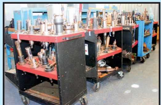
HUGE QUANTITY TOOLING