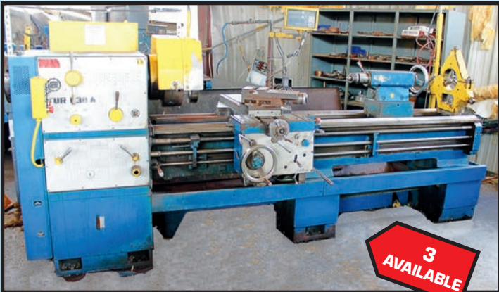
POLAMCO 22" X 120" MDL. TUR630A ENGINE LATHE