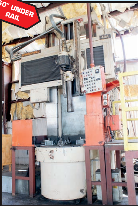
SPRINGFIELD MDL. 48AR UNIVERSAL VERT. GRINDING MACHINES