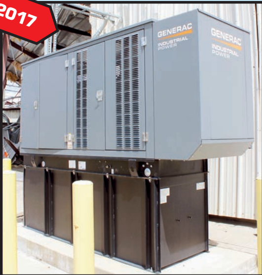
GENERAC IVECO MDL. SD100 BACKUP GENERATOR