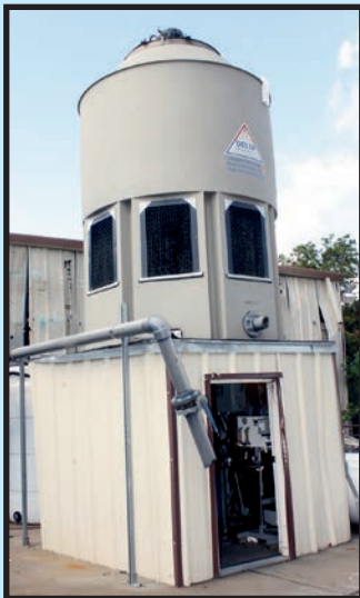
DELTA COOLING TOWER