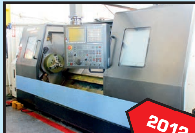
DOOSAN PUMA MDL. 400LB SLANT BED CNC LATHE