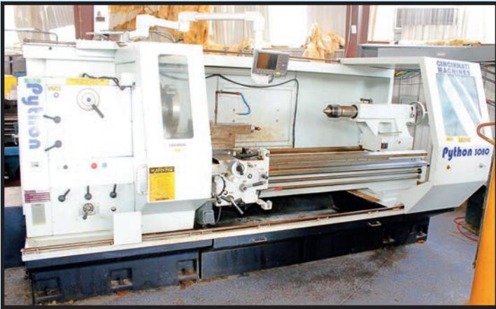
CINCINNATI 30" X 80" PYTHON MDL. 3080 ENGINE LATHE