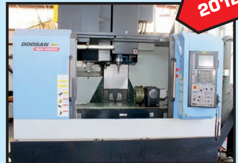
(1 OF 2) DOOSAN MYNX MDL. 5400/50 4-AXIS VERT. MACHINING CENTERS

INSPECTION: Monday & Tuesday, August 31 & September 1 9:00 A.M. to 4:00 P.M. Wearing Masks & Social Distancing Are Required