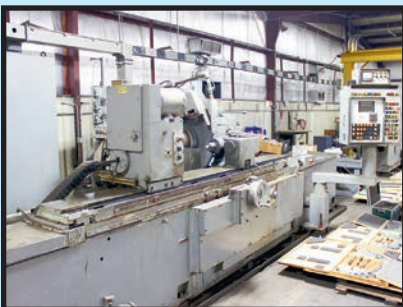
CINCINNATI MILACRON 14" X 72" MDL. 380 PLAIN CYL. GRINDER