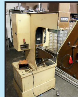
HAEGER 6 T. CAP. MDL. HP6-B INSERTION PRESS