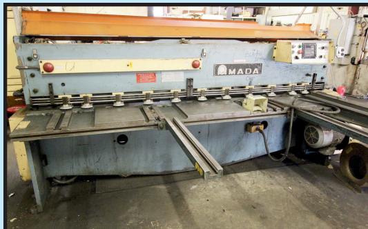
AMADA MDL. M-2545 3/16" X 8' HYDRAULIC SHEAR