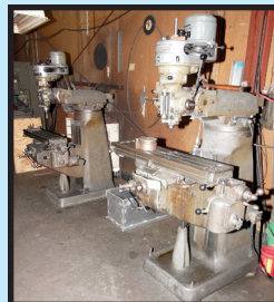
BRIDGEPORT STEP PULLEY 9" X 42" VERTICAL TURRET MILL