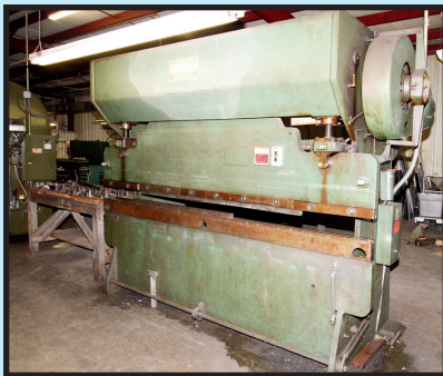
CHICAGO DREIS & KRUMP MDL. 810-C 75 T. X 10' MECHANICAL PRESSBRAKE