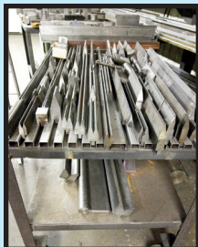
SAMPLE VIEW OF BRAKE DIES