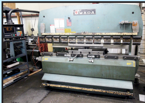
AMADA MDL. RG80 PRESSBRAKE

WELL MAINTAINED PRECISION SHEET METAL SHOP CLOSING!