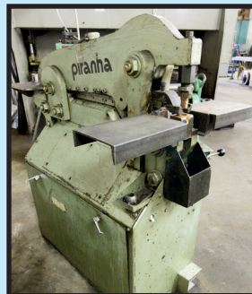
PIRANHA MDL. P2 50 T. CAP. IRONWORKER

INSPECTION: Wednesday, September 2, 9:00 A.M. to 4:00 P.M.