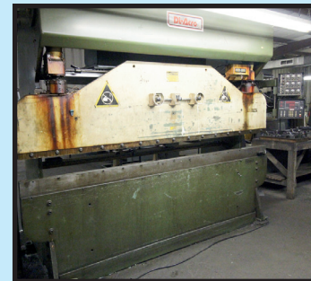
DIACRO MDL. 75-10 75 T. X 10' HYDRA-POWER PRESSBRAKE

ALLIED INSTRUMENT, INC. 3514 BOLIN ROAD HOUSTON, TEXAS 77092