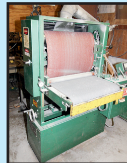
TIMESAVER MDL. 137-1HPM-75 BELT SANDER