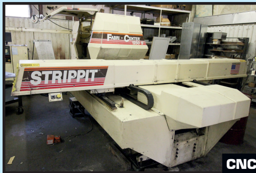
STRIPIT FABRICENTER MDL. FC1250S CNC TURRENT PUNCH PRESS