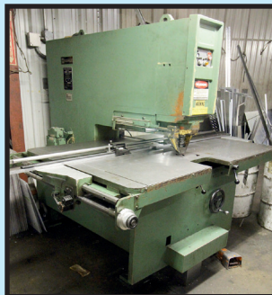
STRIPPIT MDL. SUPER 30-40HD PUNCH PRESS