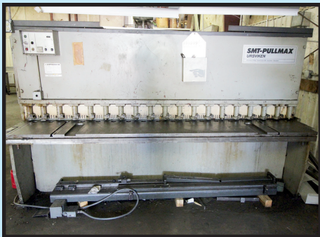
SMT PULLMAX MDL. US230 POWER SQUARING SHEAR