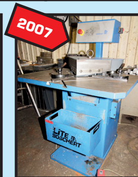
BORCHERT LITE HYDRAULIC POWER NOTCHER