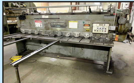
CINCINNATI MDL. 1010 POWER SQUARING SHEAR