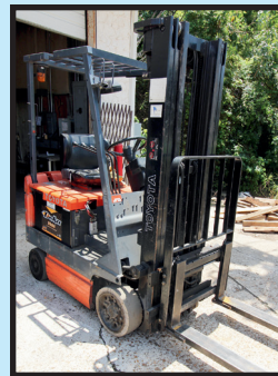
TOYOTA 2500-LB. CAP. ELECTRIC FORKLIFT