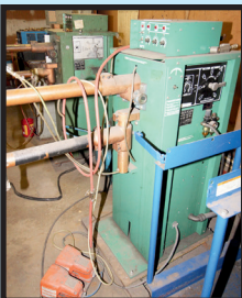
WESTERN ARCTRONICS SPOT WELDER