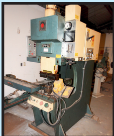
AMADA 30 T. CAP. MDL. SPH-30C HYDRAULIC PRESSBRAKE

Presorted First Class Mail U.S. Postage PAID Eugene, Oregon Permit No. 17