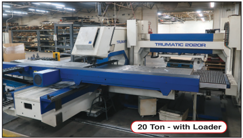
20 Ton - with Loader