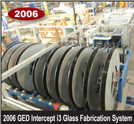
2006 GED Intercept i3 Glass Fabrication System