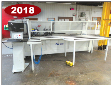
2018 PRO-LINE CNC 27 Twin Head CNC Corner Cleaner

Inspection: Wednesday, June 24th, 9:00 am to 3:00 pm