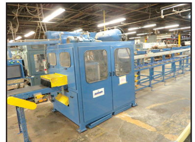
JOSEPH MACHINE SFMC Flexline Fabrication Machine Center