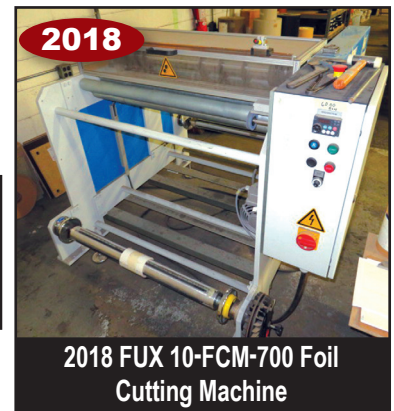
2018 FUX 10-FCM-700 Foil Cutting Machine

TERMS: 18% Buyers Premium online at Bidspotter.com. 15% Buyers' Premium Live. Full payment w/in 24 hours of Receipt of Invoice in Cash, Bank Check, Wire Transfer or Business Check w/ Bank Letter of Guarantee