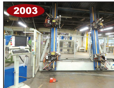
2003 STURTZ SMI-VSM 30/26-DS 4-Point Welder