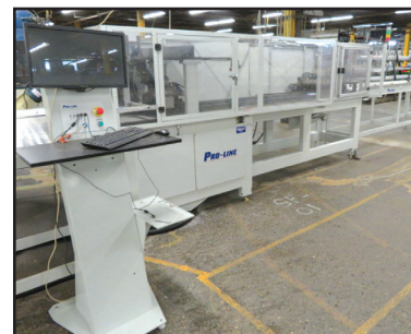
2018 PRO-Line AF325N Auto Feed Saw w/Notching Capability