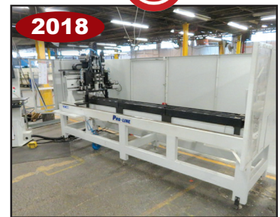
2018 PRO-LINE MC-330-06 3-Axis CNC Machining Center