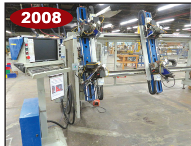
2008 STURTZ SMI-VSM-30/19-C-DS 4-Point Welder