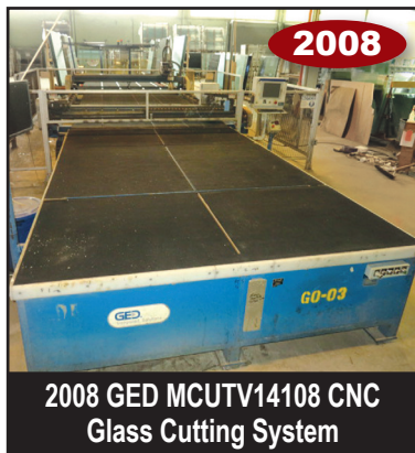
2008 GED MCUTV14108 CNC Glass Cutting System