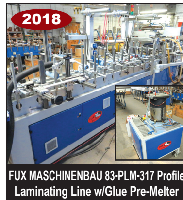
2018 FUX MASCHINENBAU 83-PLM-317 Profile Laminating Line w/Glue Pre-Melter