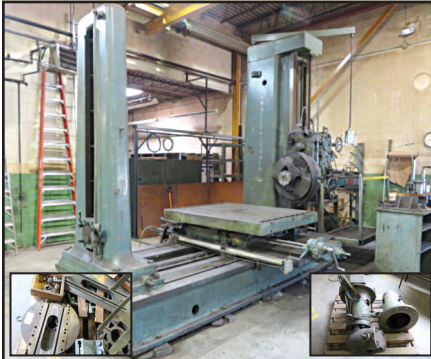
GRAFFENSTADEN 4-1/2" Table Type Boring Mill