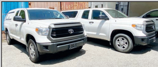
(2 OF 4) TOYOTA TUNDRA 4X4 PICKUP TRUCKS