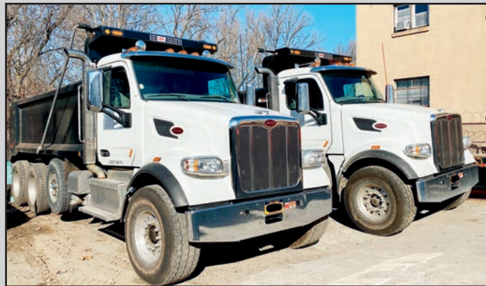
PETERBILT TRI-AXLE DUMPS WITH OX CHISOLM BODIES