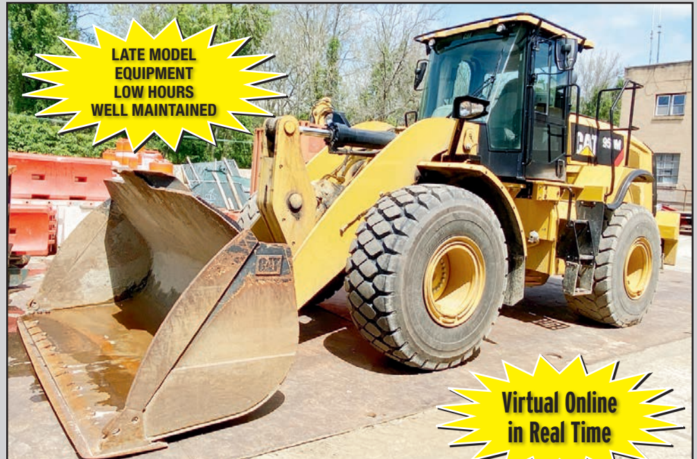
2016 CATERPILLAR 950M WHEEL LOADER