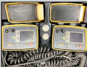
TOPCON SONIC TRACKER II GRADING SYSTEM