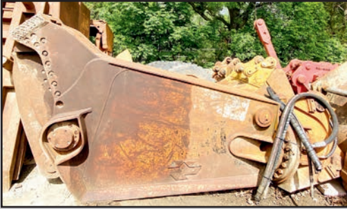
GENESIS DEMO-PRO GPD-900 360 DEGREE HYDRAULIC SHEAR