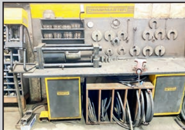
CRIMPMASTER HYDRAULIC HOSE MAKEUP BENCH

NORTON CS350 SS Walk-Behind Diesel Road Saw. CRIMPMASTER Hydraulic Hose Makeup Bench, with additional Parker vertical crimper. MULTIQUIP, and HONDA Gas Powered Jumping Jack and Portable Plate Compactors, 2"-3" Trash Pumps, Portable Generators to 7,000 kW, (50+) Lots! STIHL Gas Powered Cut-Off and Chain Saws. (3) Trench Box Systems, with large assortment of spreader pipe. Steel road plates. 10', 20', and 40' CONEX Job Site Boxes, with massive assortment of road and safety signs. Cones, Barrels and Bases, Barriers, and More! Rigging Chains, Shackles, Lifting Harnesses, Site Safety and Related Equipment.