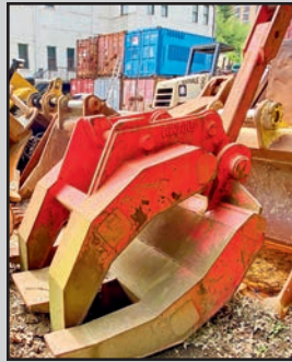
AWARD AG-400 GRAPPLE