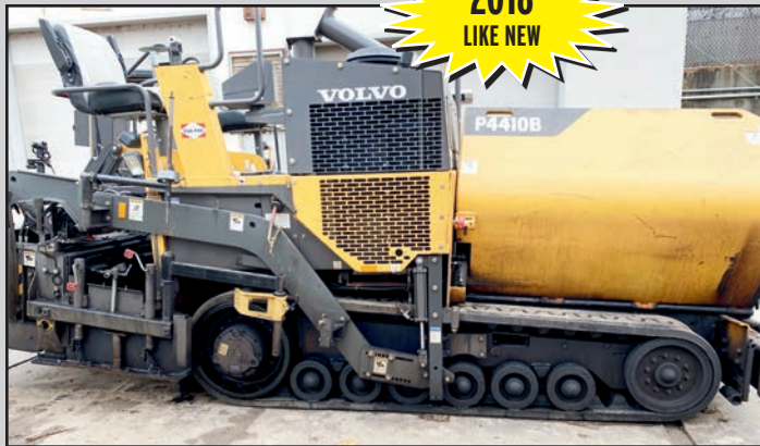
2018 VOLVO P4410 PAVER