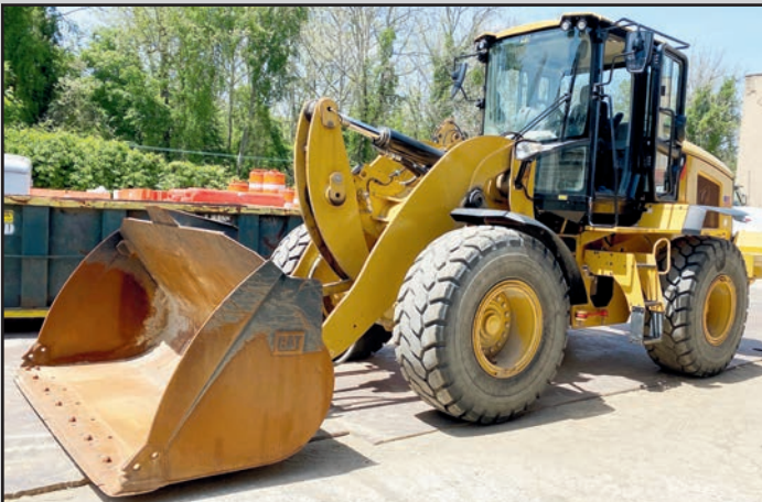
2015 CATERPILLAR 938M WHEEL LOADER WITH 4-YD. BUCKET

2017 CATERPILLAR 305.5E2 CR HYDRAULIC MINI- EXCAVATOR