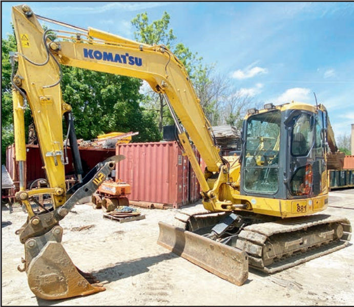
KOMATSU PC88 MR-10 HYDRAULIC MINI-EXCAVATOR