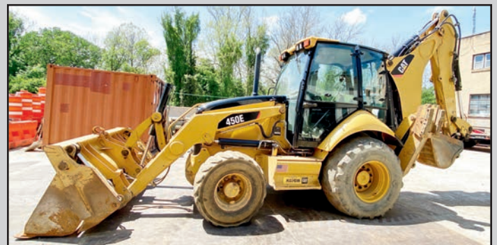
CATERPILLAR 450E LOADER BACKHOE