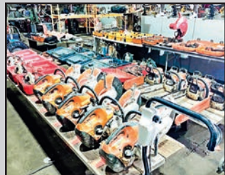
GAS AND ELECTRIC POWER TOOLS