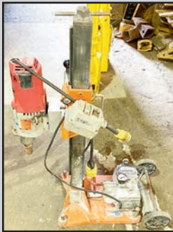
NORTON CLIPPER CORE DRILL RIG

BID ONLINE AT BidSpotter.com OR proxibid.com