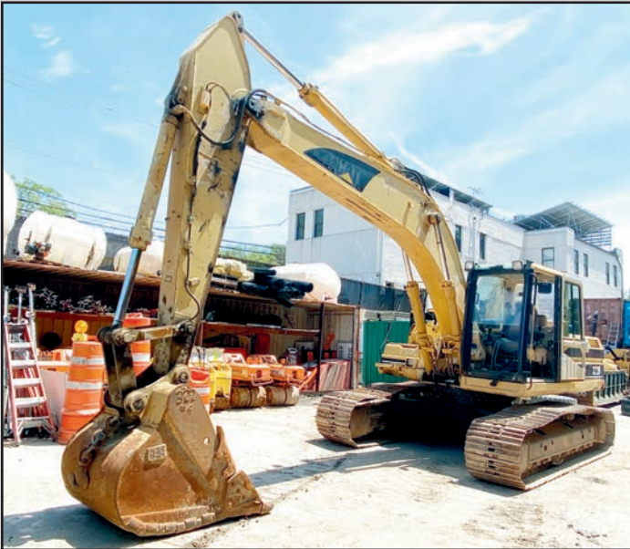
CATERPILLAR 322BL EXCAVATOR