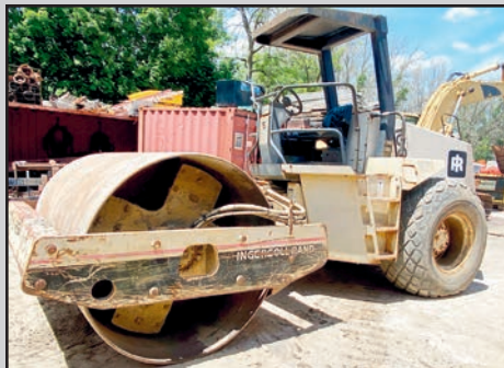
INGERSOLL RAND PRO-PAC SD-100 VIBRATORY ROLLER