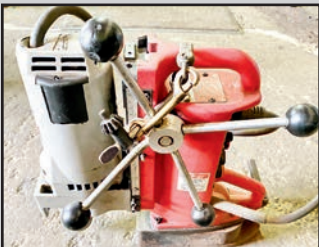
MILWAUKEE MAGNETIC BASE DRILL PRESS