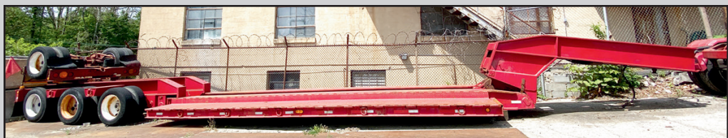
ROGERS SP60DS TRI-AXLE LOWBOY 60-TON HYDRAULIC GOOSE NECK TRAILER