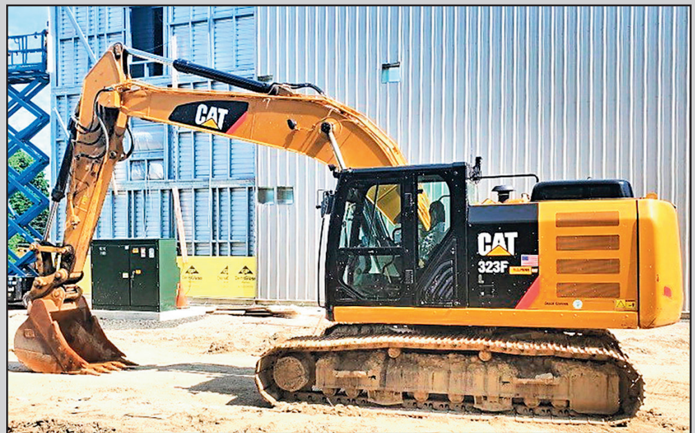
CATERPILLAR 323F EXCAVATOR