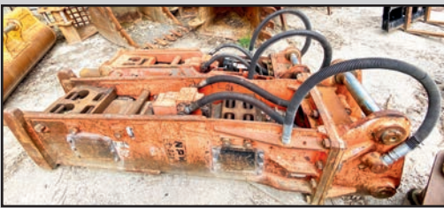
(2 OF 5) NPK HYDRAULIC HAMMER/BREAKERS