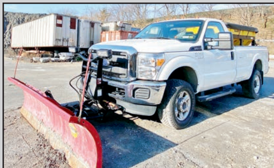
FORD F-350 PLOW TRUCK