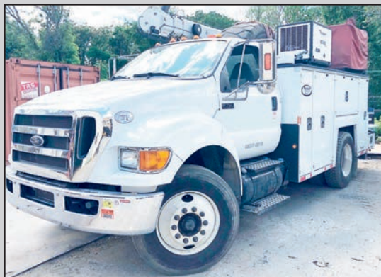
FORD F-750 SERVICE TRUCK