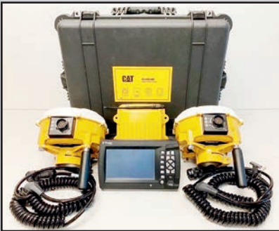
TRIMBLE DOZER GRADING SYSTEM