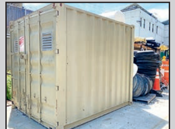
(1 OF 20+) CONEX STORAGE CONTAINERS

Massive Selection of BOSCH, MILWAUKEE, IR, NORTON, and HILTI Heavy Construction Grade Electric and Pneumatic Power Tools Including Core Drills, Magnetic Based Drill Presses, Hammer Drills, Ram Sets, Cut-Off and Deep Hole Saws, and Related Equipment.