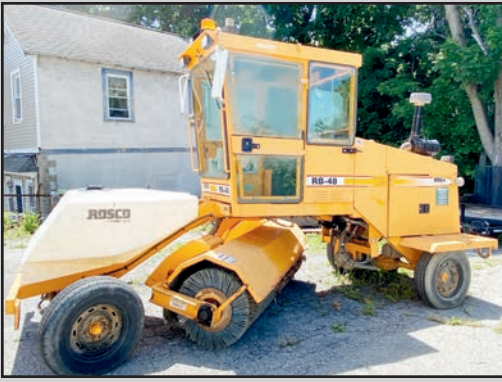
ROSCOE RB48 8' SWEEPER/BROOM