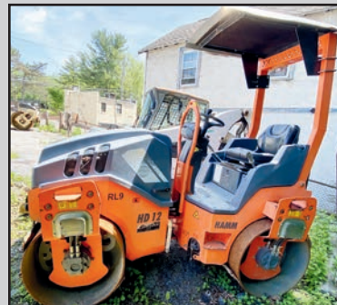
HAMM HD-12VV TANDEM SMOOTH DRUM VIBRATORY ROLLER