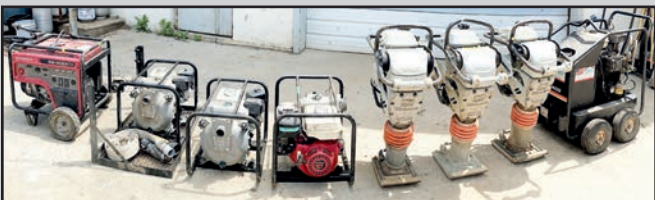
SAMPLE GAS POWERED TOOLS

NPK E225 Hydraulic Hammer/Breaker, 7,800 ft./lb. impact, 300-400 BPM. NPK E207 Hydraulic Hammer/Breaker, 2,500 ft./lb. impact. NPK E203 Hydraulic Hammer/Breaker, 2,000 ft./lb. impact. AWARD aG-400 Grapple.