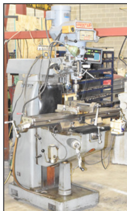
PROSTAR MM vertical turret milling machine