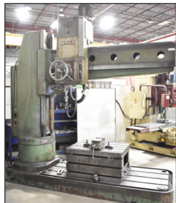
MAS VR6A 7-way type radial arm drill

THIS BROCHURE IS ONLY A PARTIAL LISTING. PLEASE VISIT OUR WEBSITE