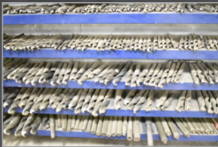
Partial view of perishable tooling available