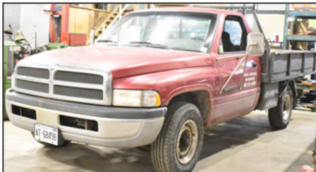
DODGE RAM 2500 flat bed truck