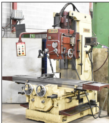
FORTWORTH VBM-4V vertical milling machine