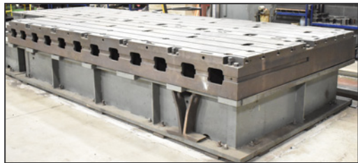
View of 69"x69"x14" floor plate