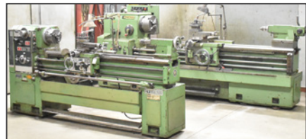
View of HWACHEON & CHIEN YEH gap bed engine lathes