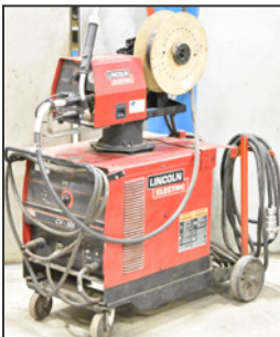
LINCOLN ELECTRIC CV-305 portable digital MIG welder