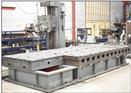
JUARISTI MDR-110 CM 4.25" floor-type horizontal boring mill