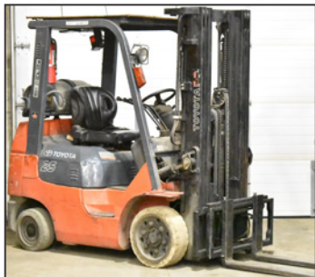
TOYOTA 7FGCU25 LPG forklift