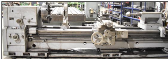
SIRCO PA-36 gap bed engine lathe