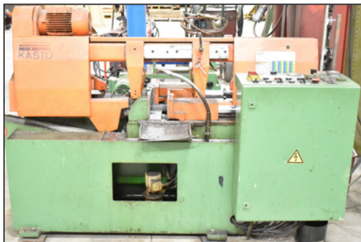
KASTO SBA220 AU automatic horizontal band saw