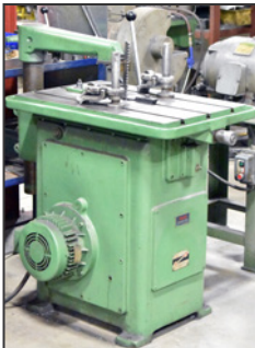
DAVIS MODEL 15 floor-type automatic keys seater