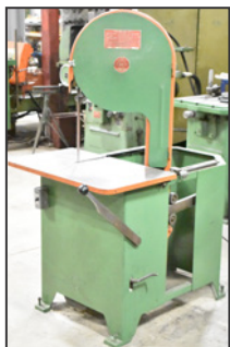
K&K 10" roll-in vertical band saw