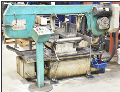
STG 320DG horizontal band saw