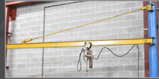
CSS floor-type jib crane