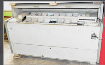
SPERRY RAND 16 tier powered indexing tool storage and retrieval cabinet

THIS IS A PARTIAL LISTING ONLY! FOR FURTHER INFORMATION, PLEASE VISIT WWW.CORPASSETS.COM