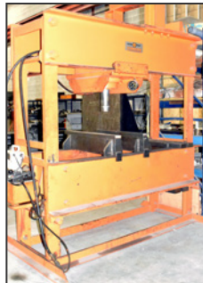
ARMSTRONG BEVERLEY h-frame shop press