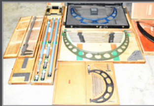
Partial view of inspection equipment available