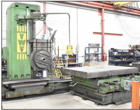
PLAUERT-WETZEL VWF 4.9" floor-type horizontal boring mill