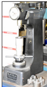
LINCOLN diamond cone hardness tester