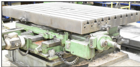
View of 63"x94.5" powered in-feed rotary table