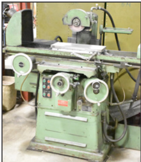
BARKER INDUSTRIAL 825 conventional surface grinder