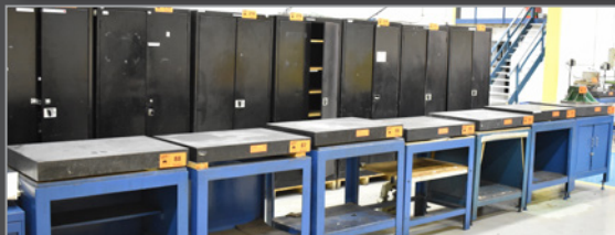
Partial view of granite surface plates available

Tuesday, March 24 Brantford, Ontario, Canada