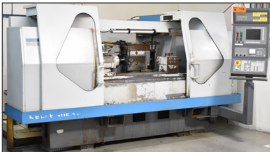
KELLENBERGER KEL-VARIA UR 175/1000 CNC universal cylindrical grinder