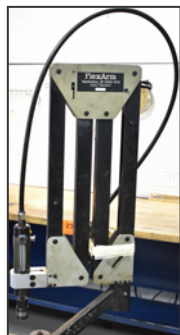
FLEX ARM pneumatic tapping arm