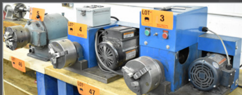
Partial view of variable speed bench type lathes available