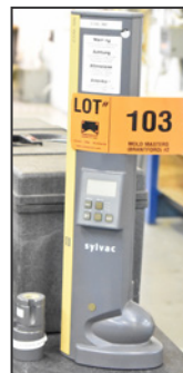
SYLVAC ZCAL 300 digital height gauge