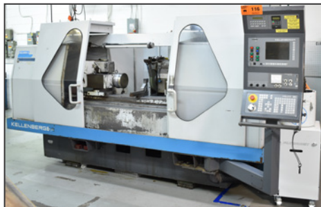
KELLENBERGER KEL-VARIA UR 175/1000 CNC universal cylindrical grinder