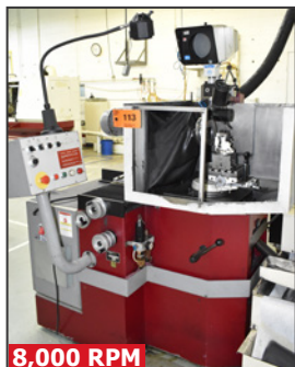
EWAG RS-09 precision PCD and tungsten carbide tool grinder