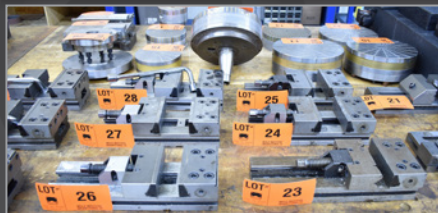
Partial view of machine vises available