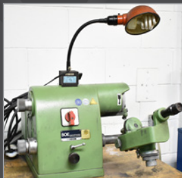
DECKEL KOD526/XS/XF/S12 universal tool and cutter grinder