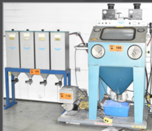
PEENMATIC PM750S precision sand blast cabinet