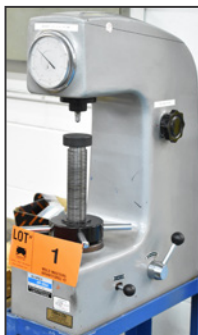
ABBA HR-150A hardness tester