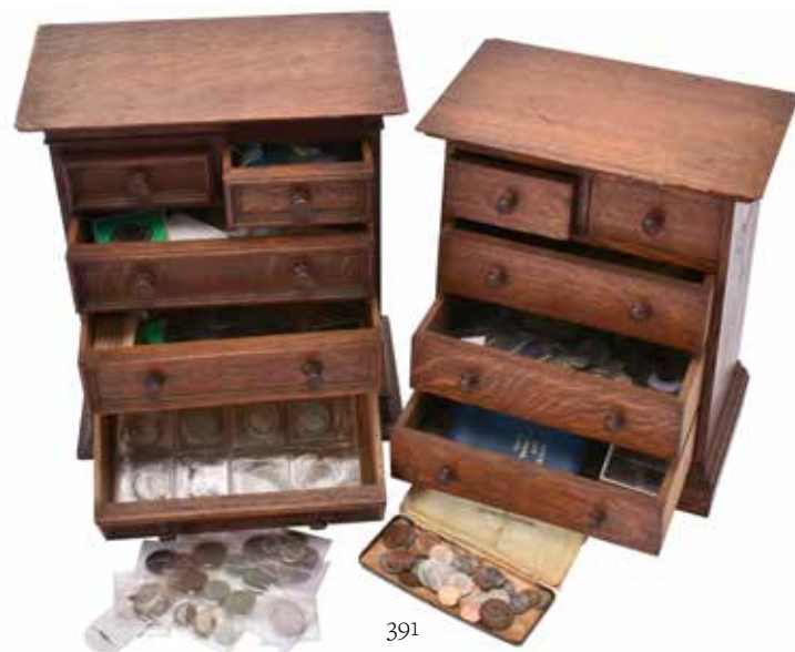
391 British and other coins, a large quantity, contained loos in two hardwood cabinets. Varied state (Lot)