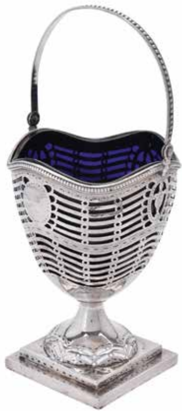
7 A George III silver pierced swing handle basket by Ann Chesterman, London 1778, with a beaded swing loop handle and border, the pierced body with an oval vacant reserve and on a stepped square base with later presentation engraving, 23cm (9in) high, 188g (6.5 oz), with a blue glass liner