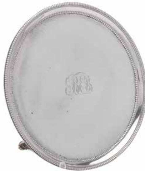
8 A George III silver circular waiter by Hester Bateman, London 1783, with a beaded border, engraved BEB, on three beaded feet, 19cm (7 1/2in) diameter, 335g (10.75 oz)