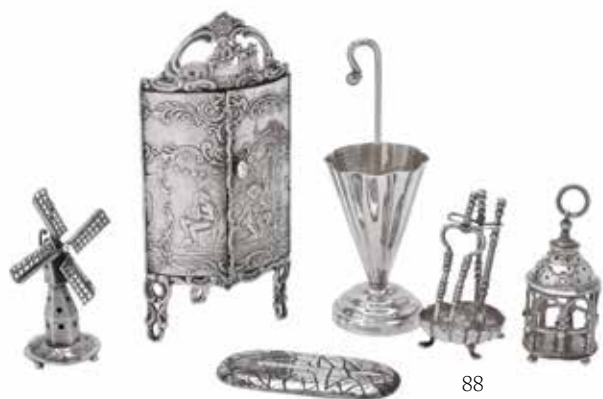
88 A collection of Dutch silver toys, various tax marks, mainly 20th century, the bow front standing corner cabinet with figural embossed doors, pseudo marks, 12.5cm (5in) high; a model of a windmill, import marked for Sheffield 1896; and other items