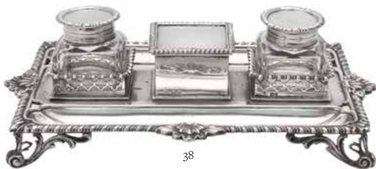
38 A late Victorian rectangular inkstand by Charles Stuart Harris, London 1898, with a gadrooned and shell border, two pen trays, a central box, two cut glass ink wells with silver covers, on four foliate scroll feet, 17.5cm (10 3/4in) long, 907g (29.15 oz) weighable