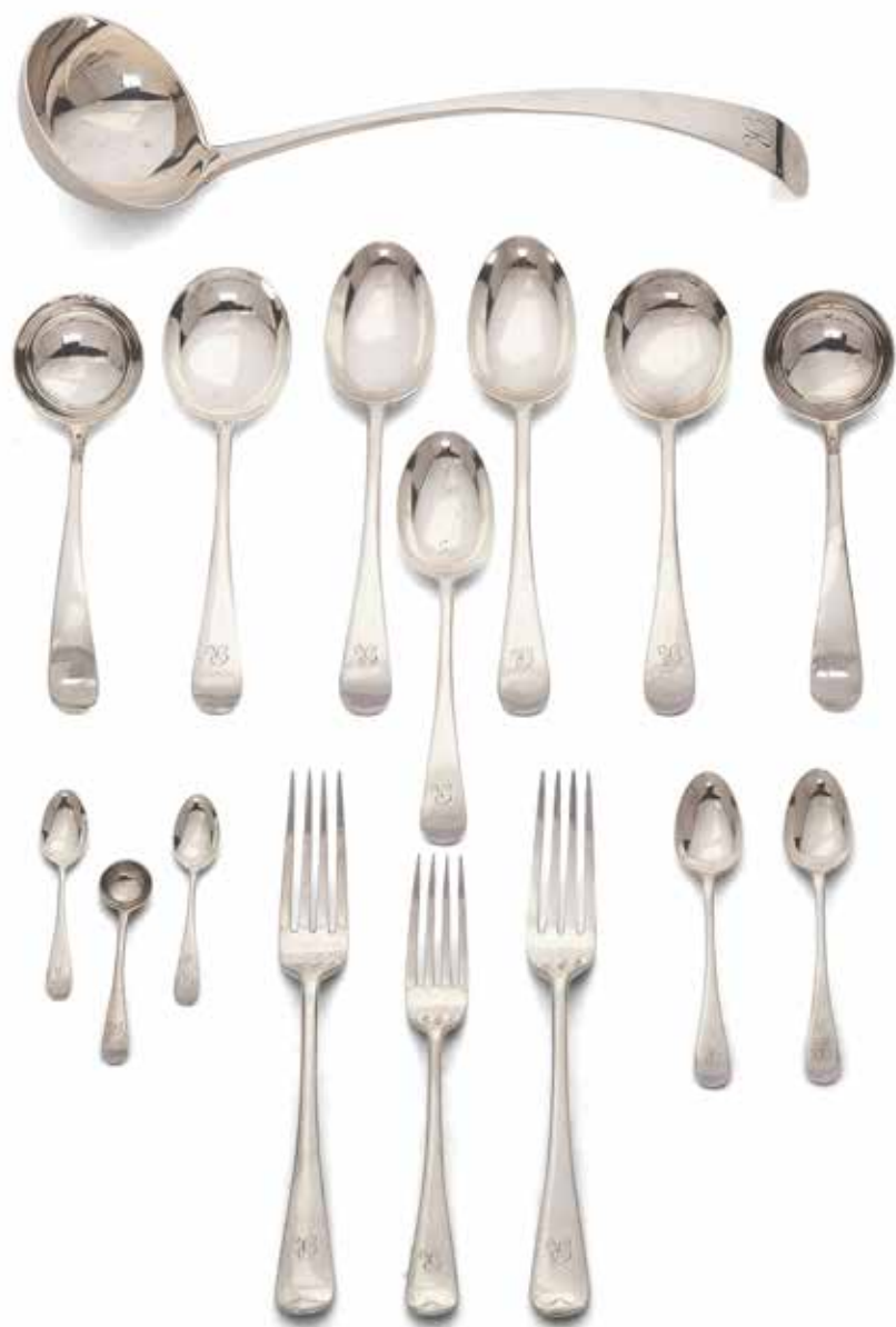
43 (part lot)