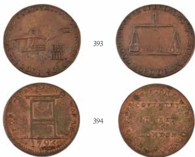
393 Gloucestershire, Badminton, Halfpenny 1795/1796, plough, rev. scales (DH 42). Extremely fine Provenance: Spink