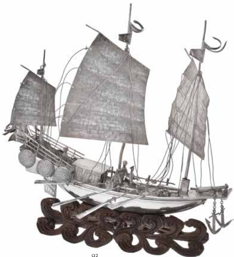
93 A Chinese export silver model of a three-masted ship by Wang Hing & Co., Hong Kong, Canton & Shanghai ('WH', '90' and a character mark), fl. circa 1854-1925, circa 1900, with fluttering pennants, the deck with cannon, a cabin, sailors, etc., 20cm (8in) long, 228g (7.3 oz) on a wooden stand carved as waves