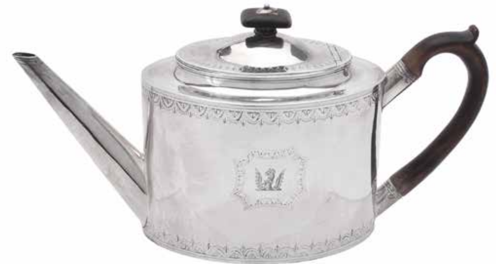
11 A George III silver oval tea pot by John Robins, London 1792, with a composition oblong finial and loop handle, engraved with decorative borders and a crest, 29cm (11 1/2in) long, 428g (13.8 oz) gross