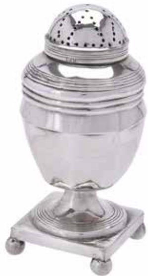
9 A George III silver pounce pot/sugar shaker, no maker's mark, London 1789, with a pierced domed cover, the half octagonal body with reeded bands, to a square base on four ball feet, 13cm (5in) high, 116g (3.7 oz)