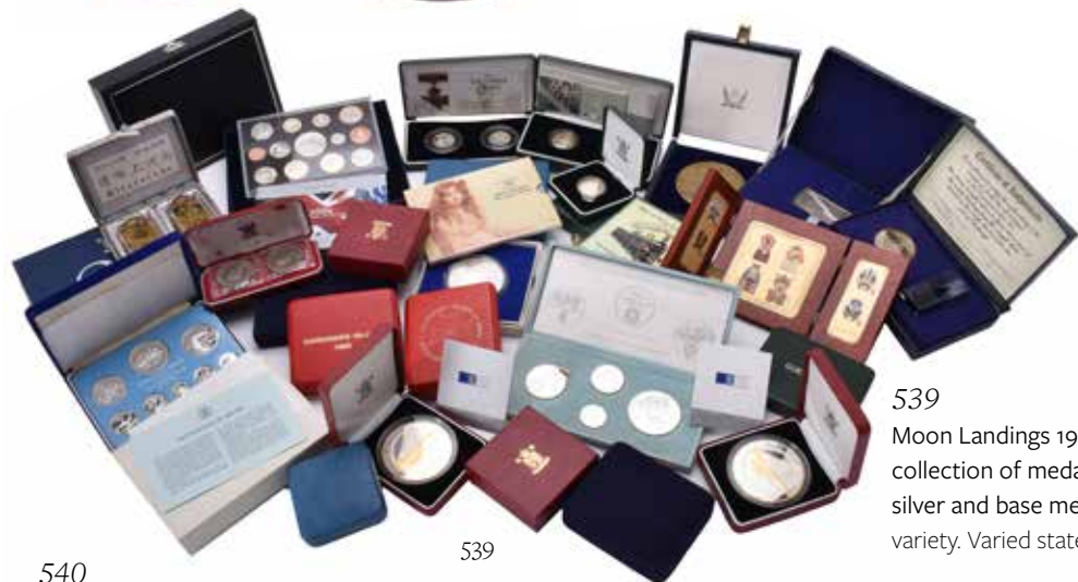
540 British and foreign commemorative medals, 18 th to 20 th century, including silver Victoria, Science & Art Department silver medal awarded Walter Scott Coventry 1868, 55mm, London, Metropolitan Amateur Regatta, silver, 43mm, Basel Bridge 1905, silver, 60mm, USA, Gutenberg 500 th Year of Birth 1900, bronze, 69mm, and sundry. Varied state (11)