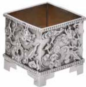
94 Two Chinese export silver small bowls, the first circular, retail silversmith Hung Chong & Co., Shanghai circa 1900, the mark of the retail silversmith Luen Wo partially erased, pierced and chased with two dragons confronting a flaming pearl, 8cm (3 1/8in) diameter; the second square, retail silversmith Wang Hing & Co., Hong Kong, Canton & Shanghai, fl. circa 1854-1925, circa 1900, each side applied with a dragon amidst clouds, 4cm (1 1/2in) high, 152g (4.9 oz) (2)