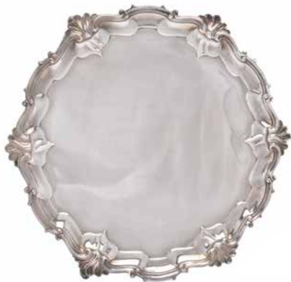
37 A late Victorian silver shaped circular salver by Edward Barnard & Sons Ltd., London 1897, with a raised moulded border with shells at intervals, on three foliate scroll feet, 39cm (15 1/4in) diameter, 1329g (42.75 oz)