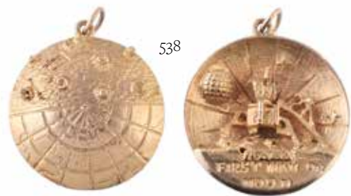
538 Moon Landings 1969, a 9ct gold concave pendant, terrestrial and lunar surfaces, rev. three-dimensional representation of the lunar module with astronaut on ladder, 5.9g. About as made, unusual and interesting