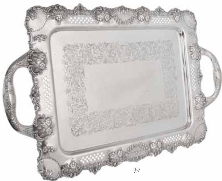
39 A late Victorian silver shaped rectangular twin handled tray by John Hines, Birmingham 1899, with twin loop handles, the border chased with C-scrolls, foliate swags and floral sprays, the body engraved with a foliate swag band, 60cm (23 1/2in) long, 1812g (58.25 oz)