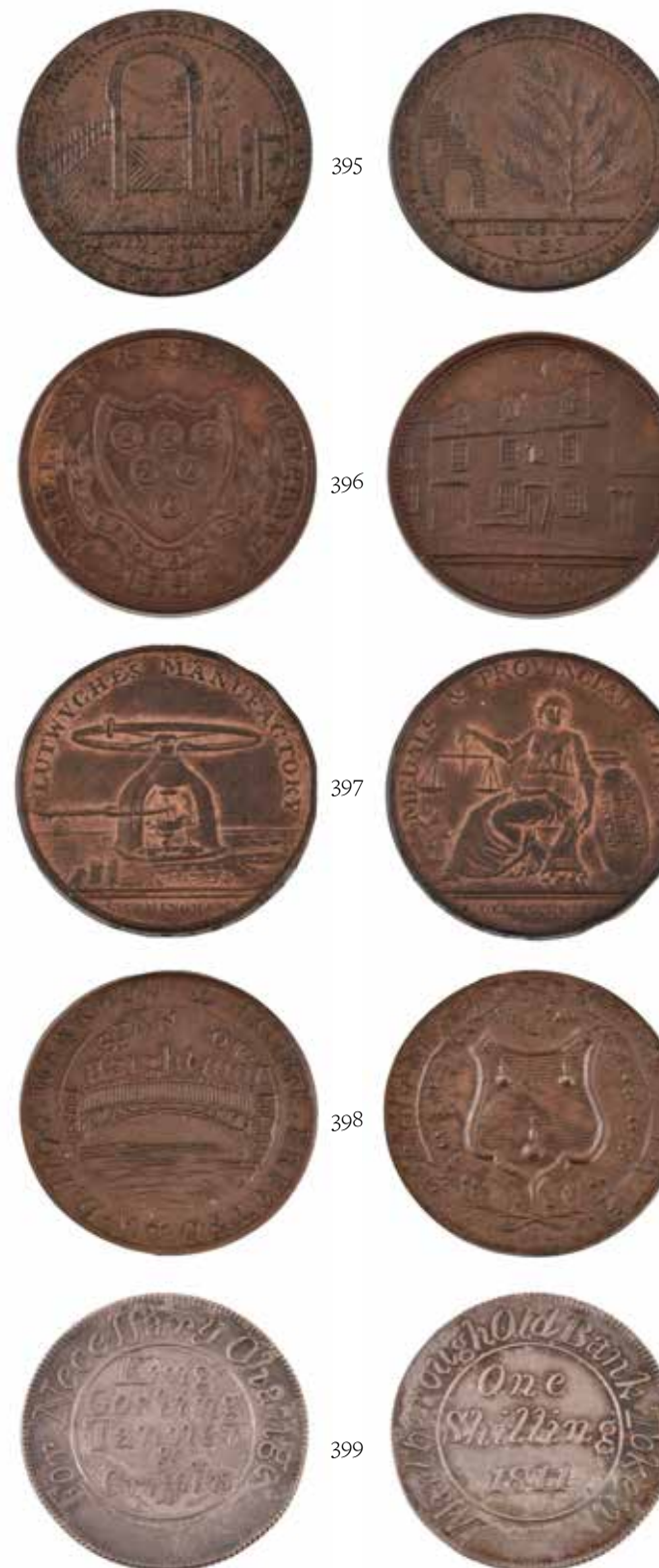
395 Somerset, Bath, Halfpenny 1794, a tree beside a ruin, rev. botanic garden entrance. Good very fine