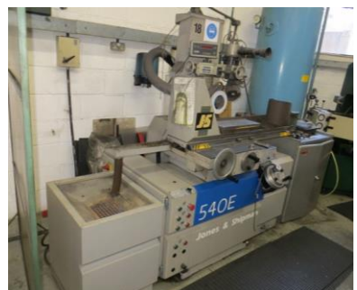
Jones & Shipman 540E surface grinder