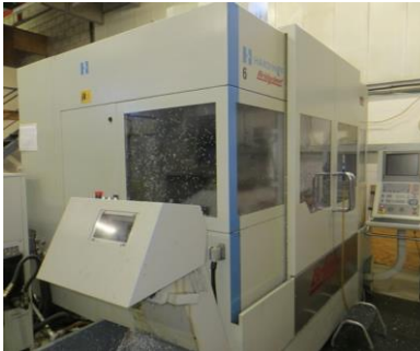
Hardinge Bridgeport MV204 CU/15 CNL vertical machining centre