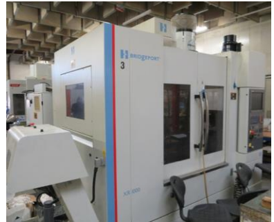
Hardinge Bridgeport XR 1000 CNC vertical machining