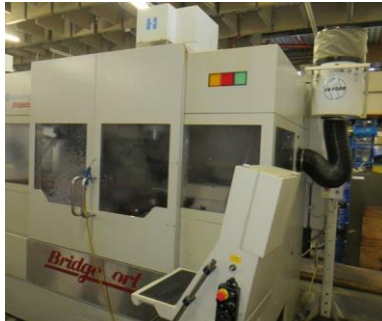
Hardinge Bridgeport MV204 CU/15 CNL vertical machining centre