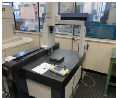
Mitutoyo Crysta Apex 754 co-ordinate measuring machine