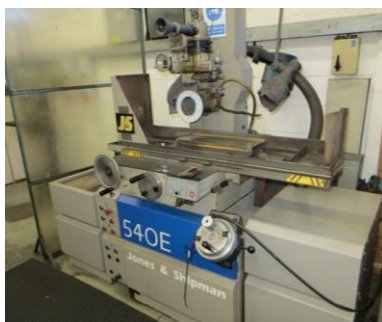
Jones & Shipman 540E surface grinder