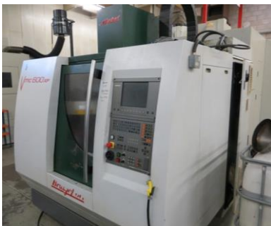
Bridgeport VMC600 XP CNC vertical machining centre