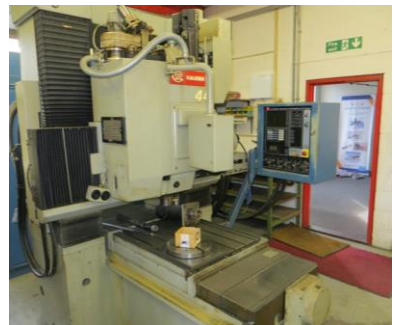
Two SIP Hauser MP-44 jig borers with CNC controller s