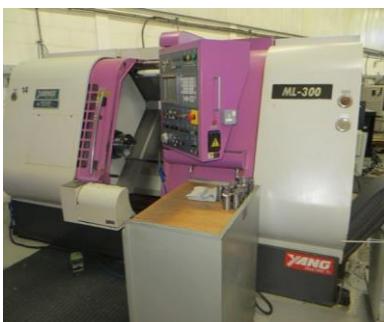
Yang ML-300 CNC lathe )