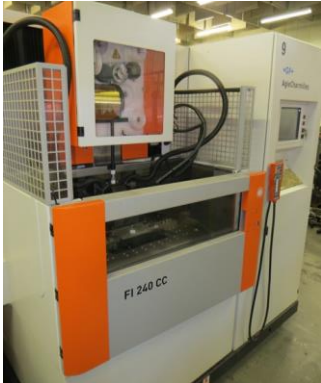
Agie Charmilles FI 240 CC clean cut wire eroder