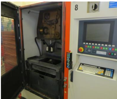
Charmilles Robofil 290 EMV wire eroder