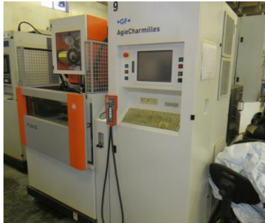
Agie Charmilles FI 240 CC clean cut wire eroder