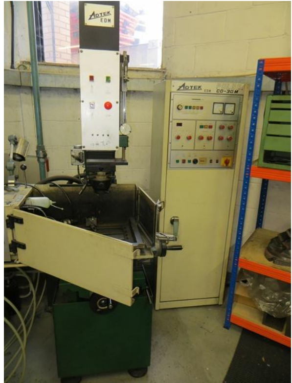
Adtek Pulse CD-30M GY-10 EDM spark eroder