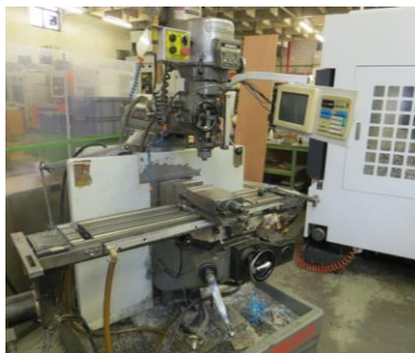
Bridgeport Eztrak Series 1 vertical milling machine with BPC-2M control