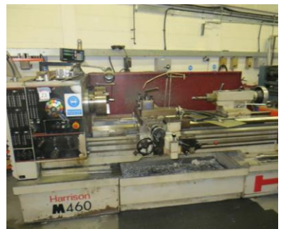
Harrison M460 GH gap bed centre lathe