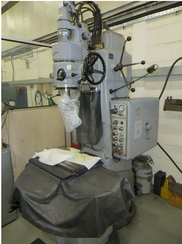
Catmur Bridgeport 2C jig grinder