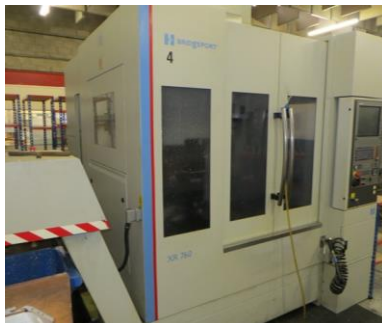
Hardinge Bridgeport XR760 CNC vertical machining centre