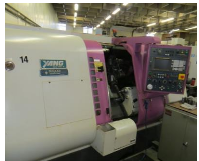
Yang ML-300 CNC lathe