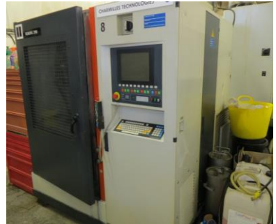
Charmilles Robofil 290 EMV wire eroder