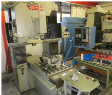
Two SIP Hauser MP-44 jig borers with CNC controller s