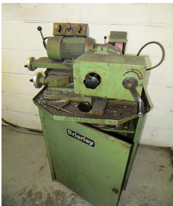
Brierley ZB 50 Cutter Grinder