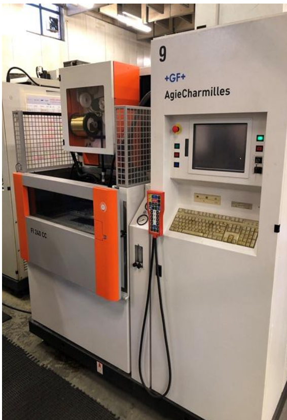
Agie Charmilles FI 240 CC clean cut wire eroder

General Workshop Equipment: including Workbenches, Cabinets, Gauges, Scales, Guillotines, Soldering Equipment, Drills, Angle Grinders, Presses, Vices, Tipping Skips, Small Tools Etc.,