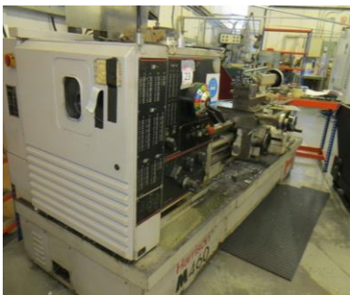
Harrison M460 GH gap bed centre lathe