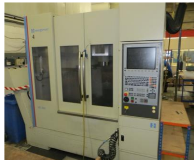
Hardinge Bridgeport XR760 CNC vertical machining centre