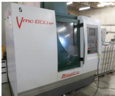
Bridgeport VMC600 XP CNC vertical machining centre