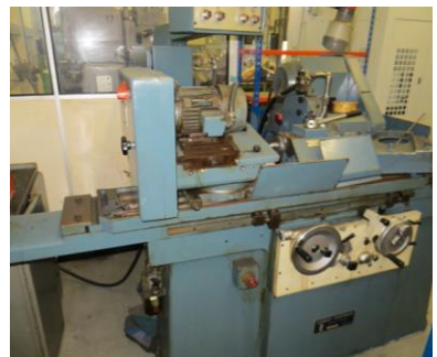
Jones & Shipman 1300 precision grinding machine