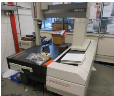
Mitutoyo CHN706 co-ordinate measuring machine