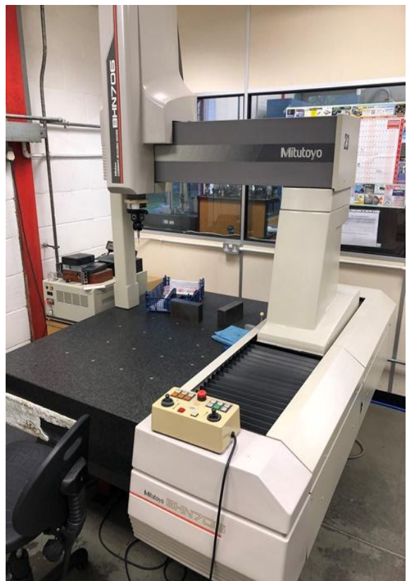
Mitutoyo CHN706 co-ordinate measuring machine