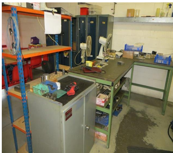
General Workshop Equipment