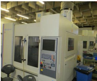
Hardinge Bridgeport XR 1000 CNC vertical machining