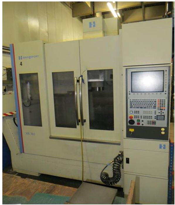
Hardinge Bridgeport XR760 CNC vertical machining centre