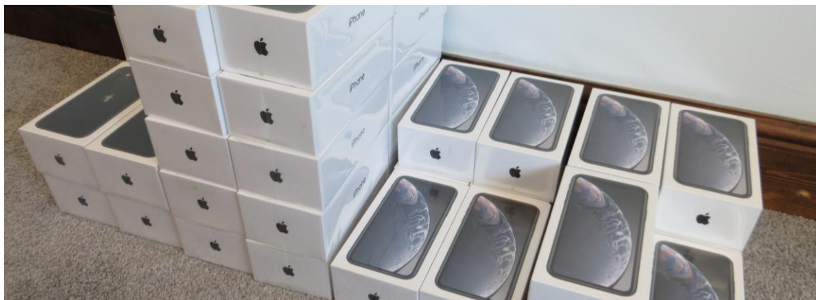
43 iPhone 11 & XR mobile phones