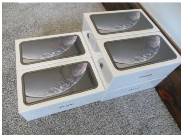
6 x iPhone XR Black 128Gb mobile phones