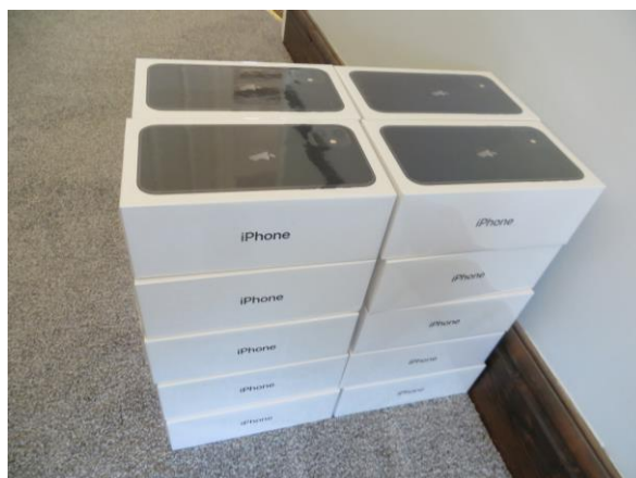
20 x iPhone 11 Black 64Gb mobile phones