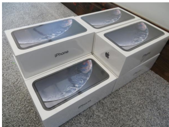
7 x iPhone XR Black 64Gb mobile phones