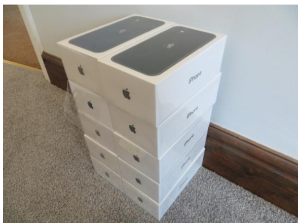
10 x iPhone 11 Black 128Gb mobile phones