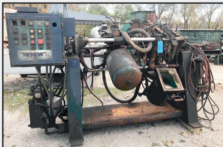
Dependable Mdl. 400SA Shell Core Machine w/Upgraded Renew PLC Controls