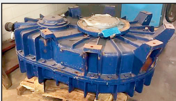
B & P Mdl. 84700 100B 250HP Muller Gear Box, Rebuilt by IDC