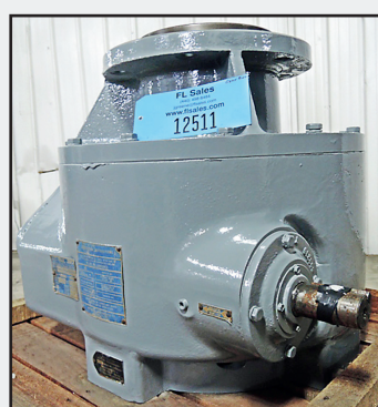
Simpson 1.5G Muller Gear Box