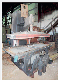
BMM Mdl. CT6 Jolt Squeeze Roller Lift Molding Machine