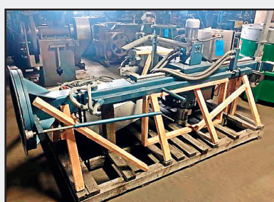
2016 Foseco Mdl. MTS 1500 Column Type Boma FD4 Rotary Degasser