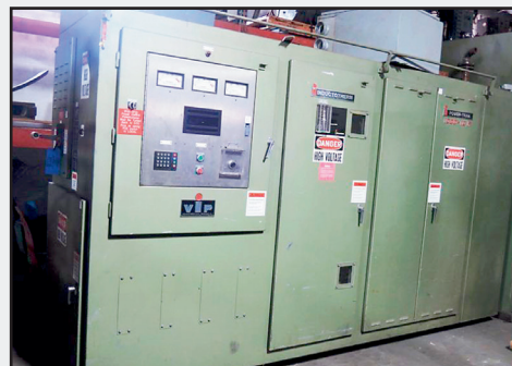
1996 Inductotherm Mdl. 1000-10R 1,000 kW 1,200 Hz Power Supply