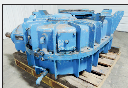
(8) B&P Mdl. 64756EX 100B Gear Boxes