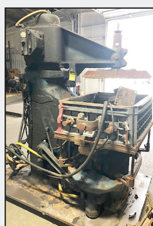
Osborn Mdl. 719 RJWA Semi-Automatic Molding Machine

ALSO AVAILABLE: Scissor Lift Tables • Rollovers • Air Compressors • Hydraulic Power Units • Toolroom • Mixers • Molding Machines • Inspection • Motors • Hartley Test Units • Hoppers • Crane Scales – up to 30,000-lbs. • Furnace Transformers • Scrubbers • Kloster Mixing Heads • Blast Cabinets • Welders • Cutoffs • Forklift Trucks • Coil Lifts • Much, Much More!