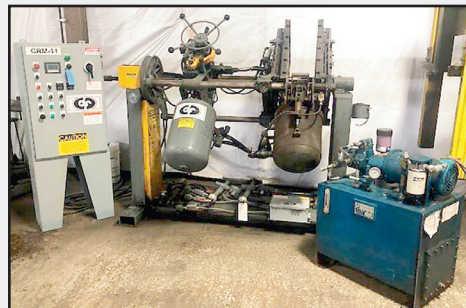
Dependable Mdl. 400FA Shell Core Machine