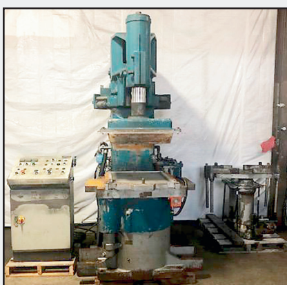
BMM Mdl. QJS 222 Molding Machine