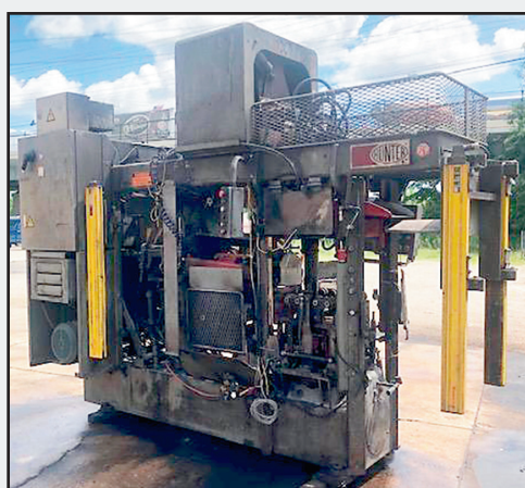
2000 Hunter Mdl. HMP10H Automatic Molding Machine