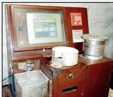
2011 Thermtronix Mdl. QPMS Porosity Tester