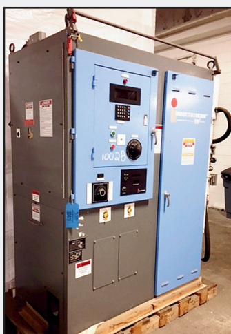
2007 Inductotherm Mdl. 50-500 50kw 500hz Power Supply, w/Water Pumps