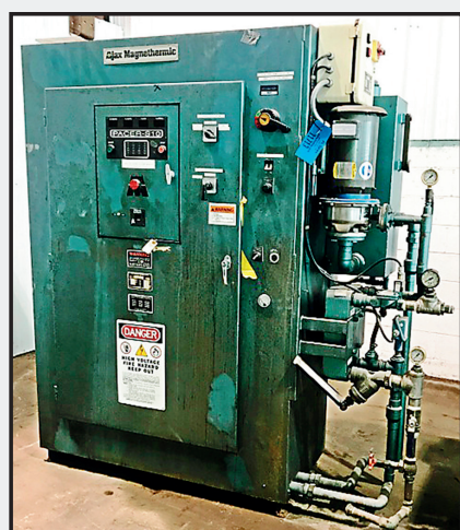
1995 Ajax Pacer S-10 Power Supply