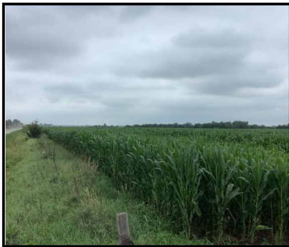
Looking to the Southeast