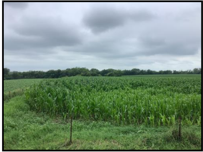
Looking West from the Southeast border