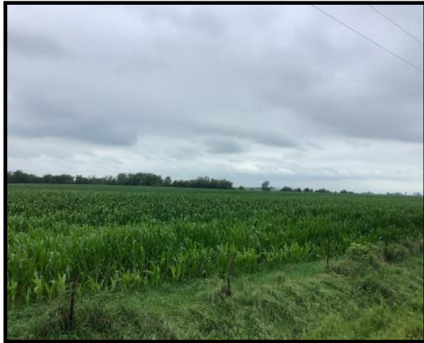
Looking to the Northwest