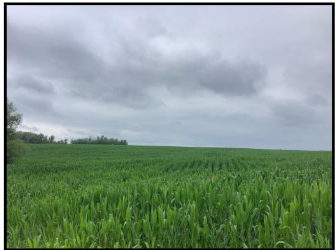
Looking North from the South fence line.

The information gathered for this brochure is from sources deemed reliable, but cannot be guaranteed by Agri Management Services or its staff. All acres are considered more or less.