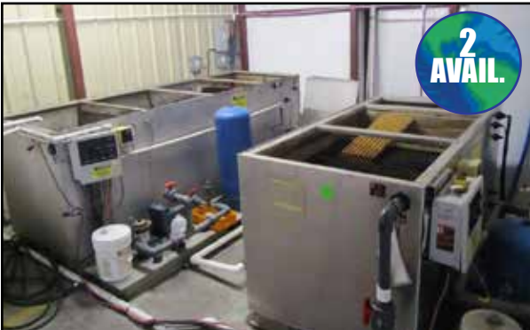
(2) CHAPPELL WATER RECLAMATION SYSTEMS

Banding Carts, Tools, Pallet Jacks, Storage Containers, Etc. (S & D)