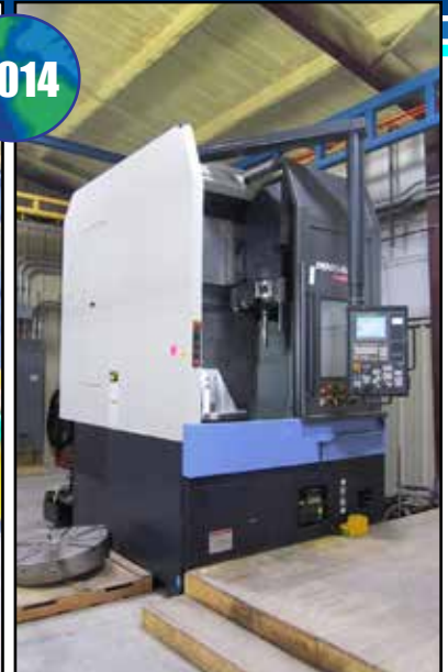
(2) DOOSAN VT900M CNC VERTICAL TURNING CENTERS