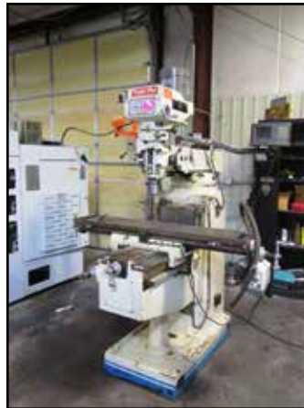
TURN-PRO VARIABLE SPEED VERTICAL MILLING MACHINE