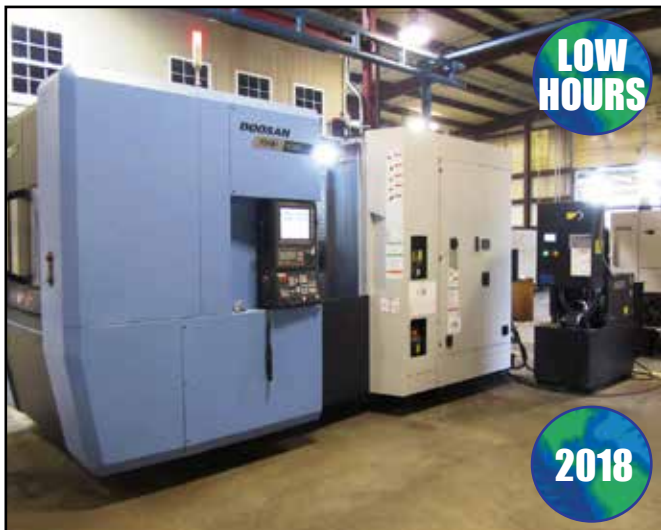
DOOSAN NHP 5000 4-AXIS CNC HORIZONTAL MACHINING CENTER