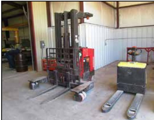
RAYMOND AISLE PICKER ELECTRIC FORKLIFT