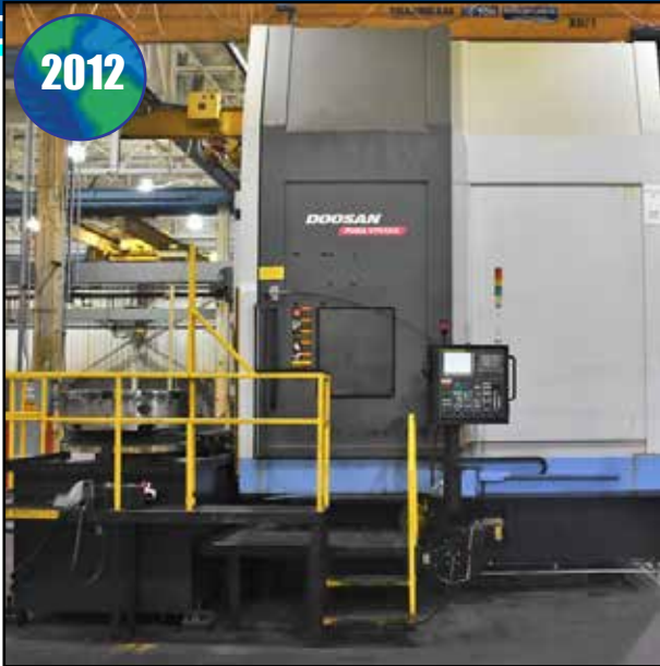
DOOSAN PUMA VTS1214 CNC VERTICAL TURNING LATHE