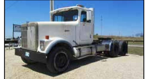
INTERNATIONAL SEMI TRACTOR TRUCK