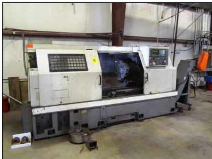
DIANICHI 35 X 1250 CNC TURNING CENTER