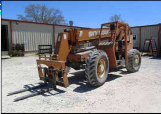
SKYTRAK 8,000LB ROUGH TERRAIN TELESCOPIC EXTENDABLE BOOM FORKLIFT