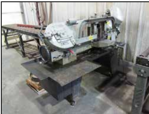
WELLSAW 1016 HORIZONTAL BANDSAW