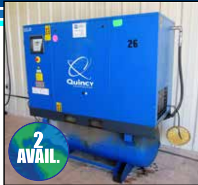
(2) QUINCY ROTARY SCREW AIR COMPRESSORS

Tool Crib including Carbide & Devibe Boring Bars, Lathe Chucks, Hand Tools, #40 Taper Tool Holders, Magnetic Base Drills, Chains, Slings, Welding Clamps, Parts Bins, Flammable Cabinets, Double End Grinders, Belt Sanders, Portable Field Generator, Storage Tubs & Carts, Pallet Jacks, Fans, Weld Curtains, Tables, Plant Furniture, Inspection including Granite Table, Ring Gauges(S & D)