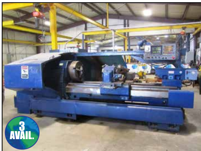
(3) MAZAK M5N CNC FLAT BED LATHES

Asset Sales, Inc. Does Not Pack, Ship, Crate, Transport or Rig Items. Buyers May Pick Up Their Items at the Auction Location or Can Arrange for a Third Party Logistics Firm to Manage the Removal Process for Them.