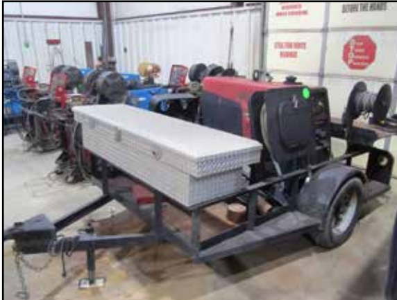
LINCOLN RANGER WELDER WITH TRAILER