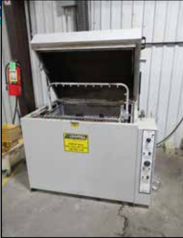
CUDA BASKET HEATED WASHER