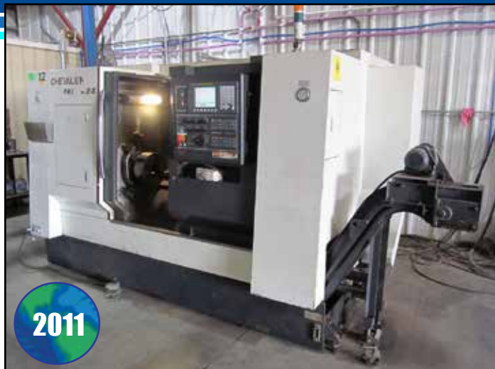
CHEVALIER FBL28 CNC TURNING CENTER