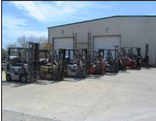
NISSAN, CATERPILLAR, TOYOTA FORKLIFTS