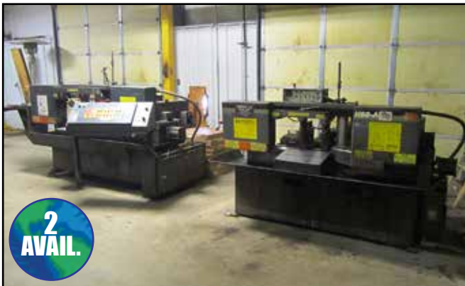
(2) HEM AUTOMATIC HORIZONTAL BANDSAWS