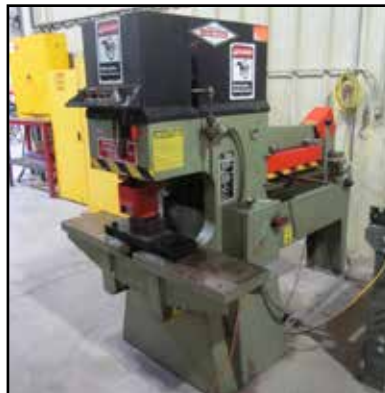
METALMUNCHER 100 TON IRONWORKER