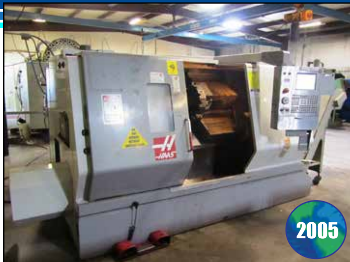
HAAS SL30-T CNC TURNING CENTER