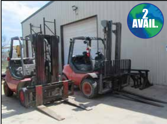
(2) LINDE DIESEL FORKLIFTS