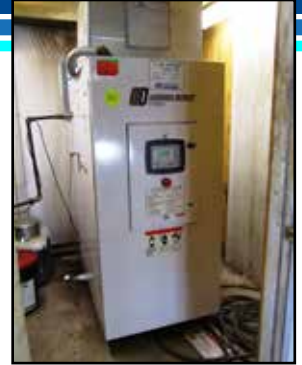
GARDNER DENVER AIR COMPRESSOR