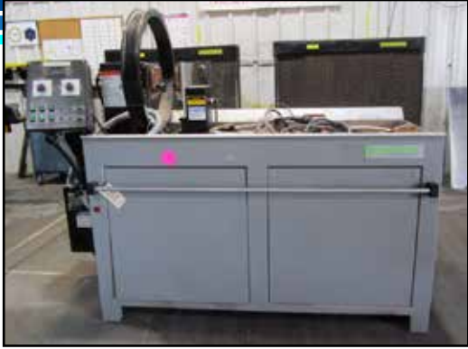
MAGNAFLUX MAGNETIC PARTICLE INSPECTION MACHINE