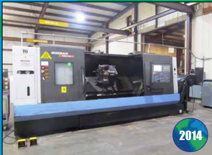
(2) DOOSAN PUMA 480L CNC TURNING CENTERS