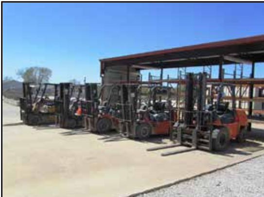
CATERPILLAR, TOYOTA FORKLIFTS