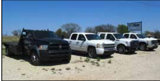
FORD, CHEVROLET & DODGE PICKUP TRUCKS