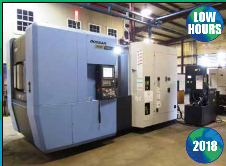
DOOSAN NHP 5000 4-AXIS CNC HORIZONTAL MACHINING CENTER

Inspection: Monday, May 10th From 8:00 A.M. - 4:00 P.M. CDT