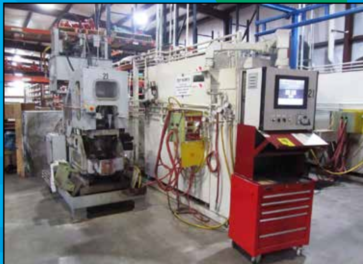
(5) AJAX TOCCO 250KW INDUCTION HEATING UNITS

> (2) DOOSAN VT900M CNC VERTICAL TURNING CENTERS