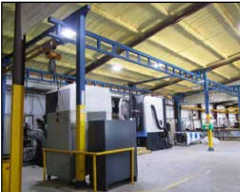
ASSORTED GORBEL, SPANCO CRANES & HOISTS

Other Crane Systems, COFFING Electric Hoists, Dump Hoppers, Material Handling (S & D)