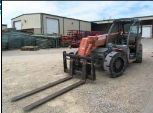
DIECI 5,500 CAPACITY TELESCOPIC FORKLIFT