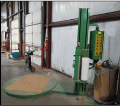
PREDATOR XS POWER STRETCH WRAP MACHINE