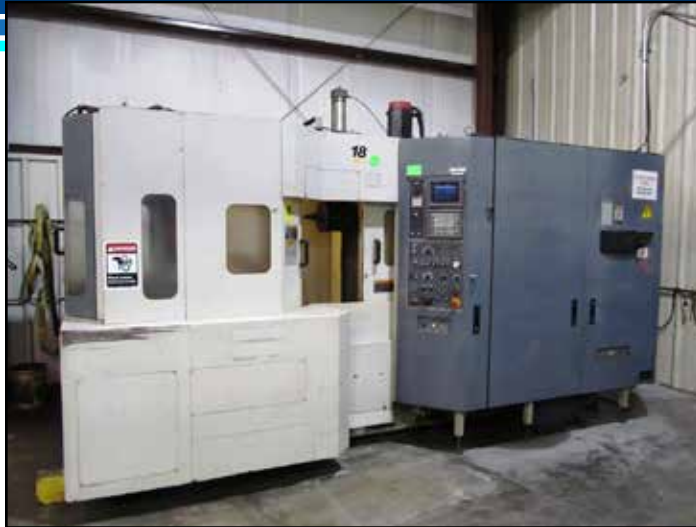
MORI SEIKI MH400 CNC HORIZONTAL MACHINING CENTER