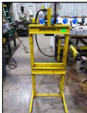
ENERPAC H-FRAME HYDRAULIC PRESS