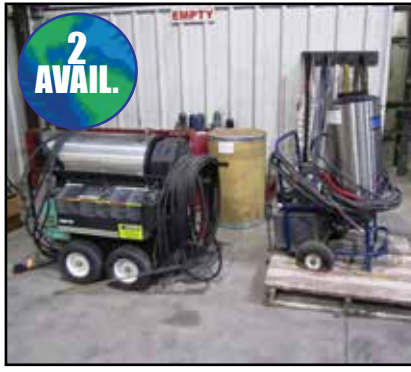
(2) HOTSY PORTABLE PRESSURE WASHERS