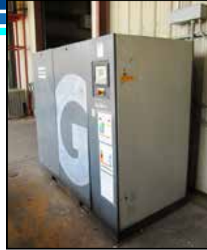
ATLAS COPCO AIR COMPRESSOR