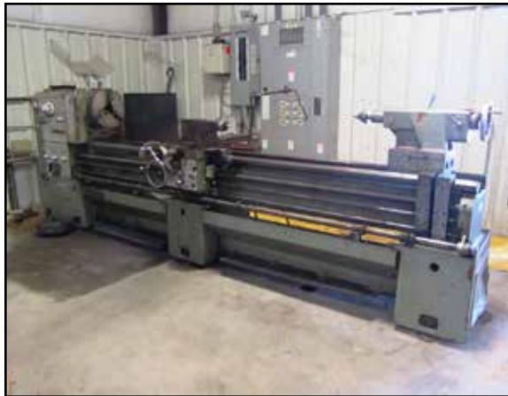
CROWN 27" SWING X 115" DISTANCE TO TAILSTOCK ENGINE LATHE