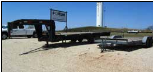
GOOSENECK & DUAL AXLE TRAILERS