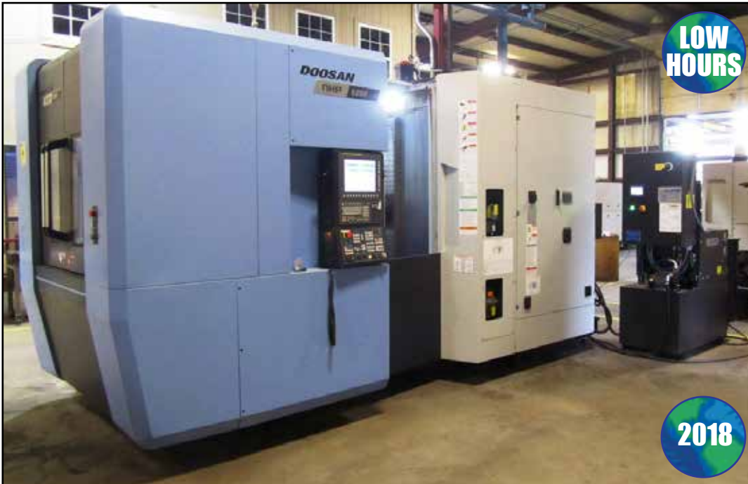
DOOSAN NHP5000 4-AXIS CNC HORIZONTAL MACHINING CENTER