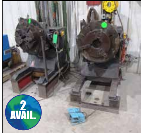
(2) PROFAX WELDING POSITIONERS