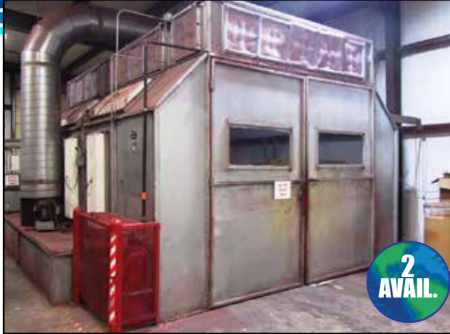
(2) STANDARD DOWNDRAFT PAINT BOOTHS