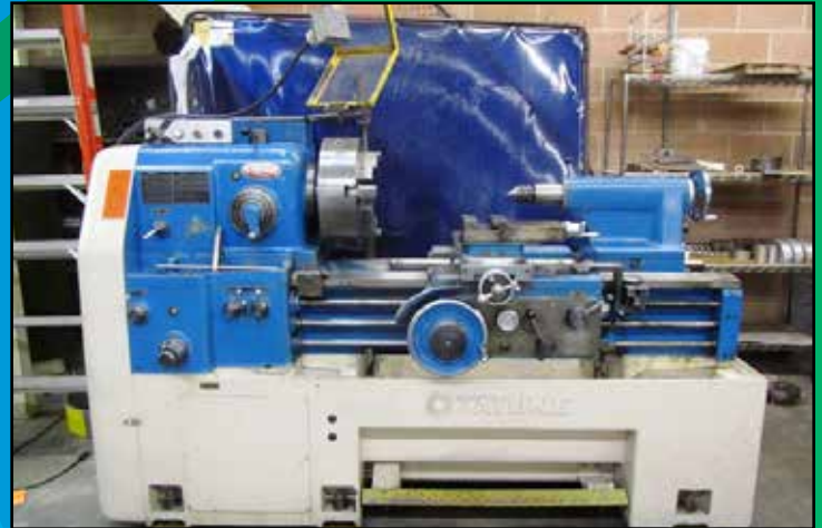
TATUNG TL-H MANUAL LATHE