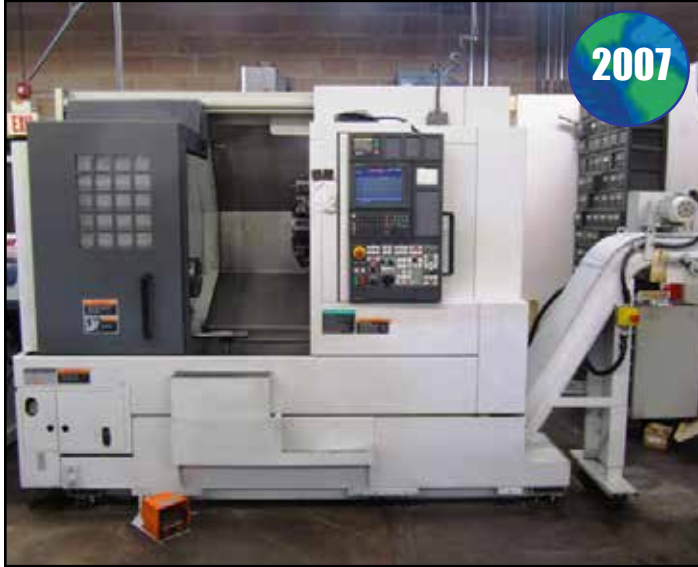
MORI SEIKI NL2000MC/500 CNC LATHE