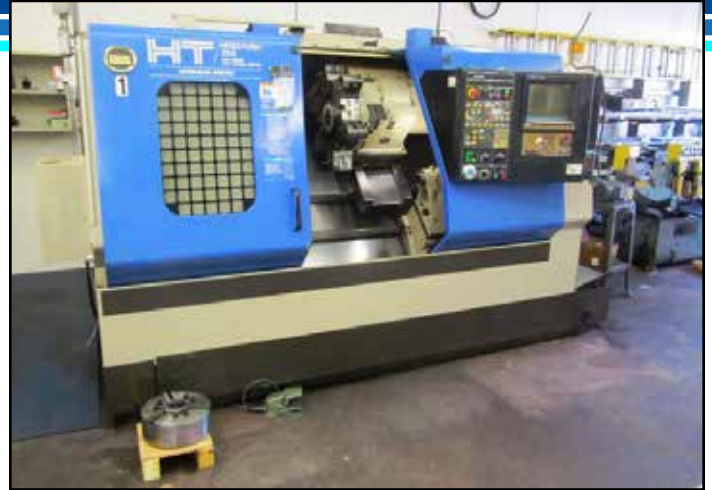
HITACHI SEIKI HT-25G CNC LATHE