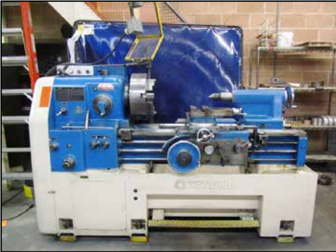
TATUNG TL-H MANUAL LATHE