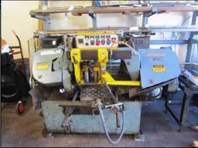
PEERLESS C-26A AUTOMATIC HORIZONTAL BANDSAW