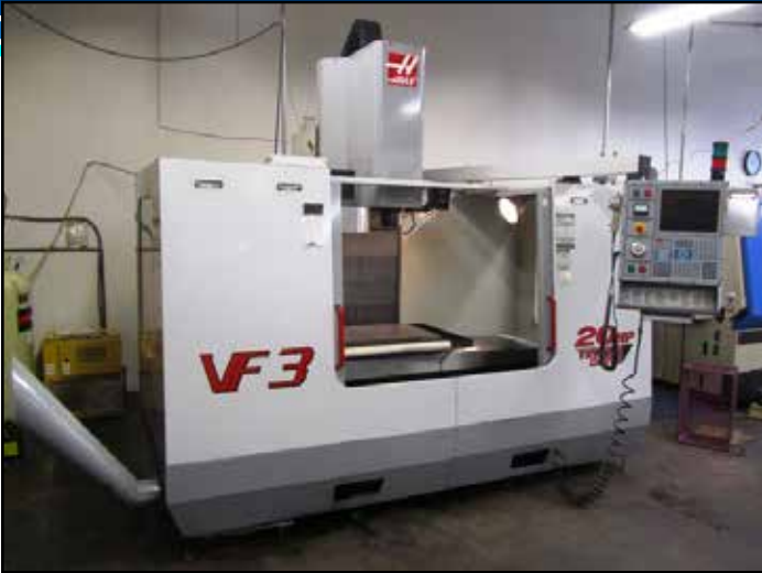
HAAS VF-3 CNC VERTICAL MACHINING CENTER