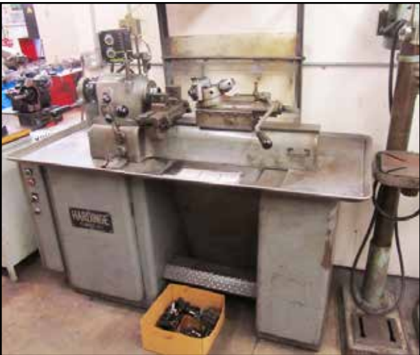
HARDINGE MANUAL LATHES