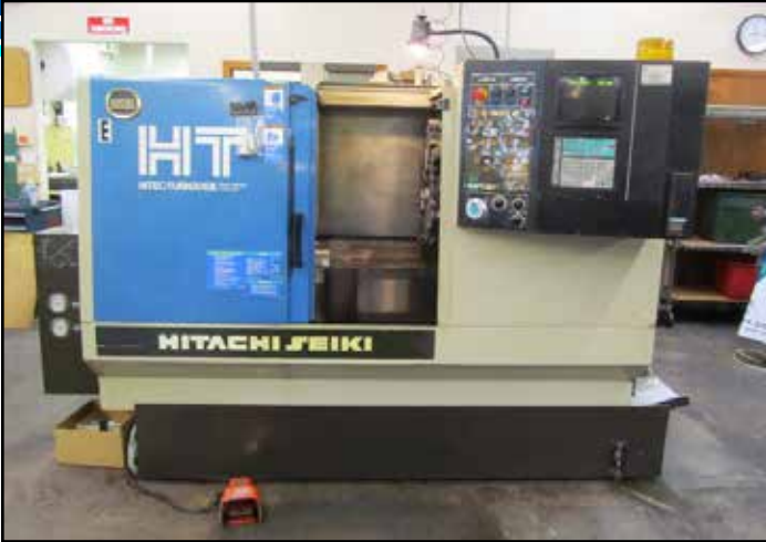
HITACHI SEIKI HT-20SII CNC LATHE