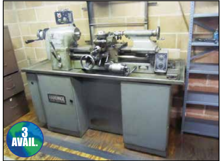
HARDINGE MANUAL LATHES