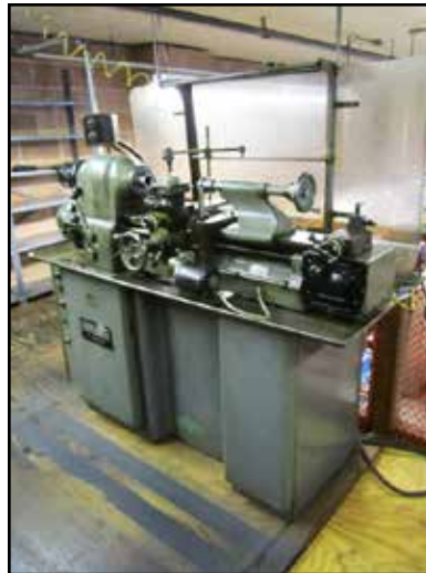
HARDINGE MANUAL LATHES