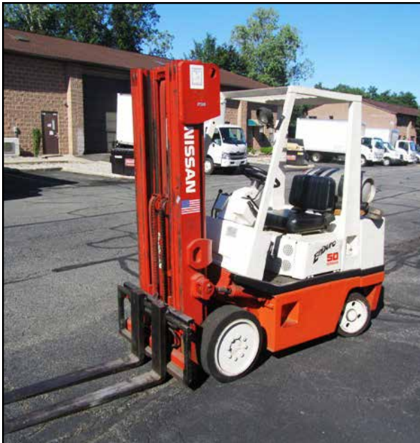
NISSAN PROPANE FORKLIFT

Asset Sales, Inc. Does Not Pack, Ship, Crate, Transport or Rig Items. Buyers May Pick Up Their Items at the Auction Location or Can Arrange for a Third Party Logistics Firm to Manage the Removal Process for Them.