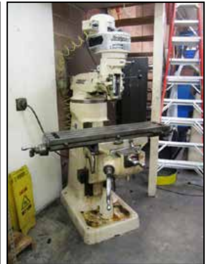
BRIDGEPORT KNEE MILL

Want to Sell Your Shop or Know Someone Who Does? Call Us Toll Free at (888) 800-4442! We Pay Great Finder's Fees!