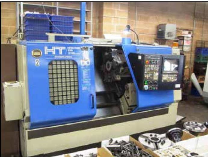
HITACHI SEIKI HT-25G CNC LATHE