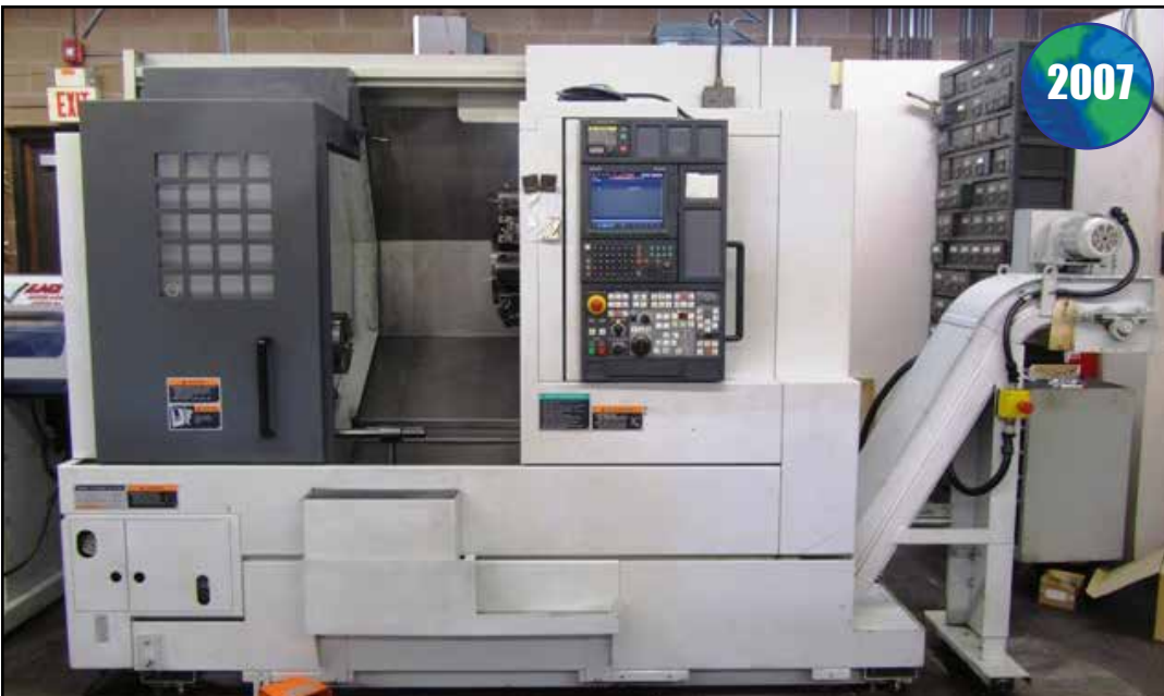
MORI SEIKI NL2000MC/500 CNC LATHE