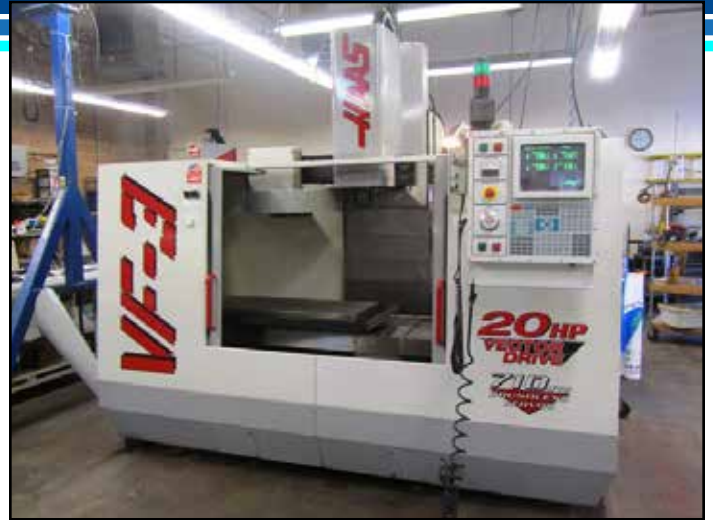
HAAS VF-3 CNC VERTICAL MACHINING CENTER