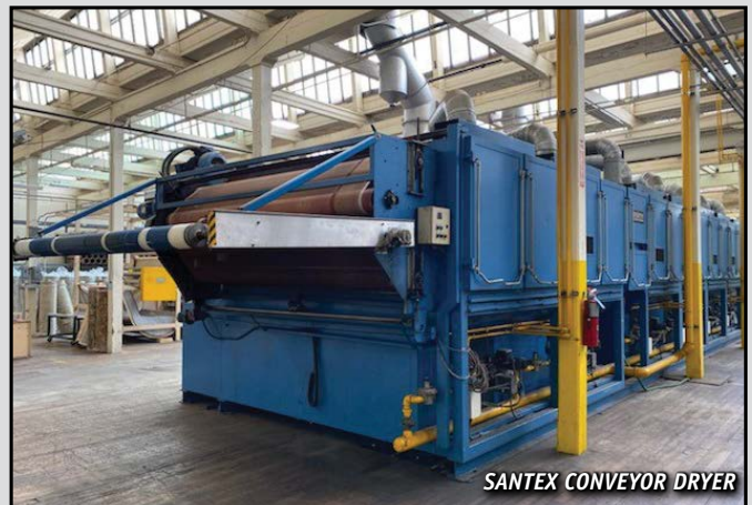
SANTEX CONVEYOR DRYER