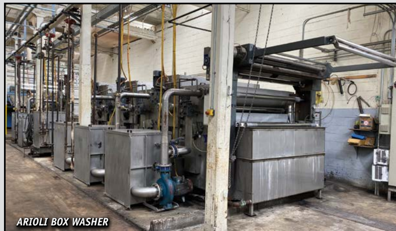
ARIOLI BOX WASHER