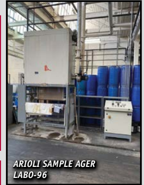
ARIOLI SAMPLE AGER LAB0-96