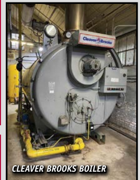
CLEAVER BROOKS BOILER