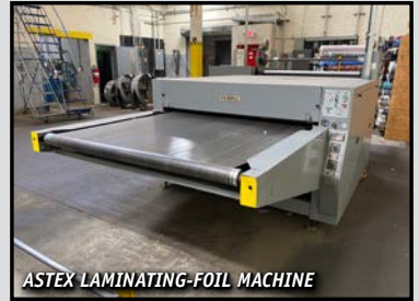
ASTEX LAMINATING-FOIL MACHINE