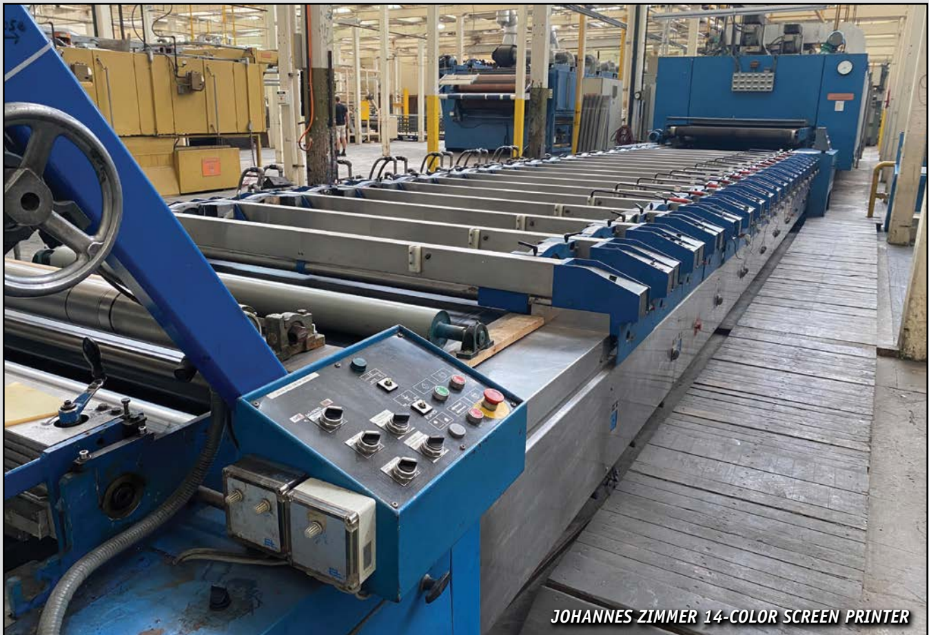
JOHANNES ZIMMER 14-COLOR SCREEN PRINTER

INSPECTIONS: MONDAY, AUGUST 30 TH & TUESDAY AUGUST 31 ST - 10:00 A.M. TO 4:00 P.M. & MORNING OF SALE - 8:30 A.M. TO 11:00 A.M.