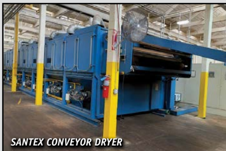
SANTEX CONVEYOR DRYER