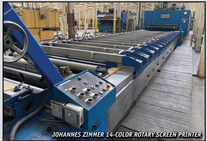
JOHANNES ZIMMER 14-COLOR ROTARY SCREEN PRINTER

THE INFORMATION DESCRIBED IN THIS BROCHURE IS CORRECT TO THE BEST OF OUR KNOWLEDGE BUT WE CANNOT GUARANTEE SAME. IT IS FOR THIS REASON THAT BUYERS SHOULD AVAIL THEMSELVES OF THE OPPORTUNITY FOR INSPECTION PRIOR TO THE SALE.