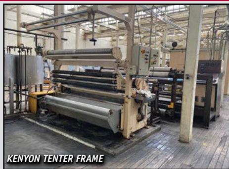
KENYON TENTER FRAME