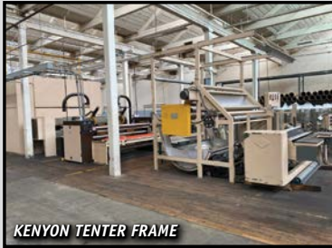
KENYON TENTER FRAME