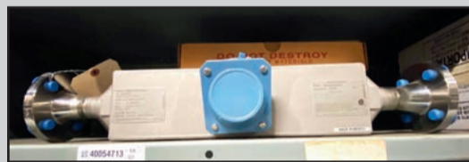
SAMPLE MASS FLOW CONTROL