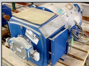
SAMPLE NEW MOTORS