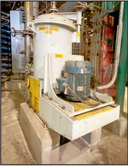
(1 OF 2) METSO MS50 PRESSURE SCREEN