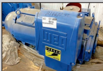
SAMPLE 350 HP WEG ELECTRIC DRIVE MOTOR