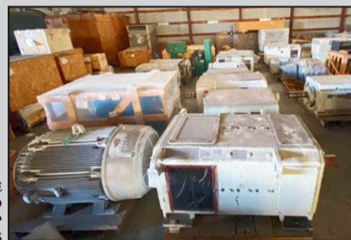
SAMPLE ASSORTED 200–1,500 HP MOTORS