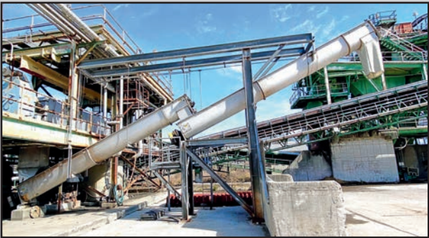
24" DIAMETER X 15' STAINLESS STEEL SCREW CONVEYORS