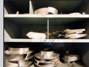
SAMPLE STAINLESS STEEL PUMP IMPELLERS