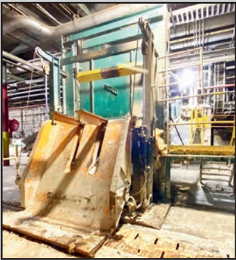
NIELSEN HIEBERT HYDRAULIC ROLL SPLITTER WITH LIFT DISCHARGE CONVEYOR

CORELINK CL-4090 Automatic Core Cutter, with Allen Bradley PLC controls, auto feed system with large capacity core magazine, core notcher, beveler, and capper.