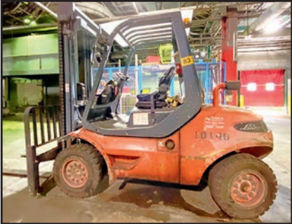
LINDE 8,759-LB. CAPACITY DIESEL FORKLIFT