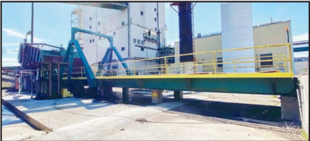
HYDRAULIC TRUCK DUMPER WITH RECEIVING HOPPER AND CONVEYOR