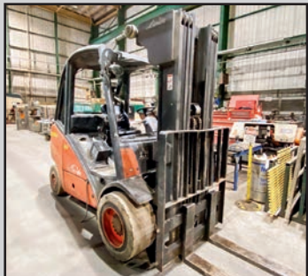
LINDE H300 DIESEL FORKLIFT