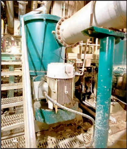
(1 OF 6) JYLHAVAARA PRESSURE SCREENS