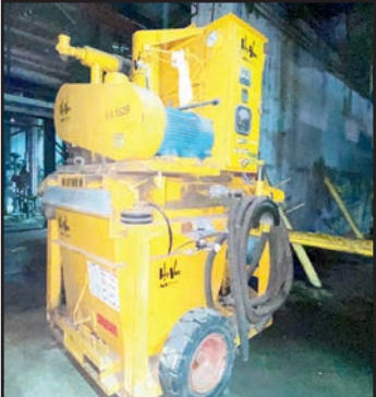
HI-VAC PORTABLE VACUUM UNIT WITH .5 YARD HOPPER