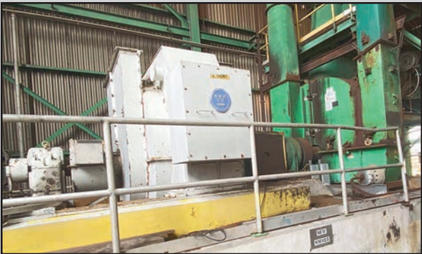
METSO CARTHAGE 84" DISC CHIPPER WITH 1,200 HP DRIVE