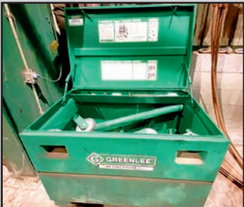
GREENLEE CABLE PULLING SYSTEM

WELDERS & TOOLS MILLER LP and Diesel Welding Generators. RIGID Pipe Threaders. Huge Assortment of Power and Pneumatic Hand Tools. Double-Door Vertical and Horizontal Job Boxes.