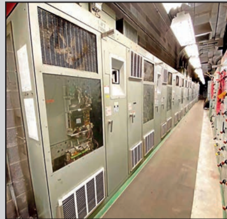
SAMPLE MCC'S AND SWITCH GEAR