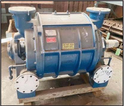
NASH 2,000 CFM REBUILT VACUUM PUMP