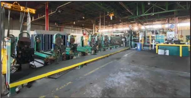
LAM COMPLETE AUTOMATIC ROLL WRAPPING SYSTEM