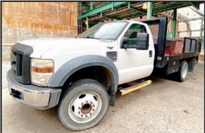
FORD F-450 SERVICE TRUCK