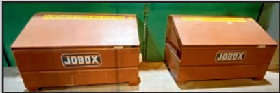
ASSORTED JOB BOXES