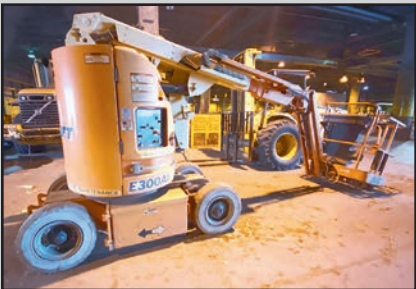
JLG 36' ELECTRIC BOOM MANLIFT