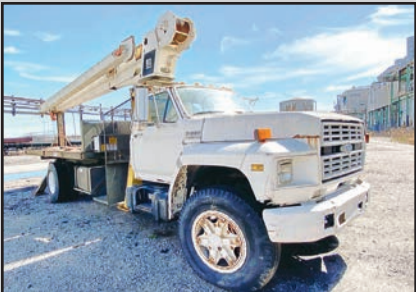
FORD CRANE TRUCK

FORKLIFTS & MATERIAL HANDLING EQUIPMENT VOLVO L-70E wheel loader, with 134 HP diesel motor, 3-yard QC bucket. LINDE 6,000-Lb. and 9,000-Lb. Diesel Forklifts, with side shift. LINDE 6,000-Lb. LP Forklifts, with roll clamps. TEREX 60' Diesel Boom Manlift, with new diesel motor. JLG 36' Electric Boom Manlift. JOHN DEERE 486E Diesel Forklift, 6,000-lb. capacity with side shift. BRODERSON LP Carry Deck Crane. (2) BOBCAT S175 Skid Steer Loaders, one with grapple bucket. FORD Flatbed Crane Truck. FORD F-450 Flatbed Service Truck. HI-VAC Portable Vacuum Loader/Unloader. 72' Total Length Hydraulic Truck Tipper, with receiving hopper and discharge conveyor.