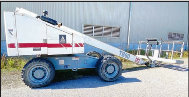
TEREX 60' DIESEL BOOM MANLIFT