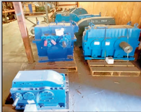
SAMPLE ASSORTED NEW GEAR BOXES