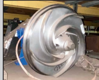
SAMPLE PUMP IMPELLER