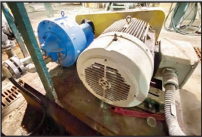
(1 OF 12) ROTOJET HIGH PRESSURE PUMPS