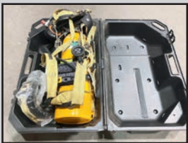
SAMPLE SCBA SYSTEM