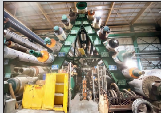
(1 OF 6) A-FRAME ROLL RACKS WITH SPARE ROLLS