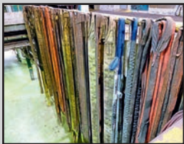
SAMPLE CRANE SLINGS