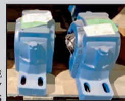
SAMPLE PILLOW BLOCKS