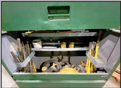
HYDRAULIC JACK SYSTEM, COMPLETE IN JOB BOXES