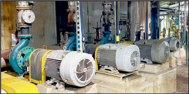
SAMPLE GOULDS STAINLESS STEEL CENTRIFUGAL PUMPS