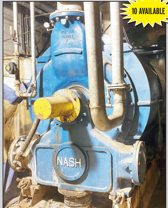
(1 OF 10) NASH 9000 CFM VACUUM PUMPS