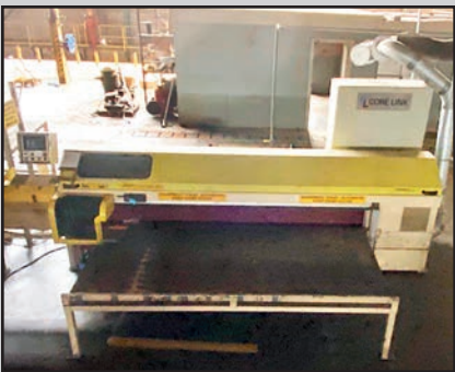
CORELINK PLC AUTOMATIC CORE CUTTER