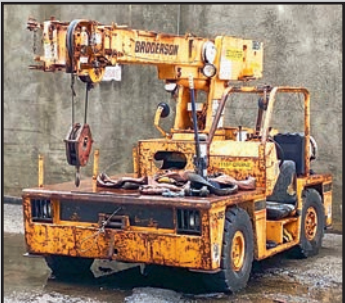
BRODERSON CARRY DECK CRANE