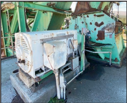
WILLIAMS BARK HOG WITH 800 HP DRIVE