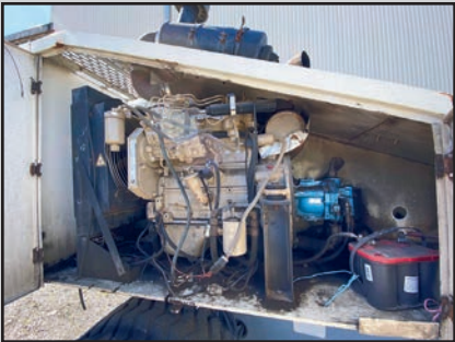
NEW DIESEL MOTOR FOR TEREX LIFT