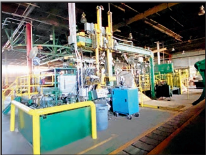
LAM ROLL WRAPPING SYSTEM (REAR VIEW)