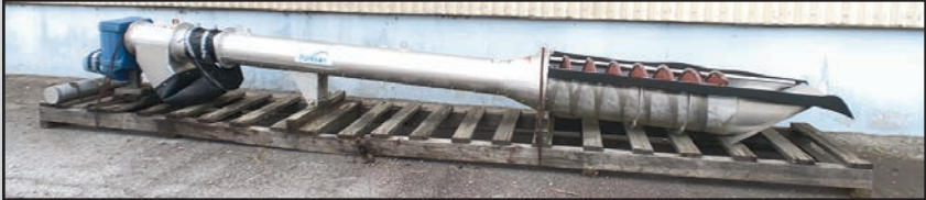
PARKSON HELISIEVE IN-CHANNEL FINE SCREEN

(12) ROTOJET 2100 2X2 D-600 High Pressure Pumps, with 125 HP drives.