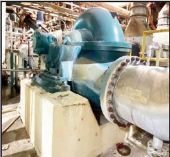
ANDRITZ SPLIT CASE SUCTION PUMP WITH 750 HP DRIVE