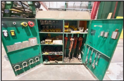
SAMPLE MILLWRIGHT AND RIGGING EQUIPMENT