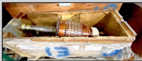
SAMPLE ASSORTED NEW MOTOR ARMATURES