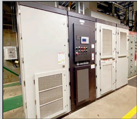
(1 OF 4) ALLEN BRADLEY DRIVE CONTROL CENTERS

Hardware, Fasteners, Brass, Copper, and Stainless Steel.