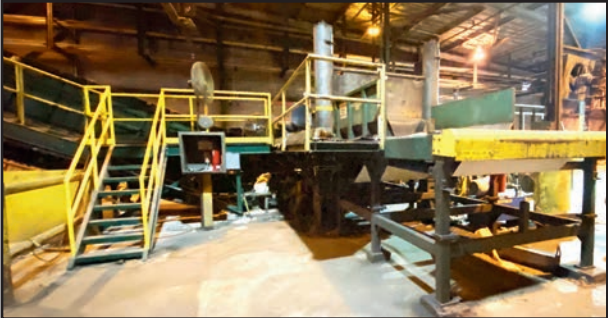
HYMAC HYDRAULIC ROLL SPLITTER WITH SUNDS DEFIBRATOR AND CONVEYOR