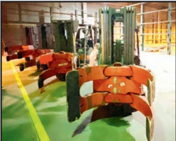
(4) LINDE 6,000-LB. LP FORKLIFTS WITH ROLL CLAMPS