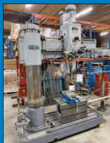
5' Arm X 11" Col. Ooya Model RE-1225 Radial Arm Drill