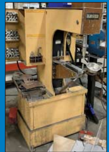
6 Ton Haeger Model HP6-B Hardware Insertion Press