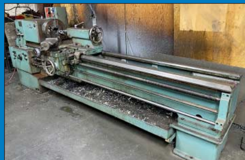
30" x 80" TOS Model SN55B Gap Bed Engine Lathe w/DRO

14" High Point Tool MBS-350 Sliding Table Saw w/ Dust Collector; S/N 991258, 38" X 38" Table, 30" X 30" Sliding Table, 72" Rip Guide