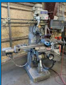
3 HP Sharp Three-Axis CNC Vertical Mill w/ Anilam 1100 CNC Control