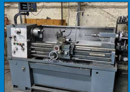
14" X 40" KBC Model GRIP-1440G Gap Bed Engine Lathe