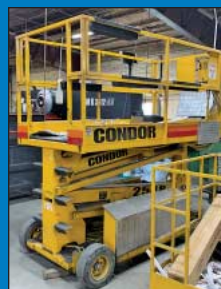
Condor Model 2548 Scissor Lift