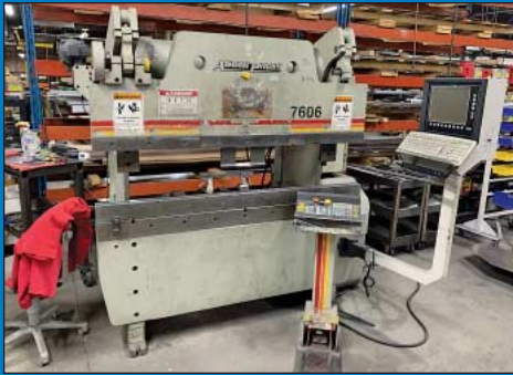
60 Ton X 6' Accurpress Model 7606 Hydraulic Press Brake