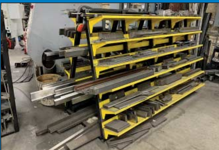
Various Press Brake Dies