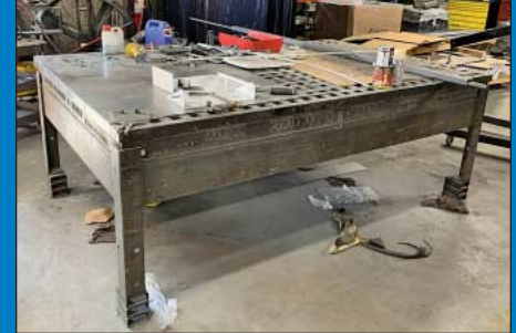
4' X 8' Acorn Welding Table