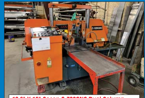
12.6" X 15" Cosen C-320GNC Dual Column Auto Horizontal Band Saw