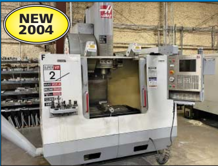
Haas Model VF-2SS CNC Vertical Machining Center