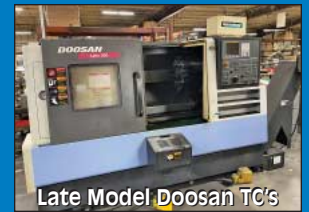
Late Model Doosan TC's