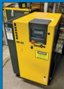
(3) 20 HP Kaeser Model SK-20 Air Compressors