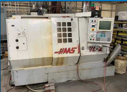
Haas Model HL-2 CNC Turning Center