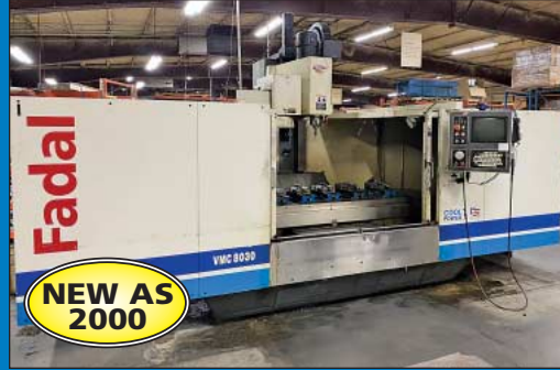
(2) Fadal Model VMC-8030HT CNC Vertical Machining Center