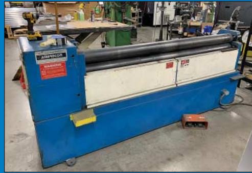
10 Ga. X 6' American Model SRD6130 Plate Rolls