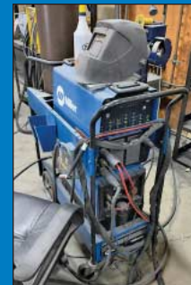
(6) Various Miller and Lincoln Welders, Some with Booms