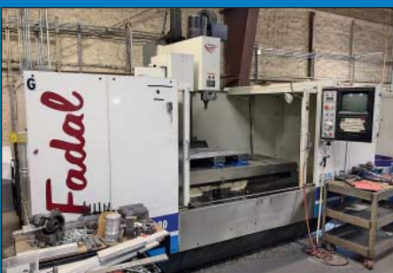
Fadal Model VMC-6030HT CNC Vertical Machining Center