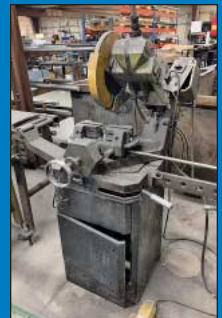
14" Cold Saw