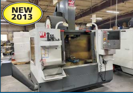
Haas Model VF-2SS CNC Vertical Machining Center