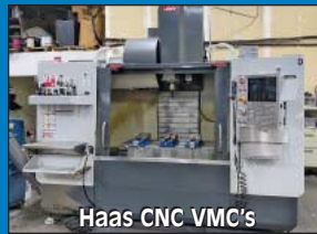
Haas CNC VMC's

Contact Information 2020 Dunlap St. Cincinnati, Ohio 45214 Phone 513-241-9701 Fax 513-241-6760 www.cia-auction.com