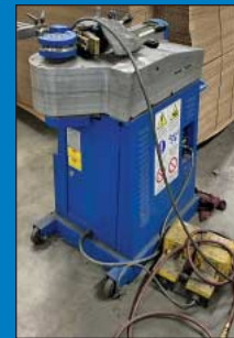
Ercolina Model TOP 030TR1F Hydraulic Tube Bender