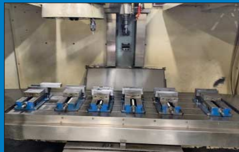
(28) 6" Kurt & Other Machinist Visers