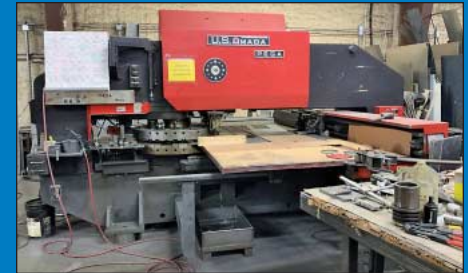
30 Ton Amada Model PEGA-305072 CNC Turret Punch

Office Equipment Including: Desks, File Cabinets, Lateral File Cabinets, Chairs, Breakroom Furniture, Refrigerators & More