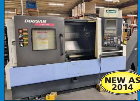
(2) Doosan Model Lynx 300 CNC Turning Centers

3 HP Sharp Three-Axis CNC Vertical Mill w/ Anilam 1100