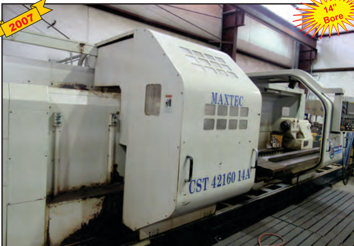
Maxtec CST 42160 14A Flat Bed CNC Hollow Spindle Lathe