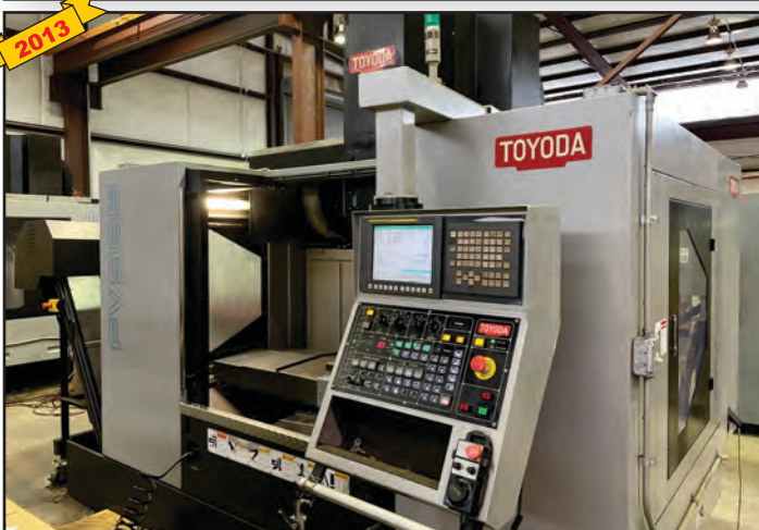
Toyota FV965 CNC Vertical Machining Center