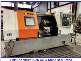
Fortune Vturn II-26 CNC Slant Bed Lathe