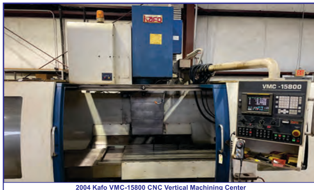
2004 Kafo VMC-15800 CNC Vertical Machining Center