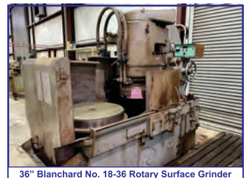
36" Blanchard No. 18-36 Rotary Surface Grinder