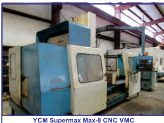
YCM Supermax Max-8 CNC VMC