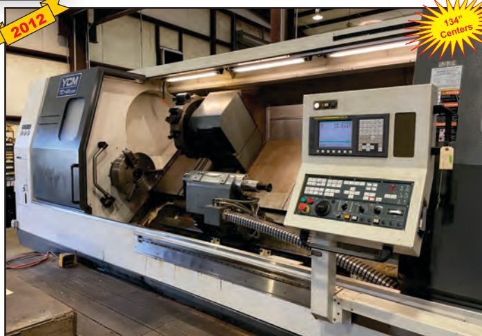
YCM TC-46/3200 CNC Slant Bed Turning Center