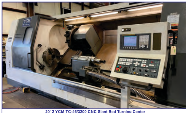
2012 YCM TC-46/3200 CNC Slant Bed Turning Center