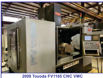
2008 Toyota FV1165 CNC VMC

(3) YCM Supermax CNC VMC's / (2) Toyota CNC VMC's / (2) Kafo CNC VMC's / Maxtec CNC Hollow Spindle Lathe / YCM Slant Bed CNC Lathe / (2) Fortune Vturn II-26 CNC Lathes / (2) Fortune Vturn-46 CNC Lathes / Mitsubishi CNC Wire EDM / (3) Kingston Engine Lathes / Victor Engine Lathe / (3) Vertical Milling Machines / Hyd-Mech Vertical Bandsaw / Tannewitz Vertical Bandsaw / Blanchard Rotary Surface Grinder / Shop Presses / 5k Toyota Forklift / Toyota Pickup / Isuzu Stake Bed Truck / Air Compressors / Tooling for VMC's & Lathes / QC Equipment / Shop Tools and More!