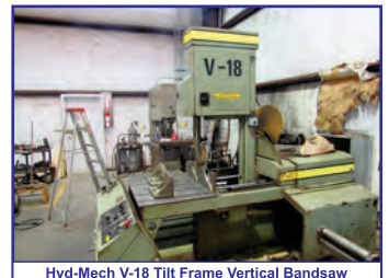
Hyd-Mech V-18 Tilt Frame Vertical Bandsaw