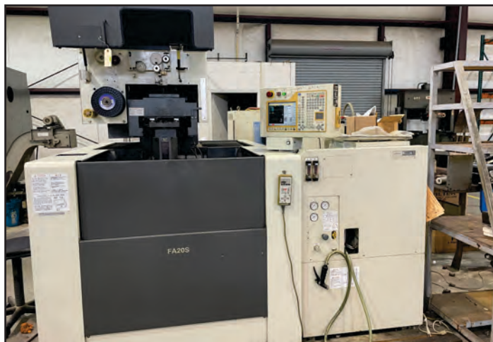
Mitsubishi FA20S CNC Wire EDM