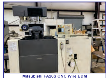
Mitsubishi FA20S CNC Wire EDM