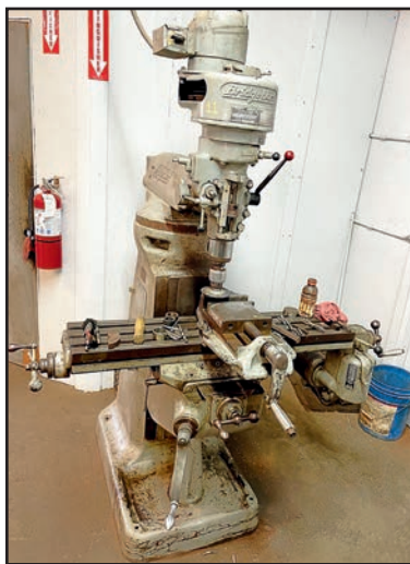
Bridgeport Vertical Turret Mill , S/N BR30117, table 9" x 42", power on longitude, J-head, S/N 18956, 2,720 RPM, pulley, 1 HP, (1) vise