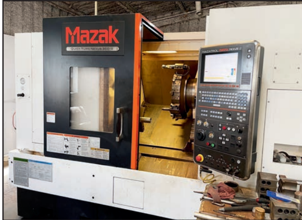
2014 Mazak QTN 350-II Slant Bed CNC Lathe

Presorted First Class Mail U.S. Postage PAID Eugene, Oregon Permit No. 17