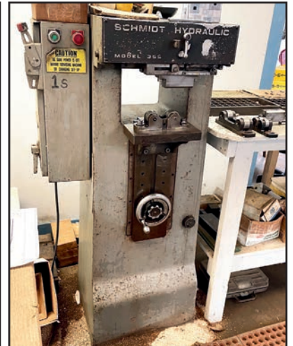
Schmidt Hydraulic Roll Marking Machine , Model 365, S/N 9119