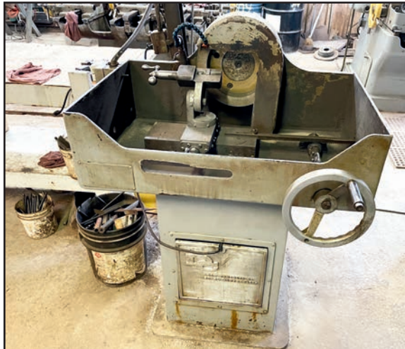
Don Coniglo Chaser Grinder , S/N UNK, 3 HP