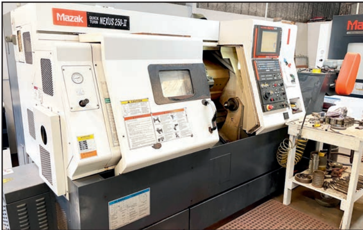
Mazak QTN 250-II Slant Bed CNC Lathe , 10" B210-A8150 hydraulic chuck, hydraulic tailstock, 12 pos. turret, tool presetter, Mazatrol Matrix Nexus control, new 2007, S/N 192520