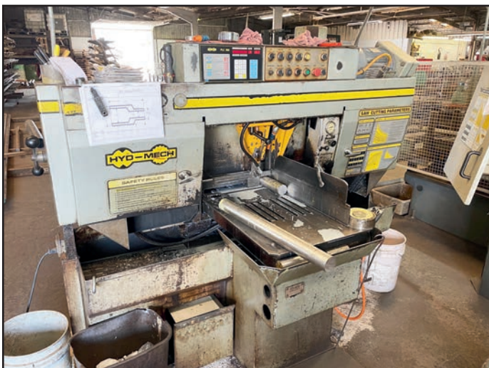
Hyd-Mech Model H12 Automatic Horizontal Bandsaw , 12" round capacity, 1.25" blade size, 5 HP blade drive, 40" shuttle vise stroke, extra infeed conveyor, S/N A0991005