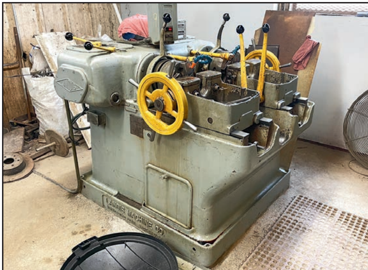
1-1/4" Landis Double Spindle Pipe and Nipple Machine, S/N UNK, (2) 1-1/4" Lanco die heads 10T, S/N T00001-900450-2, S/N 10TSR710, reamer tube and rods