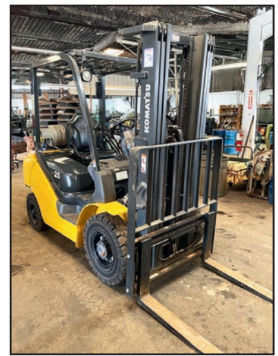
Komatsu Forklift Model FG25T-16 , 5,000-lb. capacity, solid tires, triple stage mast, side shift, new 2012, S/N A225603, (665 hours on meter)