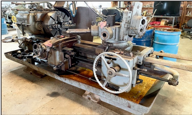
Warner & Swasey Model 3A Turret Lathe , with fixed rear turret, taper on front carriage, 21" 4-jaw chuck, rapid traverse, S/N 528182