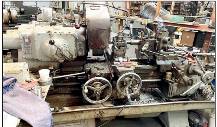
Jones and Lamson No. 3 Ram Type Turret Lathe , S/N 200159, 12" 3-jaw chuck