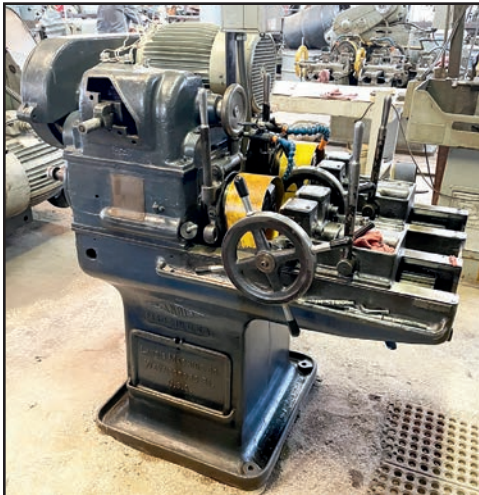
7/8" Double Spindle Pipe and Nipple Machine , S/N 7/8D-286-3, (2) 3/4" Lanco heads, S/N 6T1579, S/N 6T1379