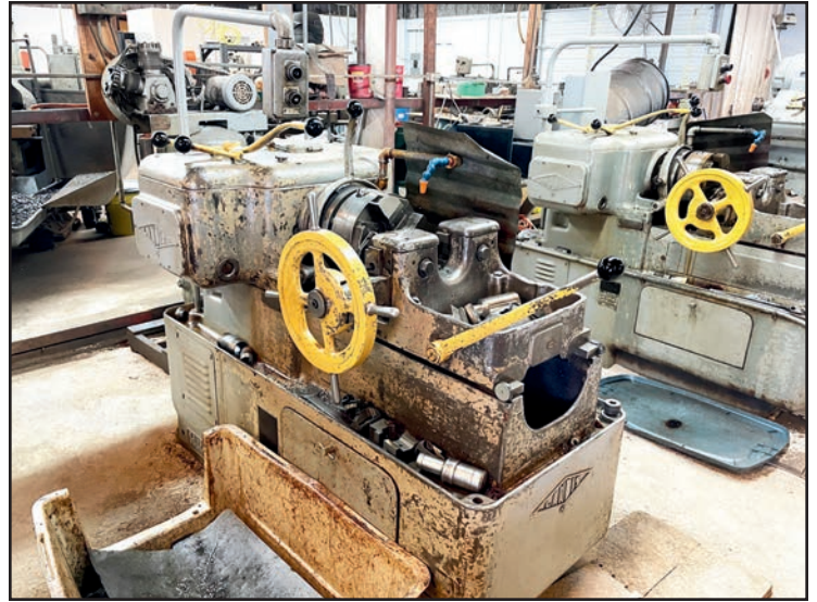
Landis 2" Model 16C Pipe and Nipple Machine , S/N 16CNIA-158, Lanco head, S/N 16T-3295, 2" to 2-1/2" capacity, reamer tube and rod (2 Available)