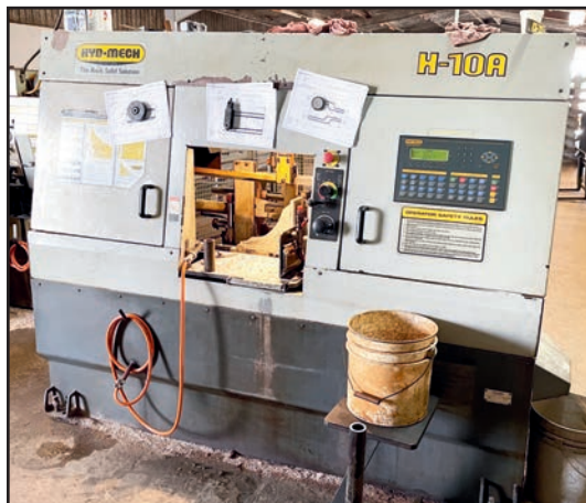
Hyd-Mech H-10A Horizontal Bandsaw