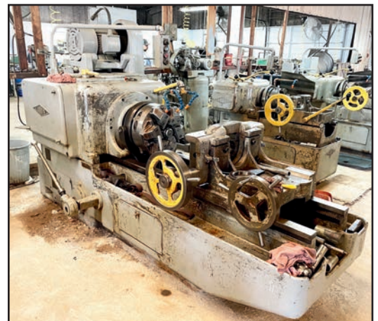
Landis Model 48C Pipe and Nipple Machine