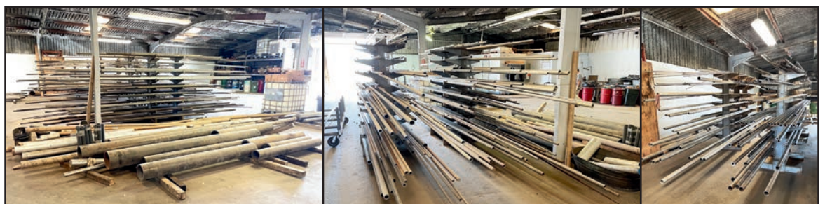
Stainless and Other Raw Material