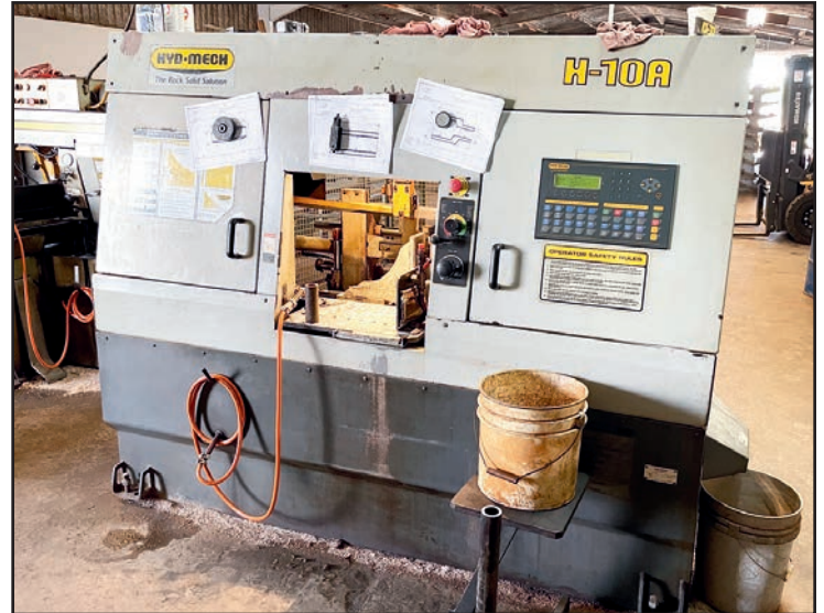
Hyd-Mech H-10A Horizontal Bandsaw, 10" round capacity, 1.25" blade size, 5 HP blade drive, 24" shuttle vise stroke with multiple indexing, split front vise, PLC control with 99 job storage, chip auger, extra infeed conveyor, S/N HSA1206082