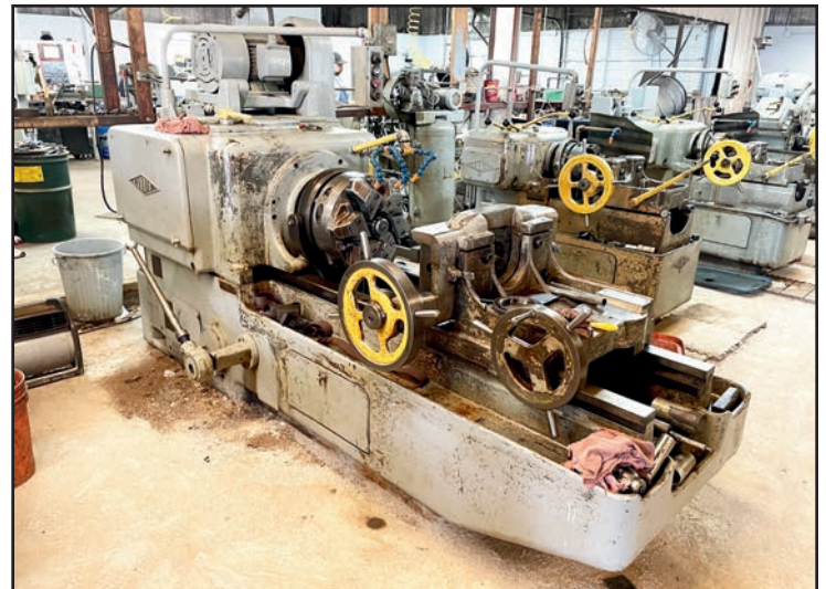
Landis Model 48C Pipe and Nipple Machine, S/N 48CNIP-06 w/6 holders, head, S/N 48T03, 30" bed, reamer tube and rod