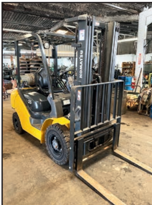
Komatsu 5,000-lb. Forklift