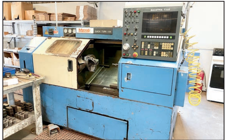
Mazak Quick Turn 15N CNC Lathe , 10" chuck, tool presetter, tailstock, Mazatrol T32B control with Mazak Micro disk system, new 1991, S/N 98518