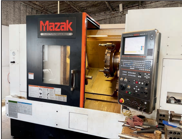
2014 Mazak QTN 350-II Slant Bed CNC Lathe, 12" Kitigawa bb212a115a hydraulic chuck, tool presetter, hydraulic tailstock, 12 pos. turret, Mazatrol Matrix Nexus 2 CNC control, S/N 251362