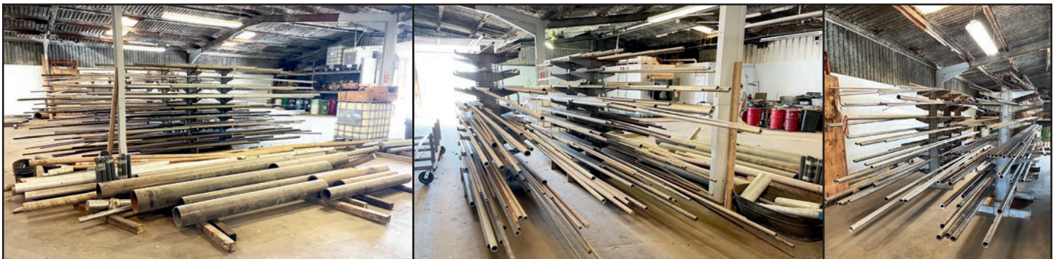
Solid and Tubular Stainless Raw Material and Racks with MTR's.

For machine specifications, download the catalog on www.harris-auctions.com