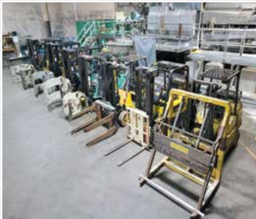
Forklifts and Roll Clamp Trucks

Refiners, Screens, Cleaners, Wrappers, Blowers, Chillers, Air Compressors, Core Cutters, Slitter Rewinders, Conveyors, Safety Equipment, Forklifts, Dump Truck & More!