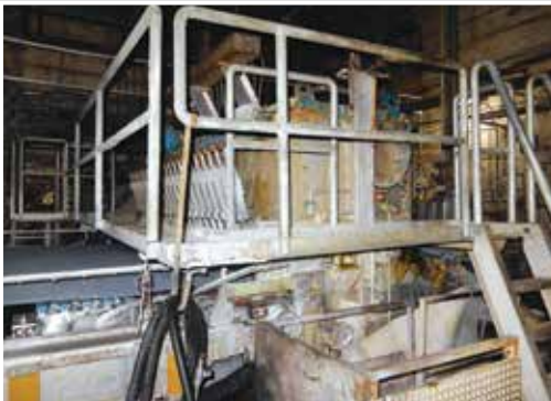
MEC-FAB 129" Air Pad HeadBox