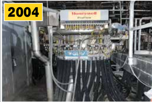
HONEYWELL GL&V Press Scanner