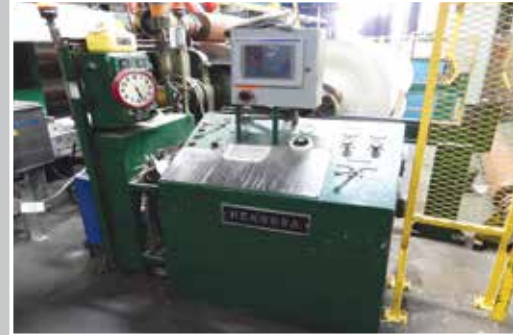
NEKOOSA Horizontal Track Reel