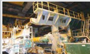
Press Section PM3