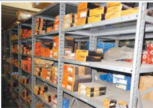
View of Bearings