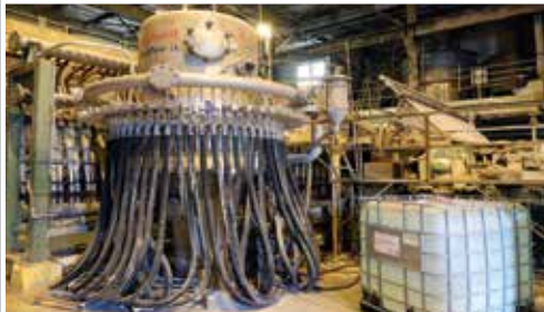
HONEYWELL Position Profile Dilution System

17177 N. Laurel Park Dr., Suite 236 Livonia, MI 48152