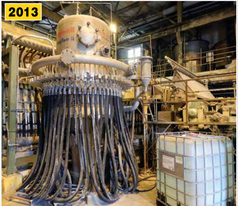
HONEYWELL Model ProFlow II Position Automatic Profile Dilution System