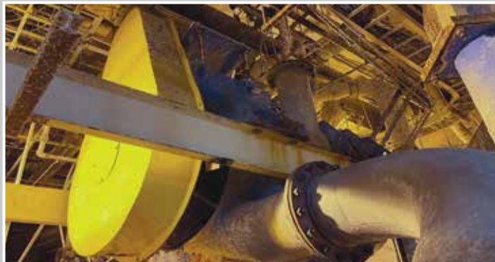
VOITH CONTAMINEX CMS20 Scavenger