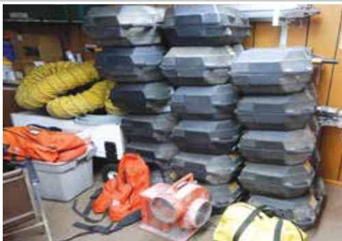
View of Safety Equipment