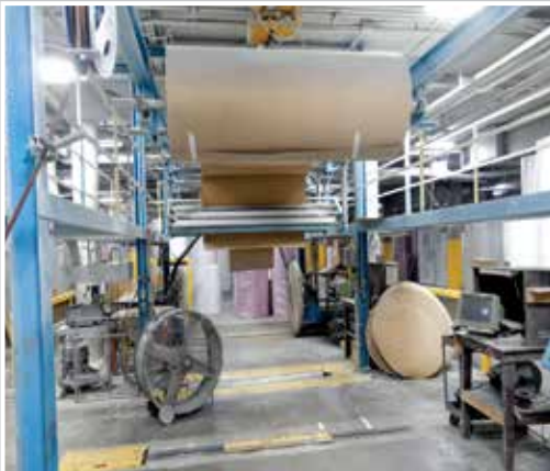
View of Roll Wrappers