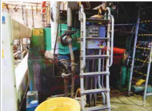
MANCHESTER 2-Roll Calendar