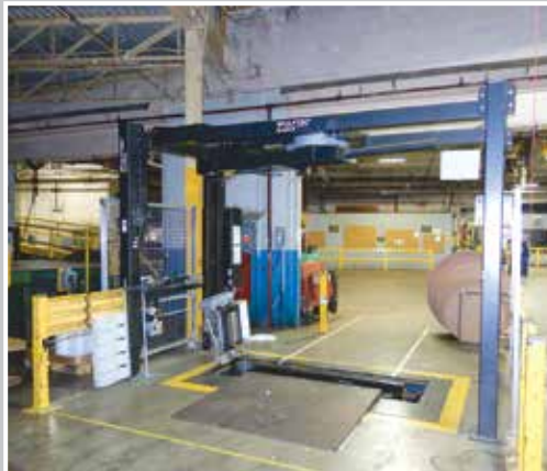
WULFTEC Roll Wrappers