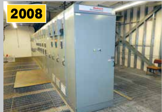
Rockwell Automotive Drives of PM3