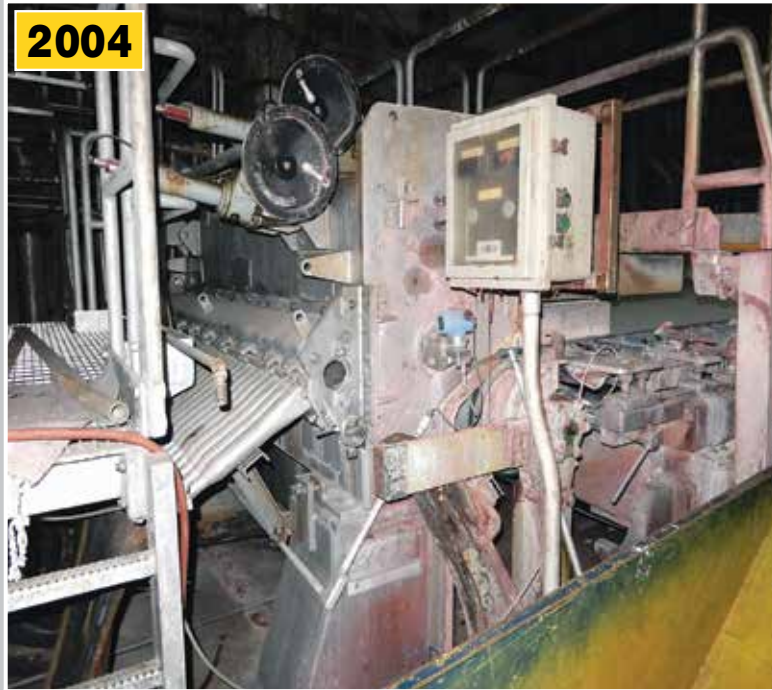
GL&V 105" Pond Dilution Control HeadBox