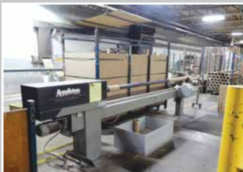
Appleton A301 Core Cutter