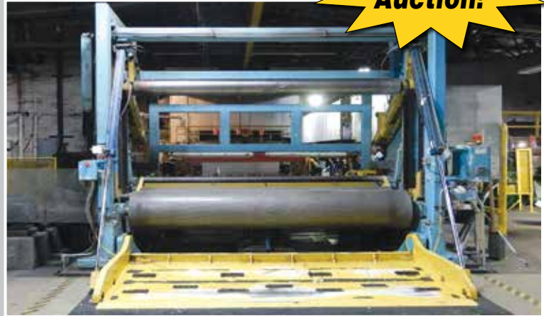
138" ASSOCIATED MACHINE DESIGN 4000 FPM Slitter Rewinder