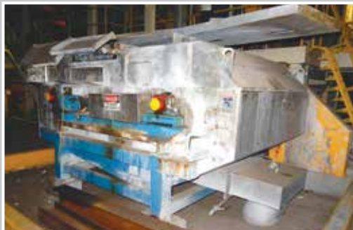
BLACK CLAWSON Model DNT-200 Washer