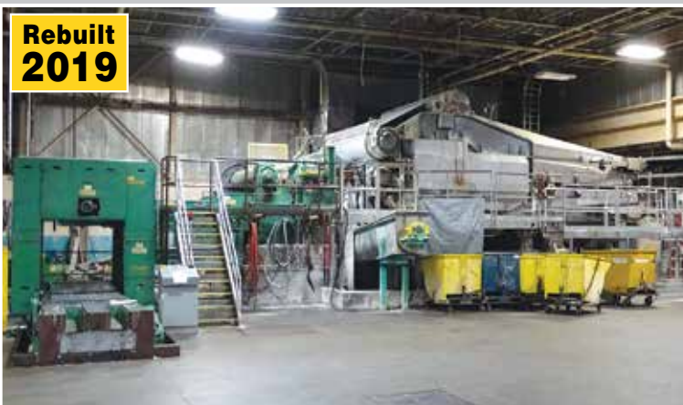
122" METSO Twin Wire Wetlap Machine 232 BDTPD