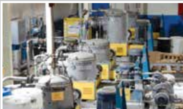
100 TPD DEINKING Plant Black