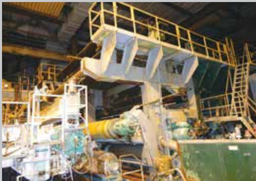
Press Section PM3