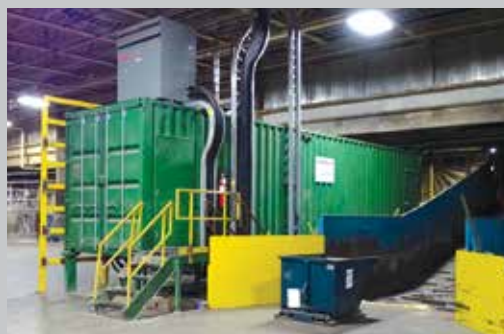
New Electronics System Enclosed Trailer