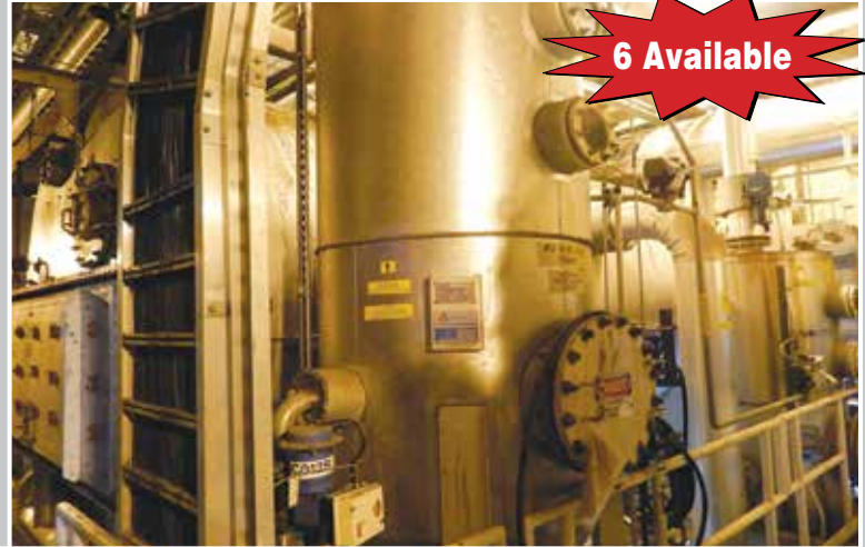
Views of EFFECT AQUA-CHEM Black Liquor Evaporator System