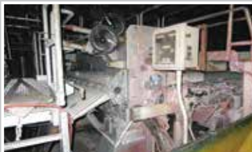
GL&V Pond Dilution Control HeadBox