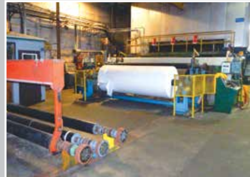
MANCHESTER Horizontal Track Reel