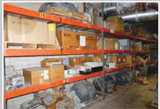
View of Electrical Spares