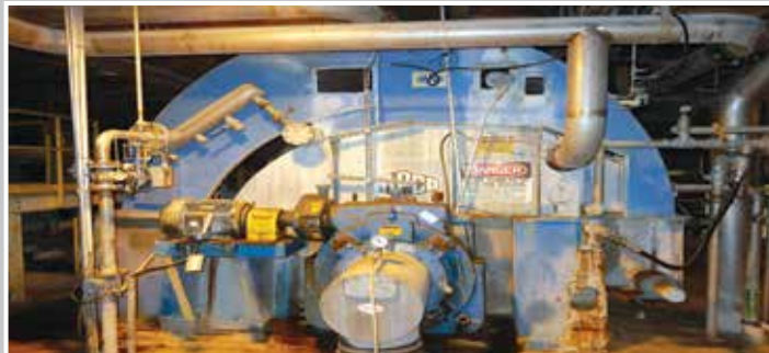
IMPCO Coru-Dek Stainless Steel Vacuum Washer