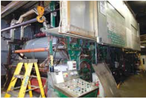
View of Dryer Section