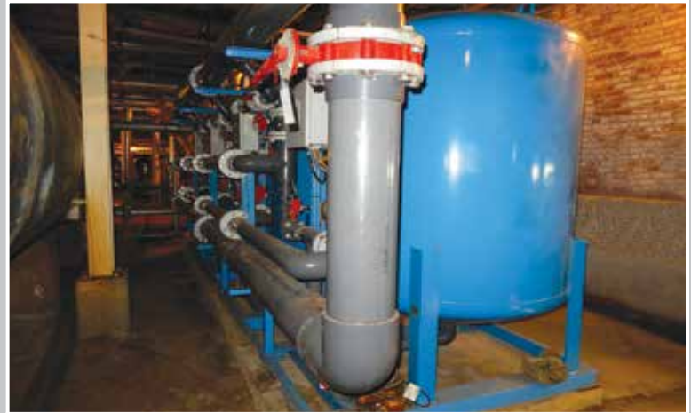
Sand Filtration System