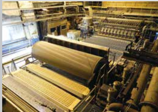
Fourdrinier of PM3