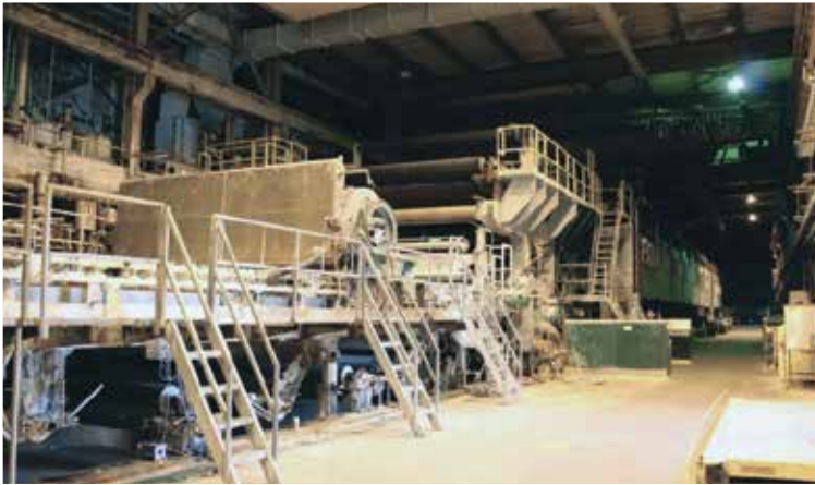
180" (160" TRIM) FOURDRINIER MACHINE