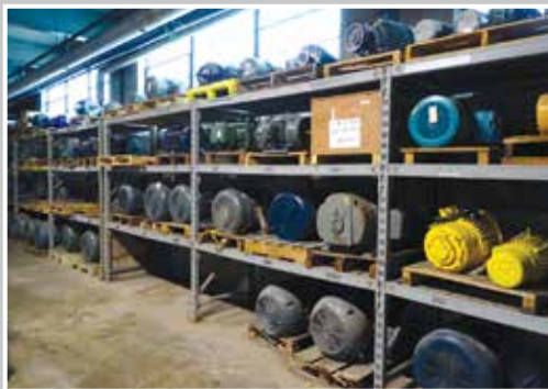
View of Motors