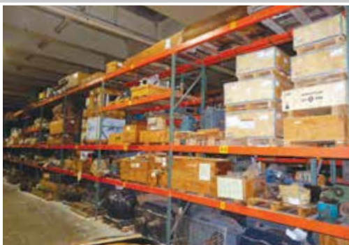
View of Spare Parts