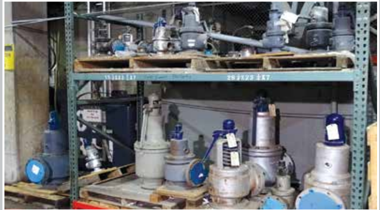
View of Valves