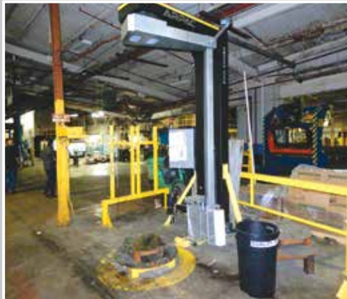
ARPAC Roll Wrapper