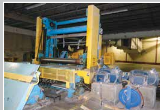
CAMERON Slitter Rewinder