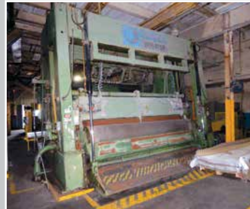
JAGENBERG Slitter Rewinder