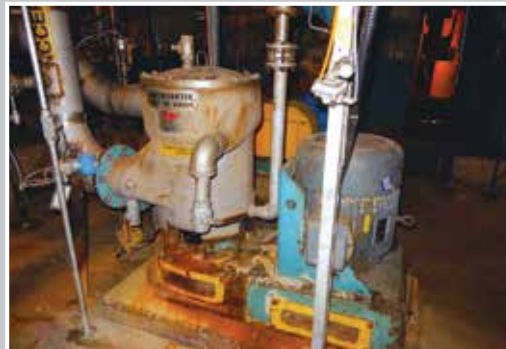
BIRD Centrisorter Screen