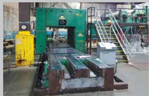
WETLAP Layboy Stacker