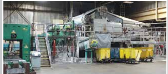
122" METSO Twin Wire Wetlap Machine 232 BDTPD