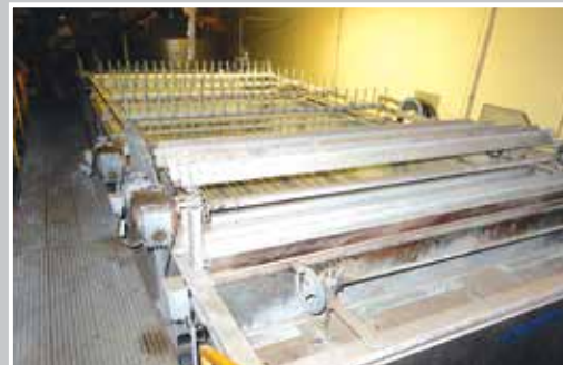
POSIDEN Dissolved Air Flotation Clarifier