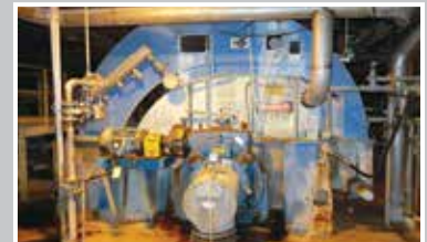
IMPCO Coru-Dek SS Vacuum Washer

TERMS & CONDITIONS | PAYMENT: Full payment within 24 hours. Payment is Cash, Cashier's check, Certified Check, or Wire Transfer. No other forms of payments will be accepted. Full Payment Must be Made before removal of Purchase. Everything is Sold "As-Is, Where-Is." All Sales Final. Cost and Responsibility for Removal of Purchase Remains with the Purchaser. Every Effort will be Made to Facilitate Removal. While Quantities and Descriptions are Believed to be Accurate, the Auctioneer, Owners or Counsel Make no Warranties or Guarantees Either Expressed or Implied as to Authenticity, Genuineness of, or Defects in Any Lot and will not be Held Responsible for any Advertising Discrepancies or Inaccuracies. No Warranties Whatsoever are Made as to Condition Merchantability or Fitness for Use of Any Item. May we Suggest you Take Full Advantage of the Preview and Inspection Period. Sale Subject to Additions, Deletions and Prior Sales. Please Check Availability of Equipment.