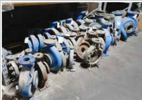
View of Spare Pumps