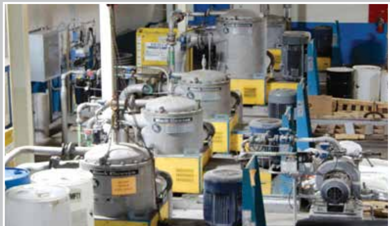
View of BLACK CLAWSON UV Screens