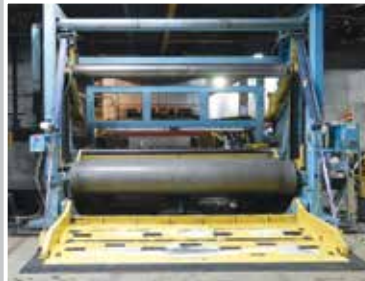
4000 FPM Slitter Rewinder