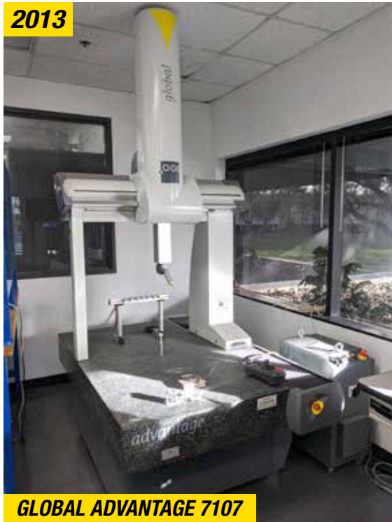
GLOBAL ADVANTAGE 7107