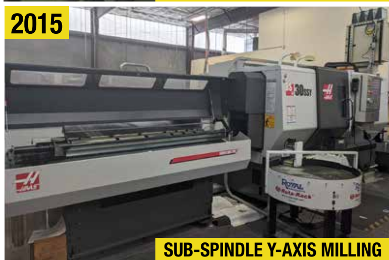
SUB-SPINDLE Y-AXIS MILLING