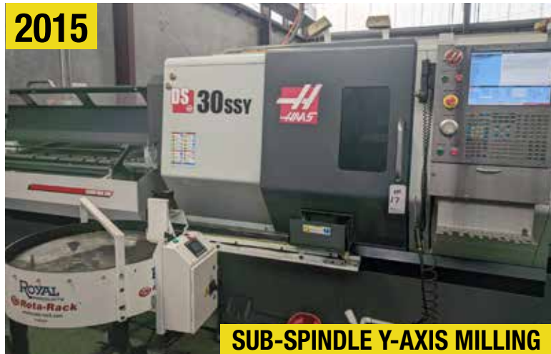
SUB-SPINDLE Y-AXIS MILLING