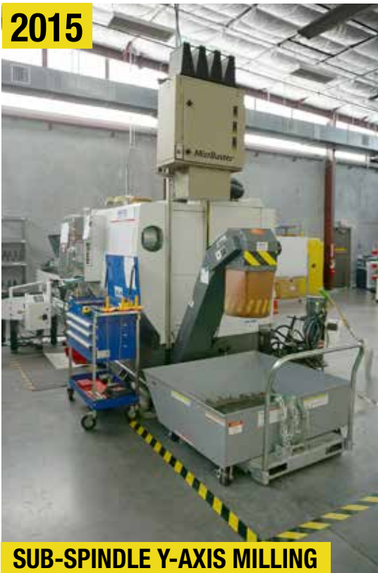
SUB-SPINDLE Y-AXIS MILLING