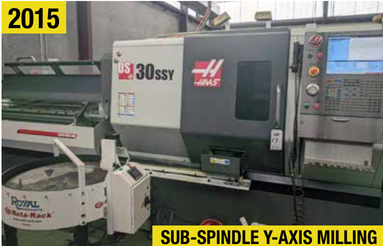
SUB-SPINDLE Y-AXIS MILLING