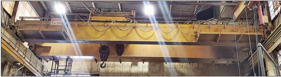
50 Ton / 15 Ton x 60' Span Reading Overhead Bridge Crane