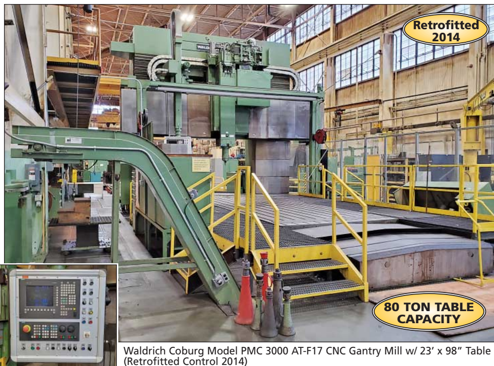
Waldrich Coburg Model PMC 3000 AT-F17 CNC Gantry Mill w/ 23' x 98" Table (Retrofitted Control 2014)