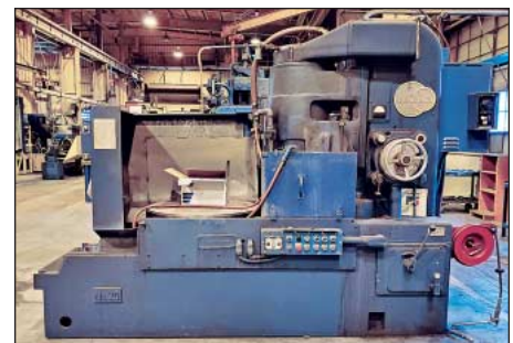
36" Blanchard Rotary Surface Grinder