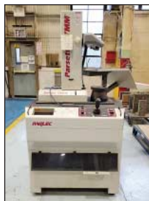
Parlec Tool Setter