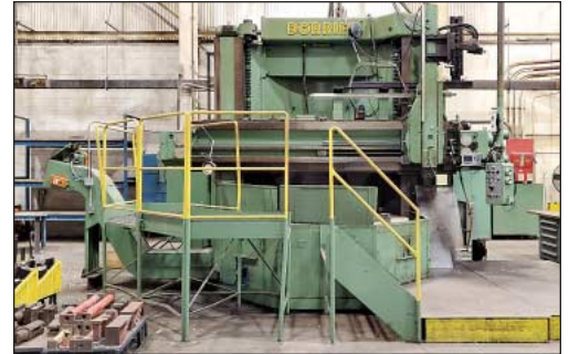
96" Dorries Vertical Boring Mill