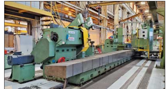
90" x 32' Safop Leonard Model 70/L-MC Large Capacity CNC Lathe with Milling & Y-Axis