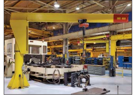
(200 +/-) Column & Free-Standing Jib Cranes to 4-Ton

Pointer Tool Grinder, Oliver Auto Wet Drill Pointer, Black Diamond Drill Sharpener, Sterling Tool Grinder, Cincinnati Universal #2 Tool Grinder