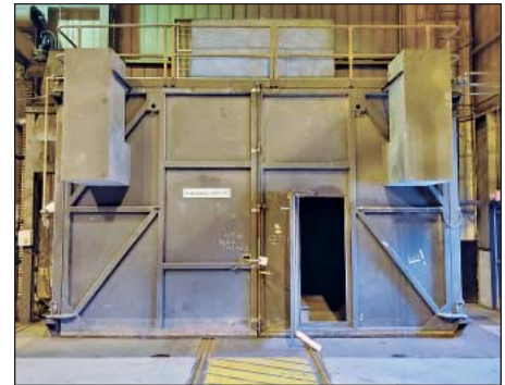
28' x 20' x 13' H Wheelabrator Air Blast Booth

(3) Greenerd No. 3 Arbor Presses, Beverly Bench Shear, Roper Whitney Punch