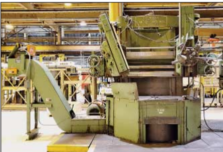
64" Bullard Cutmaster Vertical Turret Lathes