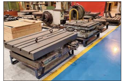
Numerous Large Capacity Rotary Tables

Variety of Lifting Magnets; up to 3,000 Lb.