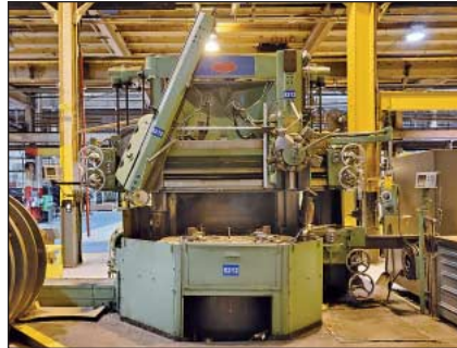
64", 54", 42", 30" Bullard Cutmaster Vertical Turret Lathes