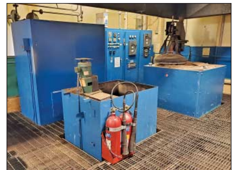
Various Heat Treat Furnaces and Related