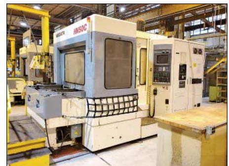
(7) Niigata Model HN50C CNC Horizontal Machining Centers