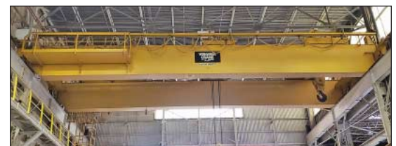
75 Ton/ 30 Ton x 60' Span Virginia Overhead Bridge Crane