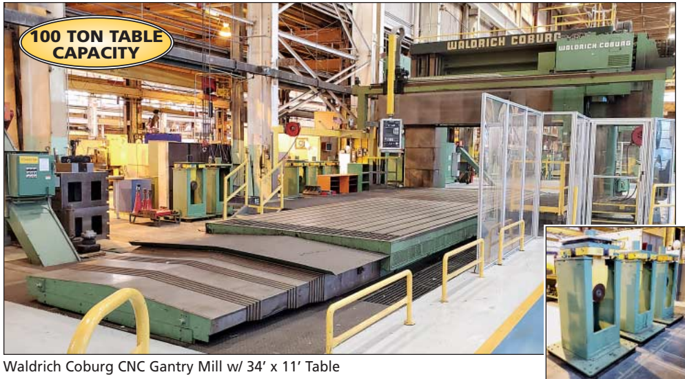
Waldrich Coburg CNC Gantry Mill w/ 34' x 11' Table

40" X 15' American Gap Bed Engine Lathe; 32" 4-Jaw Chuck, Taper Tool, Tailstock, Cross Slide, Power Carriage, Newall DP700 DRO 2-Axis Control, 17' Bed, (2) Steady Rests, Coolant Wash System