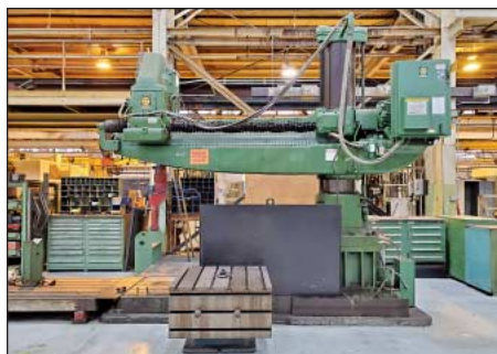
9' Arm x 15" Col. Cincinnati Bickford Radial Arm Drill