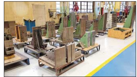
Angle Plates of All Sizes and Styles