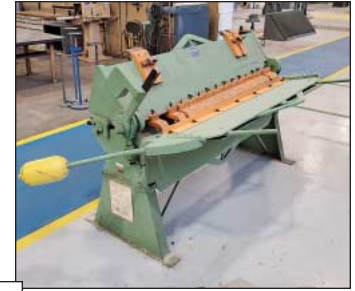
Complete Fabricating Department, Rolls, Shears, Brakes and Related