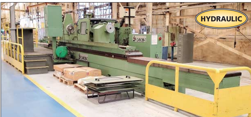
40" x 240" Danobat Model RU6000-P Hydraulic Cylindrical Grinder