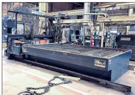
8' X 15' MG Plasma Table w/ Hyper-Therm Plasma Supply