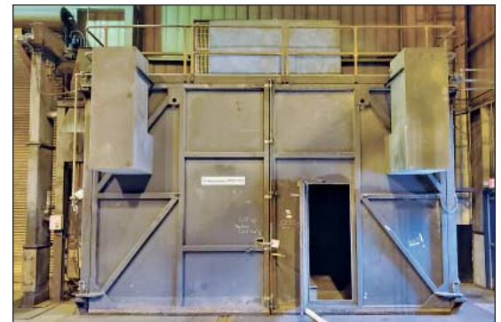
28' x 20' x 13' H Wheelabrator Air Blast Booth