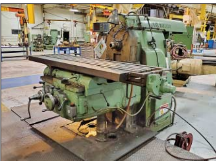
Huge Quantity Toolroom Machinery