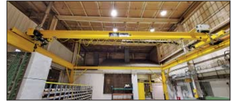
5-Ton x 32' Span Simmers Free-Standing Overhead Bridge Crane