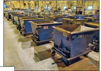
Late Model Plant Support Equipment, Air Compressors, Forklifts, Hoppers