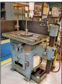
Davis Model 15 Keyseater