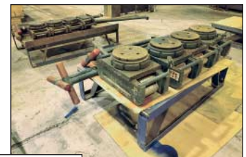
(1,000+) Lots of Support Equipment, Maintenance Tools and Parts, Machinery and Related