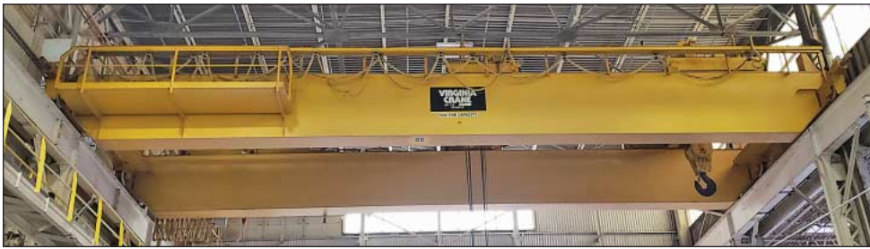
75 Ton/ 30 Ton x 60' Span Virginia Overhead Bridge Crane