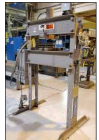
(1,000+) Lots of Support Equipment, Maintenance Tools and Parts, Machinery and Related