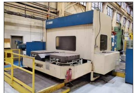
Toyota Model FH100 CNC Horizontal Machining Center