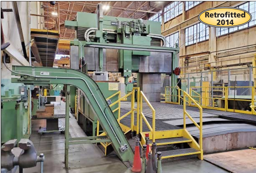
Waldrich Coburg Model PMC 3000 AT-F17 CNC Gantry Mill w/ 23' x 98" Table (Retrofitted Control 2014)

INSPECTION: THURSDAY, MARCH 4TH & FRIDAY, MARCH 5TH, FROM 9:00 AM TO 4:00 PM