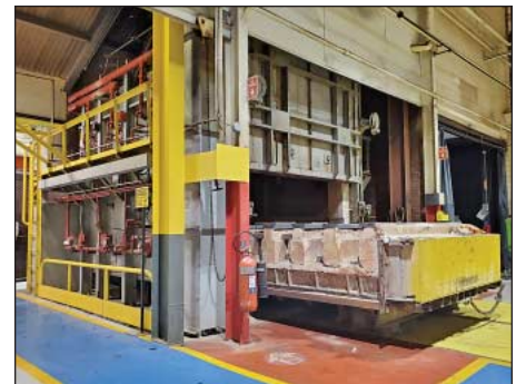
144" x 96" W x 68" H Dempsey Car Bottom Furnace to 1,800 Degree F