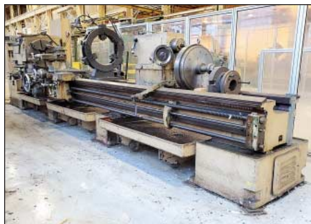
32" X 16' Leblond Model 3220-25 HD Engine Lathe