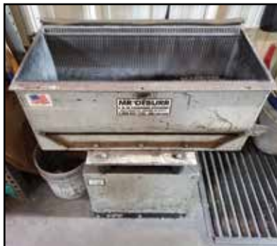
C&M MT Deburring Media Finisher