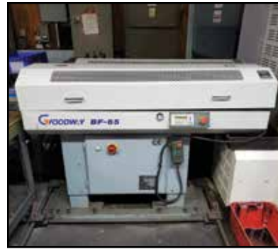
GOODWAY BF-65 Bar Feed