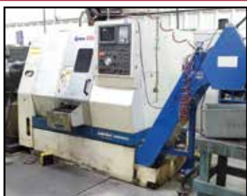
(2) DOOSAN Lynx 220 CNC Turning Centers