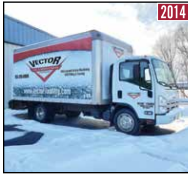
ISUZU NPR HD 20' Box Truck