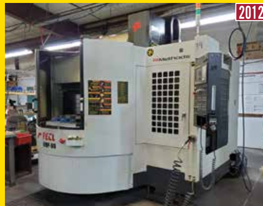
FEELER VMP-800 APC CNC Vertical Machining Center