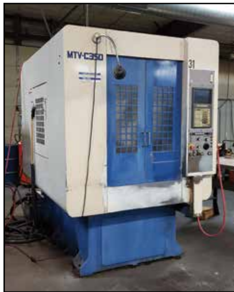
MIYANO MTV-C350 CNC Vertical Machining Center