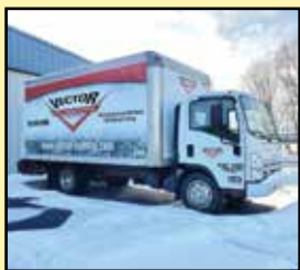
2014 ISUZU NPR HD Box Truck