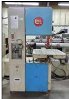
GROB 4V-18 Vertical Metal Band Saw