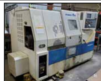
(2) DAEWOO Puma 200 CNC Turning Centers