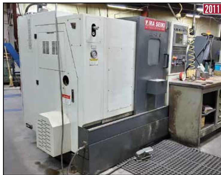
YAMA SEIKI GLS-2000 CNC Turning Center

CLAUSING Floor Drill Press NORTHERN 16-Speed Floor Drill Press MILWAUKEE 14" Abrasive Chop Saw w/Clamp C&M MT Deburring Media Finisher Center Balance Machine Double End Pedestal & Bench Grinders Bench-Top Vertical Drill Presses DAKE No.1 Arbor Press , 7" Throat Vertical Belt Sanders Contour Machining Tables (10+/-) KURT & Other 4"-8" Machine Vises Spring & R Type Collets • CAT & BT 40 Tool Holders • Wide Selection of Chuck Accessories