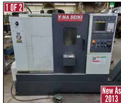
(2) YAMA SEIKI CNC Turning Centers