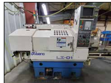
MIYANO LZ-01 CNC Lathe