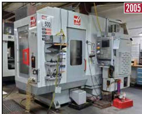
HAAS MDC-500 CNC Mill Drill Center