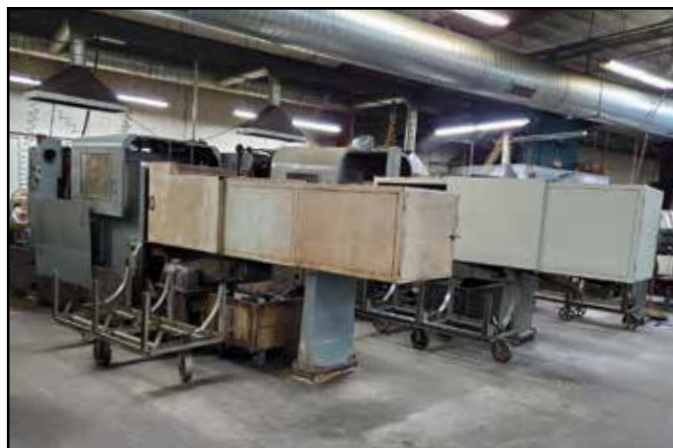
(9) WICKMAN 8- & 6-Spindle Automatic Screw Machines