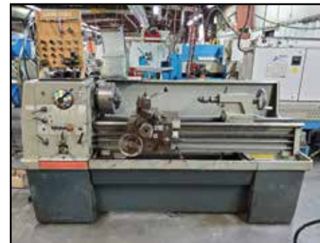
CLAUSING-COLCHESTER 15" Engine Lathe