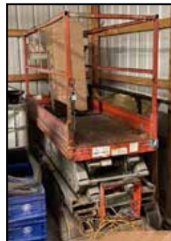
JLG Electric Scissor Lift