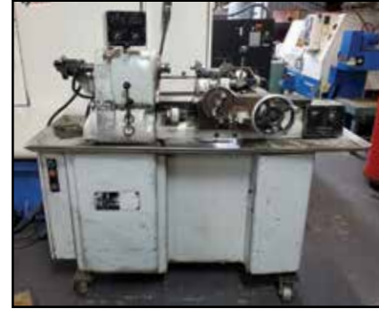
HARDINGE Engine Lathe