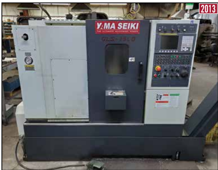
YAMA SEIKI GLS-1500 CNC Turning Center