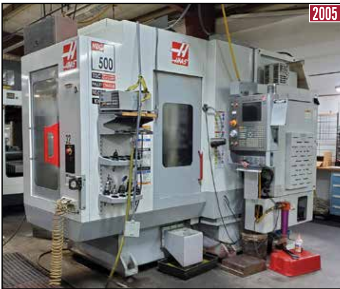
HAAS MDC-500 CNC Mill Drill Center