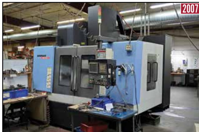
DOOSAN MV 4020LS CNC Vertical Machining Center

Inspection: Day Prior to Auction from 9AM-4PM