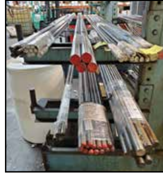
Quantity of Assorted Aluminum & Steel Bar Stock