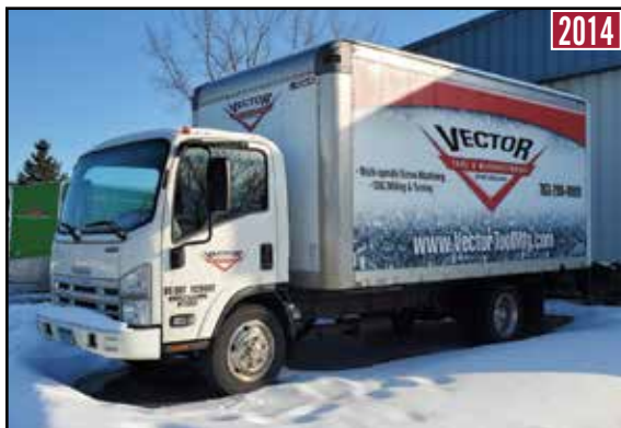
ISUZU NPR HD 20' Box Truck