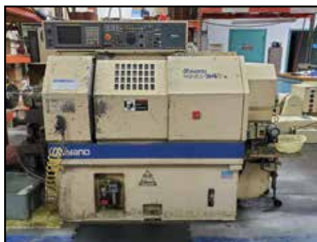
MIYANO BND-34T3 CNC Lathe