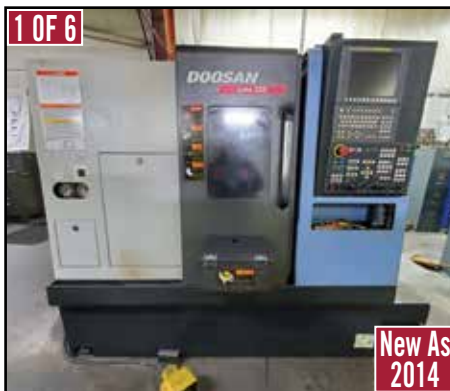
(6) DOOSAN & DAEWOO CNC Turning Centers