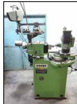
HAHN & KOLB STUTTGART Hobb Machine