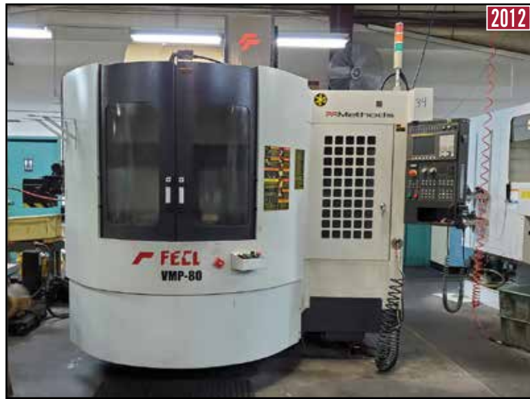
FEELER VMP-800 APC CNC Vertical Machining Center