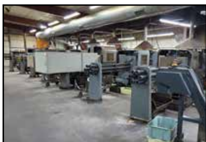
(9) WICKMAN 8- & 6-Spindle Automatic Screw Machines

PRESORTED FIRST CLASS MAIL U.S. POSTAGE PAID CINCINNATI, OH PERMIT NO. 5714