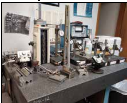
Quantity of Dial Pressure Gauges