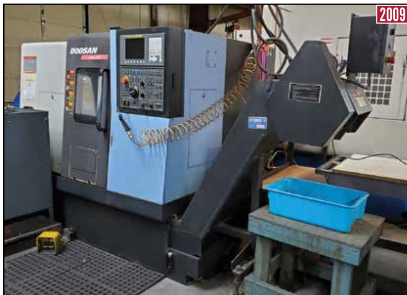
DOOSAN Lynx 220 CNC Turning Center