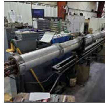
LNS Hydro Bar 5-Station Bar Feeder