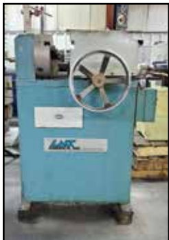
LNS 115-JB3 Horizontal Chamfering Machine