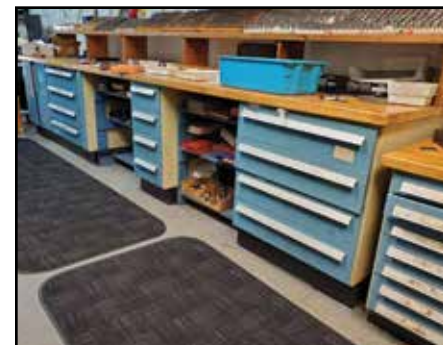
Modular Tool Cabinets w/Butcher Block Tops