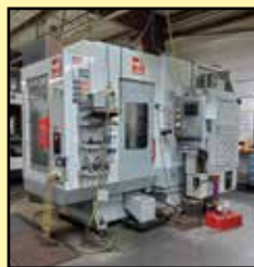
2005 HAAS CNC Mill Drill Center