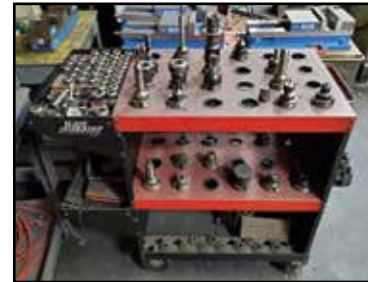
CAT & BT 40 Tool Holders

24-Station ATC, Haas Rotary Control, Haas CNC Control, S/N 40101 EXCEL 810 CNC Vertical Machining Center , 19" x 35" Table, 24-Station ATC, CAT 40 Taper Tooling, Fanuc O-M CNC Control, Chiller, S/N ES81003 MIYANO MTV-C350 CNC Vertical Machining Center , Yasnac Control, Dual Pallets, 15-Station ATC, Chip Conveyor, S/N MTV-C3500221 WOODWAY BF-65 5' Bar Feeder