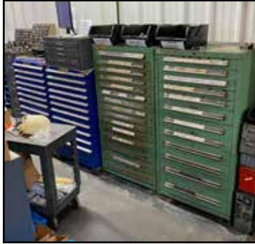
Assorted Modular Tool Cabinets