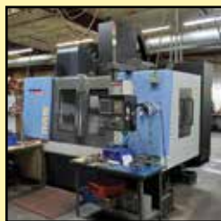
2007 DOOSAN CNC VMC