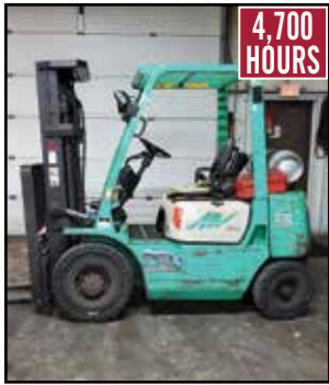
MITSUBISHI FG-20-B 4,000-lb. Forklift