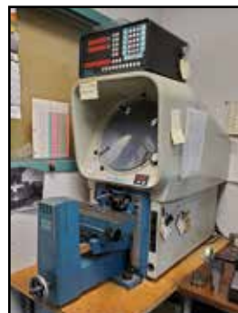
DELTRONIC Optical Comparator