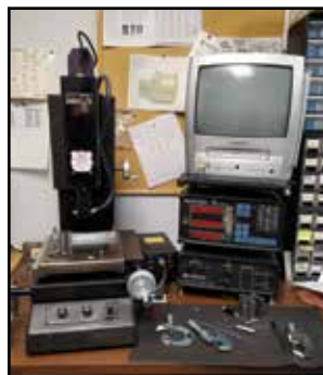
MICRO-VU Video Reticle Microscope