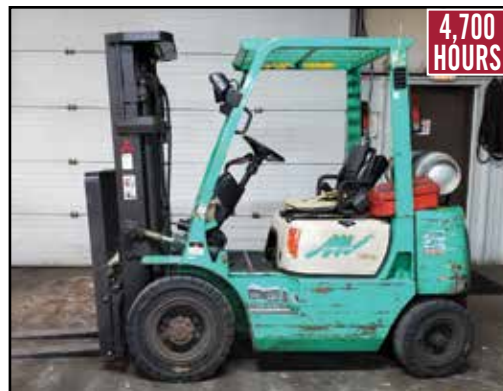
MITSUBISHI FG-20-B 4,000-lb. Forklift