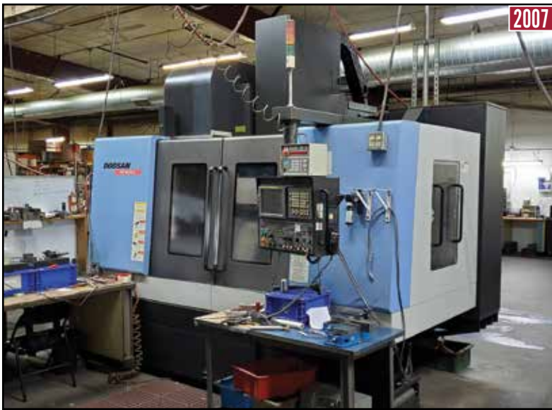
DOOSAN MV 4020LS CNC Vertical Machining Center