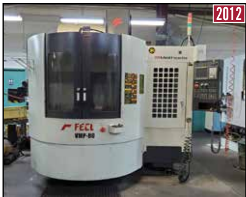
FEELER VMP-800 APC CNC Vertical Machining Center