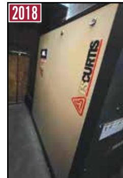
FS Curtis 50-HP Air Compressor