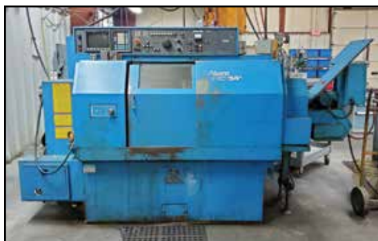
MIYANO BNC-34T, 4-Axis CNC Lathe