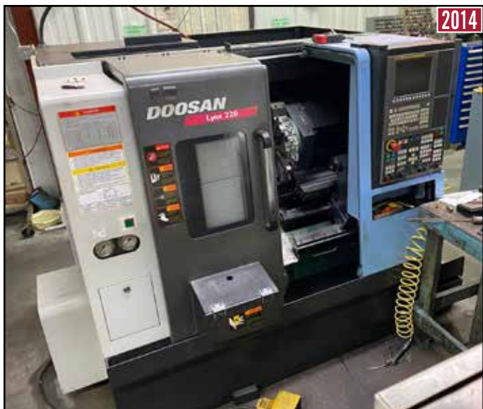
DOOSAN Lynx 220 CNC Turning Center