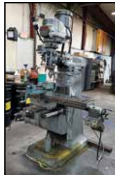
BRIDGEPORT Series 1 2-HP Vertical Mill