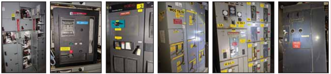
Motor Control Centers, Switchgear Panels, Innovations Cabinets, Sub-Stations—GE, SQUARE D, ALLIS-CHALMERS & Other