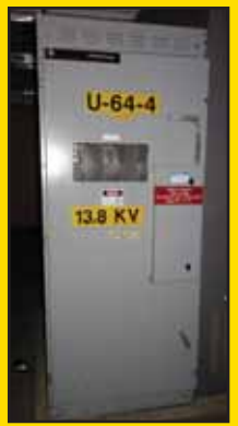
Circuit Breakers, Load Interrupter Switches, Inverter Drives, Electrical Modules, Starters, Fuses & More — GE, WESTINGHOUSE, CUTLER HAMMER & Other