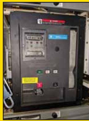
Motor Control Centers, Switchgear Panels, Innovations Cabinets, Sub-Stations—GE, SQUARE D, ALLIS-CHALMERS & Other