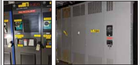
Transformers – GE, SQUARE D & Other