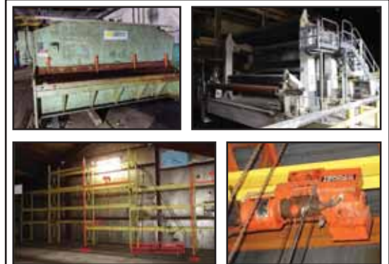
AMERICAN Shear, COFFING & WRIGHT Hoists, VALMET OPTIREEL PLUS, VOITH SULZER Paper Roll Assembly, Pallet Racking & More