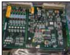
Boards — ALLEN BRADLEY & GE SPEEDMATIC