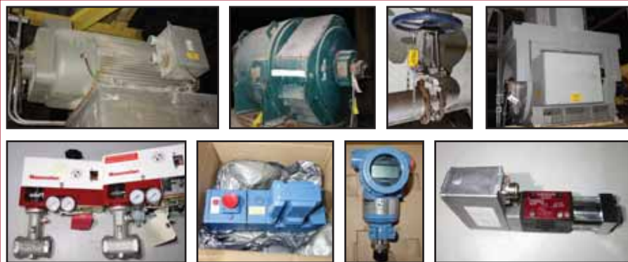
Motors, Pressure Transmitters, Stainless & Pneumatic Valves – GE, RELIANCE, ROSEMOUNT, FOXBORO & Other