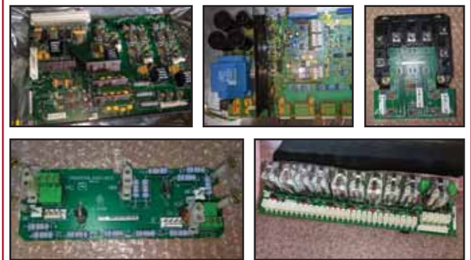
Boards – ALLEN BRADLEY & GE SPEEDMATIC