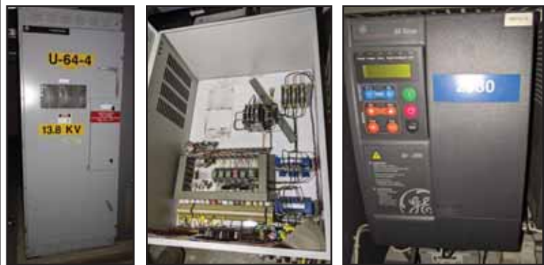
Circuit Breakers, Load Interrupter Switches, Inverter Drives, Electrical Modules, Starters, Fuses & More – GE, WESTINGHOUSE, CUTLER HAMMER & Other