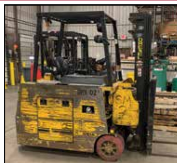
DREXEL 3,000-lb. Swing Mast Forklift w/Monitor