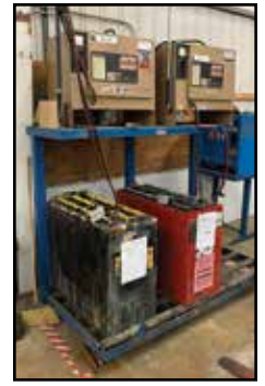
Forklift Batteries & (15) Chargers