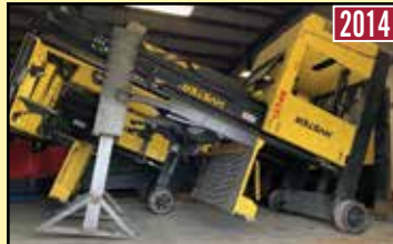
HYSTER 3,000-lb. Turret Forklifts