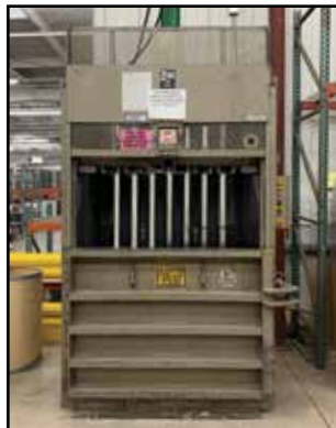
PIQUA 40/54 Baler