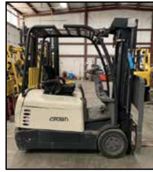
CROWN 4,000-lb. 36V Forklift