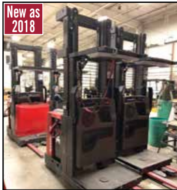
(20) RAYMOND & CROWN Order Pickers