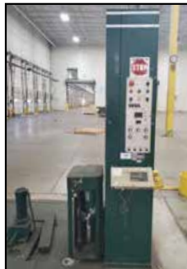
INFRAPAK Shrink Wrapper