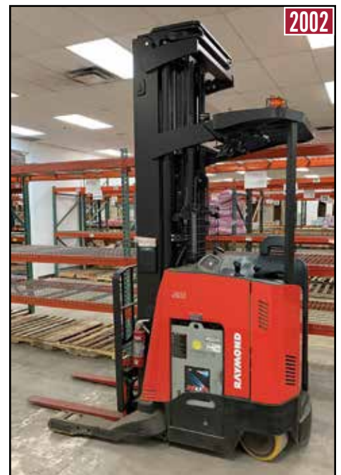
(2) RAYMOND 4,000-lb. Reach Trucks, Model EASI-R40TT