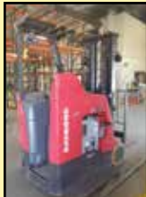
RAYMOND Order Picker