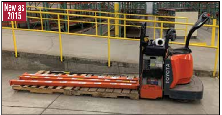
(15+) RAYMOND & CROWN Electric Pallet Jacks