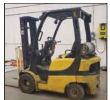
YALE 3,500-lb. LP Forklift