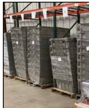
(15,000+/-) Plastic Totes