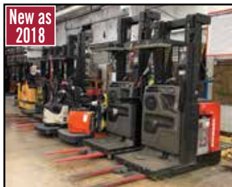
(10) RAYMOND & CROWN Order Pickers