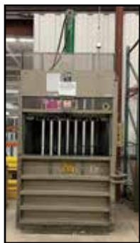
PIQUA 40/54 Baler