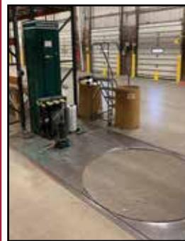
INFRAPAK Sidewinder Pallet Wrapper