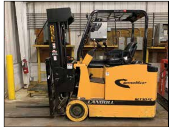
DREXEL LANDOLL 3,000-lb. Swing Mast Forklift

INSPECTION: By Appointment Only, Schedule with SignUpGenious