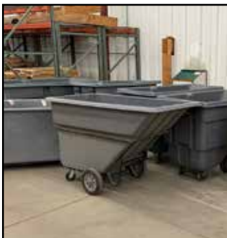
(15) GLOBAL & RUBBERMAID Plastic Trash Hoppers