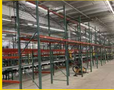
Teardrop Pallet Racking - (1400+/-) Uprights (8,000+/-) Beams • (9,500+/-) Wire Decks

Inspection: By Appointment Only, Schedule with SignUpGenious