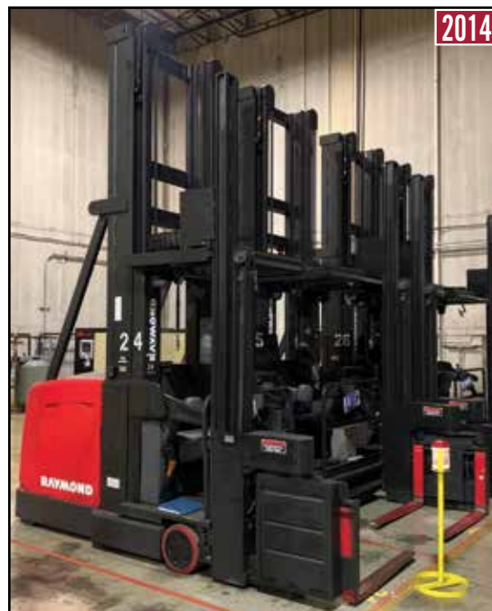
RAYMOND 3,500-lb. Counterbalanced Reach Truck, Model 415 C35TT