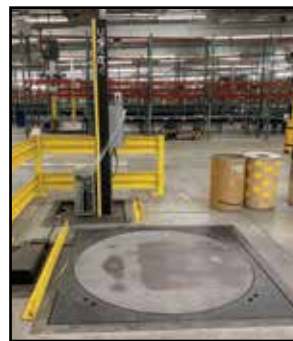
ARPAC PRO-4006L Pallet Wrapper