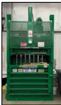
PTR 3400HD Baler