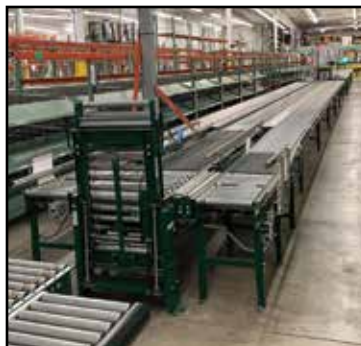
DEMACO Conveyor System