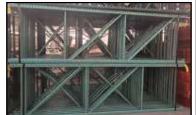
Teardrop Pallet Racking - (1,400+/-) 42" x 7'-22" Teardrop Uprights • (8,000+/-) 96"-146" Beams • (9,500+/-) 42" x 46" Wire Decks