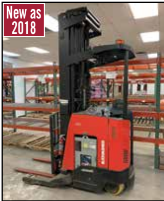
(5) RAYMOND Reach Trucks