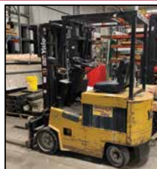
YALE 3,500-lb. 48V Forklift w/Monitor