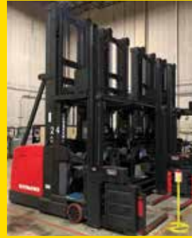
(3) RAYMOND 3,000-lb. Swing Reach Trucks, Model SA CSR30T