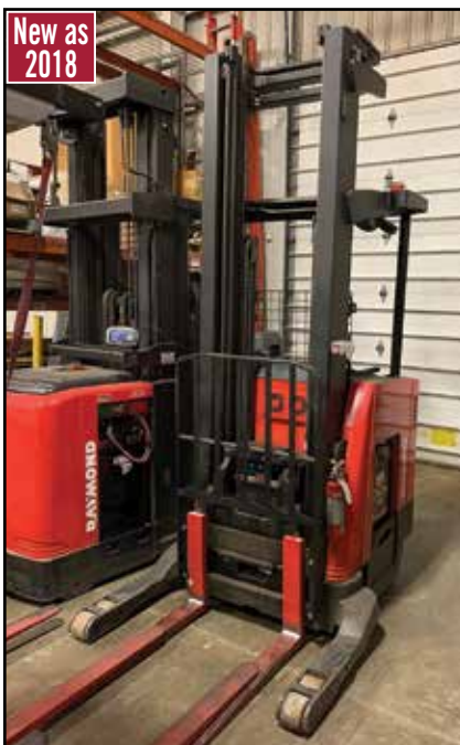
(3) RAYMOND 3,500-lb. Reach Trucks