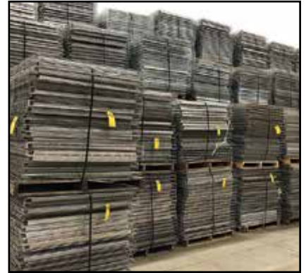
Teardrop Pallet Racking - (1400+/-) Uprights • (8,000+/-) Beams • (9,500+/-) Wire Decks