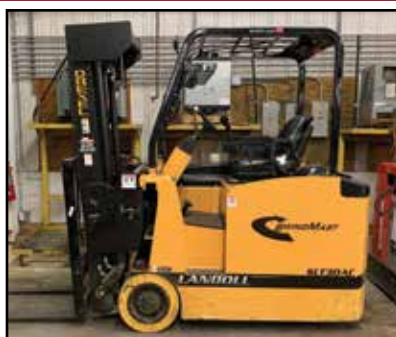
DREXEL LANDOLL 3,000-lb. Swing Mast Forklift w/Monitor