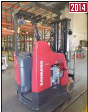
RAYMOND Counterbalanced Reach Truck