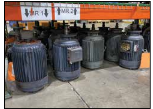
Huge Quantity of Machine Spares, Servo Motors, Drives, Pumps, Cylinders