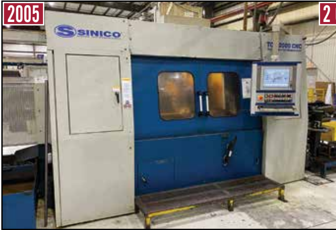
SINICO SIN-O-MATIC TOP 2000 CNC Tube Forming / Milling / Finishing Machine