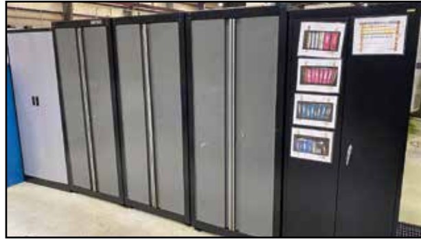
(40+) Modular Storage Cabinets w/Bearings, Tooling & Much More!