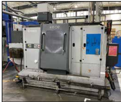
METRA 6-Spindle CNC Automatic Screw Machine