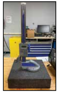
(25+) MITUTOYO Gauges