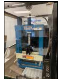
BAILEIGH 10-Ton Shop Press