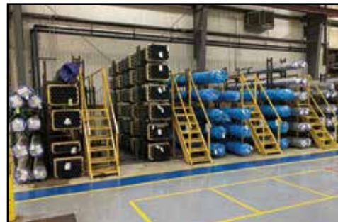
(500+) Stackable Material Racks & Catwalks