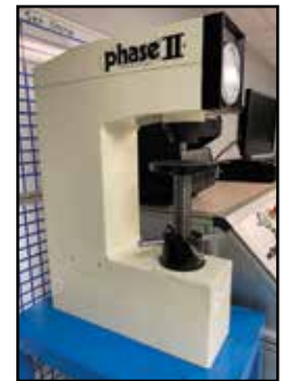
PHASE II Hardness Tester