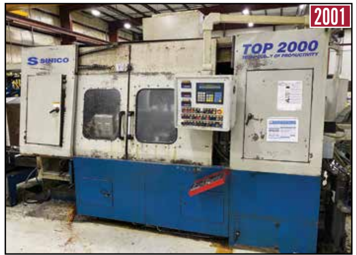
SINICO SIN-O-MATIC TOP 2000, Type TR60/4-2-350-CL