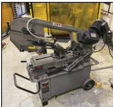
JET Horizontal Band Saw