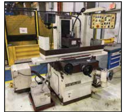
CHEVALIER FSG-3A818 Surface Grinder