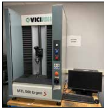
VICIVISION Optical Measuring Machine