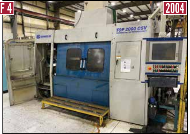
SINICO SIN-O-MATIC TOP 2000 CSV Tube Forming / Milling / Finishing Machine