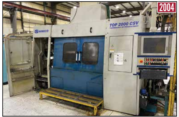
SINICO SIN-O-MATIC TOP 2000 CSV, Type TR 90/4-350-CL-6ST-S-CSV