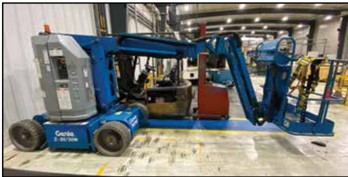
GENIE Z-30/20N Boom Lift, 881 Hours