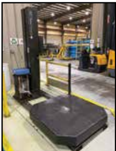
COUSINS 2100X Shrink Wrapper