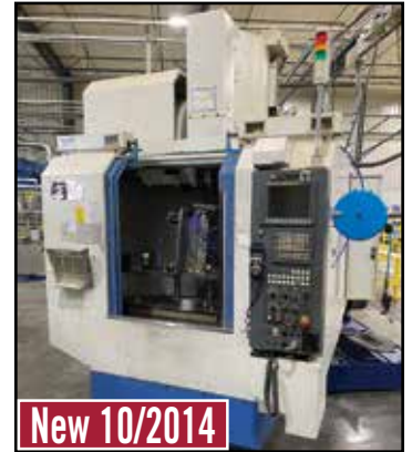
TONGTAI CNC Vertical Machining Center

Inspection: Day Prior to Auction from 9AM-4PM