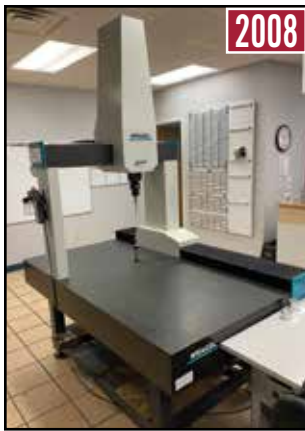
WENZEL CMM, Model X055