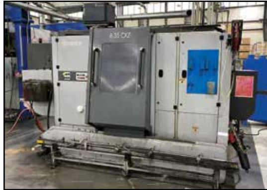
METRA 6-Spindle CNC Automatic Screw Machine