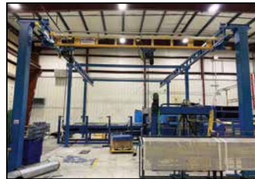
GORBEL 4,000-lb. Free-standing Crane System