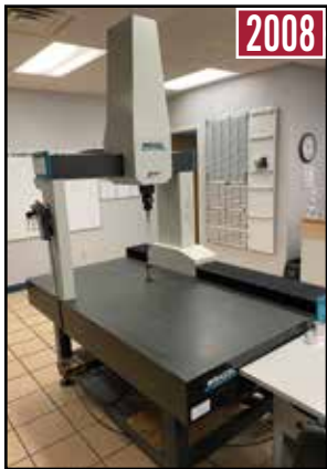
WENZEL CMM, Model X055