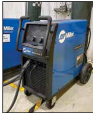
(2) MILLER Millermatic Welders