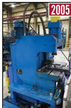
MTD Hydraulic Crimp Machine