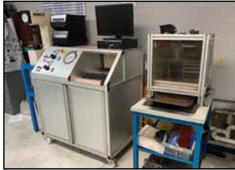
AUTOCLAVE Maxitech Burst Tester, Model ART3.3