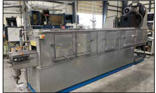
JENFAB Stainless Steel Pass-Through Parts Washer