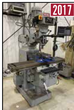
SEIKI VS Vertical Mill, Model 3VH