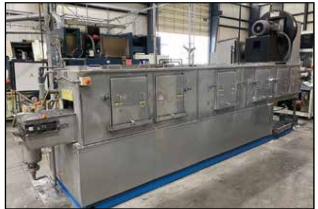
JENFAB Stainless Steel Pass-Through Parts Washer