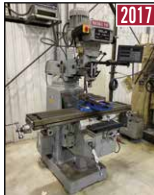
SEIKI VS Mill, Model 3VH