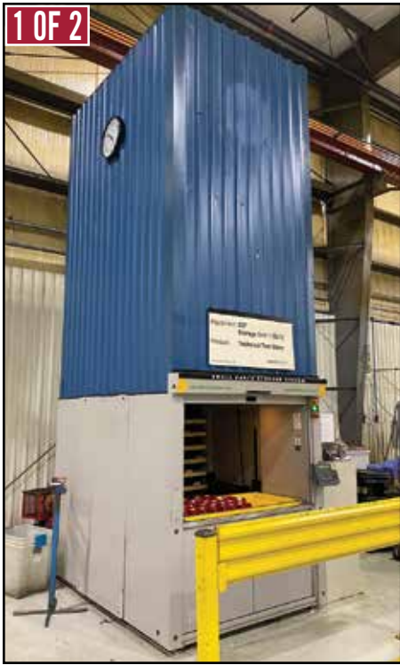
(2) LAUYANS & CO. Vertical Storage & Retrieval Systems