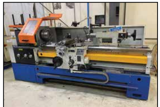
SUMMIT Engine Lathe, Model 16X60B