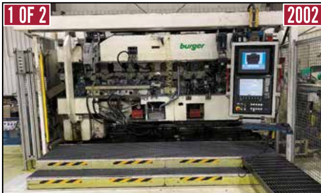
BURGER CNC Multi-Station Bender