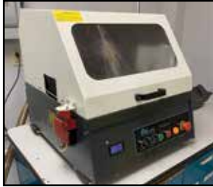
PACE TECHNOLOGIES Mega-M250 Saw