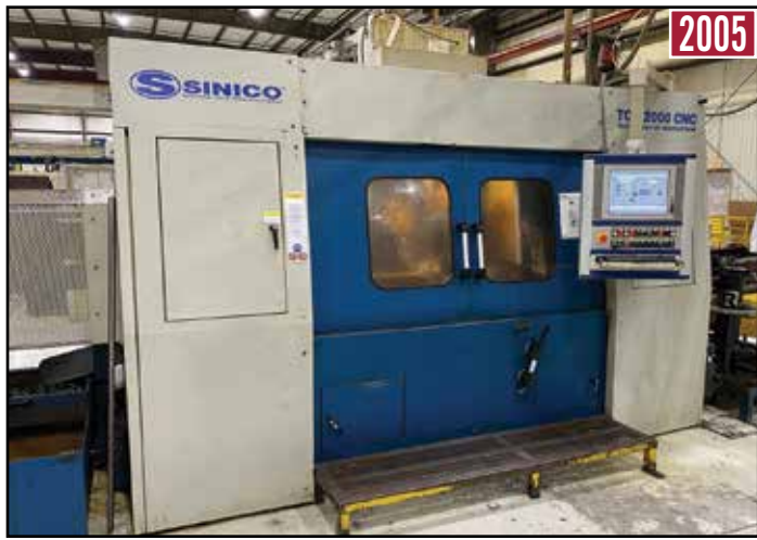
SINICO SIN-O-MATIC TOP 2000 CNC, Type TR 81/4-2-350-CL-CNC