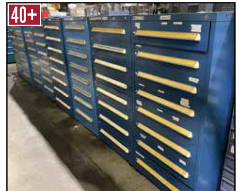
STOR-LOC, VIDMAR & LYON Modular Storage Cabinets