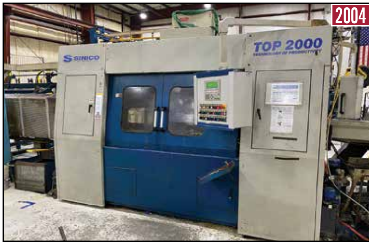
SINICO SIN-O-MATIC TOP 2000, Type TR60/4-2-350-CL, Saw & Chamfer