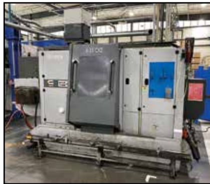
METRA 6-Spindle CNC Automatic Screw Machine