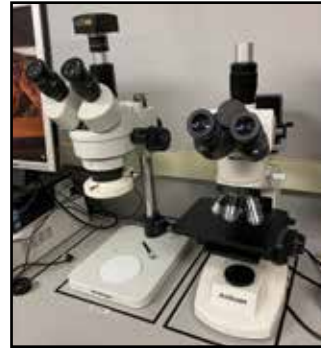
(2) AM SCOPE Microscopes