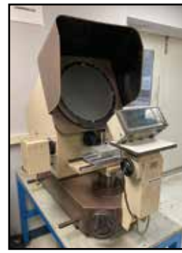
MITUTOYO Optical Comparator