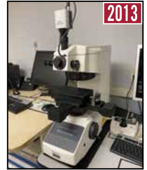
MITUTOYO Automatic Hardness Tester