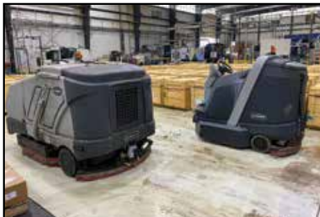
ADVANCE Condor XL & SC6000 36C Ride-on Floor Scrubbers