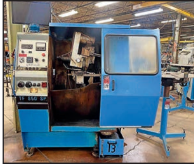
WRIGHT MAXIMUM TF-850SP TOP AND FACE GRINDER

TEETH SETTER LINE #1 , 1.25" Capacity, Adjustable Pitch, Infeed Uncoiler, Outfeed Uncoiler