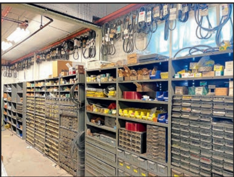
COMPLETE MAINTENANCE DEPARTMENT W/SHELVING AND CONTENTS

JET 1440-3PGH GEARED HEAD ENGINE LATHE, s/n 98046D022, 14" Swing, 40" Between Centers, 10" 3-Jaw, DORIAN Tool Post, Tailstock, NEWALL C80 DRO, 40-1,600 RPM