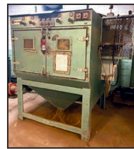
UNI-HONE 4860 VERSION 710 SHOT BLAST SYSTEM