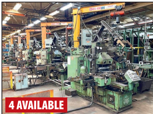
CONTOUR SAWS HORIZONTAL MILL LINES