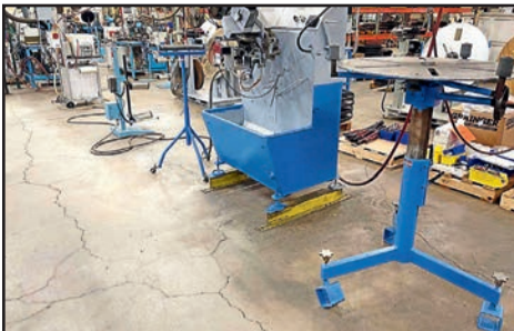
POCKET GRIND LINE #2 W/MAXIMUM PG-850 GRINDER

POCKET GRIND LINE #1 , Uncoiler, WRIGHT Maximum PG-850 Pocket Grinder, s/n G921, Loop Control, Chemical Wash, Welder w/RDO Dura Power 5-400 Induction System, Dancer and Coiler