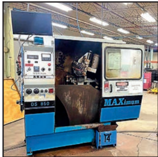
WRIGHT MAXIMUM SD-850 SIDE GRINDER