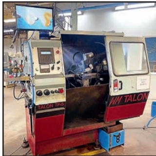
WRIGHT MAXIMUM TALON TF-5 TOP AND FACE GRINDER