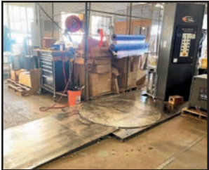
WULFTEC WSML-200-S PALLET WRAPPER