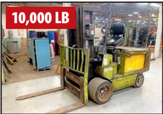
CLARK EC500-120 ELECTRIC FORKLIFT