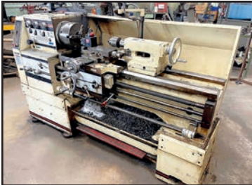
JET 1440-3PGH GEARED HEAD ENGINE LATHE