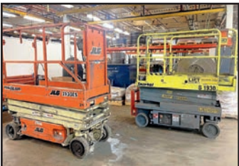
VIEW OF SCISSOR MAN LIFTS