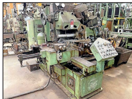
CONTOUR SAWS HORIZONTAL MILL

CONTOUR SAWS HORIZONTAL MILL LINE #7 , 3-Station Loading System w/Dancer Loading Table, CONTOUR SAWS 380 Horizontal Mill, Polypac Hydraulic System, Clamping, 10-Speed, w/48-Disk Coiler Bank