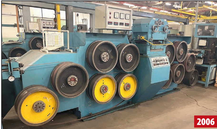
REDEX C010 CONTINUOUS STRETCHING AND LEVELING LINE