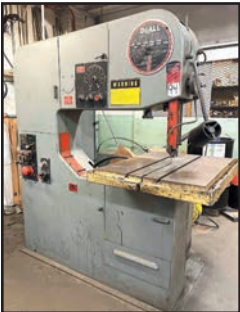
DOALL 3612-2H VERTICAL BANDSAW