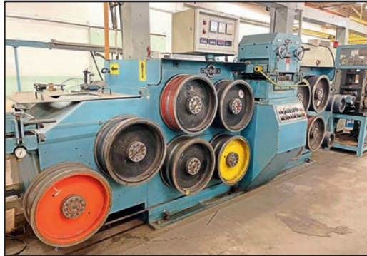
REDEX C010 CONTINUOUS STRETCHING AND LEVELING LINE #2