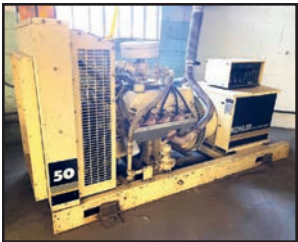
KOHLER RZ72 FAST RESPONSE STANDBY GENERATOR