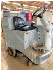
NILFISK ADVANCE 2820C-AXP TYPE E FLOOR SCRUBBER