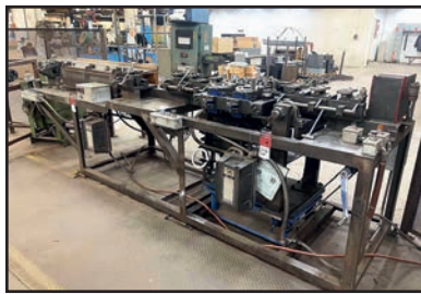
BLADE STRAIGHTENER AND LENGTH COUNTER LINE, 3" CAPACITY