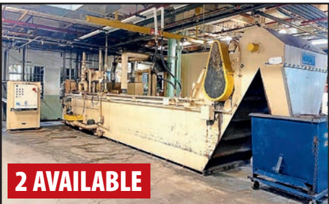
HRB CENTRAL COOLANT SYSTEM