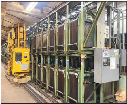
RETROTECH CASSETTE CRANE LOADING SYSTEM