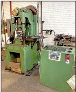
BRUDERER BSTA 30 3-POST HIGH SPEED PRESS