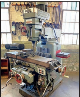
DOALL 80-1219-4 VERTICAL MILL