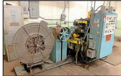
GEORG FISCHER BRUGG BRM 30/150 RECLAIM LEVELER/STRAIGHTENER LINE

GEORG FISCHER BRUGG BRM 30/150 RECLAIM LEVELER/STRAIGHTENER LINE W/HYDRAULIC FLOATING HEAD, Uncoiler, Recoiler