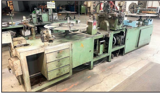
TEETH SETTER LINE #10