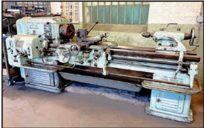
AMERICAN PACEMAKER 14" X 54" LATHE