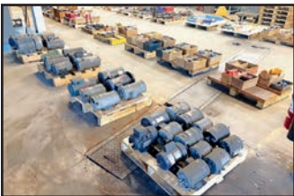
VIEW OF ASSORTED MOTORS

HUGE ASSORTMENT OF SAW BLADE MFG. SUPPORT EQUIPMENT, MAINTENANCE DEPARTMENT, DURABLE AND PERISHABLE TOOLING, POWER AND HAND TOOLS, RIDGID PIPE EQUIPMENT, ELECTRIC AND MANUAL PALLET JACKS, SHELVING UNITS, INSPECTION, VISES, MOTORS, ELECTRICAL, (50+) CM LODESTAR AND ABELL-HOWE ELECTRIC HOISTS, FLAMMABLE LIQUIDS STORAGE CABINETS, DUMP HOPPERS, OFFICE FURNITURE, BREAK ROOM AND MUCH MORE