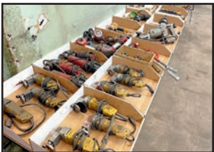
SELECTION OF POWER TOOLS

To discuss your requirements for an auction, please call Perfection Industrial +1-847-545-6374