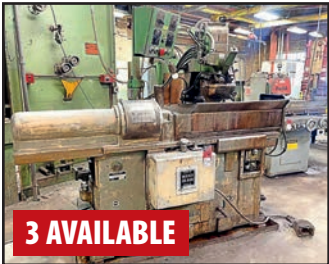
BARBER COLMAN 10-12 HOB SHARPENER