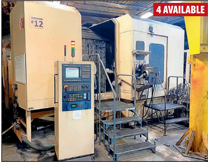
ABA PSM-1500S 4-AXIS CNC GRINDER

Pre-Auction Offers Invited on Major Assets