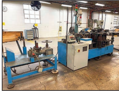
TEETH SETTER LINE #11