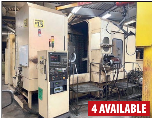
ABA PSM-1500S 4-AXIS CNC GRINDER