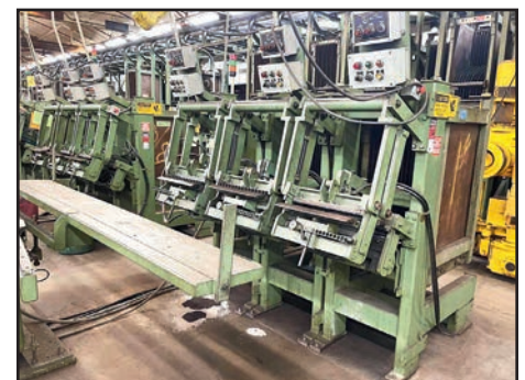
CONTOUR SAWS 3-STATION LOADING SYSTEM

Pre-Auction Offers Invited on Major Assets