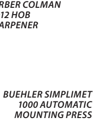
BUEHLER SIMPLIMET 1000 AUTOMATIC MOUNTING PRESS