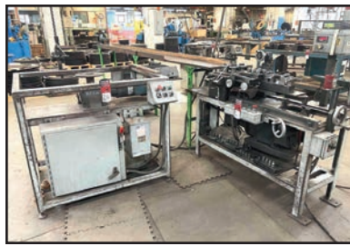
BLADE STRAIGHTENER AND LENGTH COUNTER LINE, 1" CAPACITY