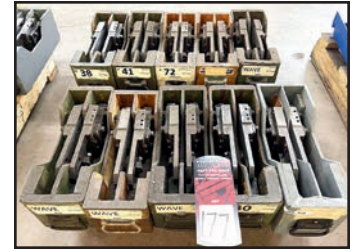
(9) LOTS OF TEETH SETTER TOOLING