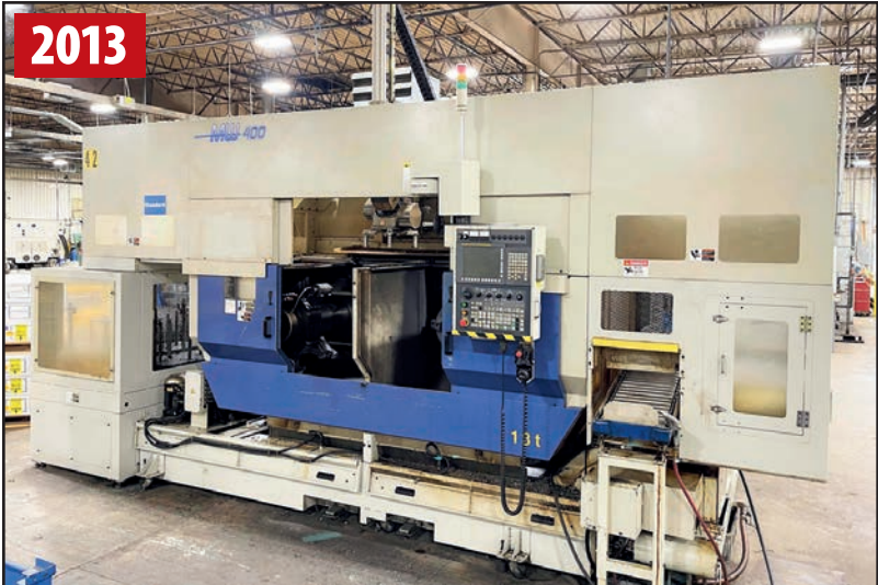
MURATEC MW400 TWIN SPINDLE CNC LATHE