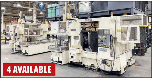
OKUMA & HOWA 2SP-25HG TWIN SPINDLE LATHES