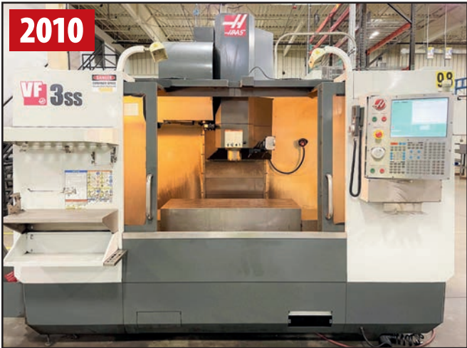
HAAS VF-3SS VERTICAL MACHINING CENTER