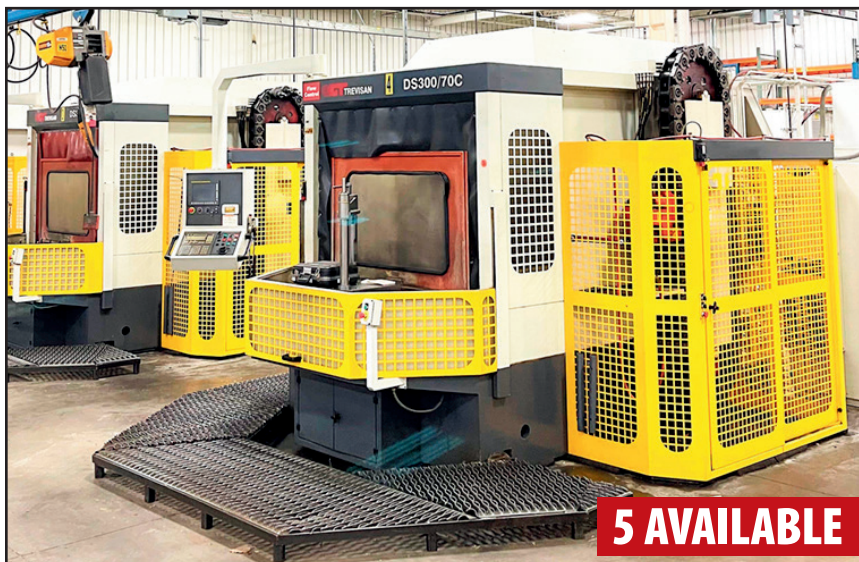
GT TREVISAN DS300/70C HORIZONTAL MACHINING CENTER