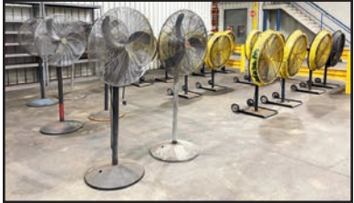
PEDESTAL SHOP FANS

(51) GORBEL, CONTRX AND DAYTON 1/2-TON FREE STANDING JIB CRANES, Various Reach Lengths and Under Rail Heights, w/HARRINGTON or COFFING Electric Hoist, Pendant Control