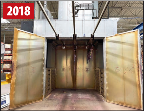
2018 GFS 8' X 11' X 11'T TOP MOUNT BATCH PROCESS OVEN