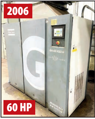
2006 60 HP ATLAS COPCO GA45VSD AIR COMPRESSOR