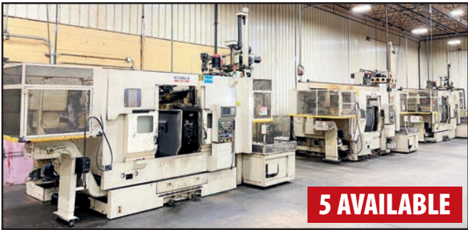
OKUMA & HOWA 2SP-35HG TWIN SPINDLE LATHES