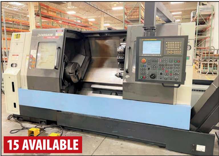
DOOSAN PUMA 400B TURNING CENTER

(2) 2007-2005 DOOSAN PUMA 400C CNC TURNING CENTERS, s/n PM352871, PM351914, w/FANUC 21i-TB Control, 16" 3-Jaw Chuck, 12-Position Turret, Tailstock