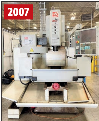
HAAS TM-2 CNC VERTICAL MILL

2007 HAAS TM-2 CNC VERTICAL MILL, s/n 1060150, w/HAAS Control, 10.5" x 58" Table, 20-ATC, 40 Taper