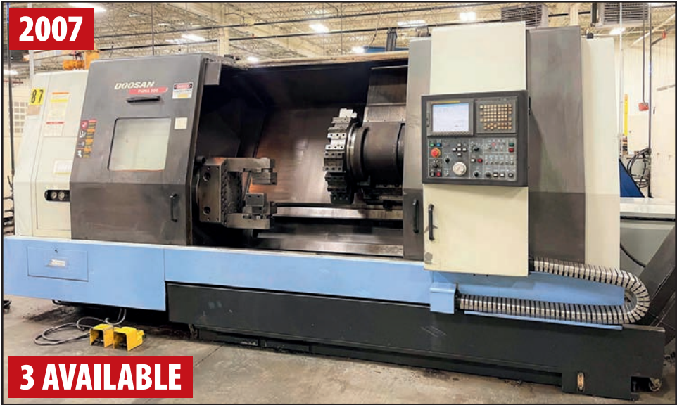
DOOSAN PUMA 500 TURNING CENTER

2011 DOOSAN PUMA 480LD CNC TURNING CENTER, s/n ML0215-000344, w/DOOSAN FANUC I Series Control, 24" 3-Jaw Chuck, 10-3/4" Hole, 12-Position Turret, Tailstock, Programmable Steady Rest