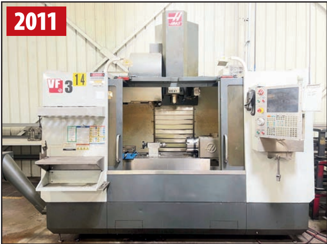
HAAS VF-3 VERTICAL MACHINING CENTER

2013 MURATEC MW400 TWIN SPINDLE CNC LATHE, s/n 1736, w/FANUC 32i-A Control, (2) 15" 3-Jaw Chucks, (2) 8-Position Turrets, Gantry Loader, 14-Pallet Side Input Stocker Feeder Table and Chip Conveyor