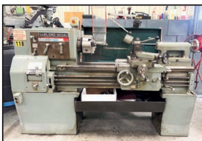
LEBLOND REGAL 20" X 32" LATHE