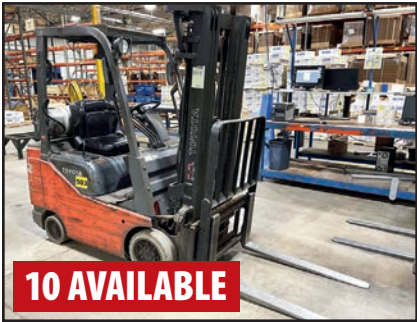
10 AVAILABLE TOYOTA FORKLIFTS, FROM 5,000 – 3,500 LB CAPACITY