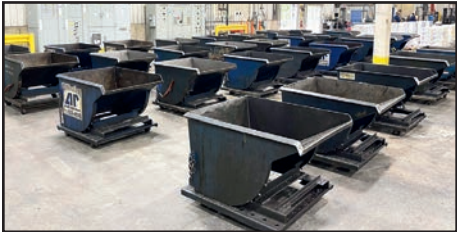
SELF DUMPING HOPPERS