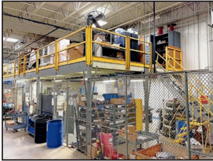
VIEW OF MEZZANINE