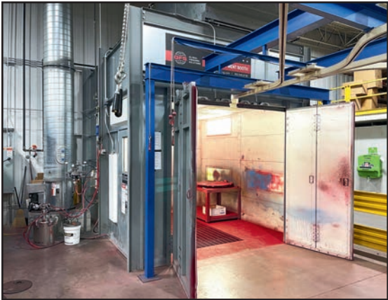
GFS 13' X 11' X 9'T PAINT BOOTH