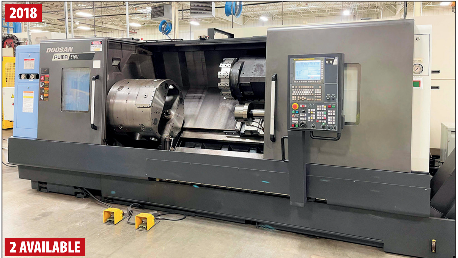
DOOSAN PUMA 5100LB TURNING CENTER

FEATURING: (30) DOOSAN PUMA Turning Centers as New as 2018, 2013 MURATEC MW400 Twin Spindle CNC Lathe, (9) OKUMA & HOWA Twin Spindle CNC Lathes, (5) GT TREVISAN DS300/70C Horizontal Machining Centers as New as 2014, (6) HAAS VF-3 & VF-2 Vertical Machining Centers as New as 2011, Tool Room Machinery, Induction Heating/Tube Bending Cells, 2015 BTB Transfer Cell, Testing, Painting, Forklifts, Air Compressors, (60) Free Standing Jib & Bridge Cranes, Mezzanines & More