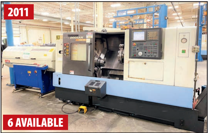
DOOSAN PUMA 300C TURNING CENTER W/BAR FEED

Pre-Auction Offers Invited on Major Assets