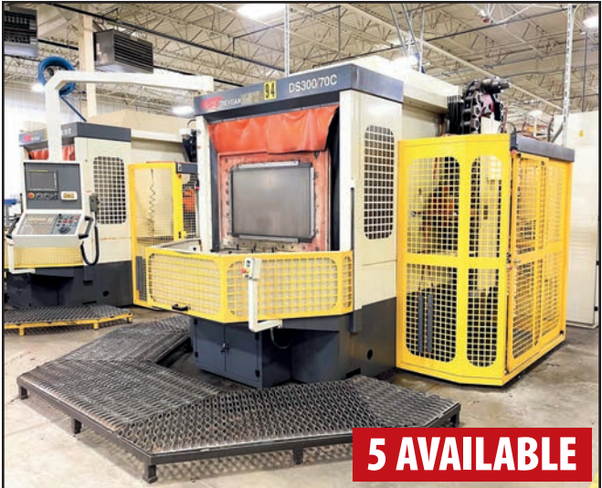
GT TREVISAN DS300/70C HORIZONTAL MACHINING CENTER