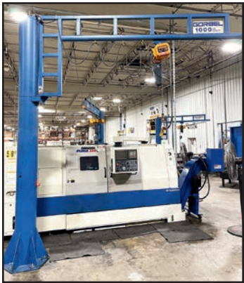
GORBEL, CONTRX AND DAYTON FREE STANDING JIB CRANES

SALE LOCATION 3001 N Darrell Road, Island Lake, Illinois 60042