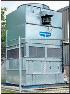
EVAPCO COOLING TOWER

MEZZANINE, 13' x 32' x 10' Under Deck, Bolted, w/Stairs