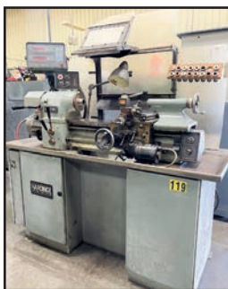
HARDINGE HLV-H TOOL ROOM LATHE