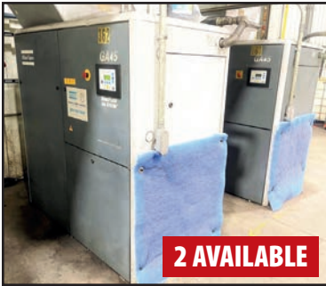
2 AVAILABLE ATLAS COPCO GA45 AIR COMPRESSORS

GLOBAL FINISHING SYSTEMS LEDDG-1109PSB-13-B-C-S 13' X 11' X 9'T PAINT BOOTH, s/n U93169-A, w/5 HP Supply Motor, 3 HP Exhaust Motor