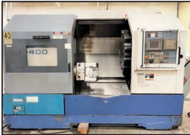
MORI SEIKI SL-400B TURNING CENTER

Pre-Auction Offers Invited on Major Assets