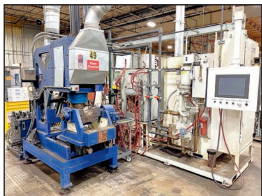
TOCCO 250-IT-07H INDUCTION HEATER SYSTEM W/TUBE BENDER