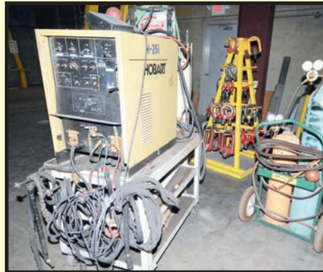
HOBART 250 AMP TIG WELDER