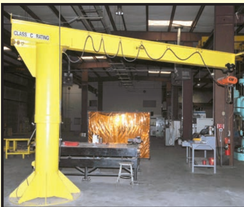
WOLVERINE 2 T. FREE STANDING JIB CRANE