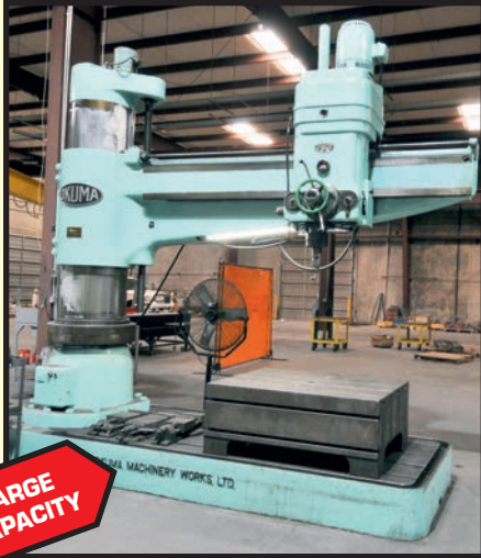
OKUMA 8' X 20" RADIAL ARM DRILL