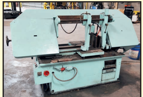
FORTE 16" X 20" CAP. HORIZONTAL BANDSAW