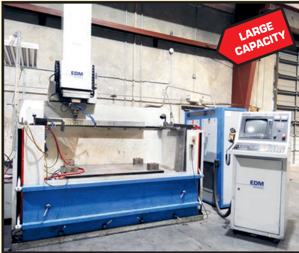
EDM SOLUTIONS "TITAN" CNC RAM TYPE EDM