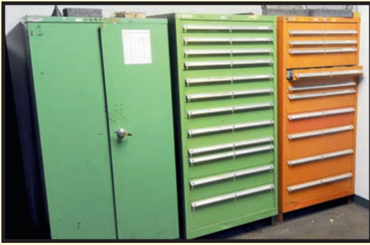
ROLLER DRAWER TOOL CABINETS