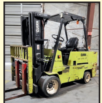
CLARK 12,000-LB. DIESEL FORKLIFT