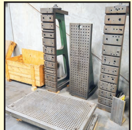
ASSORTED MACHINE ACCESSORIES