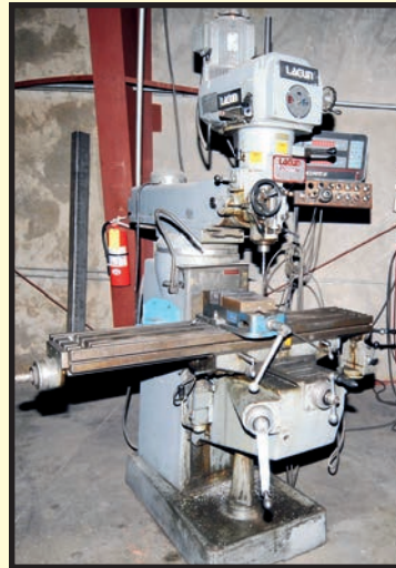
LAGUN FTV-2S VERT. TURRET MILL