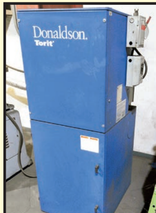
TORIT "VIBRA SHAKE" CABINET DUST COLLECTOR