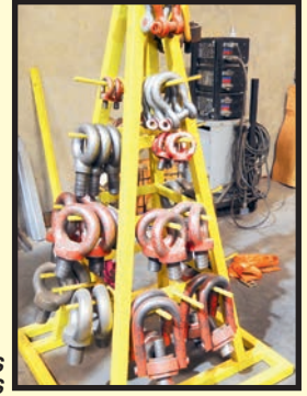
SWIVEL EYE BOLTS AND SHACKLES

DEMAG 10 T. CAP. X 25'10" SPAN , 14'6" ht. under rail, DeMag 10 T. cap. unitized hoist and trolley, pendant control, end trucks for possible conversion to single girder overhead bridge crane, S/N 43172.