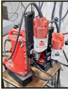
MILWAUKEE MAGNETIC BASE DRILLS

Monday, May 10, 9:00 A.M. to 4:00 P.M. Wearing Masks and Social Distancing will be required.