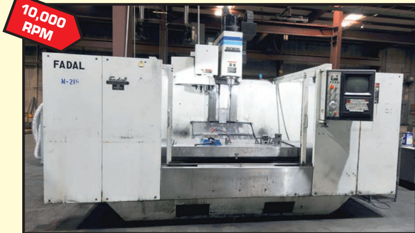
FADAL 6030HT VERT. MACHINING CENTER