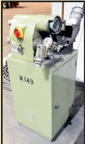
PARPAS TYPE AU3 SINGLE LIP CUTTER GRINDER