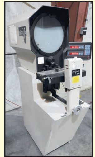
MICROVIEW MDL. H14 OPTICAL COMPARATOR