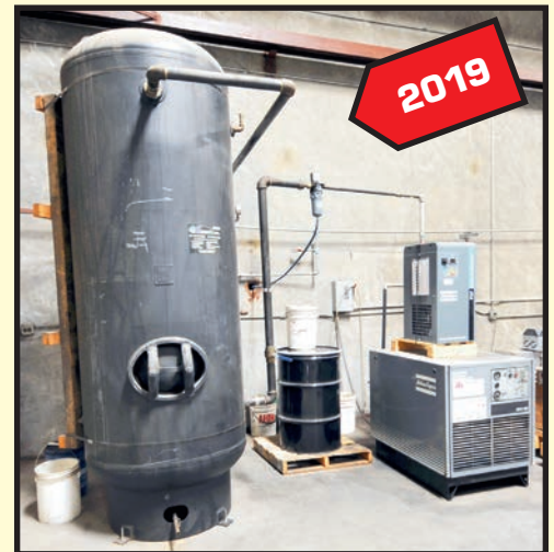
ATLAS COPCO 25 HP AIR COMPRESSOR SYSTEM