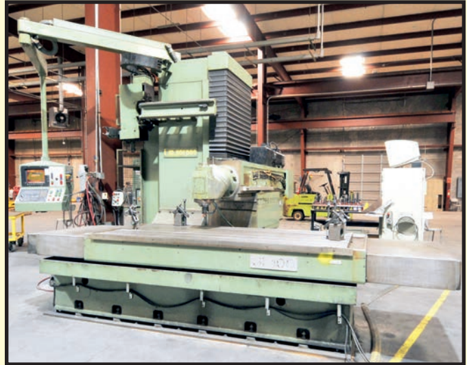
PARPAS SL100/3000 CNC BED TYPE MILL

TUESDAY, MAY 11 • 10:00 A.M. LIVE ONLINE WEBCAST (NO ONSITE BIDDING)