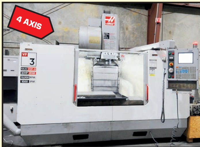
HAAS VF3D VERT. MACHINING CENTER