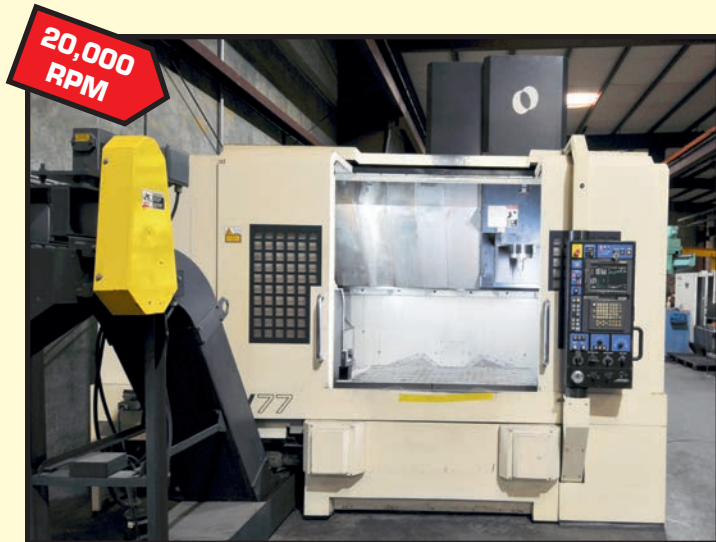
MAKINO V77 HIGH SPEED VERT. MACHINING CENTER