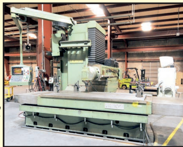
PARPAS SL100/1300 CNC BED TYPE MILL

REACT TOOL & MOLD 150 T. CAP. , 48" x 48" sliding bolster, 48" x 48" drilled and tapped ram, 27-1/2" stroke, 19" min. shut ht., 46.5" max. shut ht., 48" x 36" dist. btwn. 4" dia. posts, top mtd. unitized hydraulics, hyd. safety catch mechanism.