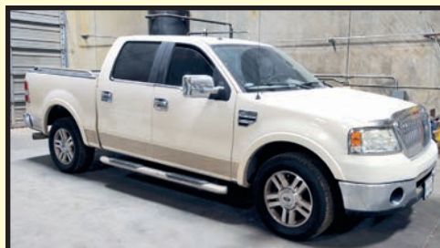
FORD LARIAT PICKUP TRUCK

If you need assistance, don't hesitate to call (713) 691-4401. ALL BIDS ARE SUBJECT TO AN 18% BUYER'S PREMIUM.