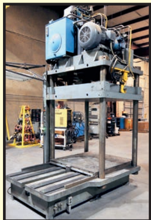
REACT TOOL & MOLD 150 T. HYD. TRYOUT PRESS

OKUMA 8' X 20" , 3' x 51" x 20" ht. T-slotted box tbl., S/N N.A.