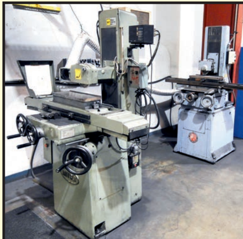
HAND FEED SURFACE GRINDERS