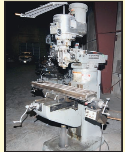
BRIDGEPORT SERIES I VERT. TURRET MILL