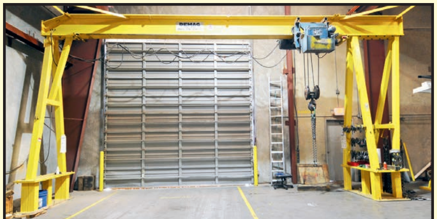
DEMAG 10 T. GANTRY CRANE