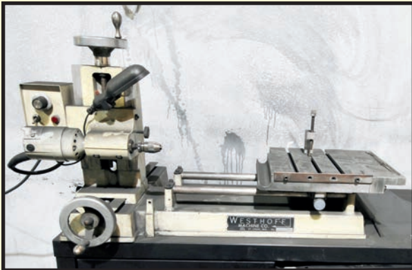
WESTHOFF EDM ELECTRODE DRILL