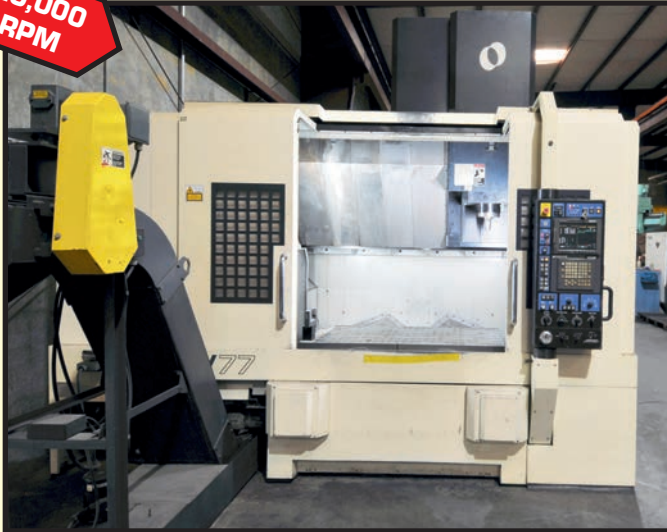
MAKINO V77 HIGH SPEED VERT. MACHINING CENTER