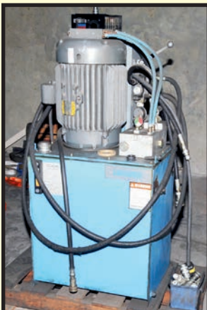
VICKERS 20 HP HYDRAULIC POWER SUPPLY