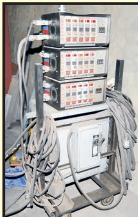
ATHENA 15 ZONE HOT RUNNER CONTROLLER