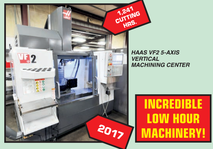
HAAS VF2 5-AXIS VERTICAL MACHINING CENTER