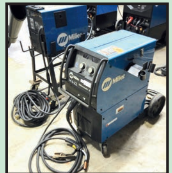
MILLER MIG WELDER AND PLASMA CUTTER

LAPMASTER MDL. 15 , (3) conditioning rings, abrasive feed system, 12 x 12 manual lap tbl., on roller stand, S/N 221602.