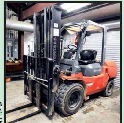
TOYOTA 9,000-LB. CAP. DIESEL FORKLIFT