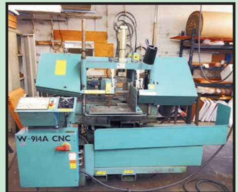
W.F. WELLS CNC HORIZONTAL BANDSAW

INSPECTION: Monday & Tuesday, August 9 & 10, 9:00 A.M. to 4:00 P.M.