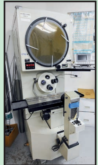
SHERR TUMICO 16" OPTICAL COMPARATOR