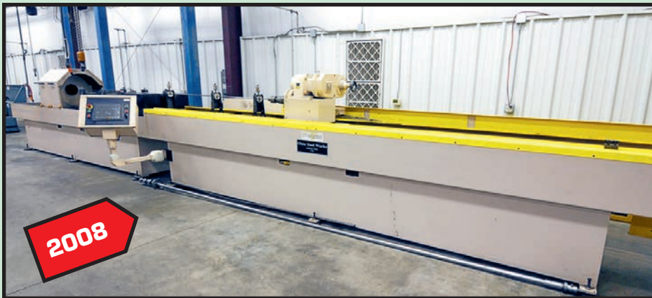
OHIO CNC HORIZONTAL HONING MACHINE