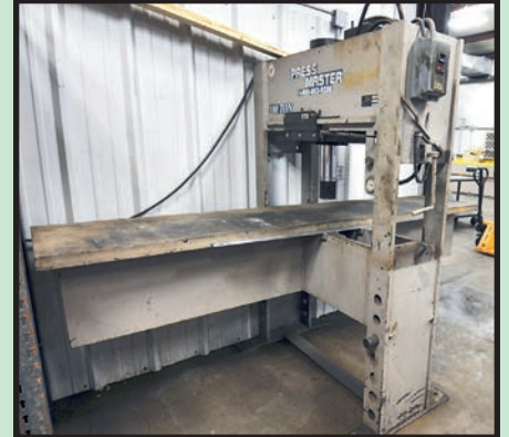
PRESSMASTER 100 T. PLATE STRAIGHTENING PRESS