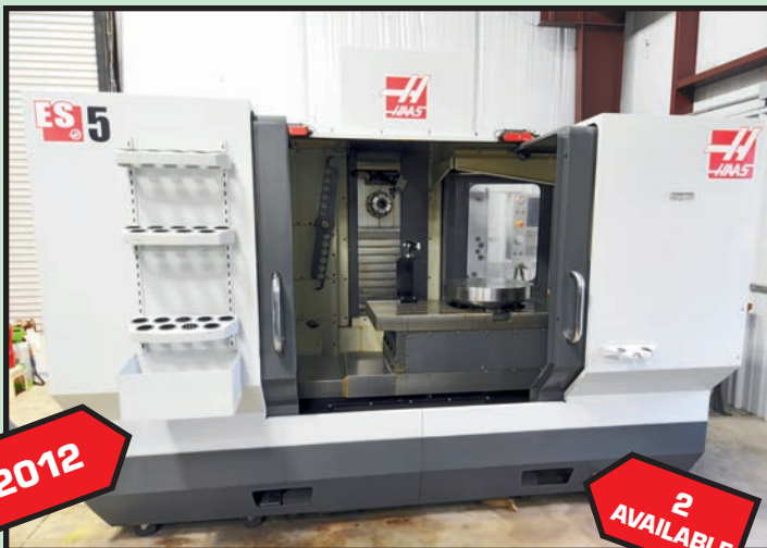
HAAS ES5 X-AXIS HORIZONTAL MACHINING CENTER