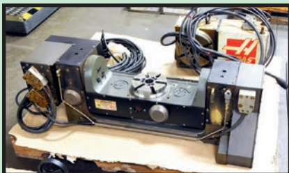
HAAS TR160 2-AXIS TRUNNION TABLE