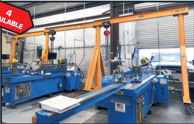
CALDWELL ROLLING GANTRY CRANES