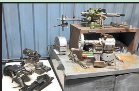
SAMPLE VIEW OF PRECISION GRINDING ACCESSORIES

TWO BIG DAYS • TWO LOCATIONS: HOUSTON & BROOKSHIRE, TX