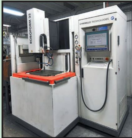
CHARMILLES ROBOFORM 35 CNC RAM TYPE EDM

Go to www.pmi-auction.com and click on BidSpotter.com on our calendar page for this auction sale.