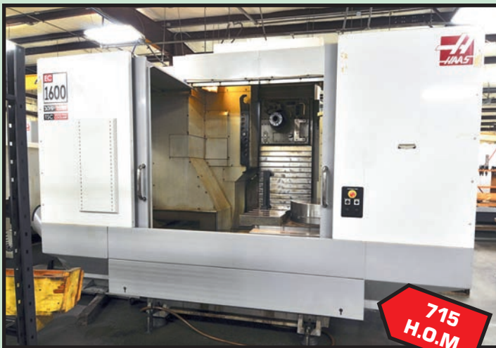
HAAS EC1600 4-AXIS HORIZONTAL MACHINING CENTER