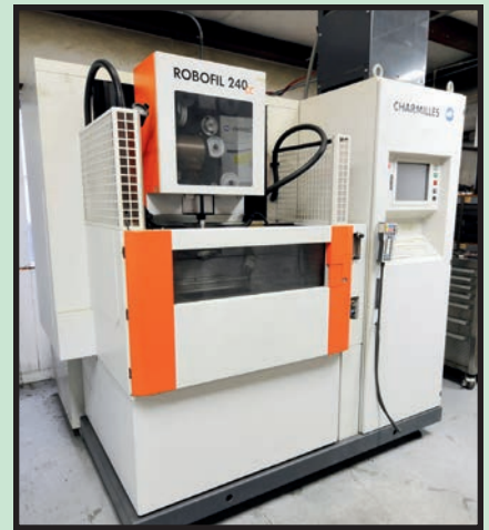
CHARMILLES ROBOFIL 240CC 5-AXIS CNC WIRE EDM