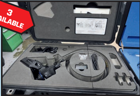
OLYMPUS I-PLEX BORE SCOPE