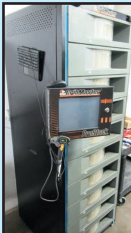
CRIBMASTER PROSTOCK CAROUSEL VENDING MACHINE

INSPECTION: Monday & Tuesday, August 9 & 10, 9:00 A.M. to 4:00 P.M.