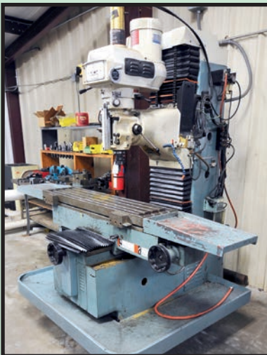
TRAK BED TYPE MILLING MACHINE

TOYOTA 9,000-LB. BASE CAP. MDL. 7FDU45 , 7,600-lb. @ 30" L.C., diesel engine, 8,500-lb. @ 24" L.C., 187" max. lift ht., 72"L. forks, large dia. cushion tires, side shift, S/N 60365.