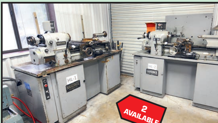
VIEW OF HARDINGE PRECISION LATHES

INSPECTION: Monday & Tuesday, August 9 & 10, 9:00 A.M. to 4:00 P.M.