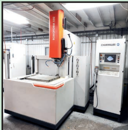
CHARMILLES ROBOFORM 550 CNC RAM TYPE EDM

MBC 200-LB. CAP. MDL. BP2 , manual tilt, variable spd. rotation, foot pedal control, 12" dia. platen.