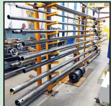
TOOLING FOR UNISIG CNC DEEP HOLE DRILLING MACHINE