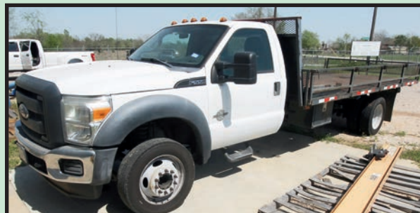
FORD F-550 FLATBED TRUCK

DAY ONE: WEDNESDAY, AUGUST 11 LIVE THEATER-STYLE DIGITAL PHOTO AUCTION at the OMNI HOUSTON HOTEL AT WESTSIDE 13210 KATY FREEWAY, HOUSTON, TEXAS 77079