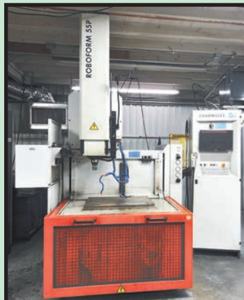
CHARMILLES ROBOFORM 55P CNC RAM TYPE EDM