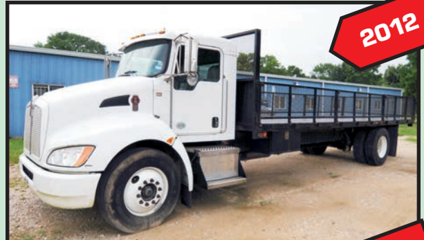
KENWORTH DIESEL FLATBED TRUCK