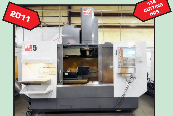
HAAS VF5 5-AXIS VERTICAL MACHINING CENTER

HAAS MDL. VF2 , new 12/2017, 36" x 14" t.b.l., 30" X, 16" Y, 20" Z-axis travels, CAT-40, 8,100 RPM, 30 HP, 24-pos. ATC, hi-pressure thru spdl. coolant system, Haas 6" dia. Mdl. TR160 2-axis trunnion t.b.l., programmable coolant nozzle, 1,474 hrs. cycle start time, 1,241 hrs. feed cutting time, S/N 1144865.