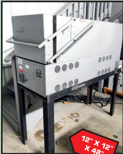
CRESS ELECTRIC HEAT TREAT FURNACE