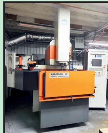
CHARMILLES ROBOFORM 40 CNC RAM TYPE EDM