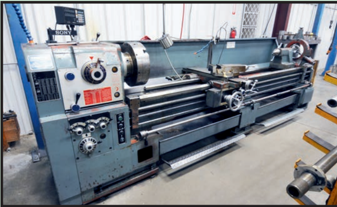
17" X 120" KINGSTON GAP BED ENGINE LATHE