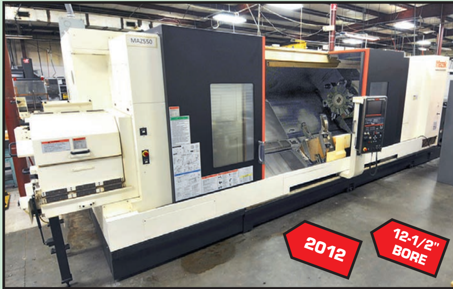
MAZAK SLANT TURN NEXUS 550 HOLLOW SPINDLE CNC LATHE