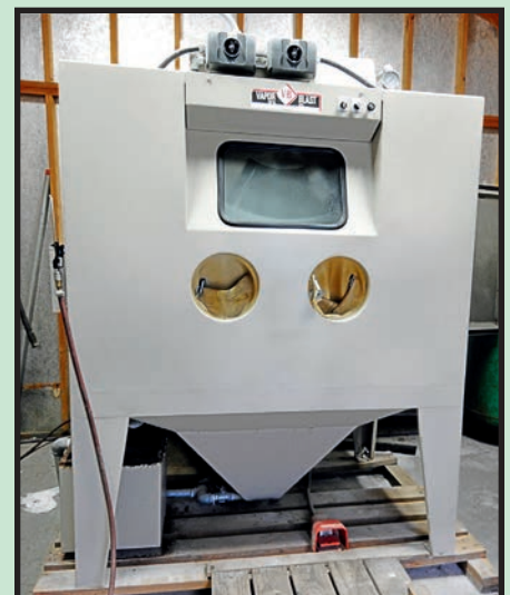
VAPOR BLAST LIQUID HONING MACHINE