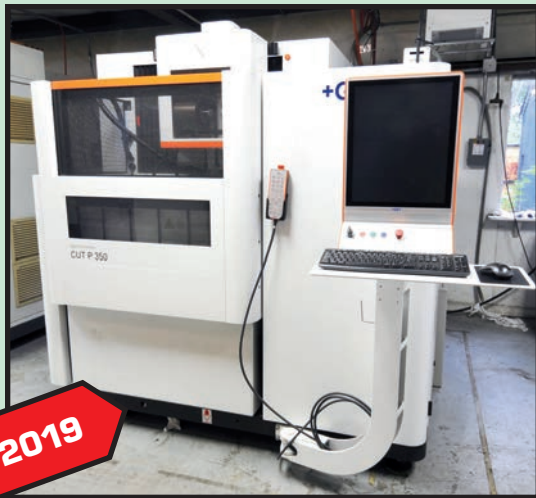
CHARMILLES CUTP350 5-AXIS CNC WIRE EDM