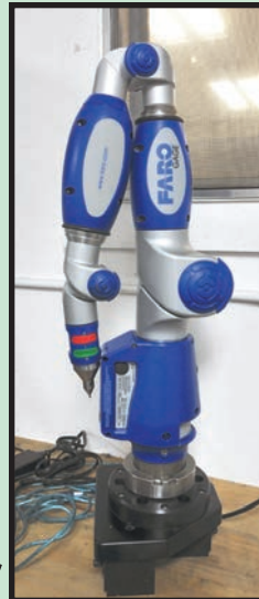
FARO MEASURING ARM