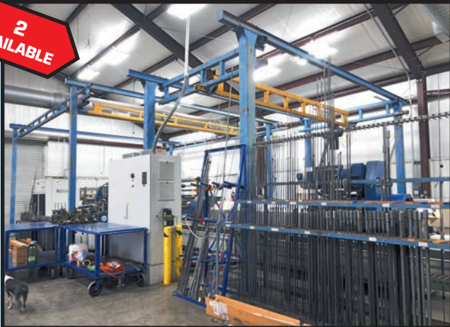
GORBEL CRANE SYSTEMS