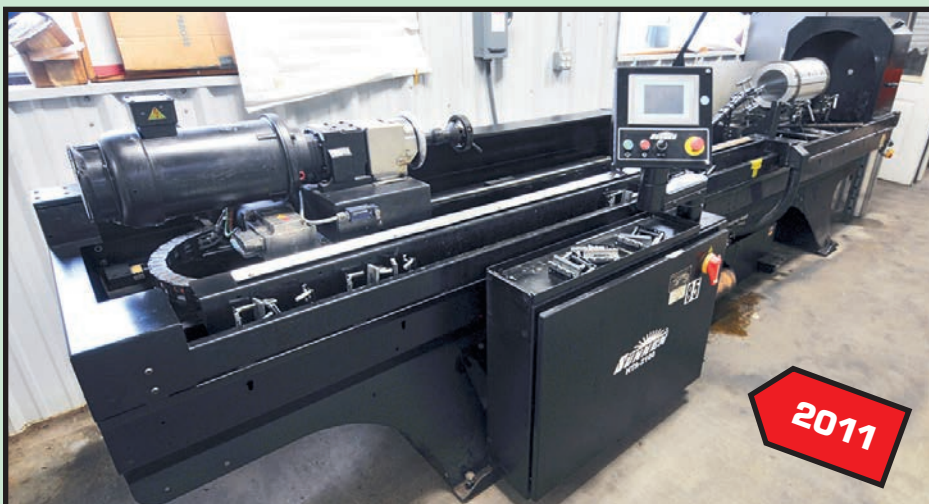
SUNNEN MDL. HTA-2100 HORIZONTAL HONING MACHINE

SUNNEN HONE ACCESSORY CABINET w/large qty. of assorted Sunnen honing mandrels and stones.