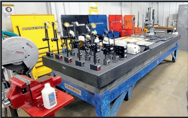
LARGE QUANTITY OF GAUGING