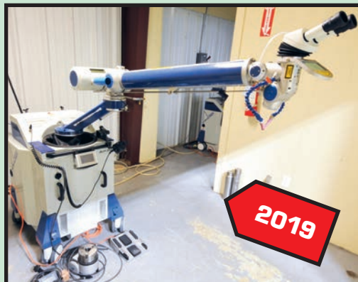
ALPHA LASER ALM300 LASER WELDING MACHINE

INSPECTION: Monday & Tuesday, August 9 & 10, 9:00 A.M. to 4:00 P.M.