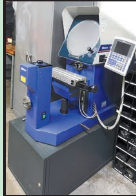
MITUTOYO PH-A14 OPTICAL COMPARATOR

MITUTOYO MDL. PH-A14 , last calibrated in 2020, 10X lens, surface illumination, QM Data 200 geometric D.R.O., micro adjust stage, S/N 007971208.