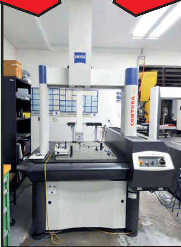
ZEISS CONTURA 10/12/6RDS COORDINATE MEASURING MACHINE