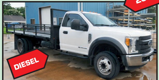
FORD F-450 FLATBED TRUCK