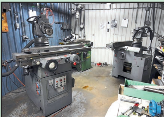
VIEW OF TOOL AND CUTTER GRINDERS

WIDE ASSORTMENT OF VARIOUS GRINDING ATTACHMENTS incl. Eldorado gun drill grinding attaches., air bearing endmill grinding attaches., 2-axis gun drill fixtures.