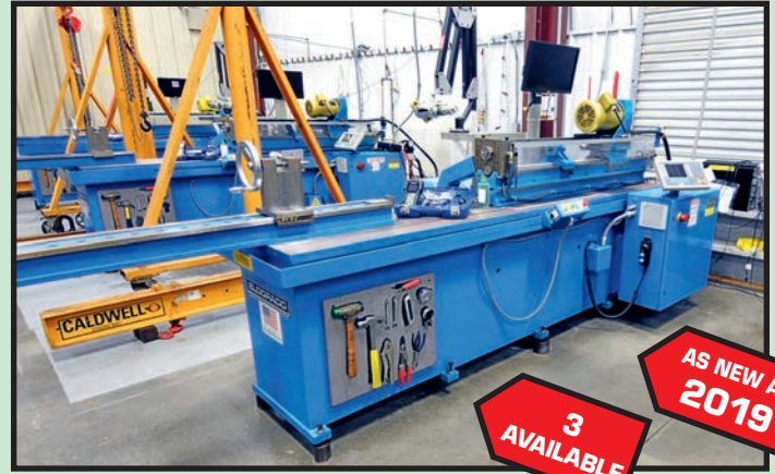
ELDORADO M75-48 CNC GUN DRILL SYSTEMS

DAY ONE: ITEMS LOCATED AT LOCATION #2 LANGHAM CREEK MACHINE WORKS 37470 FM 529, BROOKSHIRE, TEXAS 77423