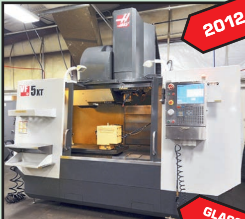
HAAS VF5/50/XT 4-AXIS VERTICAL MACHINING CENTER