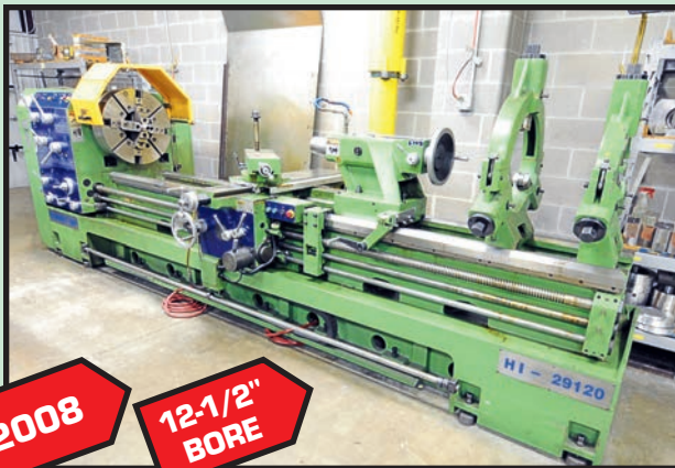
KINGSTON HOLLOW SPINDLE LATHE