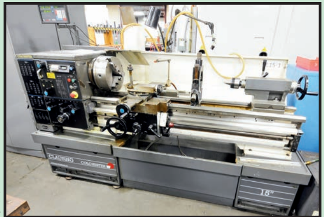
CLAUSING COLCHESTER 15" X 50" V/S LATHE