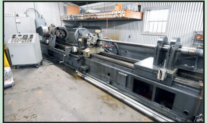
NATCO BTA DRILLING MACHINE