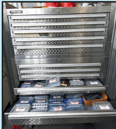
SUNNEN HONING STONES