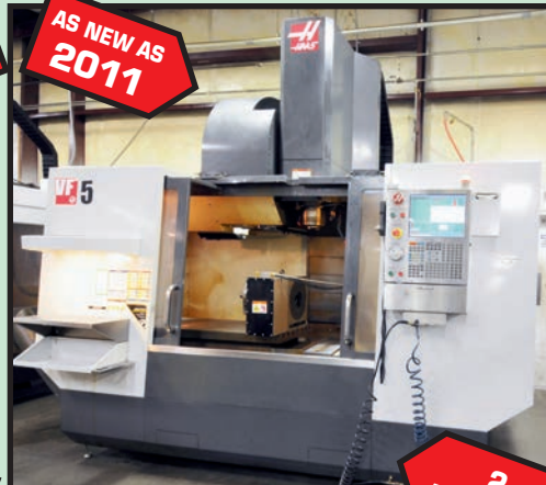
HAAS VF5/50 4-AXIS VERTICAL MACHINING CENTER