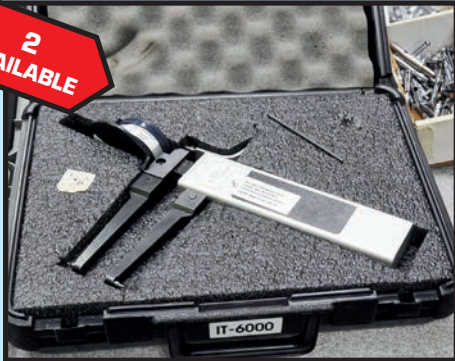
GAGEMAKER THREAD PITCH GAUGES