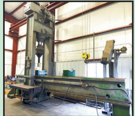
DAKE 300 T. ROLLING FRAME STRAIGHTENING PRESS

KALAMAZOO MDL. H9AW , 9" rd. cap., 9" x 14" rect. cap., coolant system, S/N 12.383.