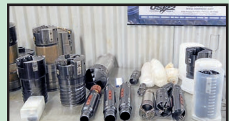
LARGE SELECTION OF NEW AND USED BTA HEADS

INSPECTION: Monday & Tuesday, August 9 & 10, 9:00 A.M. to 4:00 P.M.