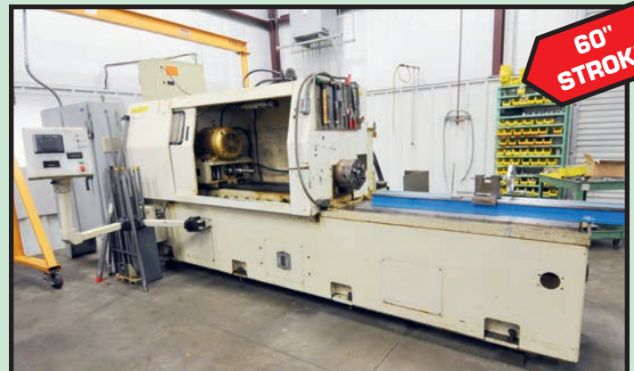
DEHOFF CNC GUN DRILL

DEHOFF , new 1997, 18"W. x 58"L. tbl., 60" stroke, 10 HP drill drive motor, 2" drill cap., Allen Bradley PC electronics w/touch screen, DeHoff hi-pressure coolant system, feed rate: .1-30 IPM, 150 IPM rapid retraction, spds.: 750–4,000 RPM, 30 HP drive motor, (2) cartridge filters, reservoir, Koolant Koolers refrigeration system, 300 gal. coolant system, large assortment of timing pulleys, bed plates, guides and accessories, 8' tailstock extension, Forkardt 6-jaw precision chuck on outboard side, S/N DH1893.