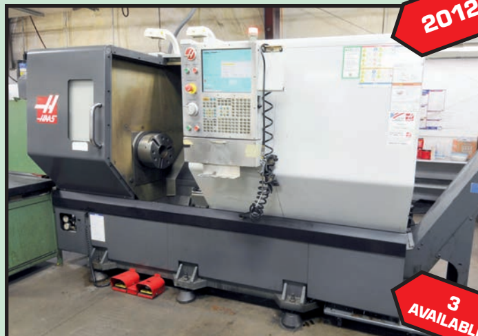
HAAS ST40 CNC LATHE