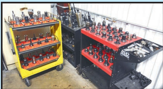
HIGH QUALITY SPINDLE TOOLING