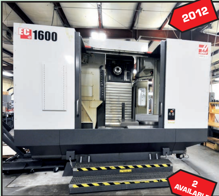
HAAS EC1600 4-AXIS HORIZONTAL MACHINING CENTER