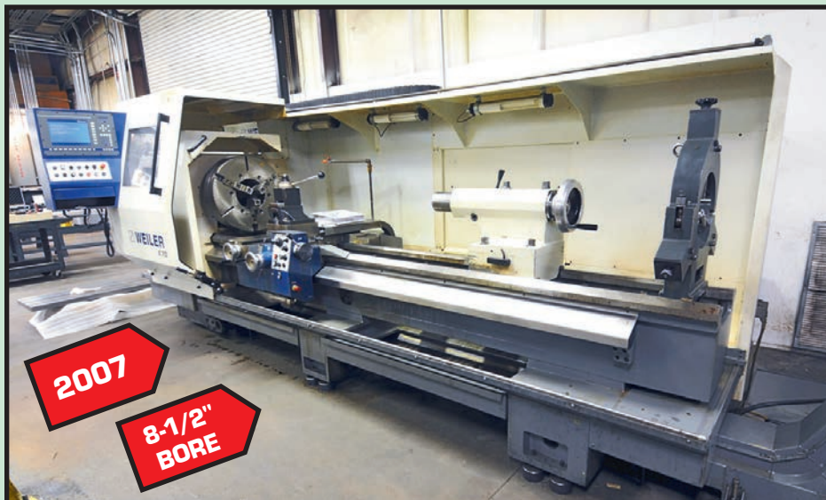
WEILER E70 ELECTRONIC LATHE