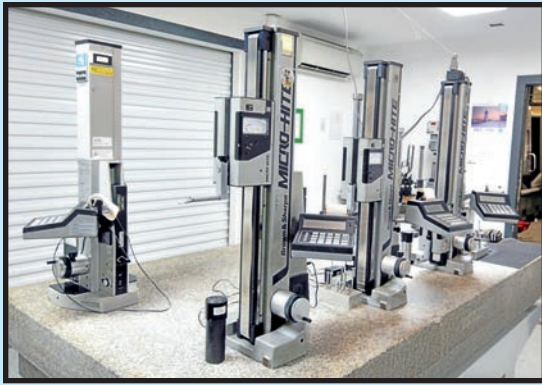
SAMPLE VIEW OF ELECTRONIC HEIGHT GAUGES