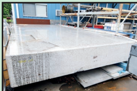
ROCK OF AGES 10' X 20' X 20" GRANITE SURFACE PLATE

DAY ONE: WED., AUGUST 11 LIVE THEATER-STYLE DIGITAL PHOTO AUCTION at the OMNI HOUSTON HOTEL AT WESTSIDE 13210 KATY FREEWAY, HOUSTON, TEXAS 77079