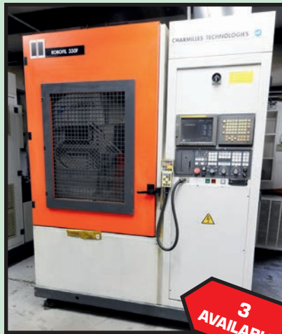
CHARMILLES ROBOFIL 330F 5-AXIS CNC WIRE EDM