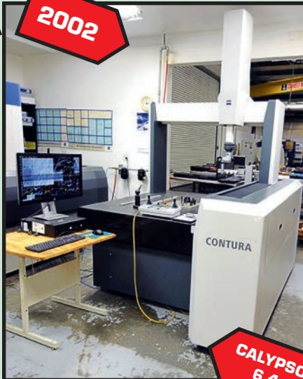
ZEISS CONTURA 7/10/6HTG COORDINATE MEASURING MACHINE