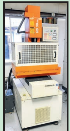
CHARMILLES EDM DRILLING MACHINE