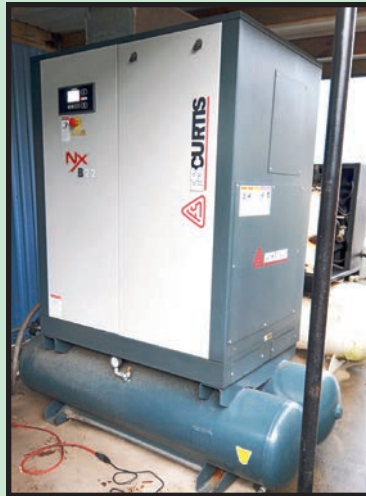
F.S. CURTIS ROTARY SCREW AIR COMPRESSOR