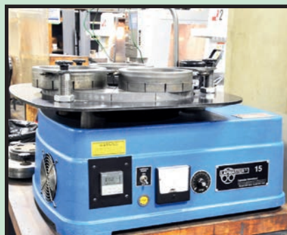
LAPMASTER 15" LAPPING MACHINE