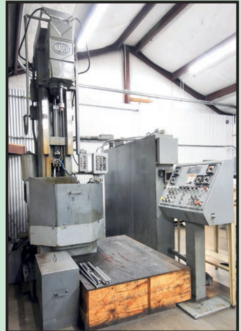
NATCO VERTICAL HONING MACHINE

DAY ONE: ITEMS LOCATED AT LOCATION #2 LANGHAM CREEK MACHINE WORKS 37470 FM 529 BROOKSHIRE, TX 77423