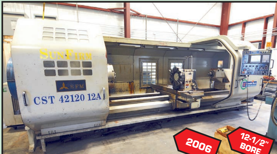
SUNFIRM CST442120 HOLLOW SPINDLE CNC LATHE