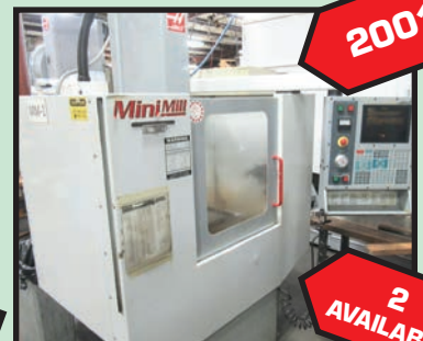
HAAS MINI MILL