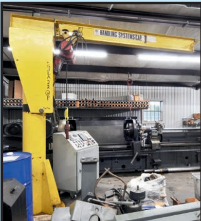
FREE STANDING PEDESTAL JIB CRANE