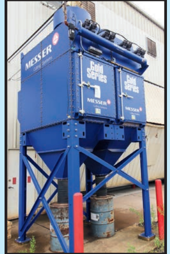
MESSER GOLD SERIES DUST COLLECTOR W/MESSER PLATEMASTER II

HILL ACME , 75 T., 36" throat depth, S/N 507955S.