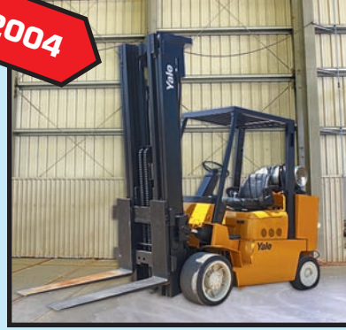
YALE 12,000-LB. BASE CAP. FORKLIFT