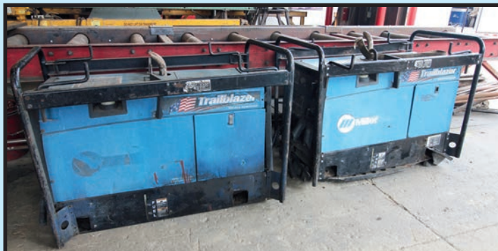
(3) MILLER TRAILBLAZER MDL. 302 WELDER GENERATORS

ABRASIVE BLAST SYSTEMS BLAST BOOTH 20'W. X 20'H. X 70'L. , (2) blast pots and reclamation system, 20'W. x 20'H. x 60'L. Chi Givens 70' drive thru truck paint spray booth, (2) make up air units. (currently disassembled). Diagrams and drawings to aid in the reassembly of this system are available.