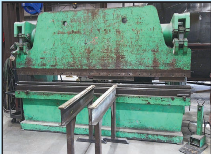
ACCURPRESS 250 T. X 12'L. MDL. 725012 HYDRAULIC PRESSBRAKE

INSPECTION: Tuesday, September 21 & Wednesday, September 22, 9:00 A.M. to 4:00 P.M.