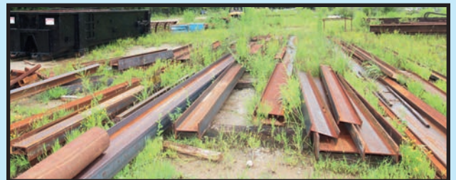
SAMPLE VIEW OF RAW MATERIAL