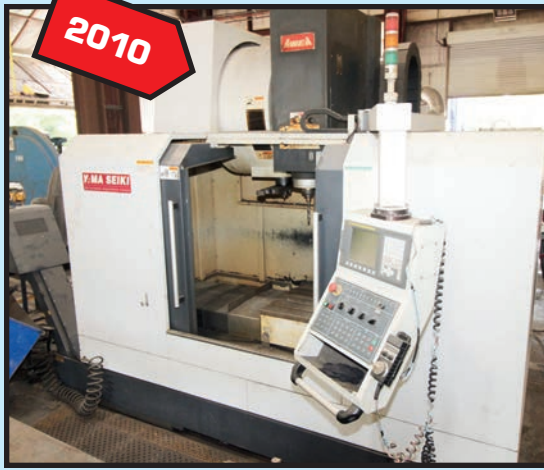
YAMA SEIKI MDL. BM-1020 CNC VERT. MACHINING CENTER