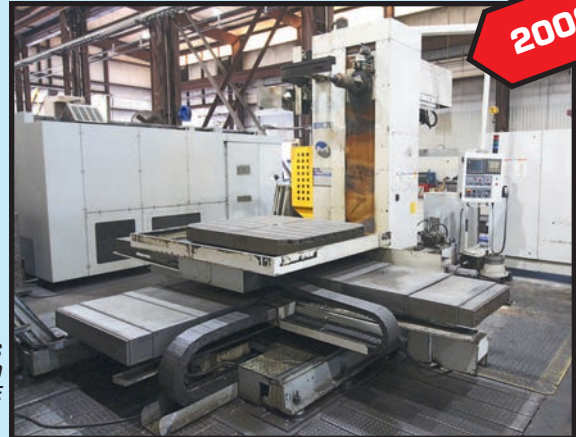
MILLTRONICS MDL. HMC70 CNC TABLE TYPE HORIZ. BORING MILL