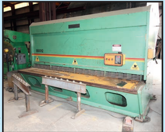
ACCURSHEAR 1/2" X 12' MDL. 850012 HYDRAULIC SHEAR