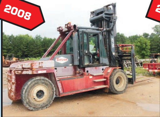
TAYLOR BIG RED 35,000-LB. BASE CAP. FORKLIFT