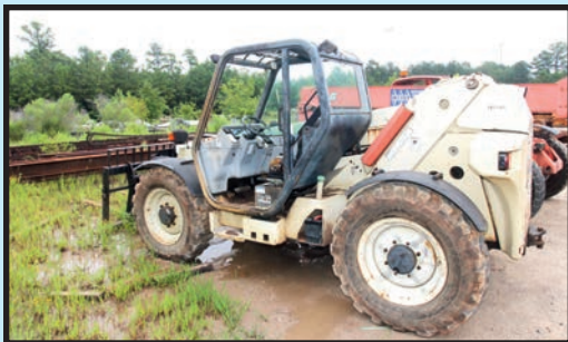
INGERSOLL RAND 6,700-LB. CAP. TELEHANDLER