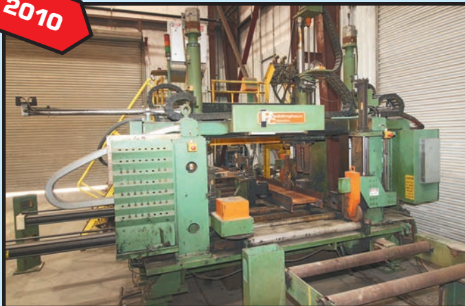
PEDDINGHAUS MDL. ABCM1250/3D CNC BEAM COPING MACHINE