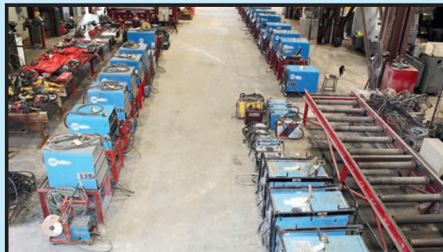
SAMPLE VIEW OF MILLER WELDERS