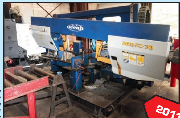
HYD-MECH OCEAN TERMINATOR MDL. DCM-20/30 HORIZ. MITRING BANDSAW