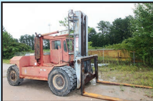
TAYLOR BIG RED 30,300-LB. BASE CAP. FORKLIFT