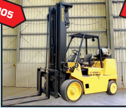
HYSTER 15,500-LB. BASE CAP. FORKLIFT