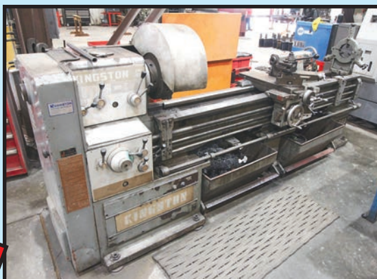
KINGSTON MDL. HLC2180 ENGINE LATHE