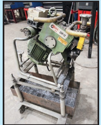
CEVISA MDL. CHP-12 PLATE AND TUBE BEVELING MACHINE