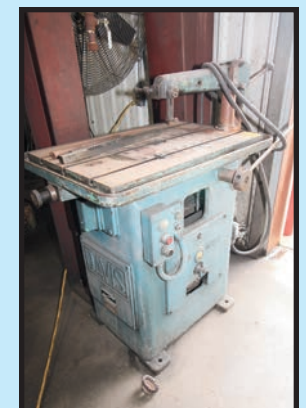
DAVIS 15A KEYSEATER