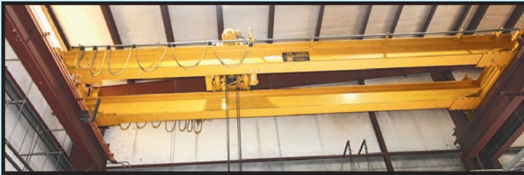
F&G 10 T. X 40' SPAN OVERHEAD CRANE