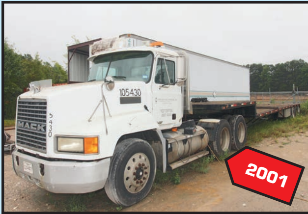
MACK TRUCK/LONGVIEW MACHINE AND FAB TRUCK TRACTOR AND TRAILER