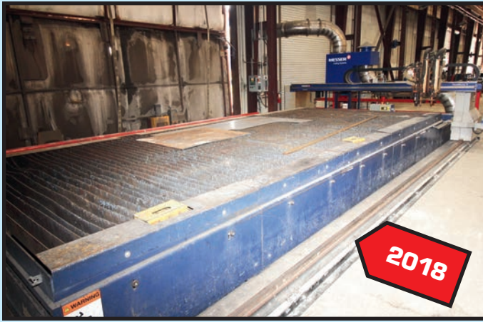
MESSER PLATEMASTER II CNC PLASMA AND OXY/FUEL CUTTING SYSTEM

LEMAS 6' X 3/8" MDL. TR200/6 INITIAL PINCH PLATE ROLL