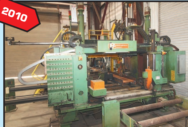
PEDDINGHAUS MDL. ABCM1250/3D CNC BEAM COPING MACHINE