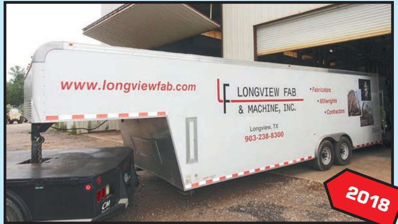
SUNDOWNER TOOL TRAILER