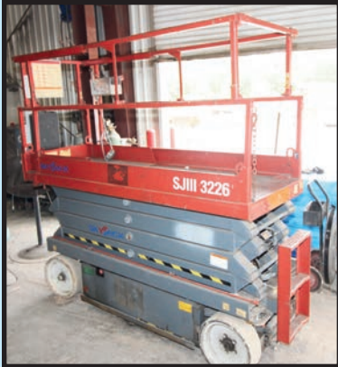
SKYJACK 550-LB. CAP. SCISSOR LIFT

SCISSOR LIFTS SKYJACK 550-LB. CAP. MDL. SJIII3219 , 32' work ht. SKYJACK 500-LB. CAP. MDL. SJIII3226 , 32' work ht. SEA CONTAINERS (2) 40'L. , (1) w/contents of bead blast media. VACUUM PLATE LIFTER ANVER 2,000-LB. CAP. , 20' max. load length, 8' max. load width.