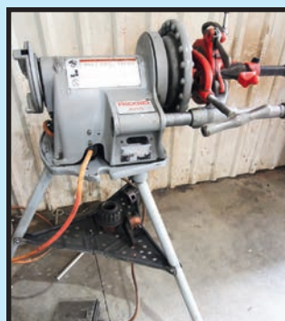
RIDGID MDL. 300 PIPE THREADER