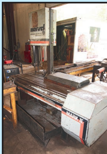
MARVEL SERIES 8 MARK II TILT FRAME VERT. BANDSAW