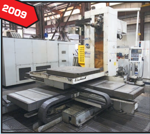
MILLTRONICS MDL. HMC70 CNC TABLE TYPE HORIZ. BORING MILL