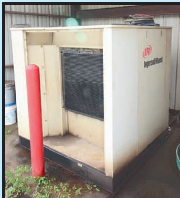
INGERSOLL RAND 75 HP ROTARY SCREW AIR COMPRESSOR