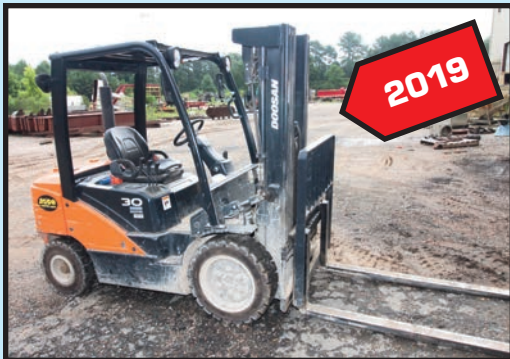
DOOSAN 6,000-LB. RATED CAP. FORKLIFT