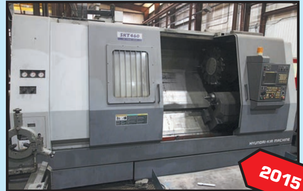
HYUNDAI KIA MDL. SKT460 CNC LATHE

KINGSTON MDL. HLC2180 , 21" sw. x 80" cc, 3" spdl. bore, 12" dia. 3-jaw chuck, S/N K4069078.