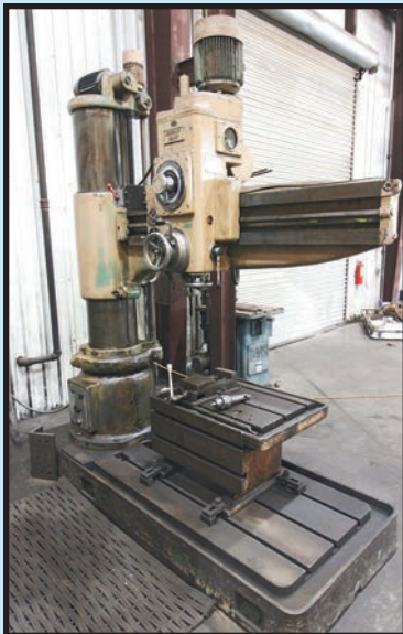
HERCULES 5' X 14-1/2" RADIAL ARM DRILL

INSPECTION: Tuesday, September 21 & Wednesday, September 22, 9:00 A.M. to 4:00 P.M.