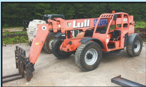
LULL JLG 9,000-LB. CAP. TELEHANDLER