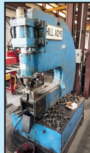
HILL ACME 75 T. SINGLE END HYDRAULIC PUNCH