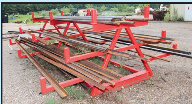
SAMPLE VIEW OF RAW MATERIAL