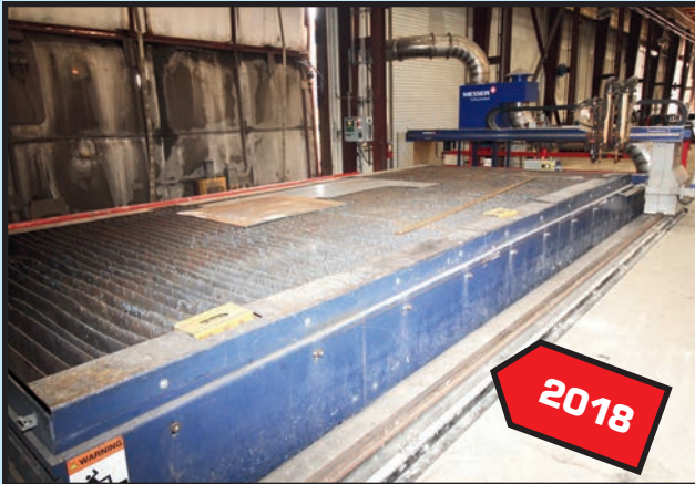
MESSER PLATEMASTER II CNC PLASMA AND OXY/FUEL CUTTING SYSTEM

FEATURING: Extremely Low Hour 2018 Messer Platemaster II CNC Plasma/Oxy System; Peddinghaus CNC Beam Coping Line; 1/2" x 12' Accurshear; 250 T. x 12' Accurpress; Milltronics CNC HBM; Hyundai Kia CNC Lathe; Yama Seiki & Fadal VMCs; (30) Welding Machines; (13) Overhead Cranes; (15) Forklifts, new as 2019; Raw Material; Much More! – PLUS Real Estate – See Back Page