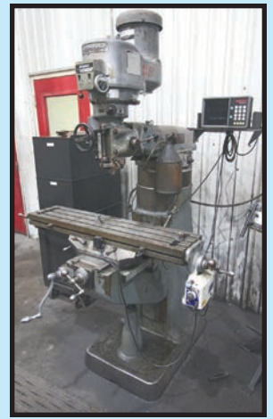
BRIDGEPORT SERIES 1 VERT. TURRET MILL