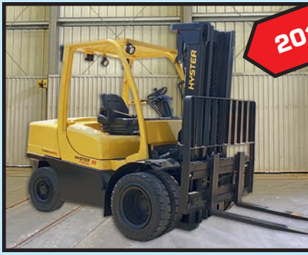
HYSTER 9,000-LB. BASE CAP. FORKLIFT