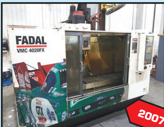
FADAL MDL. VMC 4020FX CNC VERT. MACHINING CENTER

STEEL PLATE; I-BEAMS; CHANNEL; ROUND BAR; PIPE; LARGE QTY.