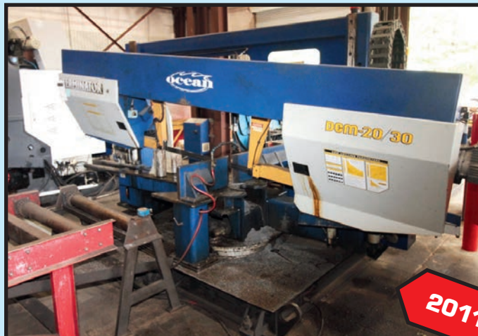
HYD-MECH OCEAN TERMINATOR MDL. DCM-20/30 HORIZ. MITERING BANDSAW

(4) MILLER 70 SERIES; (5) MILLER MDL. 22A.