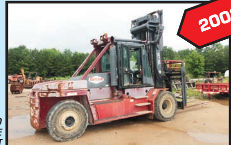
TAYLOR BIG RED 35,000-LB. BASE CAP. FORKLIFT

Tuesday, September 21 & Wednesday, September 22, 9:00 A.M. to 4:00 P.M.