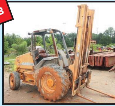
CASE 6,000-LB. CAP. ROUGH TERRAIN DIESEL FORKLIFT